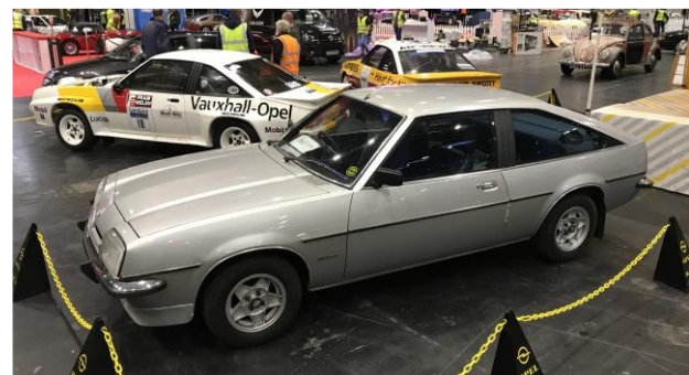
Opel Manta B SR Hatchback at the OMOC Club Stand in 2022

More details are available on the website www.mantaclub.org