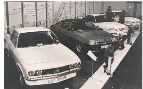
Opel Manta Club Stand in 1994

The Opel Manta Owners Club first displayed at the NEC Classic Car show in 1994 and apart from 1 year, has been present at every event since. We estimate that over 60 separate club member cars have been on display during this time.