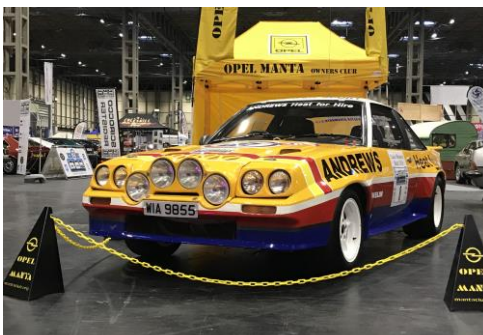
Opel Manta 400 at the OMOC Club Stand in 2022

Visitors to the OMOC stand in Hall 5 (stand number 5-460), will be welcomed with some traditional Birthday cake or a specially baked Manta Cookie! One lucky visitor will be winning a goodie bag packed full of birthday presents from the club shop. We also have some commemorative posters to give away and the club shop will also be open for club related clothing, gifts, decals and brochures so do pop along and see what cars we have on display and say hello.