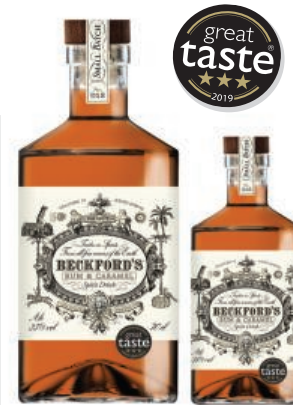
BECKFORD'S RUM & CARAMEL Spirit Drink

WHITE PEARL - 25%ABV - White Rum and Coconut - Available in 70cl and 20cl - Case size: 6