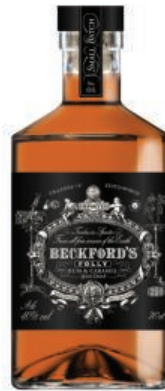
BECKFORD'S FOLLY RUM & CARAMEL Spirit Drink

BECKFORD'S FOLLY - 40%ABV - Rum and Caramel - 70cl only - Case size: 6