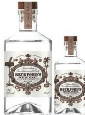
BECKFORD'S WHITE PEARL RUM & COCONUT Spirit Drink

BECKFORD'S FOLLY - 40%ABV - Rum and Caramel - 70cl only - Case size: 6