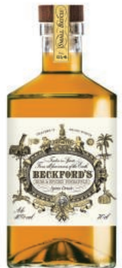
BECKFORD'S RUM & SPICED PINEAPPLE Spirit Drink

BLACK PEARL - 40%ABV - Black Spiced Rum - 70cl only - Case size: 6