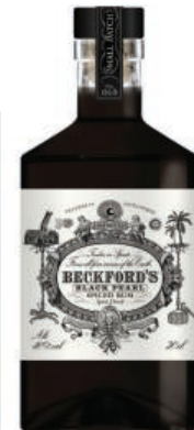
BECKFORD'S BLACK PEARL SPICED RUM Spirit Drink

RUM & CARAMEL - 25%ABV - 3 Star Great Taste Award - Available in 70cl and 20cl - Case size: 6