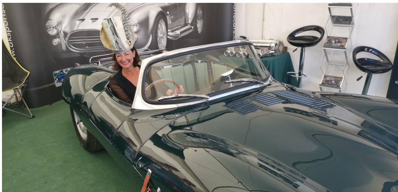
Customer trying out her hat for size!