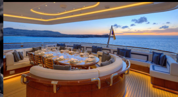
Enjoy Aqua Mare's diverse and dynamic cuisine served al fresco - perfect for appreciating the Archipelago's sweeping vistas