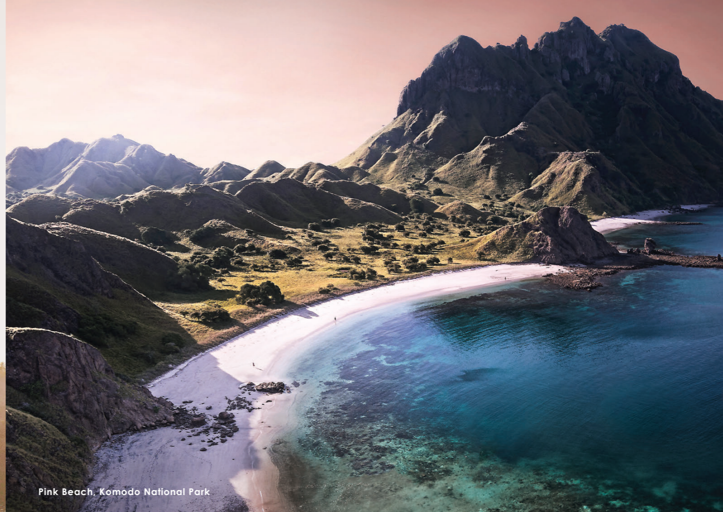
Pink Beach, Komodo National Park