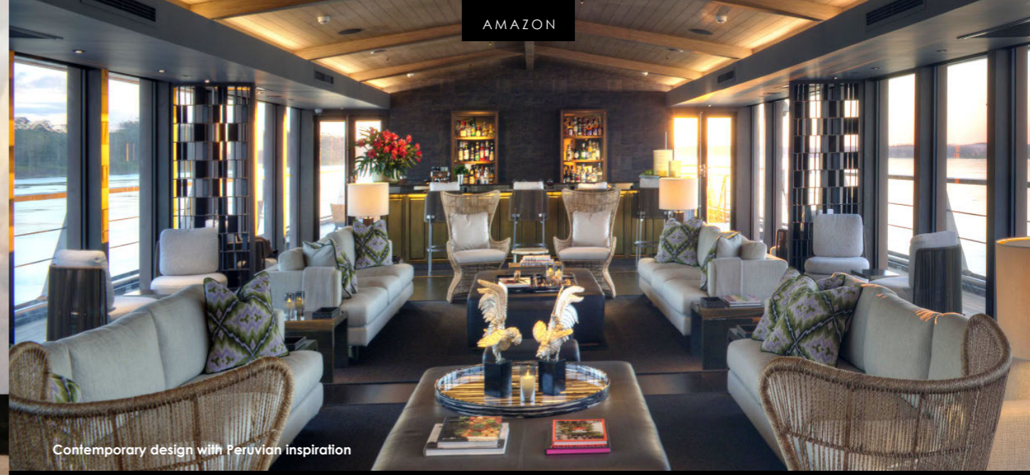
Contemporary design with Peruvian inspiration