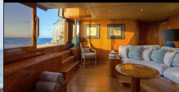
Wind down at our lower deck 'Beach Club' with its panoramic views