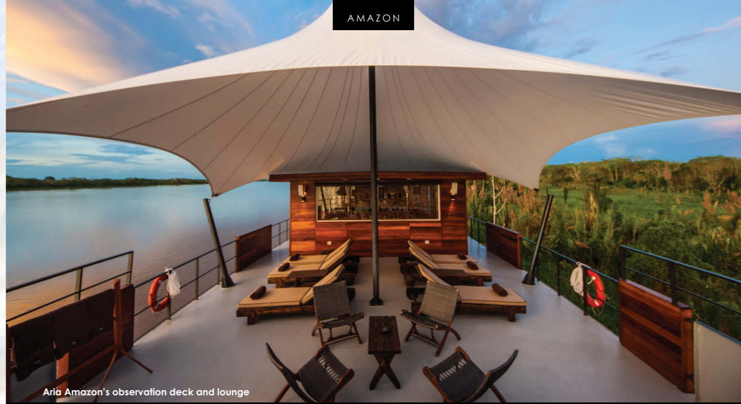
Aria Amazon's observation deck and lounge