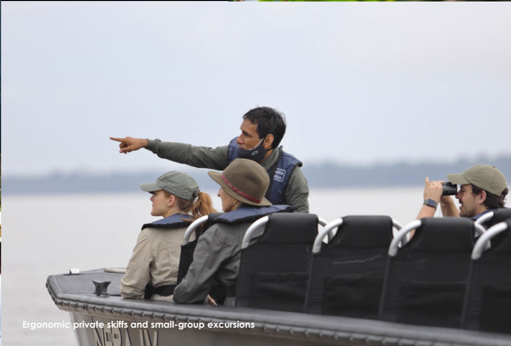
Ergonomic private skiffs and small-group excursions