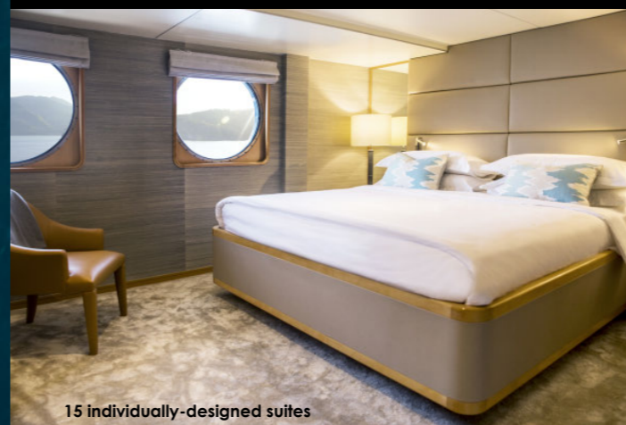
15 individually-designed suites