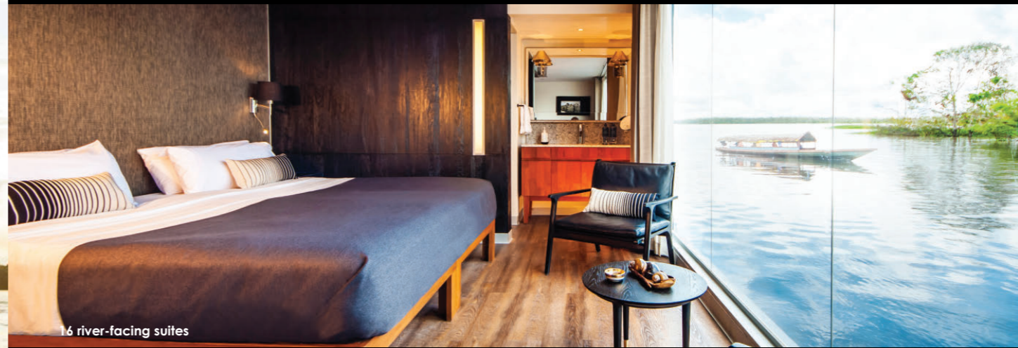
16 river-facing suites