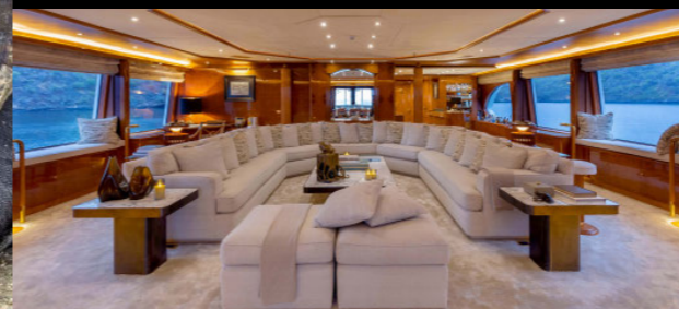
Share stories of your adventure-filled excursions while relaxing at the main lounge