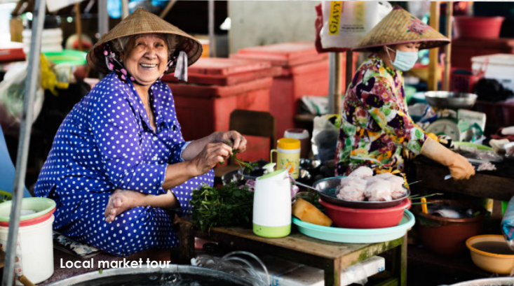
Local market tour