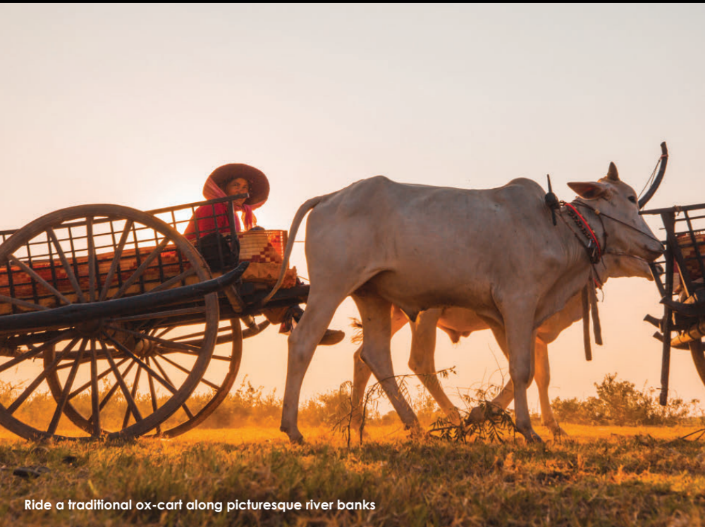
Ride a traditional ox-cart along picturesque river banks