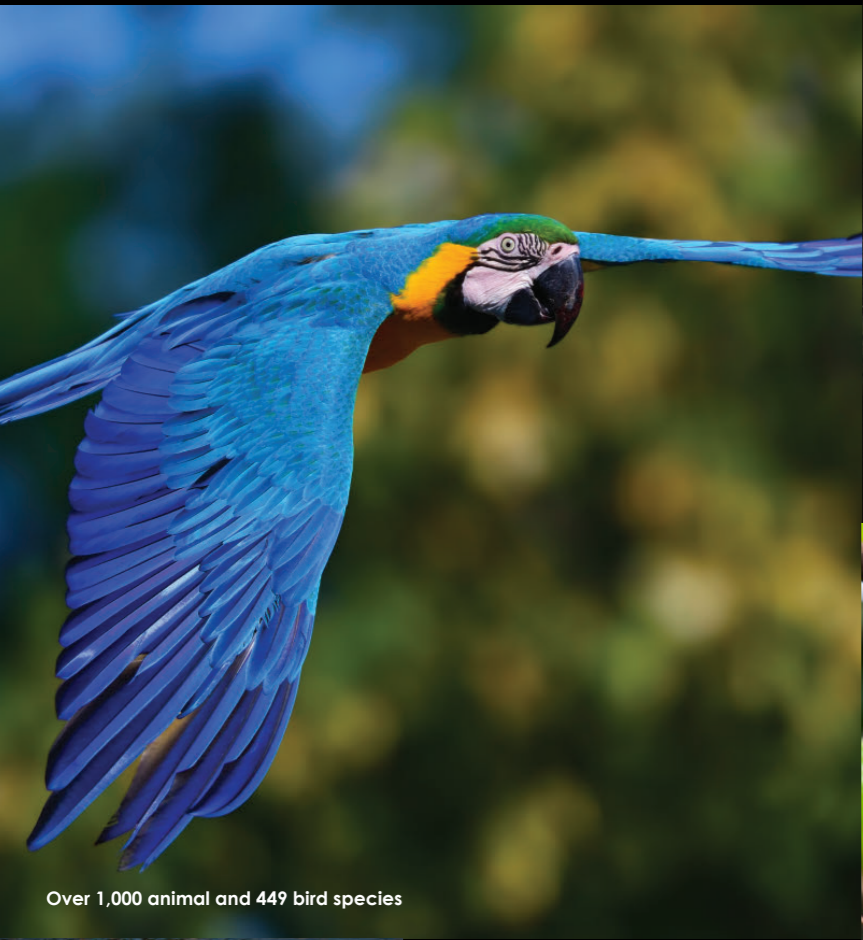
Over 1,000 animal and 449 bird species