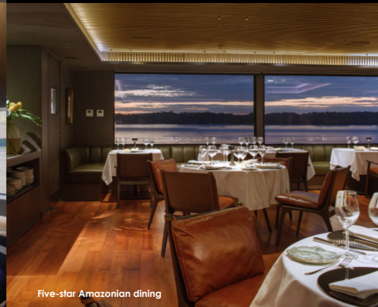
Five-star Amazonian dining