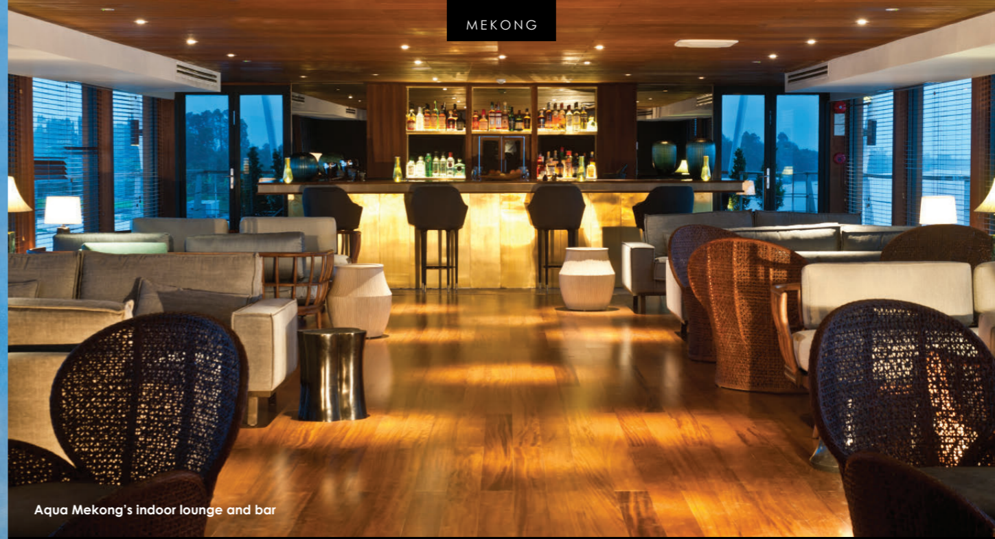
Aqua Mekong's indoor lounge and bar