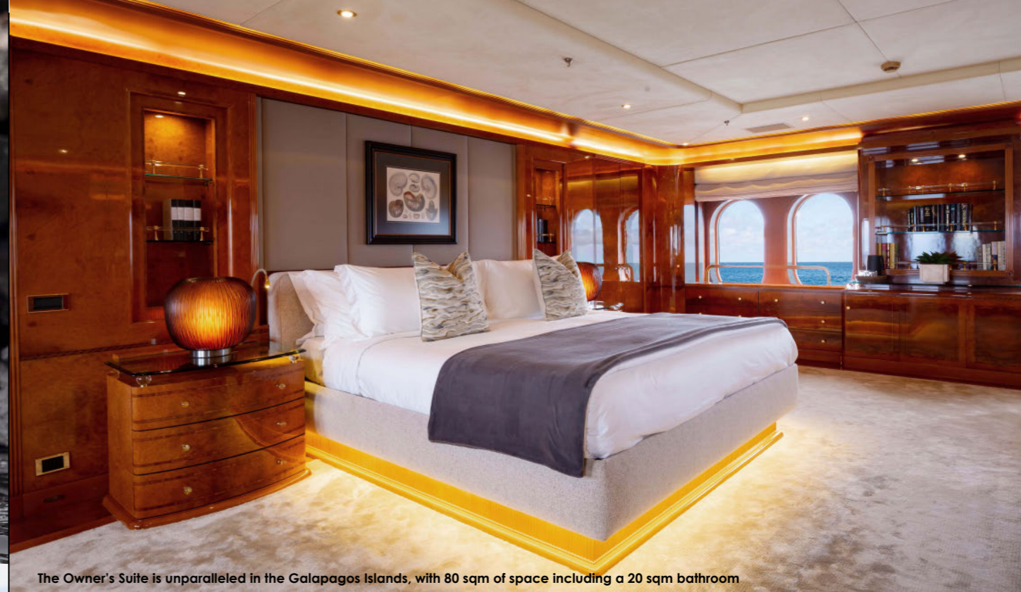
The Owner's Suite is unparalleled in the Galapagos Islands, with 80 sqm of space including a 20 sqm bathroom