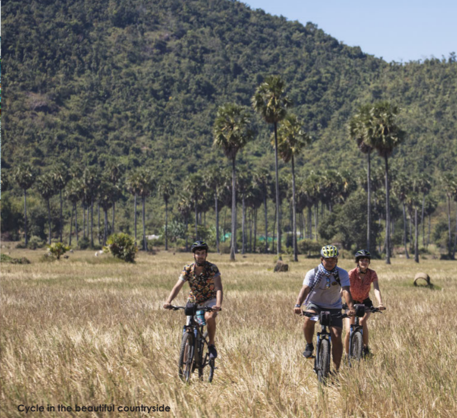
Cycle in the beautiful countryside