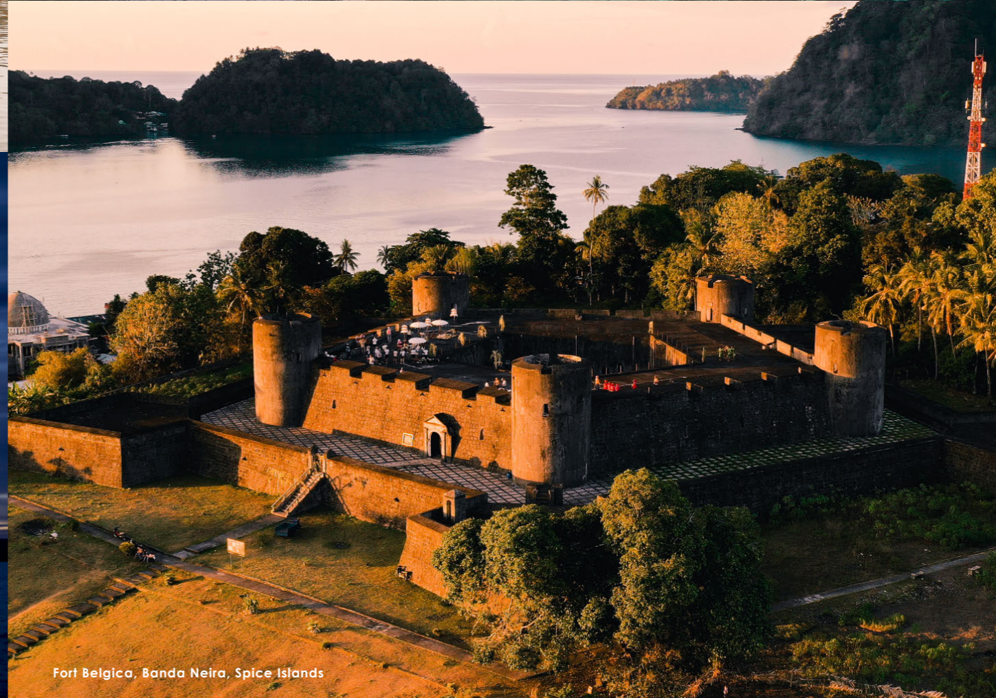
Fort Belgica, Banda Neira, Spice Islands