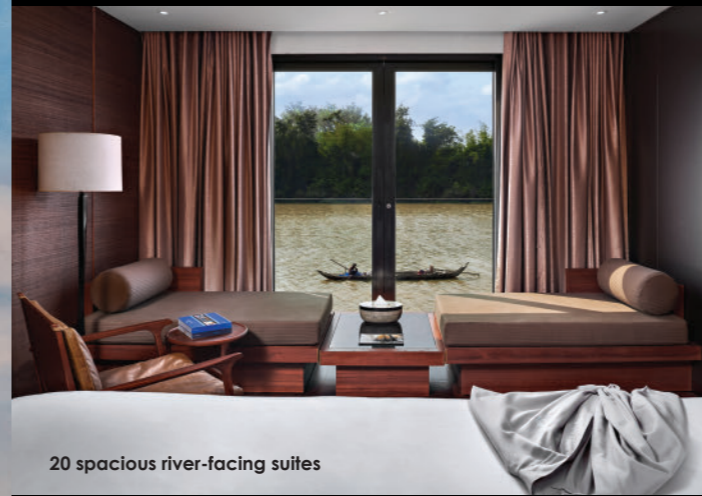
20 spacious river-facing suites