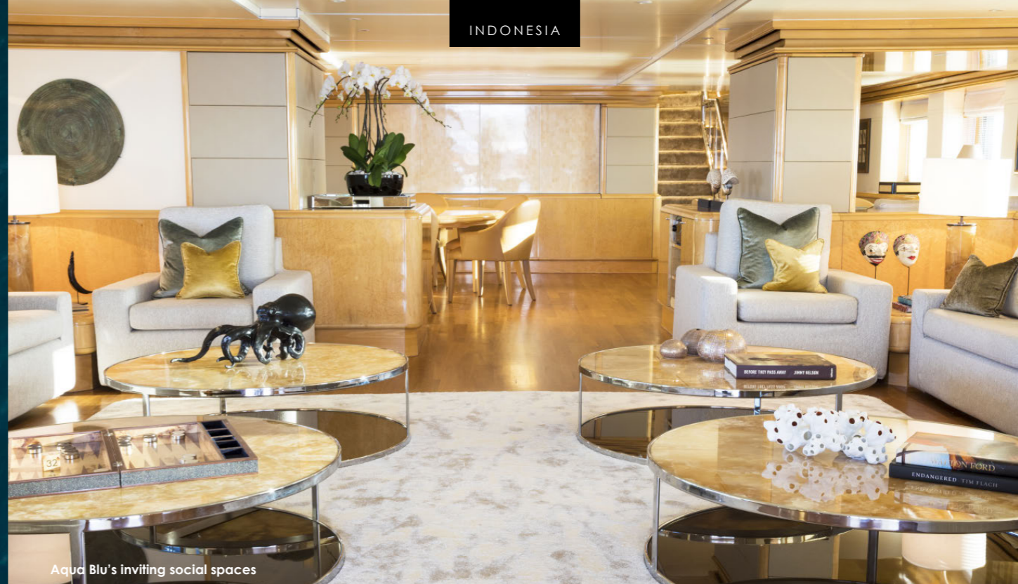
Aqua Blu's inviting social spaces