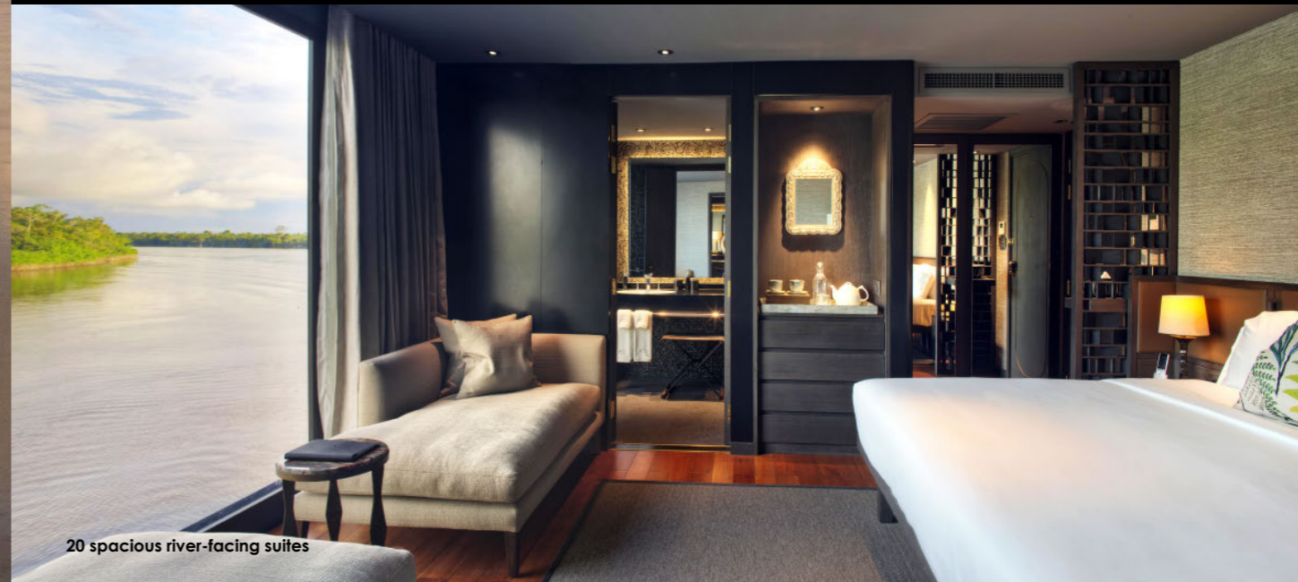
20 spacious river-facing suites