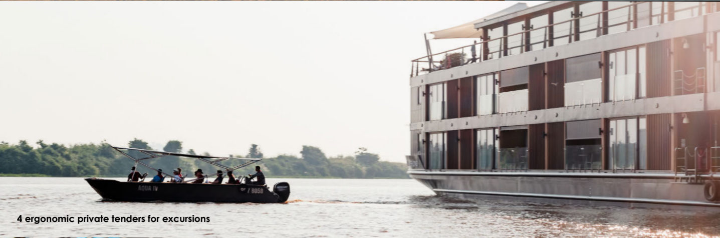
4 ergonomic private tenders for excursions