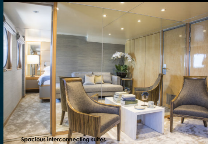
Spacious interconnecting suites