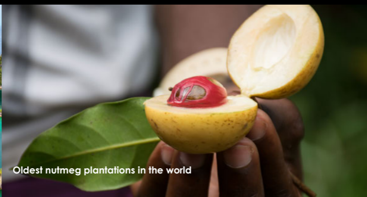
Oldest nutmeg plantations in the world