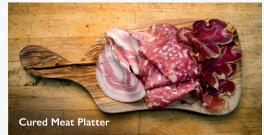
Cured Meat Platter

Selection of Farmhouse Cheeses with Apricot and Ginger Chutney, and Crackers £24.00