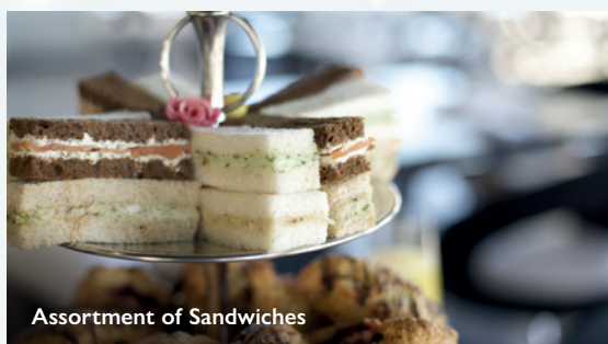
Assortment of Sandwiches