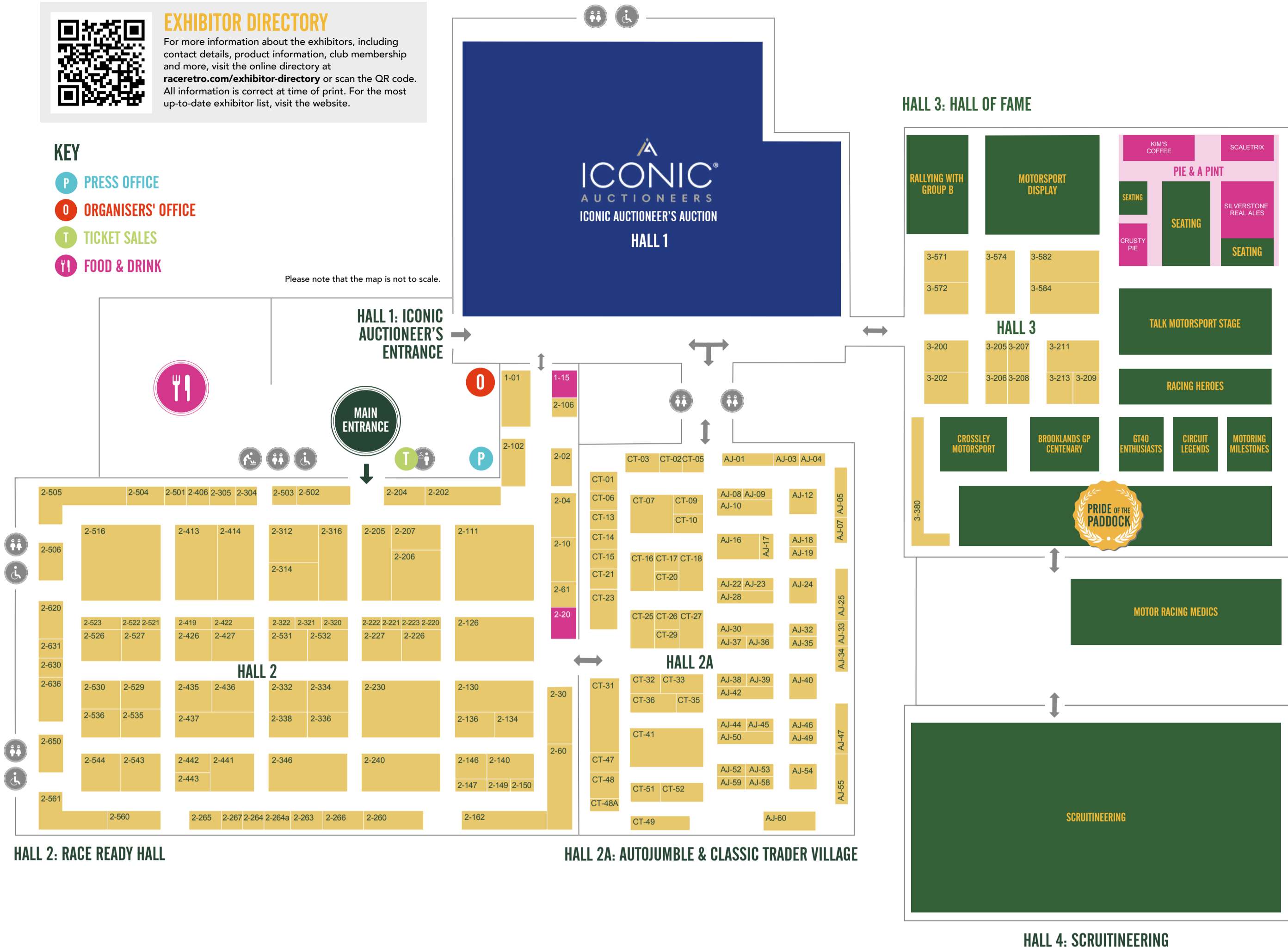
HALL 2: RACE READY HALL

Please note that the map is not to scale.