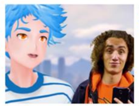
Jordi van den Bussche better known as Kwebblekop YouTuber (14.9m followers) and entrepreneur with a global reach of over 7 billion views and a community of 210 million followers.