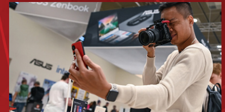
Image & Video. A world of visual wonders offering a vibrant combination of creative and interactive brand presentations and inspiring products from around the globe.

IFA Next. This zone brings together the next generation of tech startups and global investors. Have a world-changing idea or startup? Speak to our team.