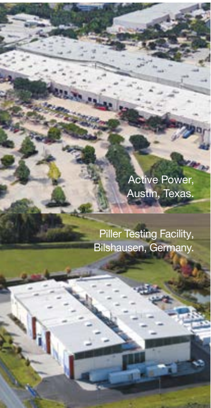
Active Power, Austin, Texas.

With over 7000 kinetic energy storage devices and more than 6000 rotary UPS units up to 3000kVA installed, Piller has around 300 technicians taking care of clients in more than 40 countries.