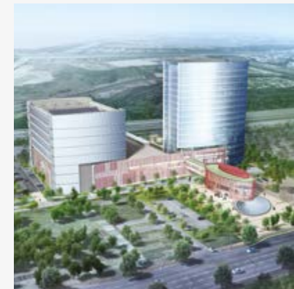
Piller DRUPS and unique Isolated Parallel Bus solution, Hana Bank.