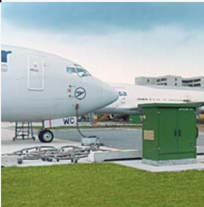
Piller gate boxes provide ground power at many international airports.

For over 40 years, Piller has been protecting military and civil applications, providing power systems to airports as well as shore-to-ship and on-board power systems for both submarine and surface vessels.