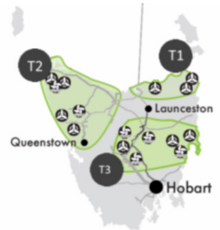
Potential hydro & wind energy sites in Tasmania.