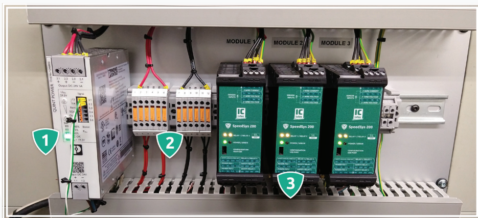
Figure 3 - The new ODS installation consisting of a galvanically isolated SELV power supply (1), a double 24V supply distribution for a possibility of redundancy (2), and three SpeedSys 200 units, hardwired to form a 2oo3 voting structure (3).

The FT3000 was replaced by a 2oo3 SpeedSys 200 installation. The DIN-rail assembly as shown in the image below was prepared on a 19" aluminium plate, allowing for a quick and easy installation in the existing 19" rack where the FT3000 was installed. This installation covers all the core functions of the obsolete FT3000 that was replaced.