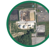
CS2: Bourges, France