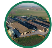
CS3: De Zwanebloem, Adinkerke, Belgium