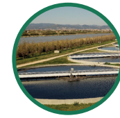
CS1: Aigües de Barcelona, Barcelona, Spain