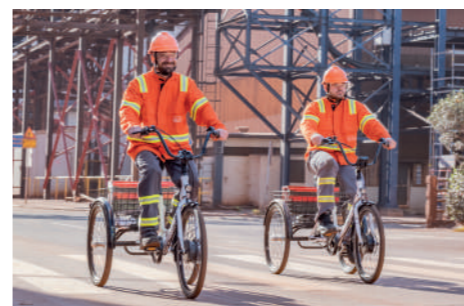
05 Our People