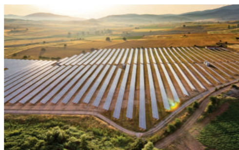
02 International Presence