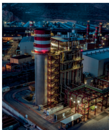
03 Energy Sector M Renewables M Integrated Supply & Trading M Energy Generation & Management M Energy Customer Solutions M Power Projects