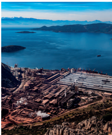
01 About METLEN