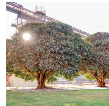
06 Our Sustainability Platform