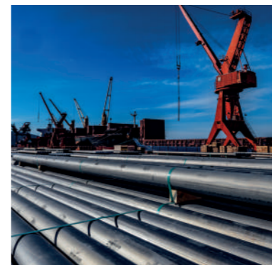
04 Metallurgy Sector Aluminium of Greece Factory European Bauxites Volos Factory Commercial Recycling (EP.AL.ME.) Zinc & Lead Metallurgy (SOMETRA)