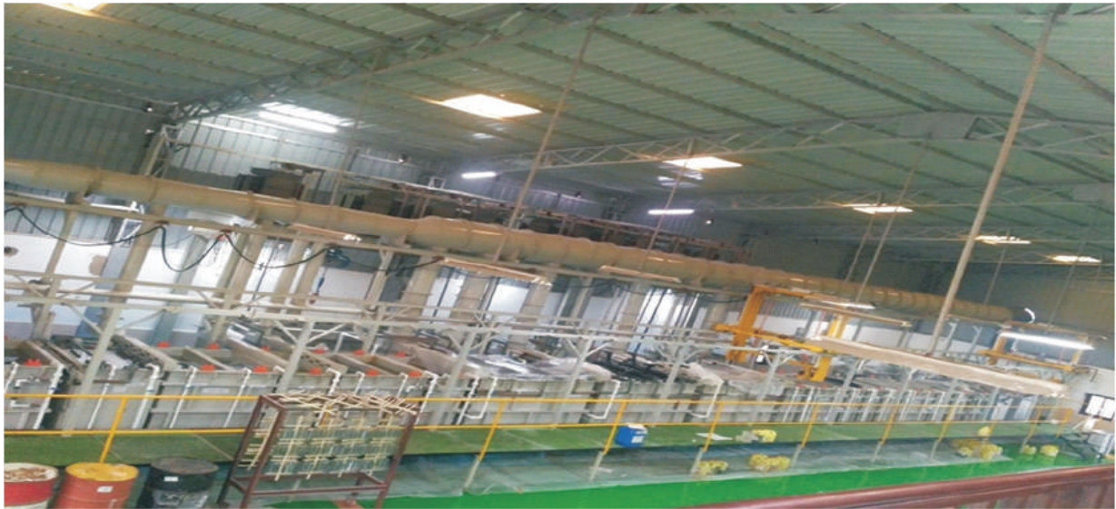
SURFACE TREATMENT PLANT