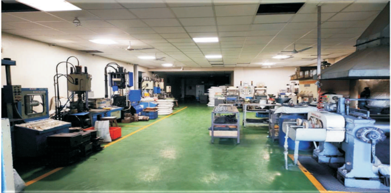
RUBBER & PLASTIC MOULDING PLANT