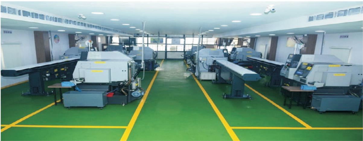
SLINDING HEAD DIVISION