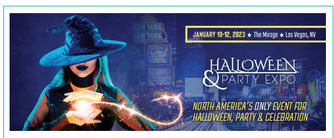
HALLOWEEN PARTY EXPO ADVANCE REGISTRATION CONFIRMATION