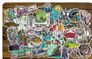
Grasshopper's Mermaid Booth: 2153

Prairie Mountain offers a wide range of fashion & promotional apparel. We are known for our vast selection of quality art with some of the best pricing in the industry. From fashion tee's and caps, top of the line promotional goods, talented in-house artists, and extremely competitive pricing, you do not want to miss the new products and digital catalog for your apparel needs. Phone: (417) 232-4941 Web: www.prairiemountain.net