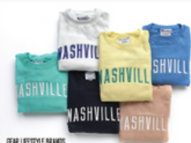
Gear Lifestyle Brands (Champion, UA, Gear For Sports, Comfort Wash, Alternative Apparel) Booth: 434