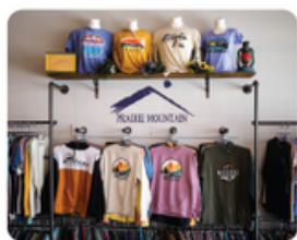
Prairie Mountain Booth: 543

Gear Lifestyle Brands is your premier partner for souvenir apparel. Our family of brands includes Champion, ComfortWash, Gear for Sports, Under Armour & Alternative Apparel. Our products bring quality, graphic options, and style variety. From screenprint to embroidery, headwear to lounge wear, we can do it all. With low minimums and completely customizable art, GLB has the brand for you. Phone: (913) 693-3604 Web: www.gearforsports.com