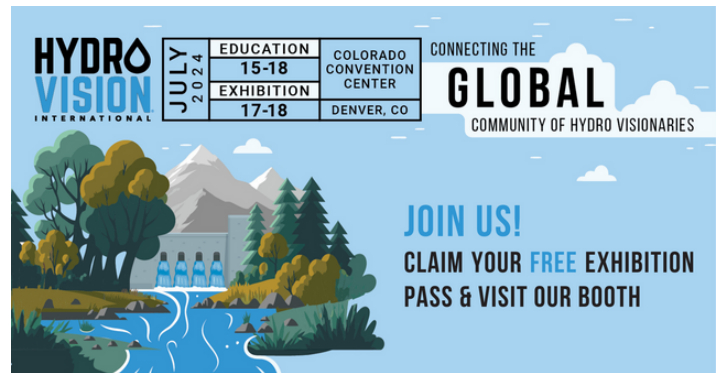
1200 x 628