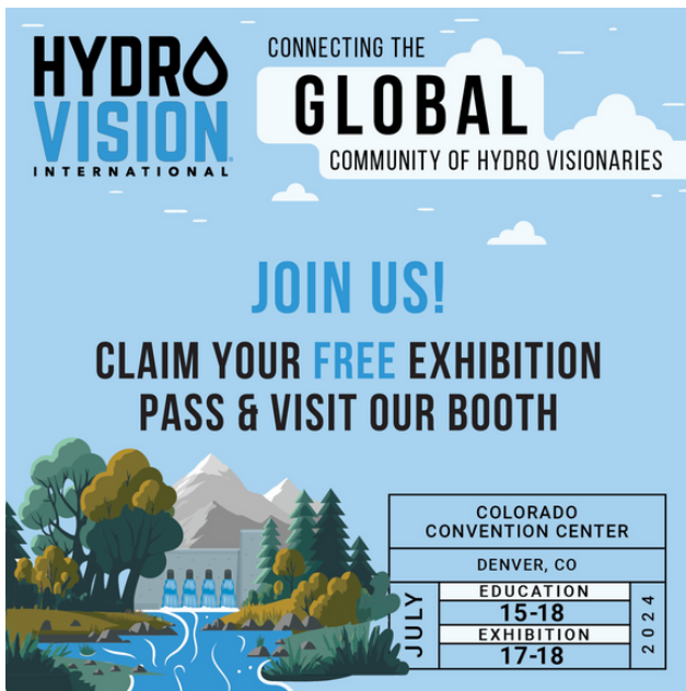
1080 x 1080

Below are HYDROVISION graphics you can use to promote your event participation. Click on the image to save and upload as a web banner. You can download your custom graphics in the exhibitor hub. For assistance accessing your custom graphics or navigating the hub, watch the video here or contact hydrovision.es@clarionevents.com .