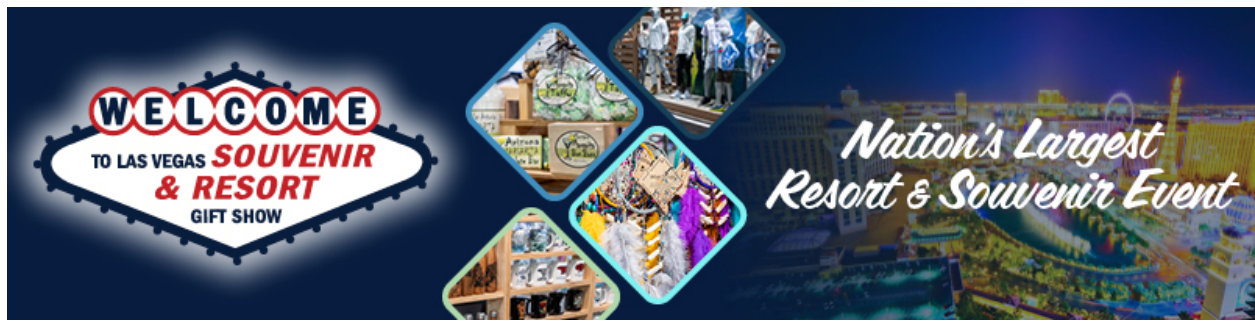
TABLE TOP GUIDELINES: