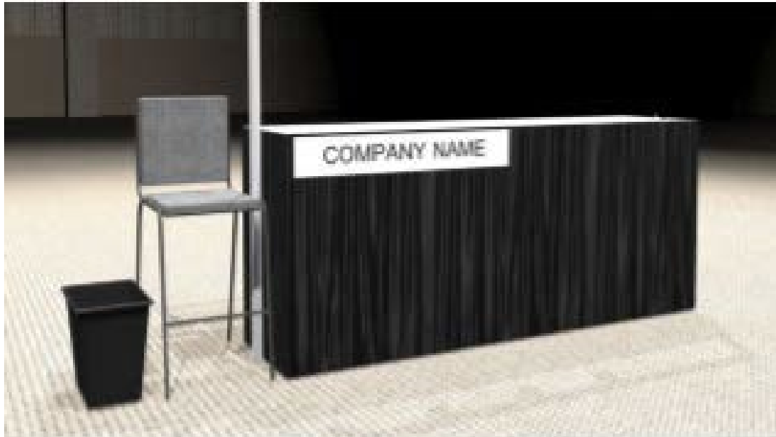
Table Top Package Includes: