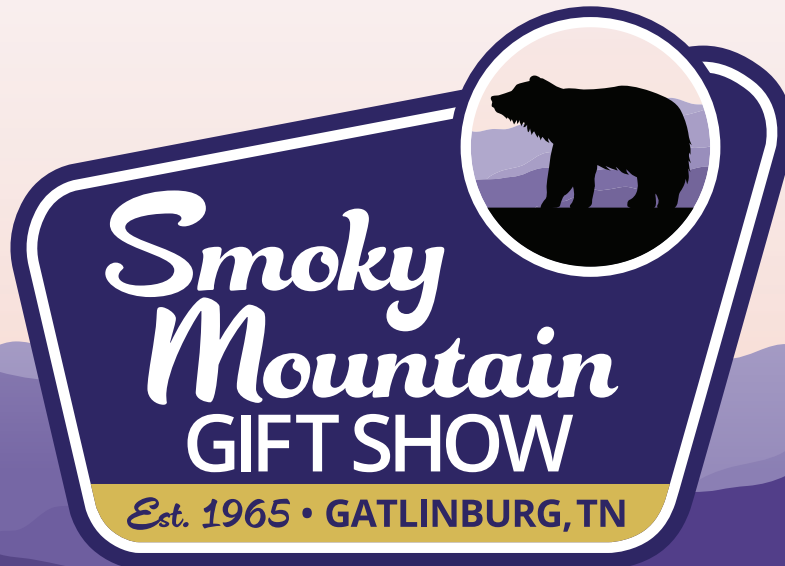
EXHIBIT AT THE NATION'S LONGEST-RUNNING, MOST BELOVED SOUVENIR SHOW