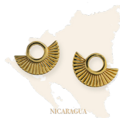
SKU:1090 18k Gold plated on silver Width 8mm Height 5mm