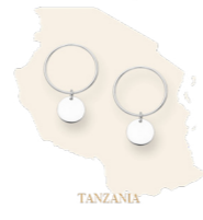
SKU:1058 Silver Width 20mm Height 31mm