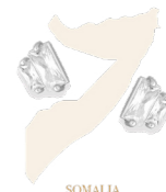
SKU:1049 Silver with CZ Width 7mm Height 5mm