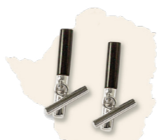
SKU:1081 Silver and Onyx Width 8mm Height 15mm