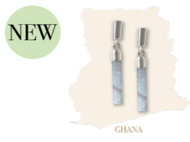
SKU:1105 Blue lace agate Width 3mm Height 24mm