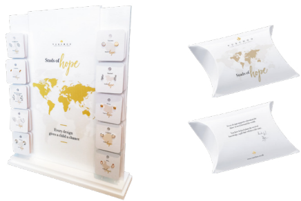
Display stand, £115