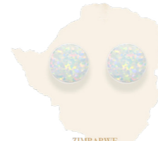
SKU:1043 Silver and Opalite Height 5mm Height 5mm