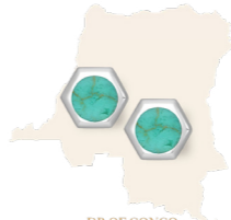
SKU:1099 Silver and Turquoise Width 8mm Height 9mm