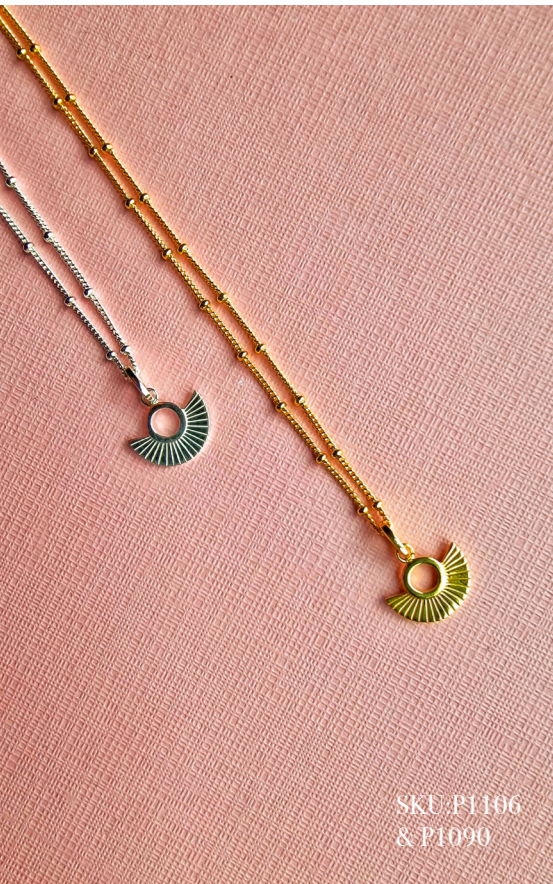
SKU: P1106 & P1090