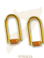
SKU:1078 Silver 18k Gold plated and resin Width 7mm Height 19mm