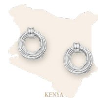
SKU:1070 Silver Width 9.5mm Height 10mm