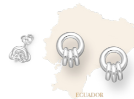
SKU:1103 Silver Width 7mm Height 10mm