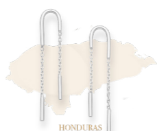
SKU:1101 Silver Width 4mm Height 44mm