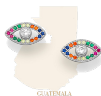
SKU:1076 Rainbow CZ stones Width 12mm Height 7mm