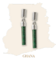
SKU:1084 Silver and Malachite Width 3mm Height 24mm