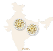
SKU:1016 18k Gold plated on silver Diameter 6mm