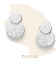
SKU:1066 Brushed silver Width 9mm Height 13 mm