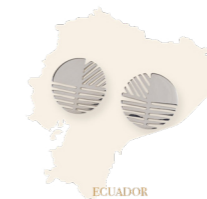
SKU:1094 Silver Diameter 9mm