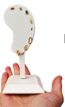
Ear stand, £15

Each pair of studs comes on a branded backing card.