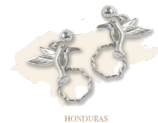
SKU:1080 Silver Width 12mm Height 20mm