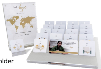
A5 Display + Hero product holder