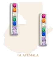
SKU:1061 Rainbow CZ stones Width 2mm Height 10mm