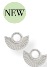
SKU:1106 Silver Width 8mm Height 5mm