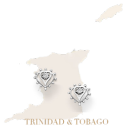
SKU:1097 Silver and CZ stones Width 12mm Height 12mm