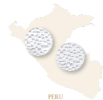
SKU:1023 Silver Diameter 10mm