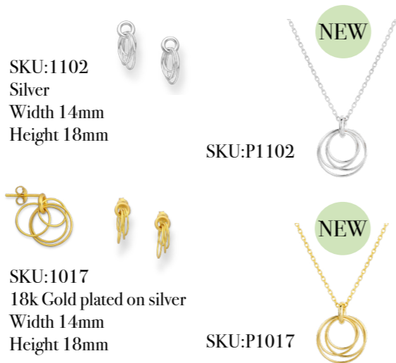
SKU:1102 Silver Width 14mm Height 18mm