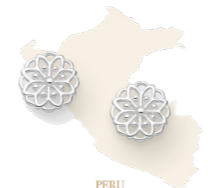
SKU:1059 Silver Diameter 9mm