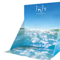
Beachy Counter Displays