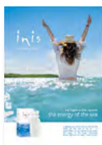
Ocean Energy Counter Card