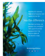
Sea the Difference Counter Card