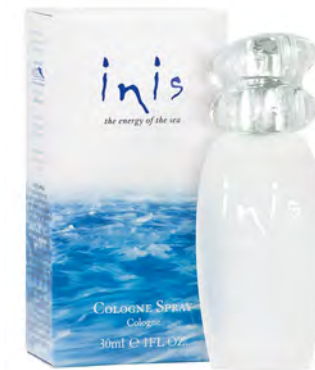
Cologne Spray 30ml / 1 fl. oz.