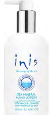
Sea Mineral Hand Lotion 300ml / 10 fl. oz.

Replenish, hydrate and soothe with our light, fast absorbing and nourishing blend.