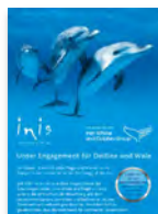
Dolphin Ocean Conservation Shelf Talker