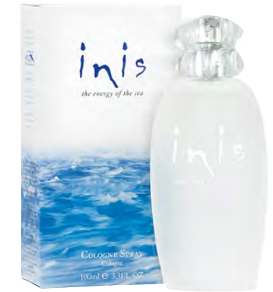
Cologne Spray 100ml / 3.3 fl. oz.