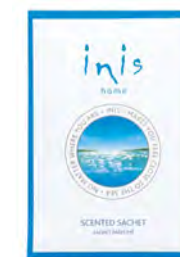
Scented Sachet 13g / 0.46 oz.

Freshen up small spaces in the home, car, suitcase and more. Paper envelope sachets measure 6.5" x 4.5".