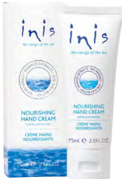
Nourishing Hand Cream 75ml / 2.6 fl. oz.

Treat your hands to the restorative power of the sea with our everyday hand care products, all formulated with seaweed extracts and carefully selected ingredients like aloe vera and shea butter. With the sparkling scent of Inis - it's like a mini escape to the seashore every time you pamper your hands.