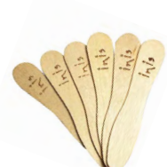
Body Butter Tester Sticks