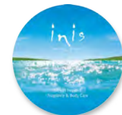
Beachy Window Cling Sticker