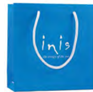
Paper Gift Bags

Pack of 12 £6 or FREE with £300 Order 8020437