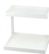
White Wood Counter Unit