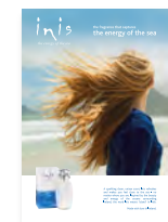
Fresh Counter Card