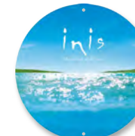
Beachy Hanging Disks