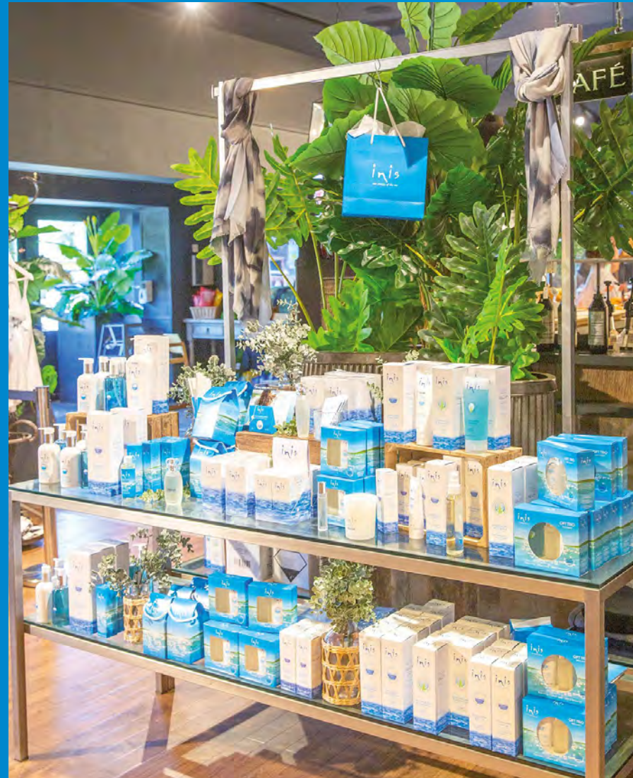
The Hollies Farm Shop, Tarporley, Cheshire, England

Please see page 22-23 for all available items, and please order freely!