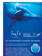
Whale Ocean Conservation Shelf Talker