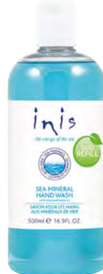
Sea Mineral Hand Wash Refill 500ml / 16.9 fl. oz.

A great value, our Eco Refill size helps customers save while also reducing plastic use.