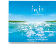
Sparkling Seas Landscape Poster