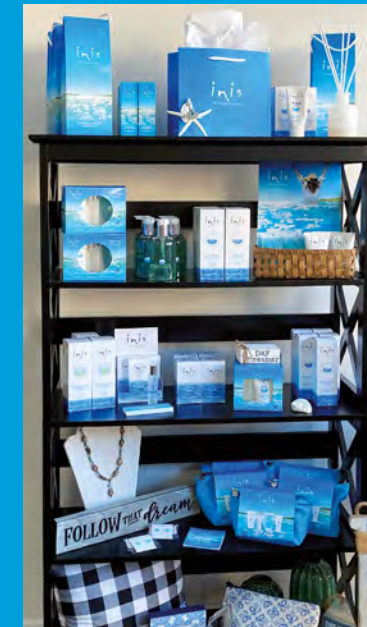
Cranberry Street Boutique, Limerick, Pennsylvania, USA