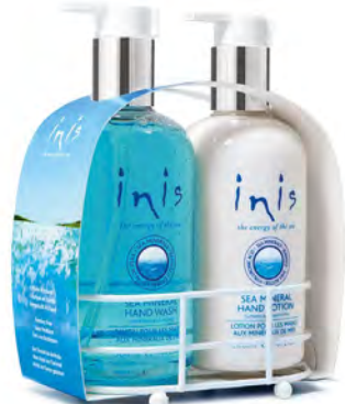
Hand Care Caddy 2 x 300ml / 10 fl. oz.

The perfect pair to brighten any sink in the home.