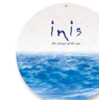
Classic Hanging Disks