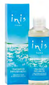
Fragrance Diffuser Refill 100ml / 3.3 fl. oz.

Cost £12.27 SRP £27 Case Pack of 6 IS8017222 5 099038 017222 > TESTER IS8017383 5 099038 017383 >