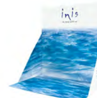
Classic Counter Displays