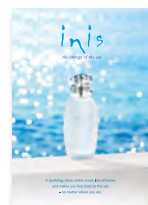
Sea Sun Sparkle Counter Card