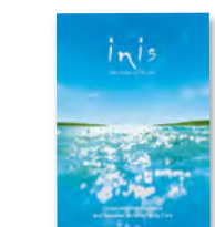
Sparkling Seas Portrait Poster