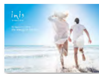
Sunny Day Counter Card