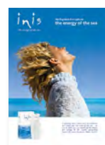
Golden Girl Counter Card