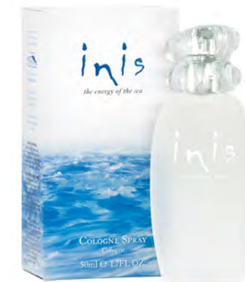
Cologne Spray 50ml / 1.7 fl. oz.