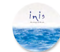
Classic Window Cling Sticker