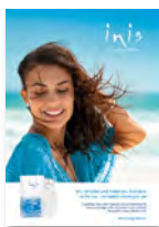
Feels Like Inis Counter Card