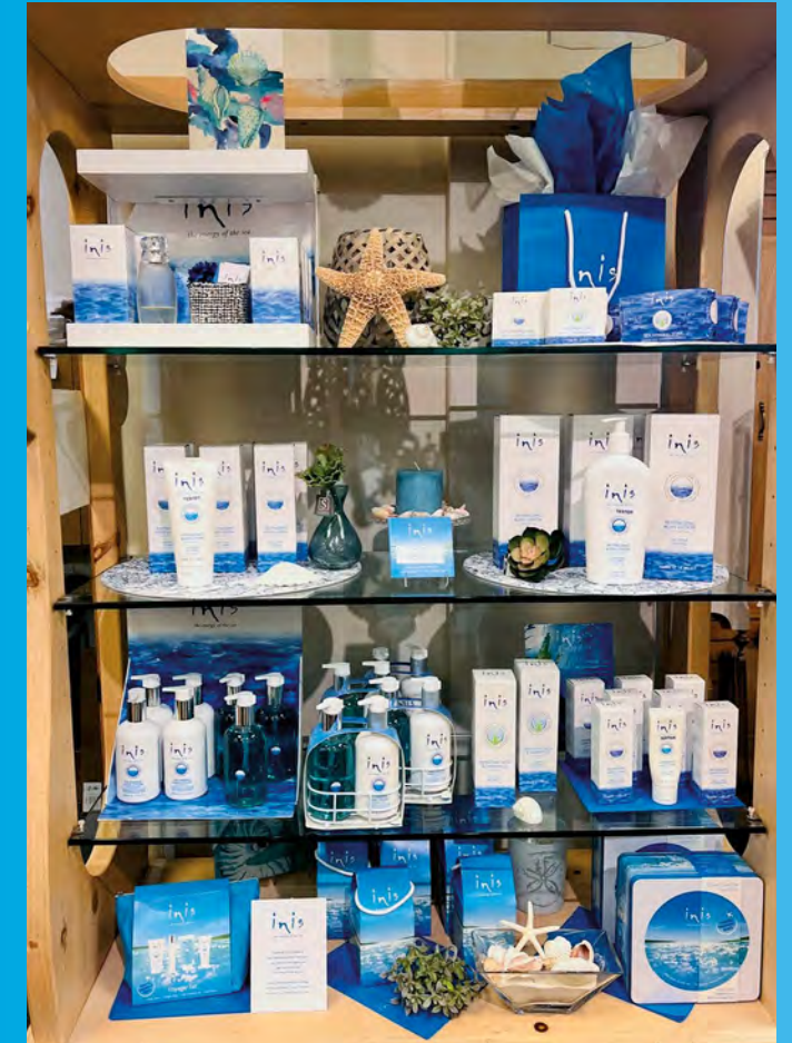
Tooley Drug, Columbus, Nebraska, USA