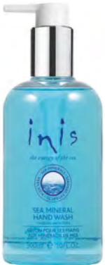
Sea Mineral Hand Wash 300ml / 10 fl. oz.

Refresh, cleanse and moisturise with our blend of skin boosting natural ingredients.