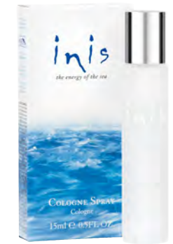
Travel Size Spray 15ml / 0.5 fl. oz.