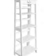
White Wood Floor Stand