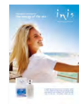
Sparkle Counter Card