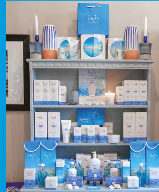
White Feather Home, Neston, Cheshire, England