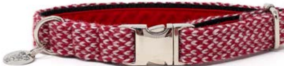
Rosehip & Dove - Harris Design