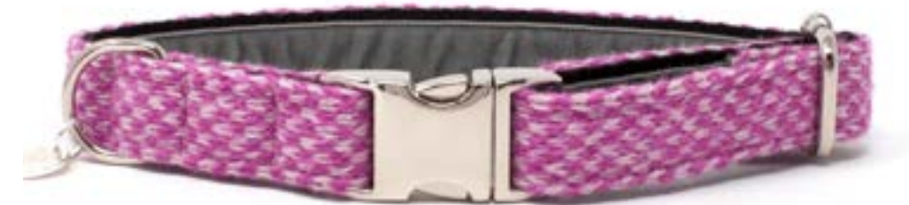
Pink & Dove - Harris Design