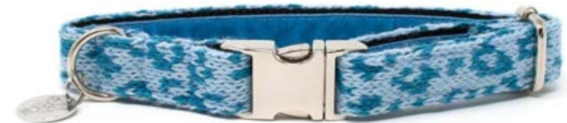
Porcelain & Turquoise