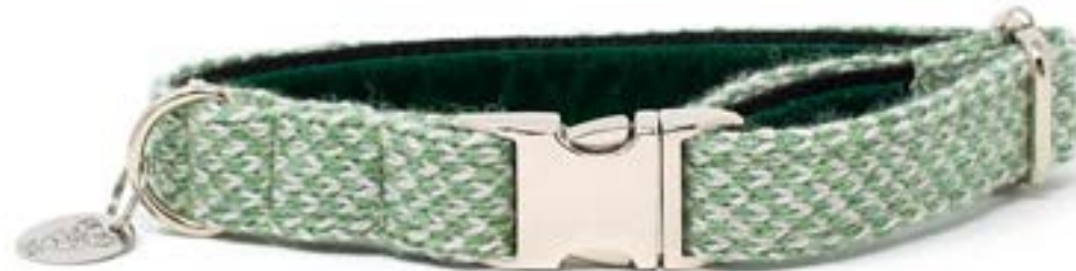
Green & Dove - Harris Design