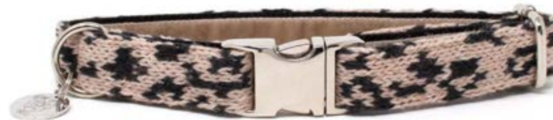
Tan & Black