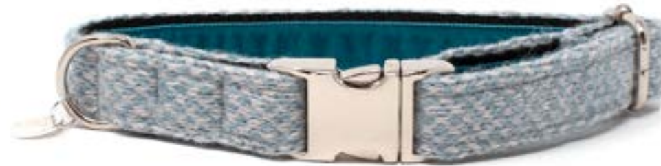
Ice Blue & Dove - Harris Design