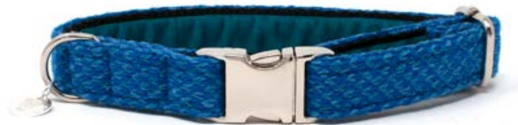
Royal Blue & Turquoise - Harris Design