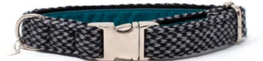
Black & Grey - Harris Design