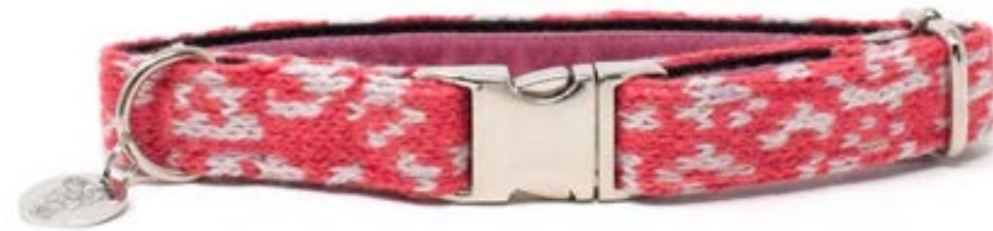
Geranium & Dove