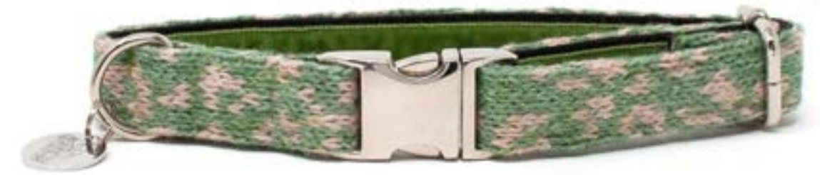
Green & Tan