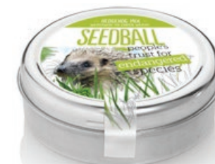
Hedgehog Mix (supporting the PTES)