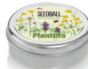
Plantlife Mix (supporting Plantlife)