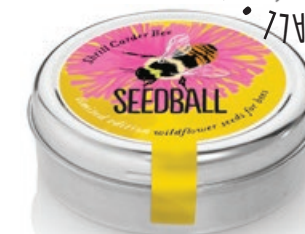
Shrill Carder Bumblebee Mix