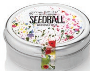
Artist's Meadow (supporting the Wildlife Trust)