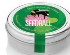
Short-haired Bumblebee Mix