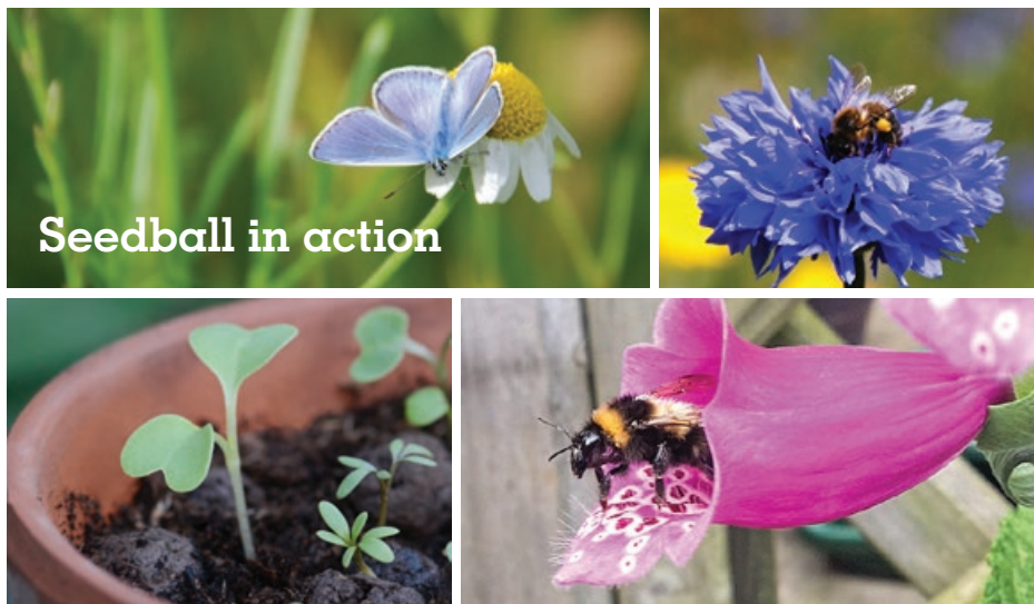
Seedball in action