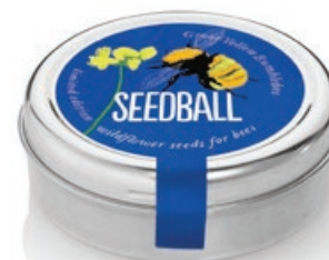
Great Yellow Bumblebee Mix