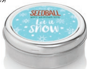
Let it Snow