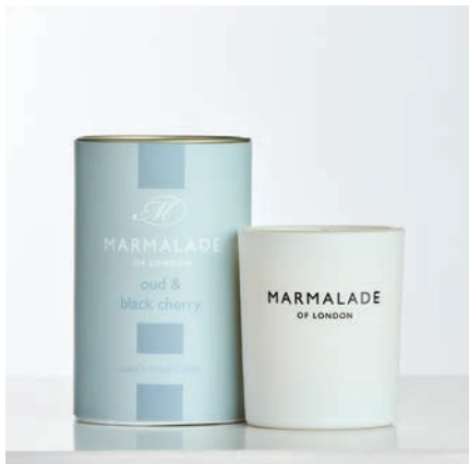
Oud & Black Cherry Glass Votive 9hrs burn time