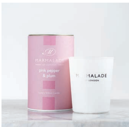
Pink Pepper & Plum Glass Votive 9hrs burn time