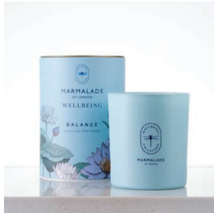
Balance Glass Candle 50hrs burn time