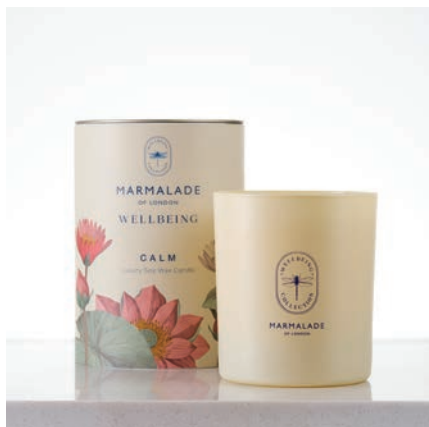
Calm Glass Candle 50hrs burn time