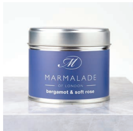
Bergamot & Soft Rose Medium Tin Candle 40hrs burn time