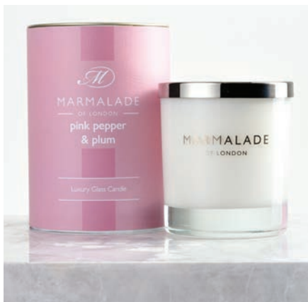
Pink Pepper & Plum Glass Candle 50hrs burn time