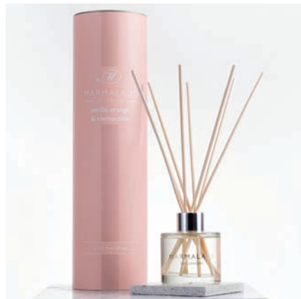
Seville Orange & Clementine Large Reed Diffuser 100ml