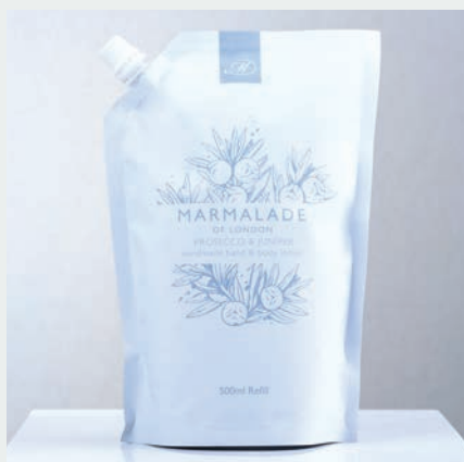
Pink Fizz & Juniper Hand & Body Lotion Refill 500ml