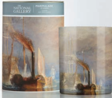
Turner's The Fighting Temeraire Luxury Glass Candle 50hrs burn time