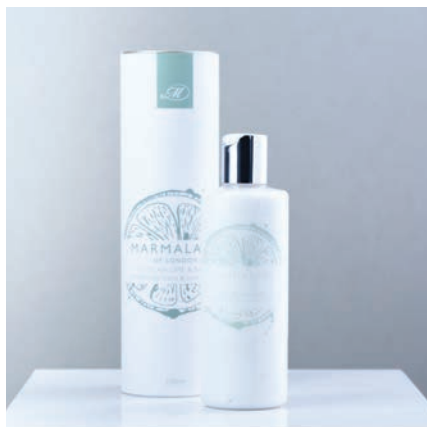
Tuscan Lime & Basil Hand & Body Lotion 250ml