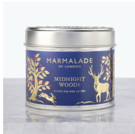
Midnight Woods Medium Tin Candle 40hrs burn time