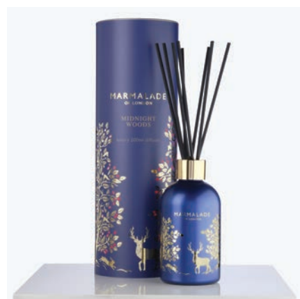
Midnight Woods Large Reed Diffuser 200ml