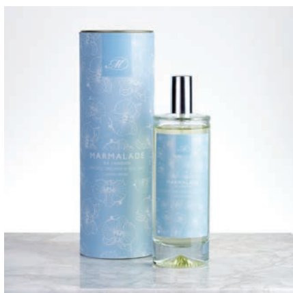
Pacific Orchid & Sea Salt Room Spray 100ml