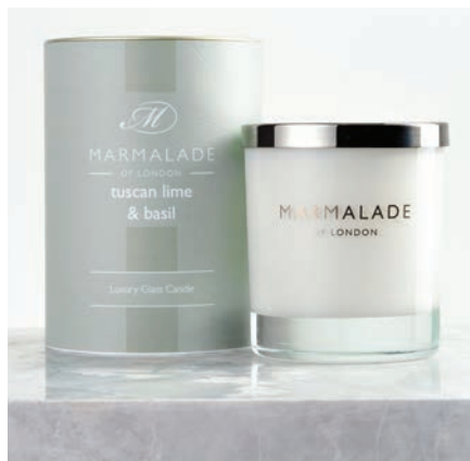
Tuscan Lime & Basil Glass Candle 50hrs burn time