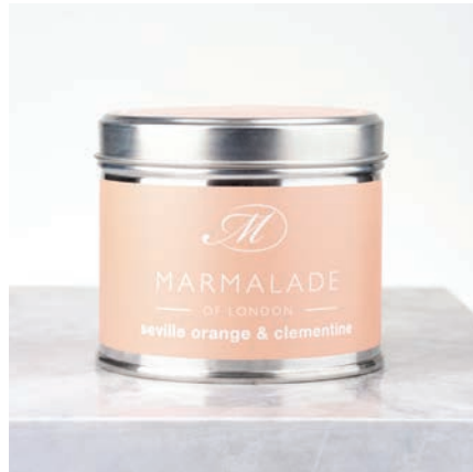
Seville Orange & Clementine Medium Tin Candle 40hrs burn time