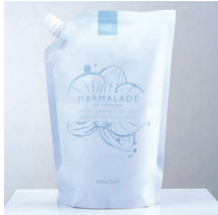
Pacific Orchid & Sea Salt Hand & Body Lotion Refill 500ml