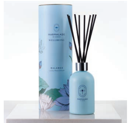
Balance Reed Diffuser 200ml