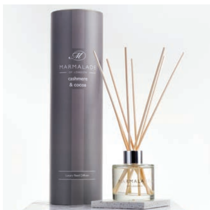
Cashmere & Cocoa Large Reed Diffuser 100ml