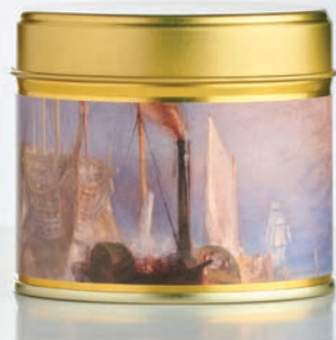
Turner's The Fighting Temeraire Luxury Medium Tin Candle 40hrs burn time