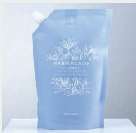
Pink Fizz & Juniper Hand & Body Wash Refill 500ml