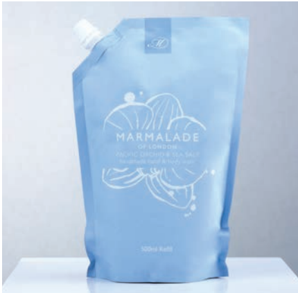
Pacific Orchid & Sea Salt Hand & Body Wash Refill 500ml