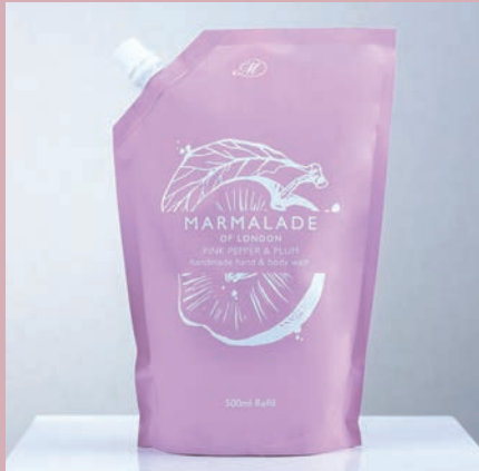
Pink Pepper & Plum Hand & Body Wash Refill 500ml