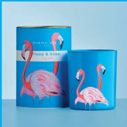
Emily Smith – Flossy & Amber Luxury Glass Candle 50hrs burn time