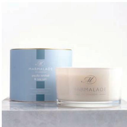
Pacific Orchid & Sea Salt Three Wick Candle 60hrs burn time