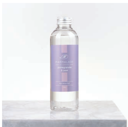
Pomegranate & Pear Diffuser Refill 200ml