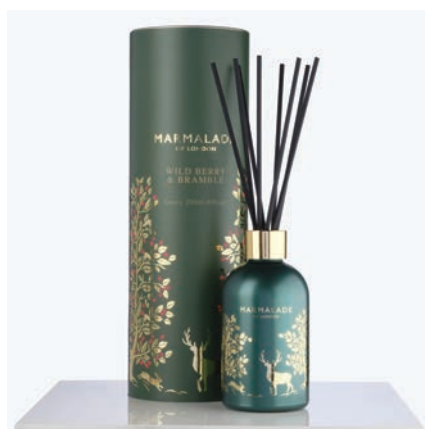
Wild Berry & Bramble Large Reed Diffuser 200ml