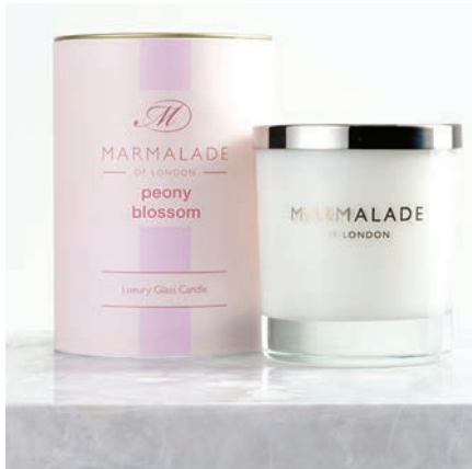
Peony Blossom Glass Candle 50hrs burn time