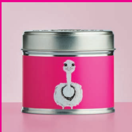
Emily Smith – Camilla Luxury Medium Tin Candle 40hrs burn time