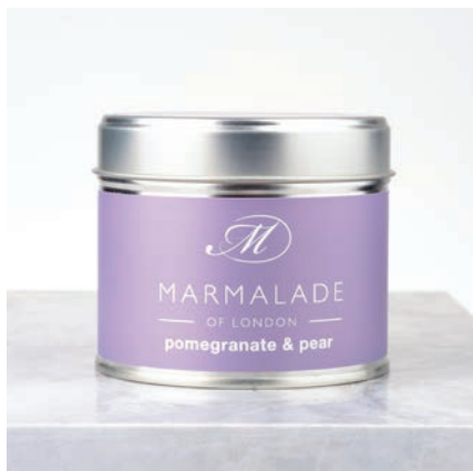
Pomegranate & Pear Medium Tin Candle 40hrs burn time