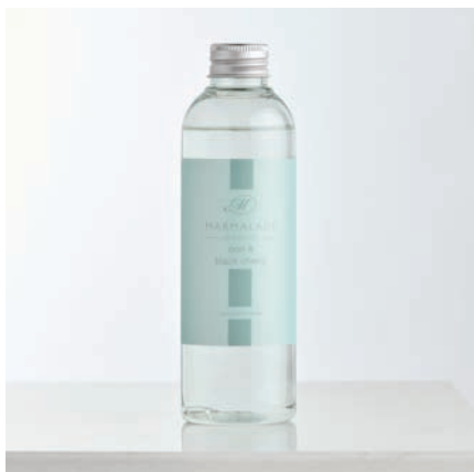
Oud & Black Cherry Diffuser Refill 200ml