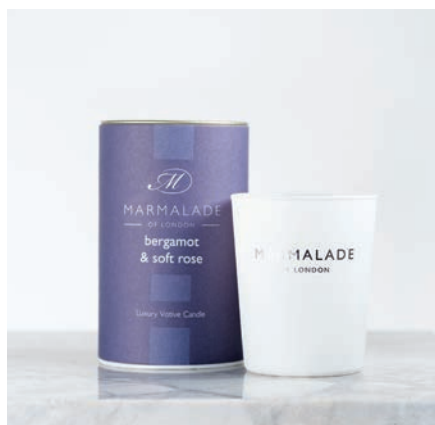
Bergamot & Soft Rose Glass Votive 9hrs burn time