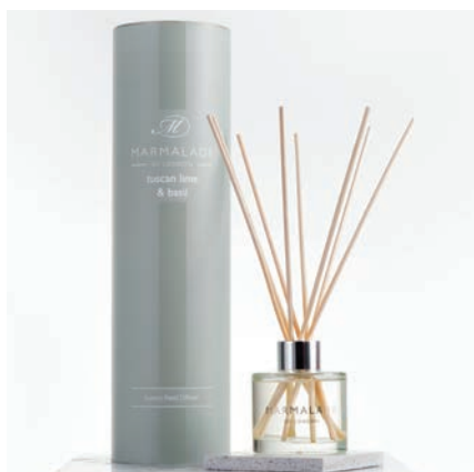
Tuscan Lime & Basil Large Reed Diffuser 100ml