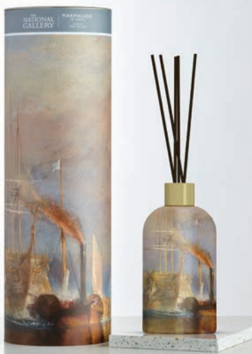
Turner's The Fighting Temeraire Luxury Large Reed Diffuser 200ml