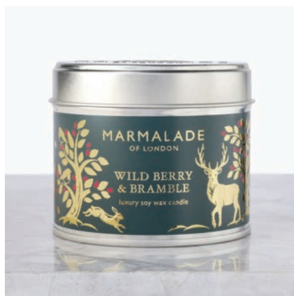
Wild Berry & Bramble Medium Tin Candle 40hrs burn time