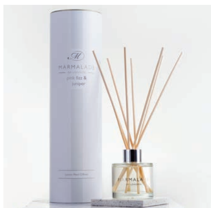
Pink Fizz & Juniper Large Reed Diffuser 100ml