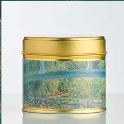
Monet's Water-lily Pond Luxury Medium Tin Candle 40hrs burn time