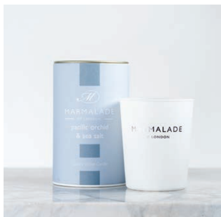
Pacific Orchid & Sea Salt Glass Votive 9hrs burn time