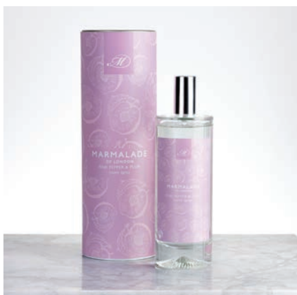
Pink Pepper & Plum Room Spray 100ml