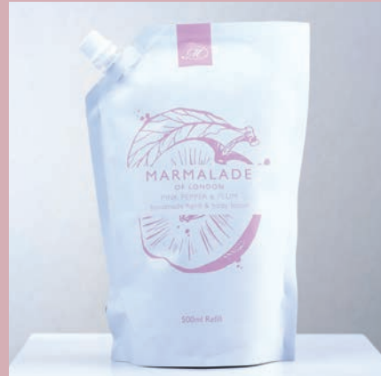
Pink Pepper & Plum Hand & Body Lotion Refill 500ml