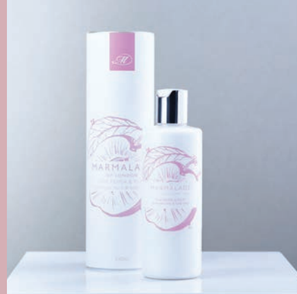
Pink Pepper & Plum Hand & Body Lotion 250ml