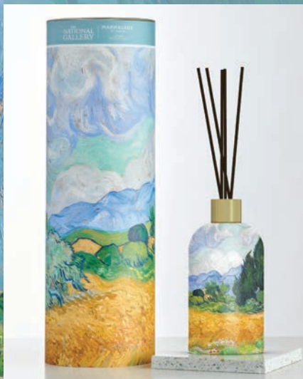
Van Gogh's Wheatfield Luxury Large Reed Diffuser 200ml