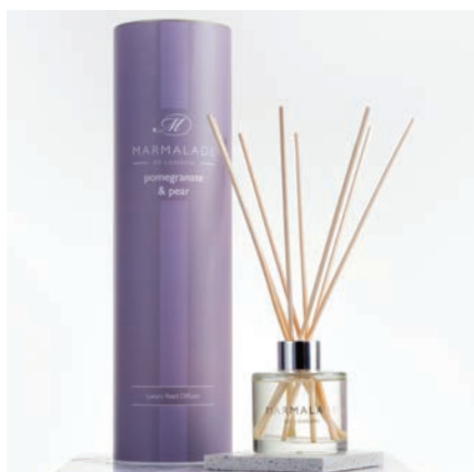
Pomegranate & Pear Large Reed Diffuser 100ml