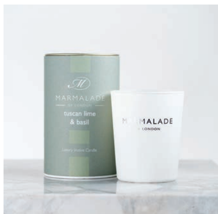
Tuscan Lime & Basil Glass Votive 9hrs burn time