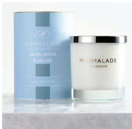
Pacific Orchid & Sea Salt Glass Candle 50hrs burn time