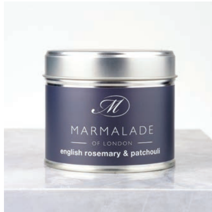
English Rosemary & Patchouli Medium Tin Candle 40hrs burn time