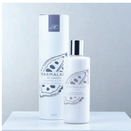
Cashmere & Cocoa Hand & Body Lotion 250ml