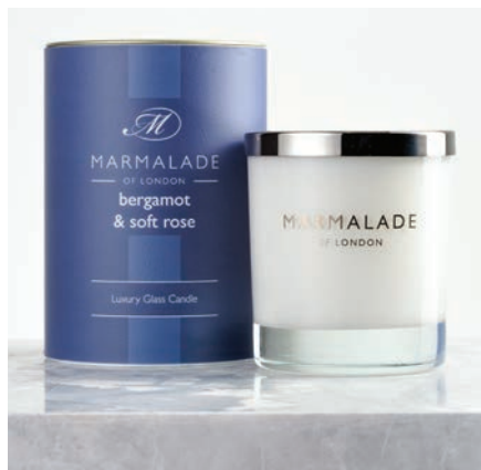
Bergamot & Soft Rose Glass Candle 50hrs burn time