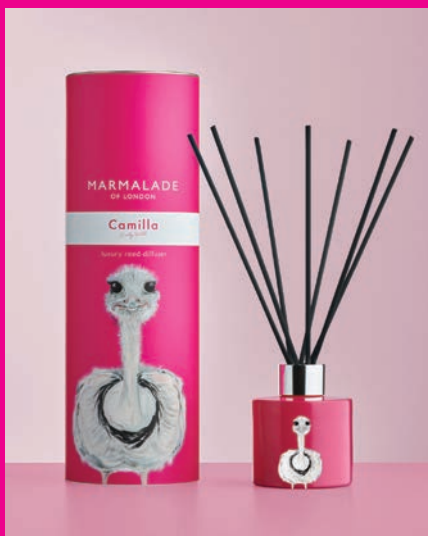
Emily Smith – Camilla Luxury Large Reed Diffuser 100ml