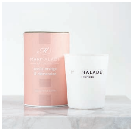
Seville Orange & Clementine Glass Votive 9hrs burn time