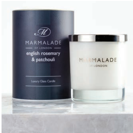
English Rosemary & Patchouli Glass Candle 50hrs burn time