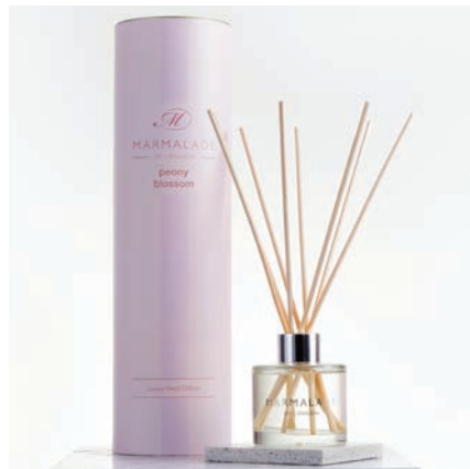
Peony Blossom Large Reed Diffuser 100ml