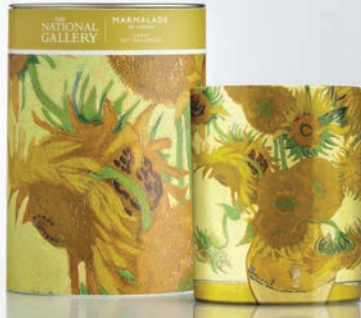
Van Gogh's Sunflowers Luxury Glass Candle 50hrs burn time