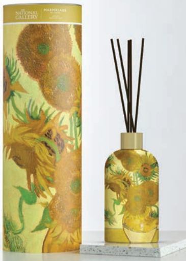
Van Gogh's Sunflowers Luxury Large Reed Diffuser 200ml