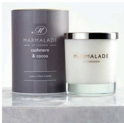
Cashmere & Cocoa Glass Candle 50hrs burn time