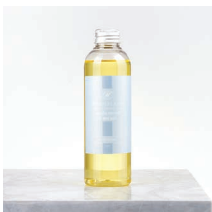
Pacific Orchid & Sea Salt Diffuser Refill 200ml