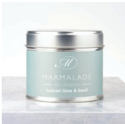
Tuscan Lime & Basil Medium Tin Candle 40hrs burn time