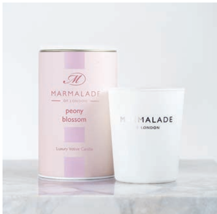
Peony Blossom Glass Votive 9hrs burn time