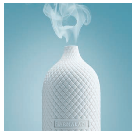
Ultrasonic Cool Mist Diffuser

Boost your mood with the Marmalade Ultrasonic Cool Mist Diffuser. Add 5 drops of our essential oil to the water tank and watch the mist fill your room with either Calm, Balance or Energise fragrance. Beautifully engraved ceramic cover with colour changing lights to suit your mood.