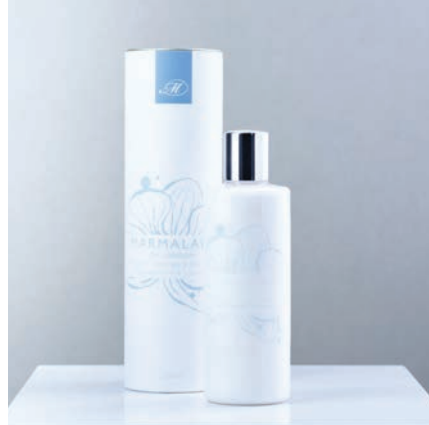
Pacific Orchid & Sea Salt Hand & Body Lotion 250ml