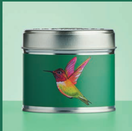
Emily Smith – Hermione Luxury Medium Tin Candle 40hrs burn time