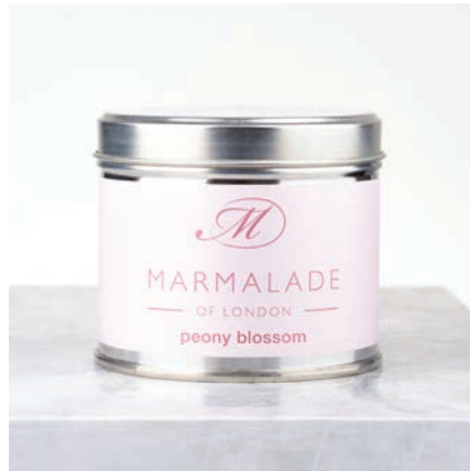
Peony Blossom Medium Tin Candle 40hrs burn time