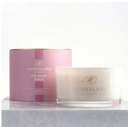
Pink Pepper & Plum Three Wick Candle 60hrs burn time