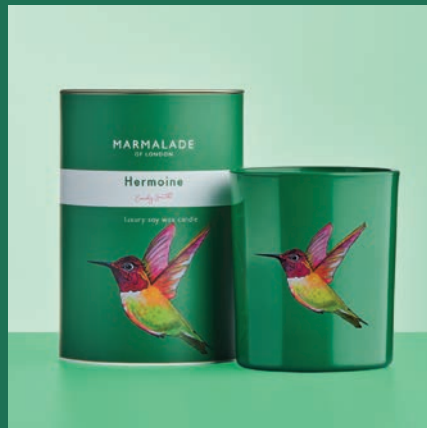
Emily Smith – Hermione Luxury Glass Candle 50hrs burn time