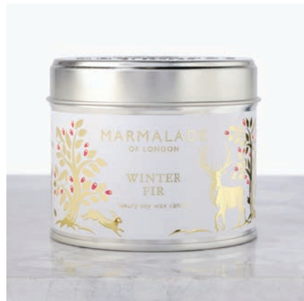
Winter Fir Medium Tin Candle 40hrs burn time