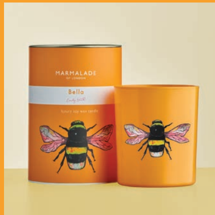
Emily Smith – Bella Luxury Glass Candle 50hrs burn time