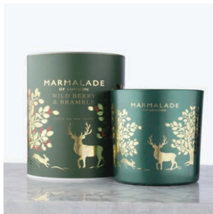
Wild Berry & Bramble Glass Candle 50hrs burn time

WINTER HOME COLLECTION WILD BERRY & BRAMBLE