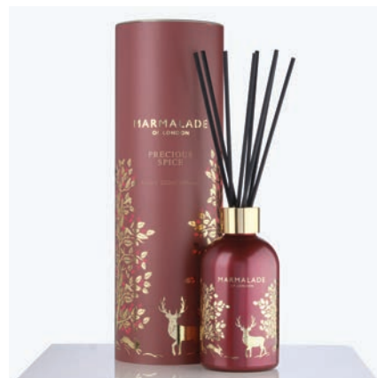
Precious Spice Large Reed Diffuser 200ml