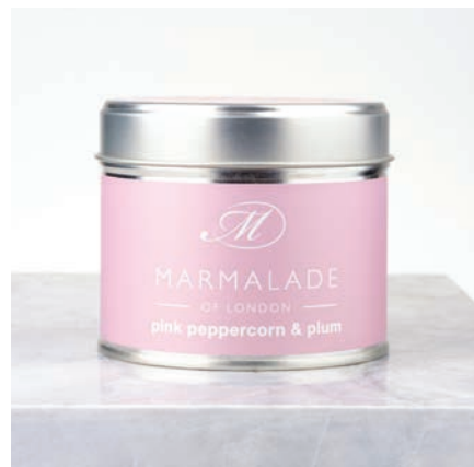
Pink Pepper & Plum Medium Tin Candle 40hrs burn time