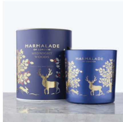
Midnight Woods Glass Candle 50hrs burn time