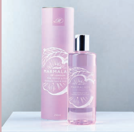
Pink Pepper & Plum Hand & Body Wash 250ml