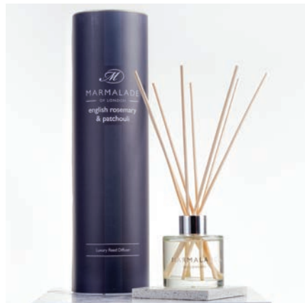
English Rosemary & Patchouli Large Reed Diffuser 100ml