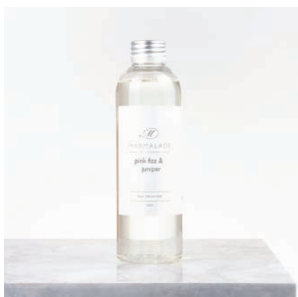
Pink Fizz & Juniper Diffuser Refill 200ml