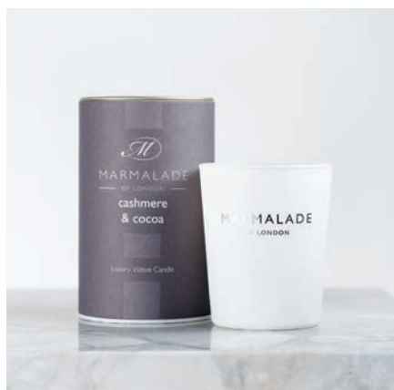
Cashmere & Cocoa Glass Votive 9hrs burn time