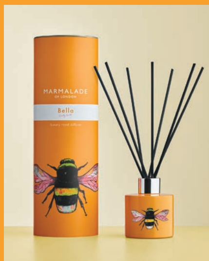
Emily Smith – Bella Luxury Large Reed Diffuser 100ml