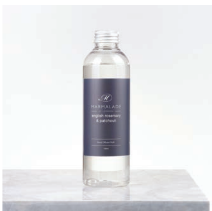
English Rosemary & Patchouli Diffuser Refill 200ml