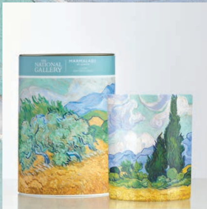
Van Gogh's Wheatfield Luxury Glass Candle 50hrs burn time