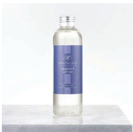
Bergamot & Soft Rose Diffuser Refill 200ml