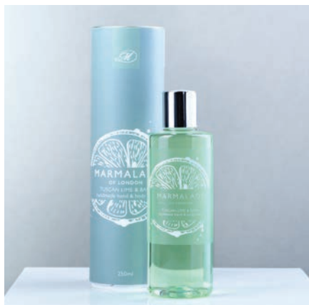
Tuscan Lime & Basil Hand & Body Wash 250ml