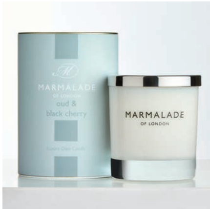
Oud & Black Cherry Glass Candle 50hrs burn time