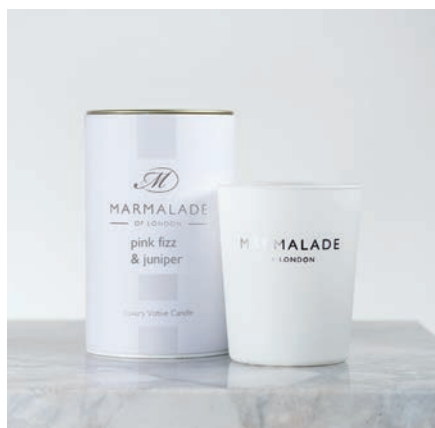
Pink Fizz & Juniper Glass Votive 9hrs burn time