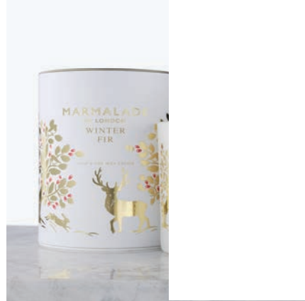
Winter Fir Glass C 50hrs burn time