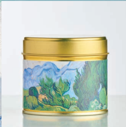
Van Gogh's Wheatfield Luxury Medium Tin Candle 40hrs burn time