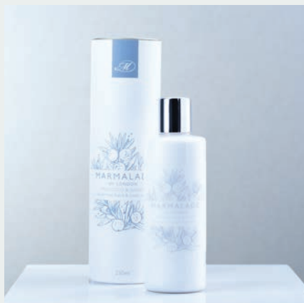
Pink Fizz & Juniper Hand & Body Lotion 250ml