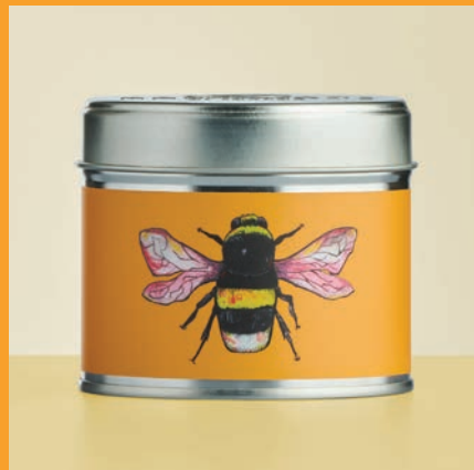
Emily Smith – Bella Luxury Medium Tin Candle 40hrs burn time