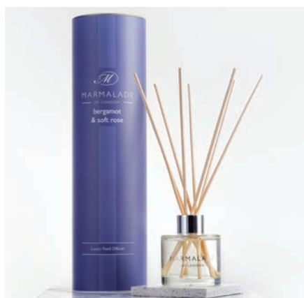
Bergamot & Soft Rose Large Reed Diffuser 100ml