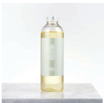
Tuscan Lime & Basil Diffuser Refill 200ml