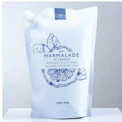
Bergamot & Soft Rose Hand & Body Lotion Refill 500ml