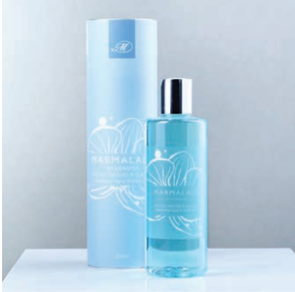
Pacific Orchid & Sea Salt Hand & Body Wash 250ml