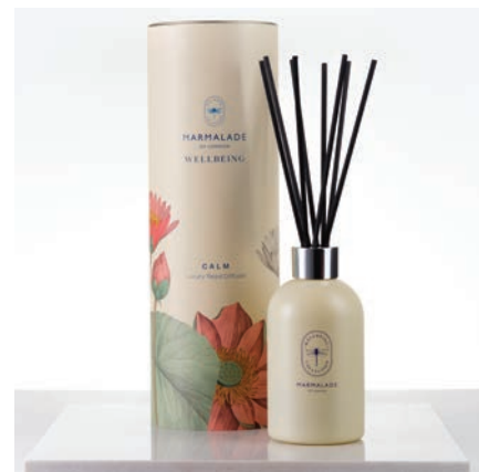
Calm Reed Diffuser 200ml