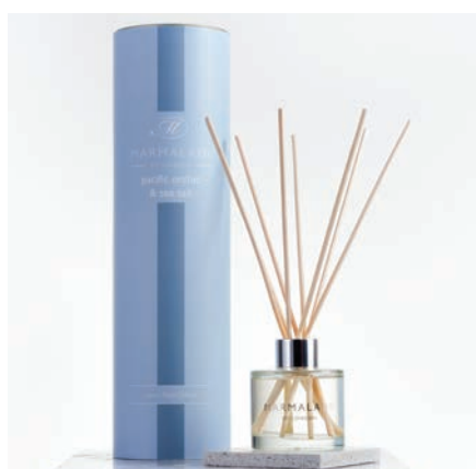
Pacific Orchid & Sea Salt Large Reed Diffuser 100ml