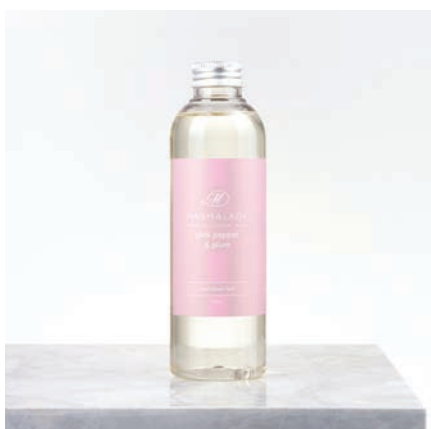
Pink Pepper & Plum Diffuser Refill 200ml