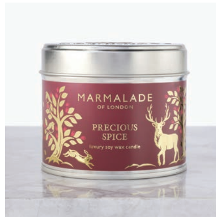
Precious Spice Medium Tin Candle 40hrs burn time