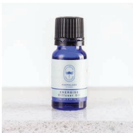
Energise Oil 10ml