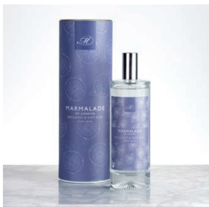
Bergamot & Soft Rose Room Spray 100ml