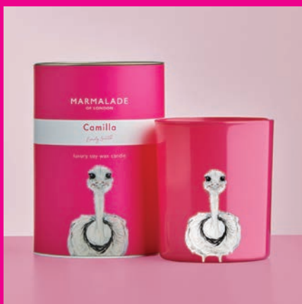
Emily Smith – Camilla Luxury Glass Candle 50hrs burn time