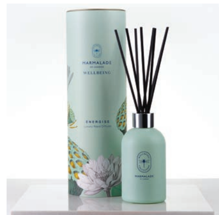
Energise Reed Diffuser 200ml