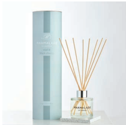
Oud & Black Cherry Large Reed Diffuser 100ml