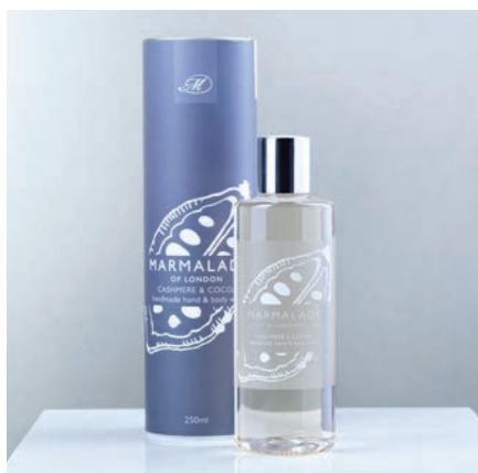
Cashmere & Cocoa Hand & Body Wash 250ml

Top notes of mandarin, lime, grapefruit, lemon, spearmint on a base of floral, basil, patchouli, amber, musk and moss.