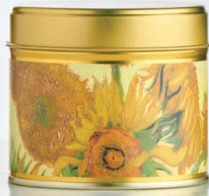
Van Gogh's Sunflowers Luxury Medium Tin Candle 40hrs burn time