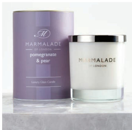
Pomegranate & Pear Glass Candle 50hrs burn time