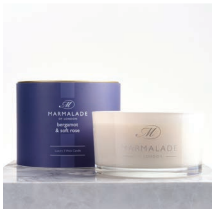
Bergamot & Soft Rose Three Wick Candle 60hrs burn time