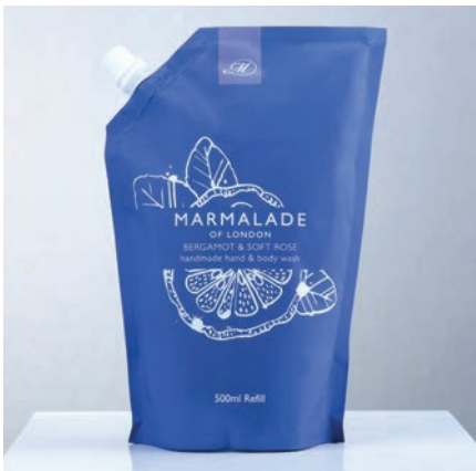
Bergamot & Soft Rose Hand & Body Wash Refill 500ml