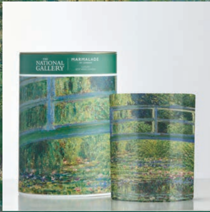
Monet's Water-lily Pond Luxury Glass Candle 50hrs burn time