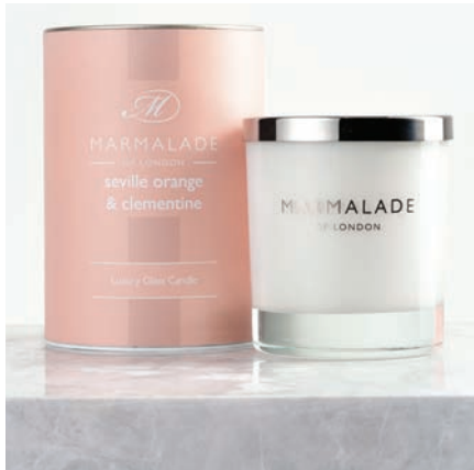
Seville Orange & Clementine Glass Candle 50hrs burn time