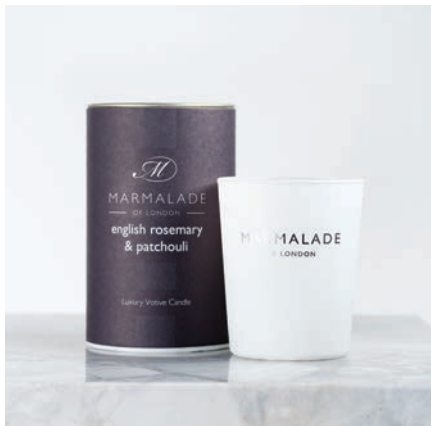
English Rosemary & Patchouli Glass Votive 9hrs burn time