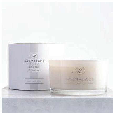
Pink Fizz & Juniper Three Wick Candle 60hrs burn time