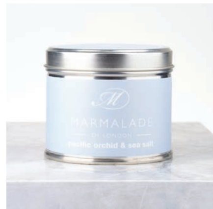
Pacific Orchid & Sea Salt Medium Tin Candle 40hrs burn time