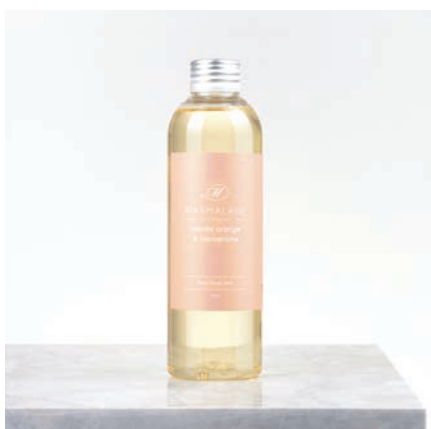
Seville Orange & Clementine Diffuser Refill 200ml