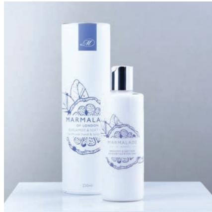
Bergamot & Soft Rose Hand & Body Lotion 250ml