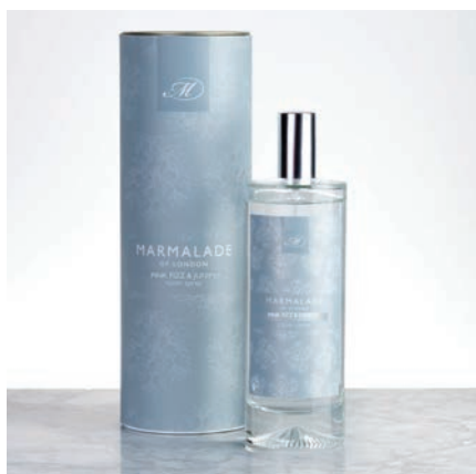
Pink Fizz & Juniper Room Spray 100ml