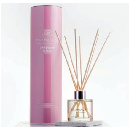
Pink Pepper & Plum Large Reed Diffuser 100ml