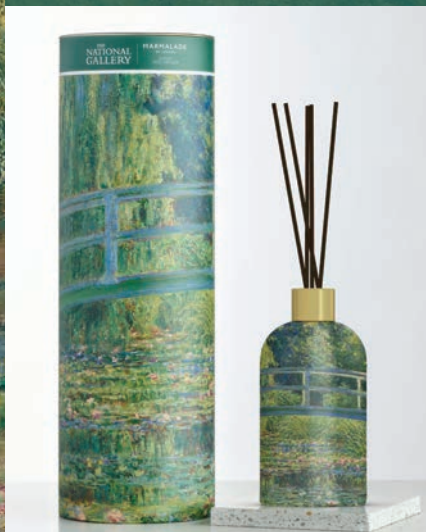
Monet's Water-lily Pond Luxury Large Reed Diffuser 200ml