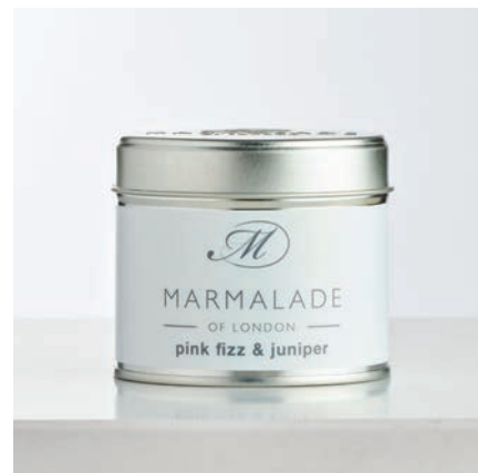
Pink Fizz & Juniper Medium Tin Candle 40hrs burn time