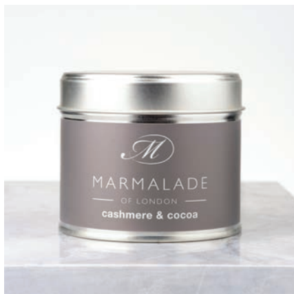
Cashmere & Cocoa Medium Tin Candle 40hrs burn time