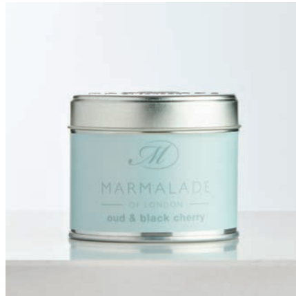
Oud & Black Cherry Medium Tin Candle 40hrs burn time