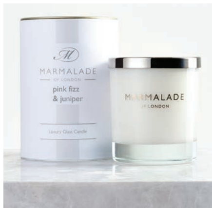
Pink Fizz & Juniper Glass Candle 50hrs burn time