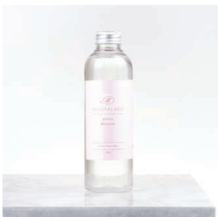
Peony Blossom Diffuser Refill 200ml