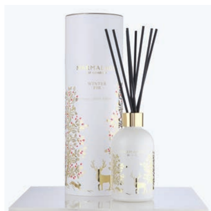
Winter Fir Large Reed Diffuser 200ml