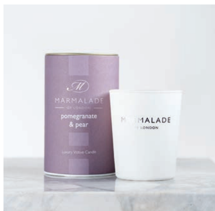
Pomegranate & Pear Glass Votive 9hrs burn time