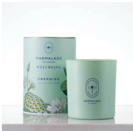
Energise Glass Candle 50hrs burn time