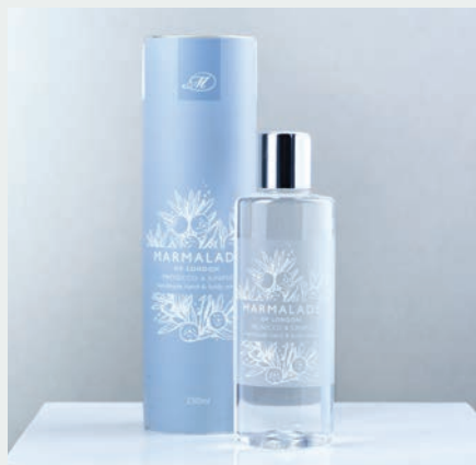
Pink Fizz & Juniper Hand & Body Wash 250ml