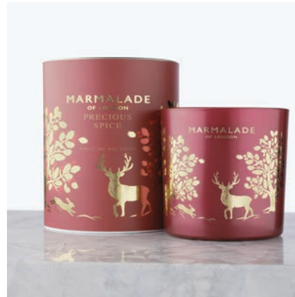
Precious Spice Glass Candle 50hrs burn time