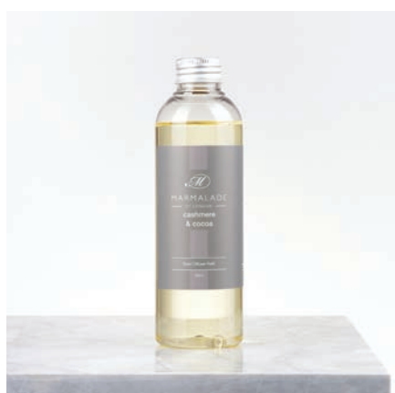
Cashmere & Cocoa Diffuser Refill 200ml