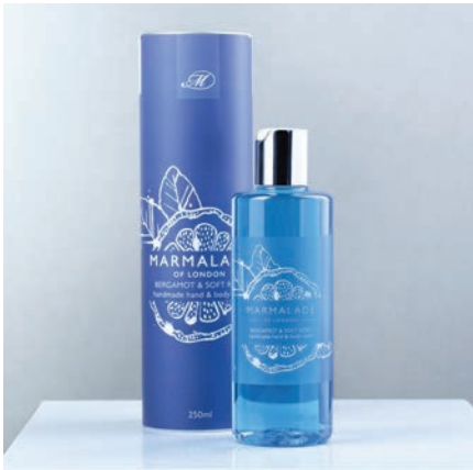
Bergamot & Soft Rose Hand & Body Wash 250ml