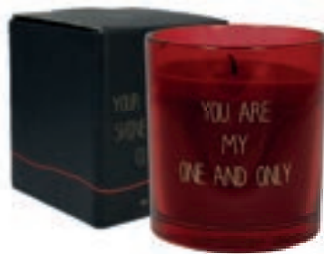
SKU: GL.CO.LC.22 Scent: Unconditional Size: D.8 x H.9 cm Quantity: 4