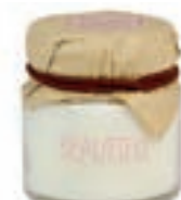
SKU: miniT.2.beau.pi Scent: Green Tea Time Size: D.4.5 x H.5 cm Quantity: 12