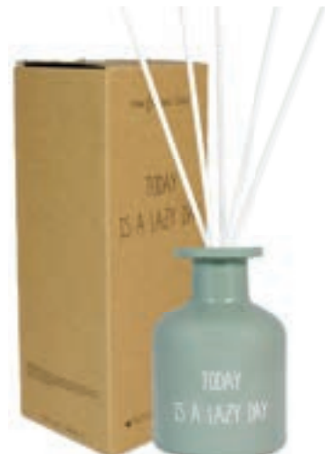
SKU: RD.GRN.BB.LAZY Scent: Botanical Bamboo Content: 100 ml Quantity: 4