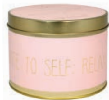
SKU: TIN.XL.PI Scent: Green Tea Time Size: D.12 x H.8 cm Quantity: 3