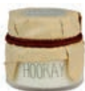
SKU: mini.5.hooray.grn Scent: Minty Bamboo Size: D.4.2 x H.3.8 cm Quantity: 12