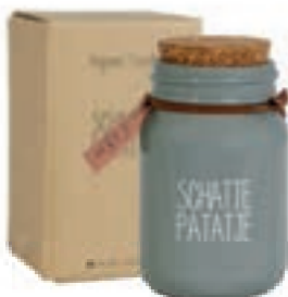
SKU: GL.MOCK.GRN Scent: Minty Bamboo Size: D.5 x H.8 cm Quantity: 8