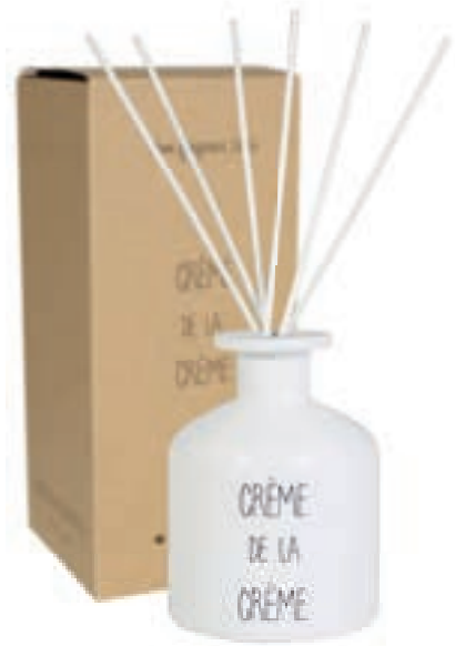
SKU: RD.XL.WH.FL.CREME Scent: Fresh Lotus Content: 190 ml Quantity: 3