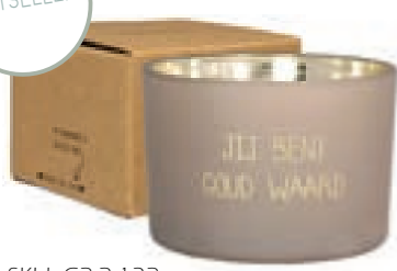
SKU: C2.2.132 Scent: Fig's Delight Size: B.7.5 x H.5 cm Quantity: 6