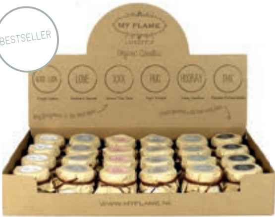
SKU: tray.24.mini Size: L.29.5 x B.20 x H.21.5 cm Quantity: 2 1 tray contains 24 candles