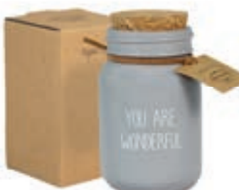
SKU: GL.MOCK.LG Scent: Amber's Secret Size: D.5 x H.8 cm Quantity: 8