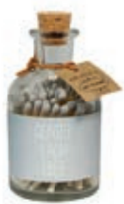
SKU: MTCH.LGRY Size bottle: D.6 x H.10.5 cm Content: 80 matches Quantity: 8