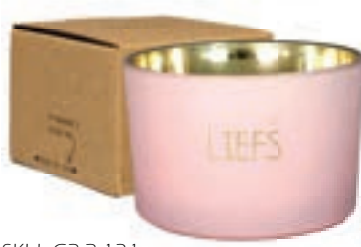
SKU: C2.2.131 Scent: Green Tea Time Size: B.7.5 x H.5 cm Quantity: 6