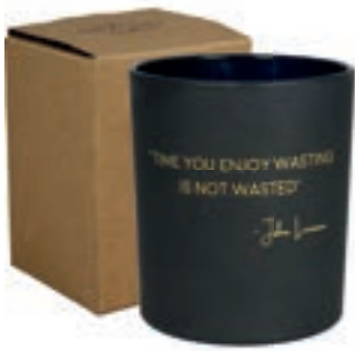
SKU: XBG.9010.MBL1 Scent: Warm Cashmere Size: D.9 x H.10 cm Quantity: 4