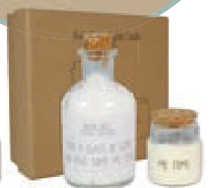
SKU: SO.BS.GB.10.WH Scent: Fresh Cotton Content: 180 gr. salt and 40 gr. wax Quantity: 4