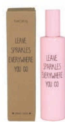
SKU: RS.PI.US Scent: Urban Suede Content: 100 ml Quantity: 4