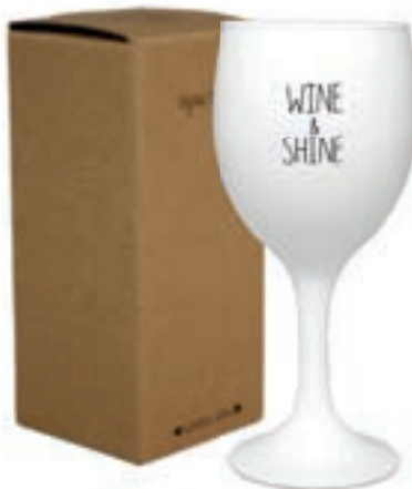
SKU: GL.WI.L.WH Scent: Fresh Cotton Size: D.7 x H.15 cm Quantity: 4