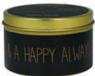
SKU: TIN.M.BL.HAPPYALWAYS Scent: Warm Cashmere Size: D.8 x H.5 cm Quantity: 4