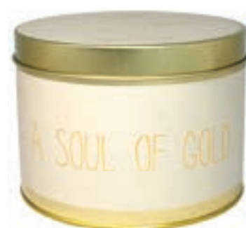
SKU: TIN.XL.SND Scent: Fig's Delight Size: D.12 x H.8 cm Quantity: 3