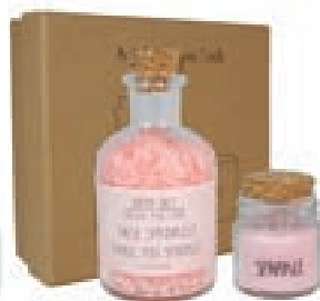
SKU: SO.BS.GB.08.PI Scent: Green Tea Time Content: 180 gr. salt and 40 gr. wax Quantity: 4