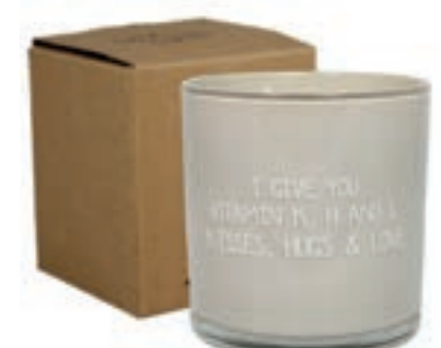
SKU: GL.1010.SND Scent: Fig's Delight Size: D.10 x H.10 cm Quantity: 4