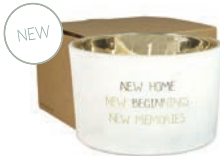
SKU: GL.MTC.XL.WH Scent: Fresh Cotton Size: D.13 x H.8 cm Quantity: 4