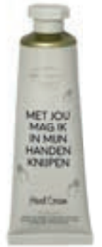
SKU: HC.009.05 Scent: Fig Deluxe Content: 50 ml Quantity: 8