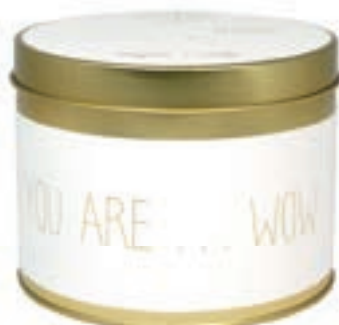
SKU: TIN.XL.WH Scent: Fresh Cotton Size: D.12 x H.8 cm Quantity: 3