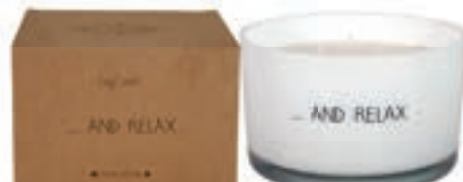
SKU: GL.XL.WH Scent: Fresh Cotton Size: D.13 x H.8 cm Quantity: 3