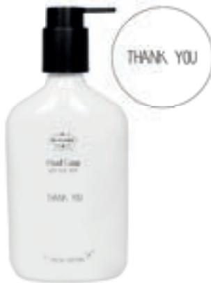
SKU: SO.GB350.WH Scent: Fresh Cotton Content: 350 ml Quantity: 6