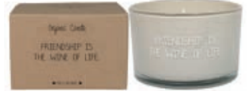
SKU: GL.XL.SND Scent: Fig's Delight Size: D.13 x H.8 cm Quantity: 3