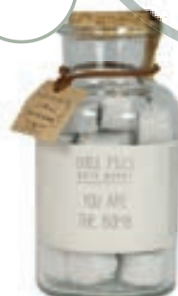
SKU: SO.BP.SND Scent: Fig's Delight Content: 128 gr. Quantity: 6