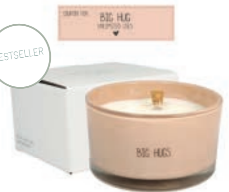
SKU: GL.MB.003.04 Scent: Green Tea Time Size: D.9 x H.5 cm Quantity: 4