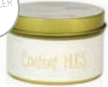
SKU: TIN.XS.SND Scent: Fig's Delight Size: D.6 x H.4 cm Quantity: 12