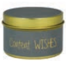
SKU: TIN.XS.DGRY Scent: Persian Pomegranate Size: D.6 x H.4 cm Quantity: 12