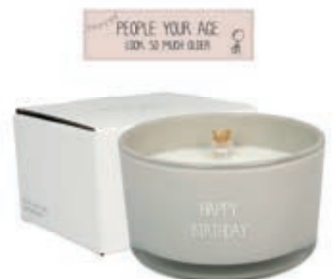
SKU: GL.MB.003.05 Scent: Fig's Delight Size: D.9 x H.5 cm Quantity: 4