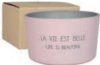
SKU: OUT.L.004.03 Scent: Bella Citronella Size: D.11 x H.6 cm Quantity: 4