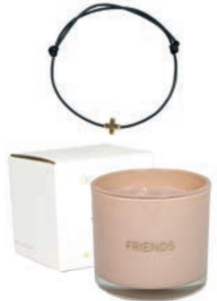
SKU: WBR.006.04 Scent: Green Tea Time Size: D.7 x H.6 cm Quantity: 6

Use this sign in your shop to show your customers which bracelet goes with which candle.