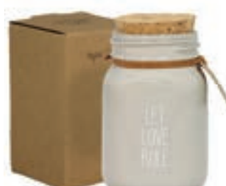
SKU: GL.MOCK.SND Scent: Fig's Delight Size: D.5 x H.8 cm Quantity: 8