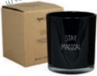
SKU: GL.CO.BL Scent: Warm Cashmere Size: D.8 x H.9 cm Quantity: 4