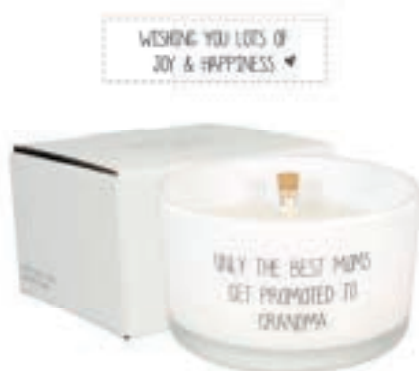
SKU: GL.MB.003.06 Scent: Fresh Cotton Size: D.9 x H.5 cm Quantity: 4