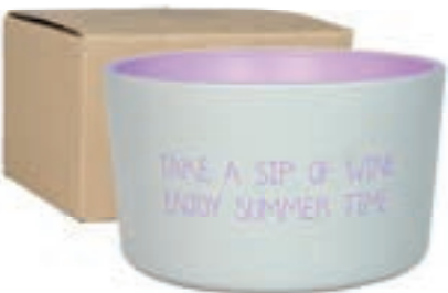
SKU: OUT.L.004.02 Scent: Bella Citronella Size: D.11 x H.6 cm Quantity: 4