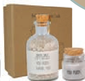
SKU: SO.BS.GB.09.SND Scent: Fig's Delight Content: 180 gr. salt and 40 gr. wax Quantity: 4