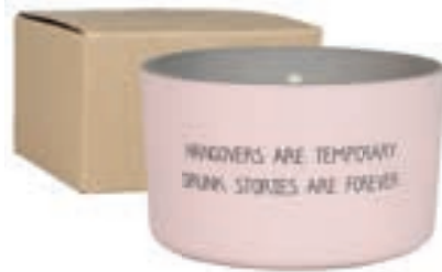
SKU: OUT.8850.PI Scent: Bella Citronella Size: D.9 x H.5 cm Quantity: 6