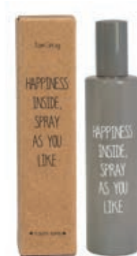
SKU: RS.LG.FB Scent: Flower Bomb Content 100 ml Quantity: 4