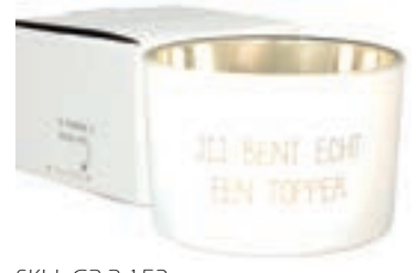
SKU: C2.2.153 Scent: Fresh Cotton Size: B.7.5 x H.5 cm Quantity: 6