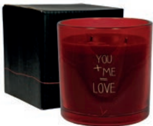
SKU: GL.1010.LC.22 Scent: Unconditional Size: D.10 x H.10 cm Quantity: 4