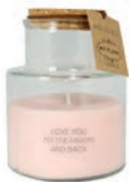
SKU: OUT.008.04 Scent: Bella Citronella Size: D.10 x H.12 cm Quantity: 4