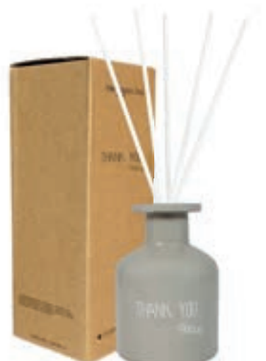
SKU: RD.SND.FD.THANK Scent: Fig Deluxe Content: 100 ml Quantity: 4