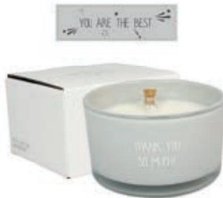
SKU: GL.MB.003.03 Scent: Amber's Secret Size: D.9 x H.5 cm Quantity: 4