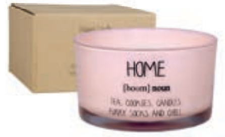
SKU: GL.WW.PI Scent: Green Tea Time Size: D.9 x H.5 cm Quantity: 4