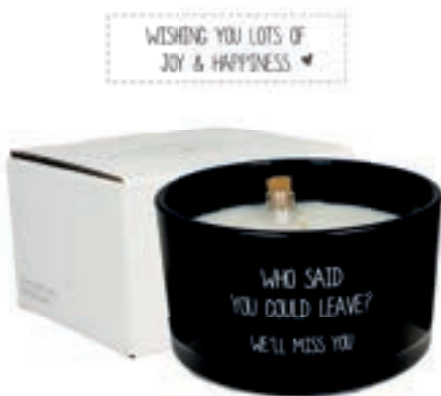
SKU: GL.MB.003.01 Scent: Warm Cashmere Size: D.9 x H.5 cm Quantity: 4