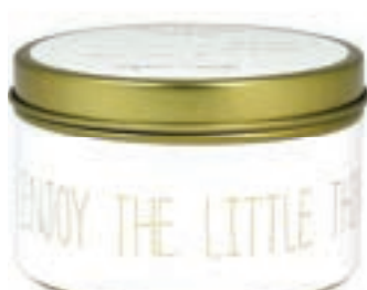
SKU: TIN.M.WH.ENJOYTHINGS Scent: Fresh Cotton Size: D.8 x H.5 cm Quantity: 4