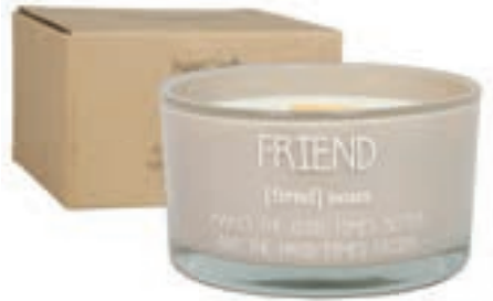
SKU: GL.WW.SND Scent: Fig's Delight Size: D.9 x H.5 cm Quantity: 4