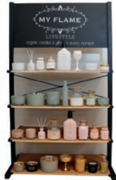
DISPLAY - 4 SHELVES Material: black steel with 4 wooden shelves Size: 76 x 40 X 125 cm Ask your sales representative for the possibilities