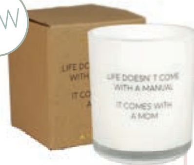
SKU: GL.8090.MAN Scent: Fresh Cotton Size: D.8 x H.9 cm Quantity: 4