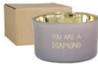
SKU: GL.MTC.GRY Scent: Amber's Secret Size: D.9 x H.5 cm Quantity: 4