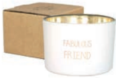
SKU: GL.MTC.XS.WH Scent: Fresh Cotton Size: D.7.5 x H.5 cm Quantity: 6