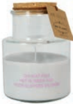
SKU: OUT.008.03 Scent: Bella Citronella Size: D.10 x H.12 cm Quantity: 4