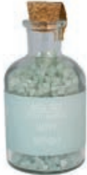
SKU: SO.BS.02.GRN Scent: Minty Bamboo Content: 180 gr. Quantity: 8