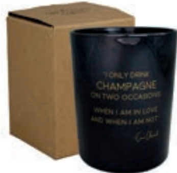
SKU: XBG.1012.SBL7 Scent: Warm Cashmere Size: D.10 x H.12 cm Quantity: 4