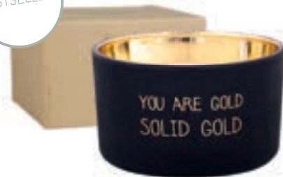
SKU: GL.MTC.BL Scent: Warm Cashmere Size: D.9 x H.5 cm Quantity: 4