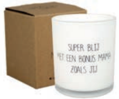
SKU: GL.8090.BNS Scent: Fresh Cotton Size: D.8 x H.9 cm Quantity: 4