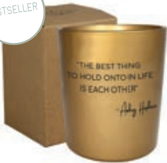
SKU: XBG.9010.MGO2 Scent: Silky Tonka Size: D.9 x H.10 cm Quantity: 4