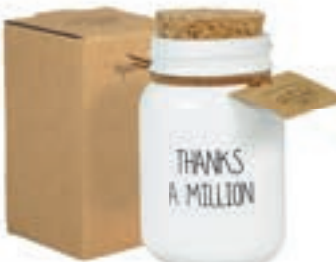
SKU: GL.MOCK.WH Scent: Fresh Cotton Size: D.5 x H.8 cm Quantity: 8