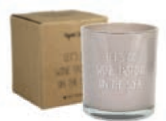
SKU: GL.CO.SA Scent: Fig's Delight Size: D.8 x H.9 cm Quantity: 4