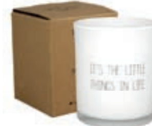
SKU: GL.CO.WH-1 Scent: Fresh Cotton Size: D.8 x H.9 cm Quantity: 4