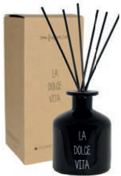
SKU: RD.XL.BL.CC.DOLCE Scent: Cashmere Comfort Content: 190 ml Quantity: 3