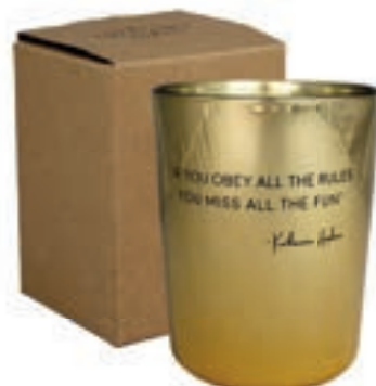
SKU: XBG.1012.SGO8 Scent: Silky Tonka Size: D.10 x H.12 cm Quantity: 4