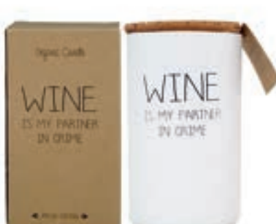
SKU: GL.RND.WH Scent: Fresh Cotton Size: D.7 x H.12 cm Quantity: 4