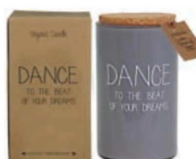
SKU: GL.RND.DGRY Scent: Persian Pomegranate Size: D.7 x H.12 cm Quantity: 4