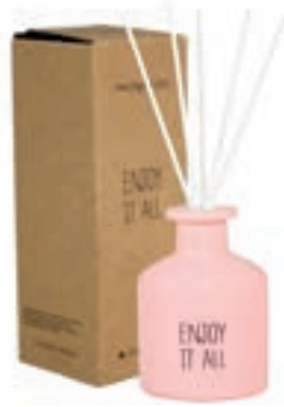
SKU: RD.XS.PI.US.ENJOY Scent: Urban Suede Content: 50 ml Quantity: 6