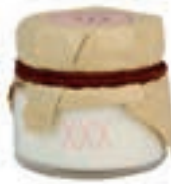
SKU: mini.2.xxx.pi Scent: Green Tea Time Size: D.4.2 x H.3.8 cm Quantity: 12