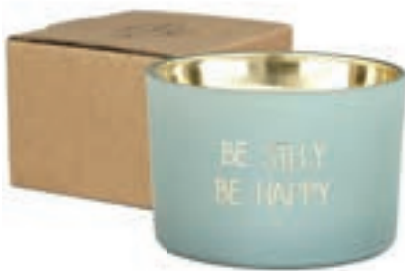
SKU: GL.MTC.XS.GRN Scent: Minty Bamboo Size: D.7.5 x H.5 cm Quantity: 6