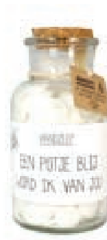
SKU: C2.2.150 Scent: Fresh Cotton Content: 50 gr. Quantity: 8