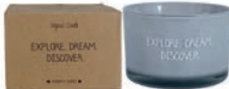
SKU: GL.XL.LG Scent: Amber's Secret Size: D.13 x H.8 cm Quantity: 3