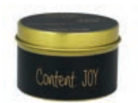
SKU: TIN.XS.BL Scent: Warm Cashmere Size: D.6 x H.4 cm Quantity: 12