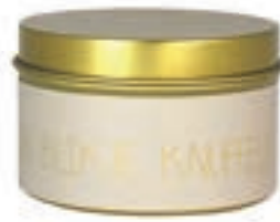
SKU: C2.2.127 Scent: Fig's Delight Size: D.6 x H.4 cm Quantity: 12