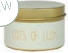
SKU: TIN.XS.GRN-1 Scent: Minty Bamboo Size: D.6 x H.4 cm Quantity: 12