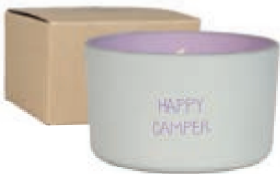
SKU: OUT.8850.LGRY Scent: Bella Citronella Size: D.9 x H.5 cm Quantity: 6