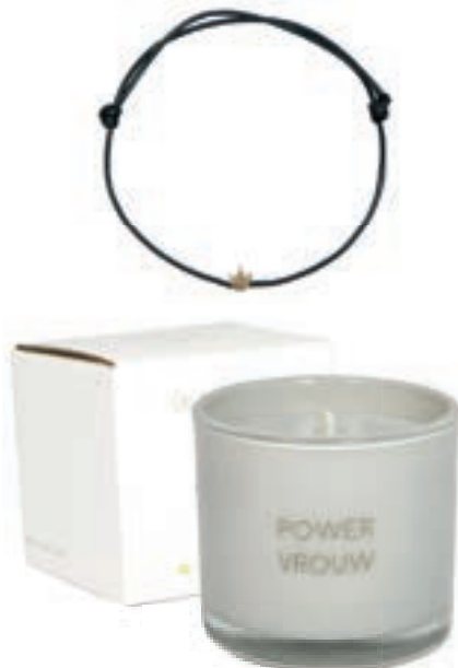
SKU: WBR.006.03 Scent: Amber's Secret Size: D.7 x H.6 cm Quantity: 6