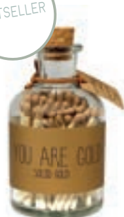
SKU: MTCH.GLD Size bottle: D.6 x H.10.5 cm Content: 80 matches Quantity: 8