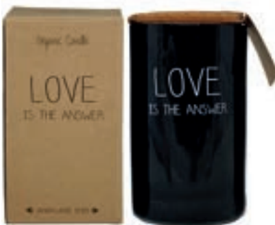
SKU: GL.RND.BL Scent: Warm Cashmere Size: D.7 x H.12 cm Quantity: 4