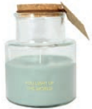
SKU: OUT.008.02 Scent: Bella Citronella Size: D.10 x H.12 cm Quantity: 4