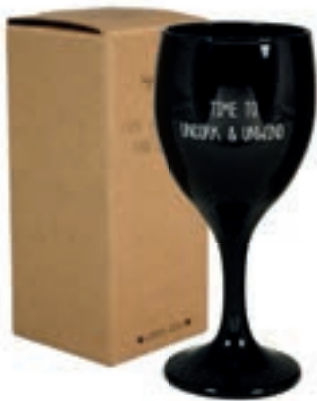
SKU: GL.WI.BL.CORK Scent: Warm Cashmere Size: D.5.5 x H.13 cm Quantity: 4