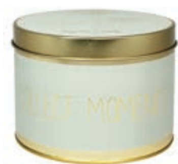
SKU: TIN.XL.GRN Scent: Minty Bamboo Size: D.12 x H.8 cm Quantity: 3