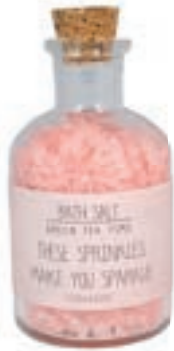
SKU: SO.BS.03.PI Scent: Green Tea Time Content: 180 gr. Quantity: 8