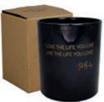
SKU: XBG.9010.SBL3 Scent: Warm Cashmere Size: D.9 x H.10 cm Quantity: 4