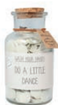
SKU: SO.SND.04 Scent: Fig's Delight Content: 50 gr. Quantity: 8