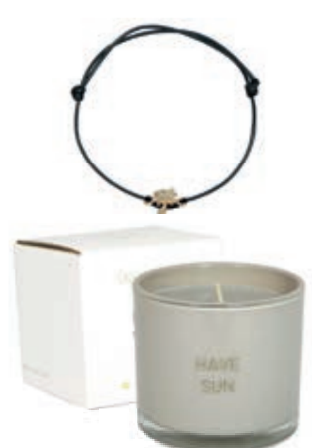
SKU: WBR.006.05 Scent: Fig's Delight Size: D.7 x H.6 cm Quantity: 6