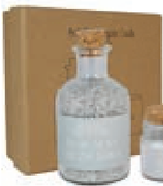
SKU: SO.BS.GB.07.LGRY Scent: Ambers Secret Content: 180 gr. salt and 40 gr. wax Quantity: 4