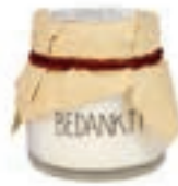
SKU: C2.2.139 Scent: Fresh Cotton Size: B.4.5 x H.5 cm Quantity: 12