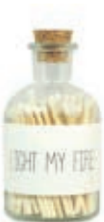
SKU: MTCH.WH Size bottle: D.6 x H.10.5 cm Content: 80 matches Quantity: 8