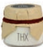
SKU: mini.1.thx.dg Scent: Persian Pomegranate Size: D.4.2 x H.3.8 cm Quantity: 12

Meet our mini's. Just a little something for any occasion. Mix and match or just take one. Before you know it, your tray is gone.