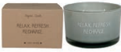
SKU: GL.XL.GRN Scent: Minty Bamboo Size: D.13 x H.8 cm Quantity: 3