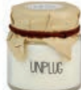
SKU: miniT.3.unplug.wh Scent: Fresh Cotton Size: D.4.5 x H.5 cm Quantity: 12