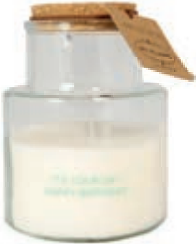
SKU: OUT.008.06 Scent: Bella Citronella Size: D.10 x H.12 cm Quantity: 4