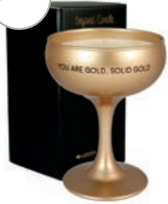
SKU: GL.WI.007.07 Scent: Silky Tonka Size: D.8 x H.11 cm Quantity: 4