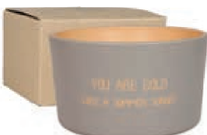
SKU: OUT.L.004.04 Scent: Bella Citronella Size: D.11 x H.6 cm Quantity: 4