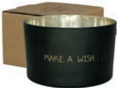
SKU: GL.MTC.XL.BL Scent: Warm Cashmere Size: D.13 x H.8 cm Quantity: 4