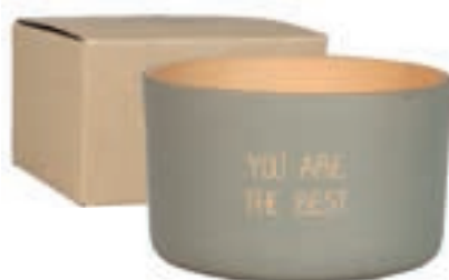
SKU: OUT.8850.SND Scent: Bella Citronella Size: D.9 x H.5 cm Quantity: 6