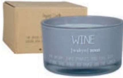
SKU: GL.WW.GRY Scent: Amber's Secret Size: D.9 x H.5 cm Quantity: 4