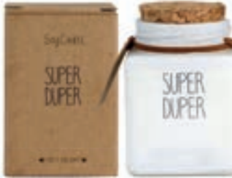
SKU: GL.SQ.WH Scent: Fresh Cotton Size: L.7 x B.7 x H.9 cm Quantity: 4