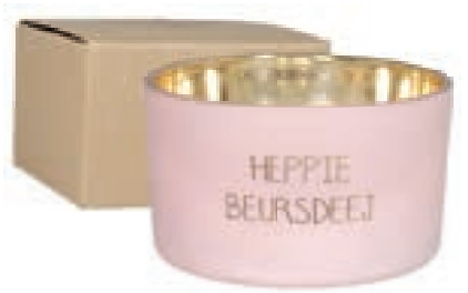
SKU: GL.MTC.PI Scent: Green Tea Time Size: D.9 x H.5 cm Quantity: 4