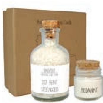
SKU: C2.2.151 Scent: Fresh Cotton Content: 180 gr. salt and 40 gr. wax Quantity: 4