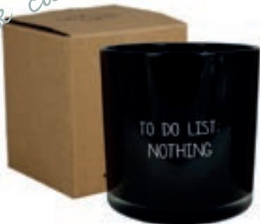
SKU: GL.1010.BL Scent: Warm Cashmere Size: D.10 x H.10 cm Quantity: 4