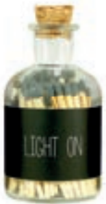
SKU: MTCH.BL Size bottle: D.6 x H.10.5 cm Content: 80 matches Quantity: 8

HEY BEAUTIFUL KEEP SHINING THE WORLD NEEDS YOUR LIGHT