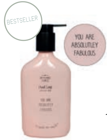
SKU: SO.GB350.PI Scent: Green Tea Time Content: 350 ml Quantity: 6