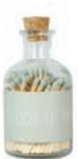
SKU: MTCH.GRN Size bottle: D.6 x H.10.5 cm Content: 80 matches Quantity: 8