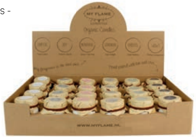
SKU: tray.24.miniT Size: L.34 x B.24 x H.26 cm Quantity: 1 1 tray contains 24 candles