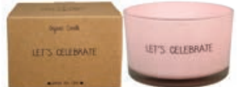
SKU: GL.XL.PI Scent: Green Tea Time Size: D.13 x H.8 cm Quantity: 3