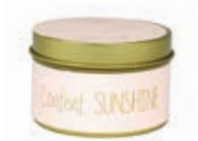
SKU: TIN.XS.PI Scent: Green Tea Time Size: D.6 x H.4 cm Quantity: 12