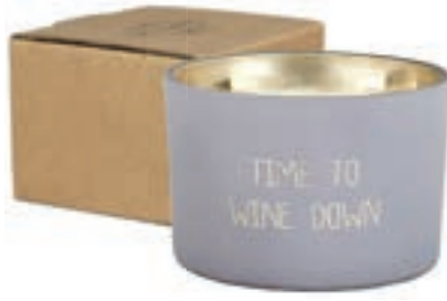
SKU: GL.MTC.XS.LGRY Scent: Amber's Secret Size: D.7.5 x H.5 cm Quantity: 6