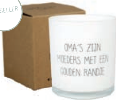
SKU: GL.8090.OMA Scent: Fresh Cotton Size: D.8 x H.9 cm Quantity: 4