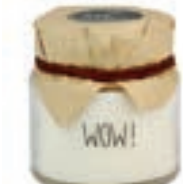
SKU: miniT.1.wow.dg Scent: Persian Pomegranate Size: D.4.5 x H.5 cm Quantity: 12