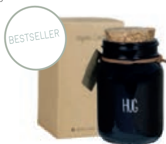
SKU: GL.MOCK.BL Scent: Warm Cashmere Size: D.5 x H.8 cm Quantity: 8