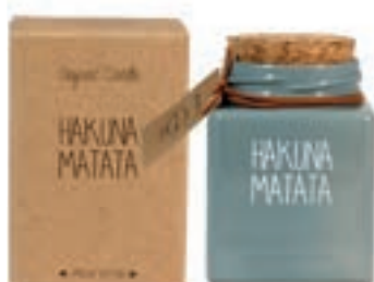
SKU: GL.SQ.GR Scent: Minty Bamboo Size: L.7 x B.7 x H.9 cm Quantity: 4