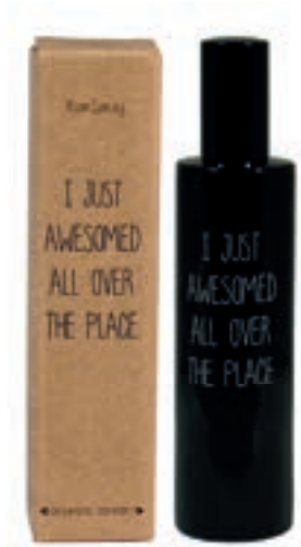
SKU: RS.BL.CC Scent: Cashmere Comfort Content 100 ml Quantity: 4