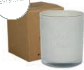
SKU: GL.CO.LGRY Scent: Amber's Secret Size: D.8 x H.9 cm Quantity: 4