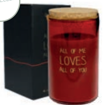
SKU: GL.RND.LC Scent: Unconditional Size: D.7 x H.12 cm Quantity: 4