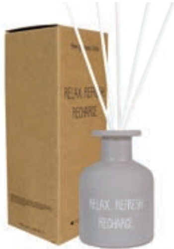
SKU: RD.GR.FB.RELAX Scent: Flower Bomb Content: 100 ml Quantity: 4