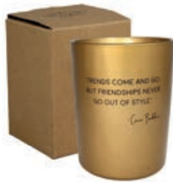
SKU: XBG.1012.MGO6 Scent: Silky Tonka Size: D.10 x H.12 cm Quantity: 4