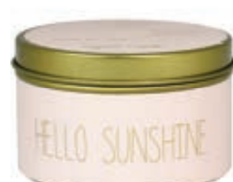
SKU: TIN.M.PI.SHINE Scent: Green Tea Time Size: D.8 x H.5 cm Quantity: 4