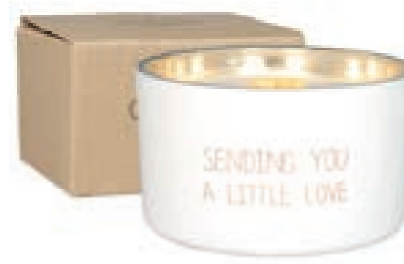
SKU: GL.MTC.WH Scent: Fresh Cotton Size: D.9 x H.5 cm Quantity: 4