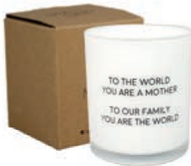
SKU: GL.8090.WRLD Scent: Fresh Cotton Size: D.8 x H.9 cm Quantity: 4