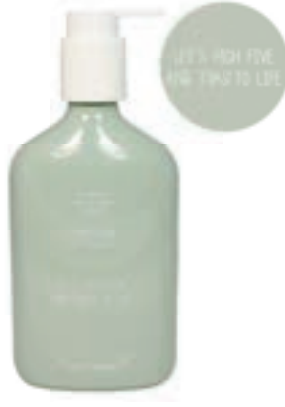
SKU: SO.GB350.GRN Scent: Minty Bamboo Content: 350 ml Quantity: 6