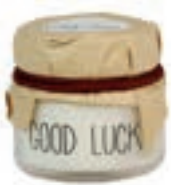
SKU: mini.3.goodluck.wh Scent: Fresh Cotton Size: D.4.2 x H.3.8 cm Quantity: 12