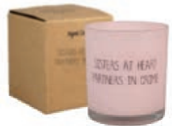
SKU: GL.CO.PI Scent: Green Tea Time Size: D.8 x H.9 cm Quantity: 4