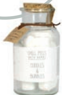
SKU: SO.BP.WH Scent: Fresh Cotton Content: 128 gr. Quantity: 6