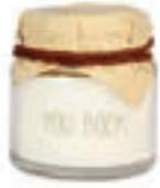
SKU: C2.2.129 Scent: Fig's Delight Size: B.4.5 x H.5 cm Quantity: 12