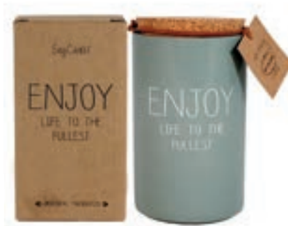
SKU: GL.RND.GRN Scent: Minty Bamboo Size: D.7 x H.12 cm Quantity: 4