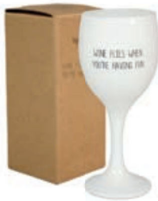
SKU: GL.WI.WH.FLY Scent: Fresh Cotton Size: D.5.5 x H.13 cm Quantity: 4