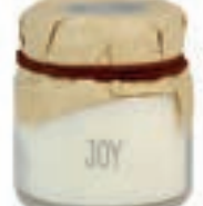
SKU: miniT.4.joy.lg Scent: Amber's Secret Size: D.4.5 x H.5 cm Quantity: 12