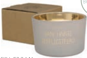
SKU: C2.2.141 Scent: Amber's Secret Size: B.7.5 x H.5 cm Quantity: 6