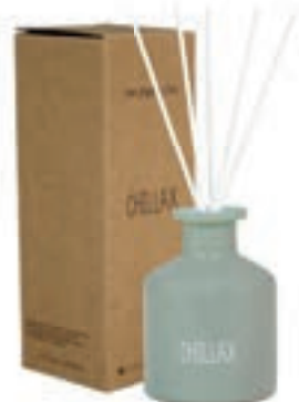
SKU: RD.XS.GRN.BB.CHILLAX Scent: Botanical Bamboo Content: 50 ml Quantity: 6