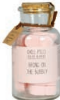
SKU: SO.BP.PI Scent: Green Tea Time Content: 128 gr. Quantity: 6