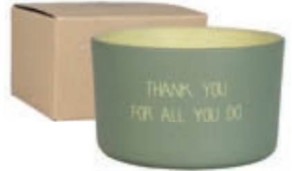
SKU: OUT.8850.GRN Scent: Bella Citronella Size: D.9 x H.5 cm Quantity: 6