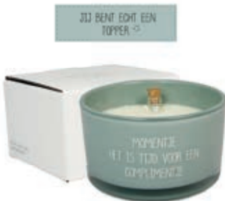
SKU: GL.MB.003.02 Scent: Minty Bamboo Size: D.9 x H.5 cm Quantity: 4