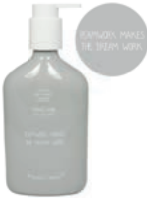
SKU: SO.GB350.LGRY Scent: Amber's Secret Content: 350 ml Quantity: 6