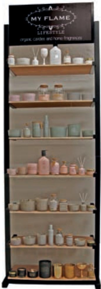
DISPLAY - 7 SHELVES Material: black steel with 7 wooden shelves Size: 80 x 40 X 215 cm Ask your sales representative for the possibilities