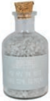
SKU: SO.BS.01.LGRY Scent: Ambers Secret Content: 180 gr. Quantity: 8