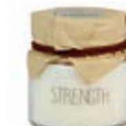
SKU: miniT.6.strength.snd Scent: Fig's Delight Size: D.4.5 x H.5 cm Quantity: 12