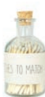
SKU: MTCH.SND Size bottle: D.6 x H.10.5 cm Content: 80 matches Quantity: 8