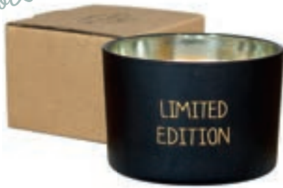
SKU: GL.MTC.XS.BLK Scent: Warm Cashmere Size: D7.5 x H.5 cm Quantity: 6