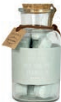
SKU: SO.BP.GRN Scent: Minty Bamboo Content: 128 gr. Quantity: 6