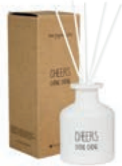
SKU: RD.XS.WH.FL.CHEERS Scent: Fresh Lotus Content: 50 ml Quantity: 6