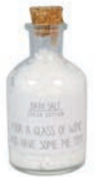
SKU: SO.BS.05.WH Scent: Fresh Cotton Content: 180 gr. Quantity: 8