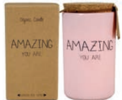
SKU: GL.RND.PI Scent: Green Tea Time Size: D.7 x H.12 cm Quantity: 4