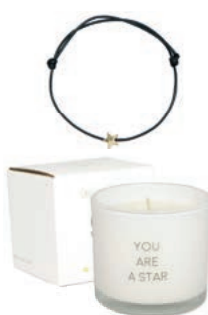
SKU: WBR.006.06 Scent: Fresh Cotton Size: D.7 x H.6 cm Quantity: 6