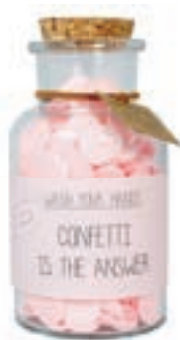
SKU: SO.PI.05 Scent: Green Tea Time Content: 50 gr. Quantity: 8