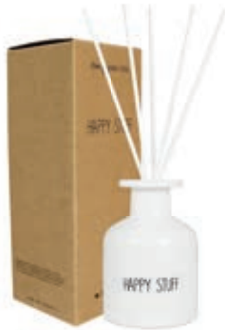
SKU: RD.WH.FL.HAPPY Scent: Fresh Lotus Content: 100 ml Quantity: 4