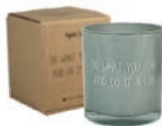
SKU: GL.CO.GRN Scent: Minty Bamboo Size: D.8 x H.9 cm Quantity: 4