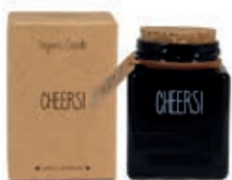
SKU: GL.SQ.BL Scent: Warm Cashmere Size: L.7 x B.7 x H.9 cm Quantity: 4