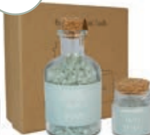
SKU: SO.BS.GB.06.GRN Scent: Minty Bamboo Content: 180 gr. salt and 40 gr. wax Quantity: 4