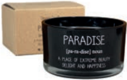
SKU: GL.WW.BL Scent: Warm Cashmere Size: D.9 x H.5 cm Quantity: 4