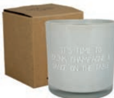
SKU: GL.1010.LGRY Scent: Amber's Secret Size: D.10 x H.10 cm Quantity: 4