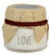
SKU: mini.4.love.lg Scent: Amber's Secret Size: D.4.2 x H.3.8 cm Quantity: 12