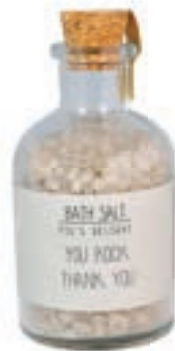
SKU: SO.BS.04.SND Scent: Fig's Delight Content: 180 gr. Quantity: 8