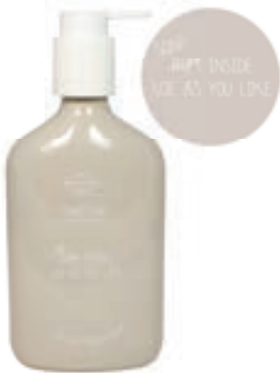
SKU: SO.GB350.SND Scent: Fig's Delight Content: 350 ml Quantity: 6