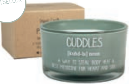
SKU: GL.WW.GRN Scent: Minty Bamboo Size: D.9 x H.5 cm Quantity: 4