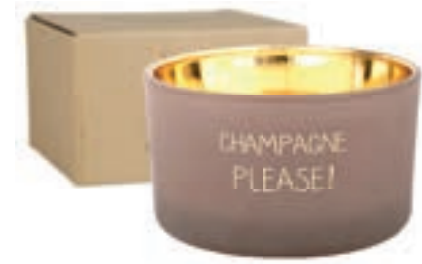
SKU: GL.MTC.SD Scent: Fig's Delight Size: D.9 x H.5 cm Quantity: 4