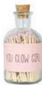
SKU: MTCH.PI Size bottle: D.6 x H.10.5 cm Content: 80 matches Quantity: 8