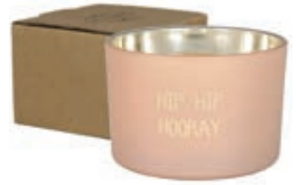
SKU: GL.MTC.XS.PI Scent: Green Tea Time Size: D.7.5 x H.5 cm Quantity: 6