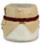
SKU: mini.6.hug.snd Scent: Fig's Delight Size: D.4.2 x H.3.8 cm Quantity: 12