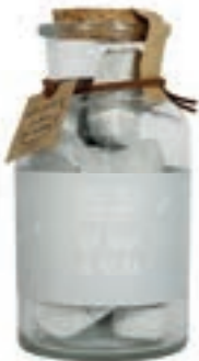
SKU: SO.BP.LGRY Scent: Ambers Secret Content: 128 gr. Quantity: 6