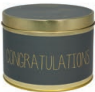
SKU: TIN.XL.DGRY Scent: Persian Pomegranate Size: D.12 x H.8 cm Quantity: 3