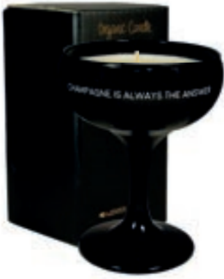
SKU: GL.WI.007.01 Scent: Warm Cashmere Size: D.8 x H.11 cm Quantity: 4