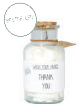
SKU: SO.WH.01 Scent: Fresh Cotton Content: 50 gr. Quantity: 8