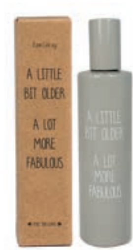
SKU: RS.SND.FD.LITTLE Scent: Fig Deluxe Content: 100 ml Quantity: 4