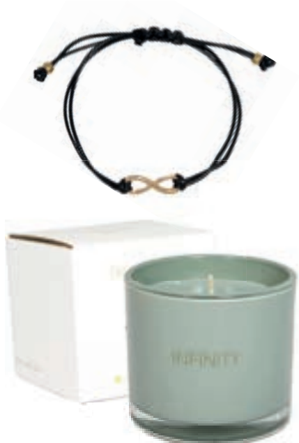
SKU: WBR.006.02 Scent: Minty Bamboo Size: D.7 x H.6 cm Quantity: 6