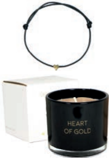
SKU: WBR.006.01 Scent: Warm Cashmere Size: D.7 x H.6 cm Quantity: 6