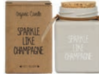
SKU: GL.SQ.SND Scent: Fig's Delight Size: L.7 x B.7 x H.9 cm Quantity: 4