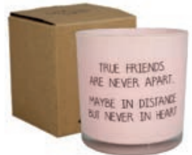
SKU: GL.1010.PI Scent: Green Tea Time Size: D.10 x H.10 cm Quantity: 4