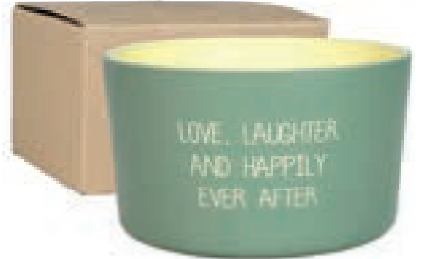
SKU: OUT.L.004.01 Scent: Bella Citronella Size: D.11 x H.6 cm Quantity: 4