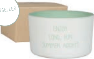
SKU: OUT.8850.WH Scent: Bella Citronella Size: D.9 x H.5 cm Quantity: 6