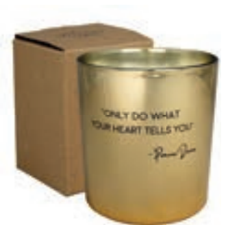
SKU: XBG.9010.SGO4 Scent: Silky Tonka Size: D.9 x H.10 cm Quantity: 4