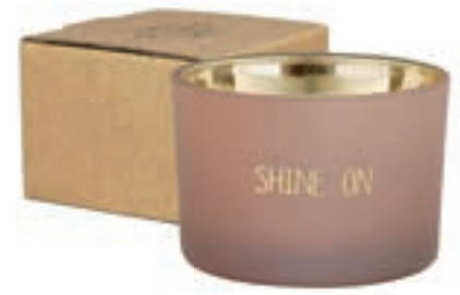
SKU: GL.MTC.XS.SND Scent: Fig's Delight Size: D.7.5 x H.5 cm Quantity: 6