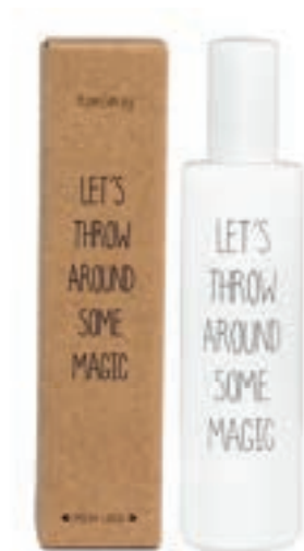
SKU: RS.WH.FL Scent: Fresh Lotus Content: 100 ml Quantity: 4