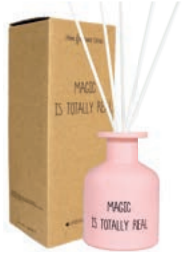
SKU: RD.PI.US.MAGIC Scent: Urban Suede Content: 100 ml Quantity: 4