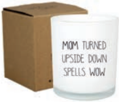
SKU: GL.8090.MOM Scent: Fresh Cotton Size: D.8 x H.9 cm Quantity: 4