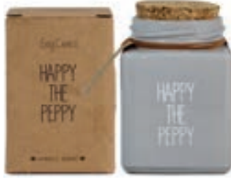
SKU: GL.SQ.LG Scent: Amber's Secret Size: L.7 x B.7 x H.9 cm Quantity: 4