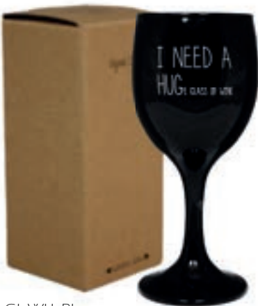
SKU: GL.WI.LBL Scent: Warm Cashmere Size: D.7 x H.15 cm Quantity: 4