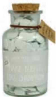
SKU: SO.LGRY.06 Scent: Amber's Secret Content: 50 gr. Quantity: 8