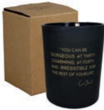
SKU: XBG.1012.MBL5 Scent: Warm Cashmere Size: D.10 x H.12 cm Quantity: 4