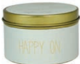
SKU: TIN.M.GRN.HAPPYON Scent: Minty Bamboo Size: D.8 x H.5 cm Quantity: 4