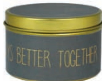
SKU: TIN.M.DGRY.TOGETHER Scent: Persian Pomegranate Size: D.8 x H.5 cm Quantity: 4