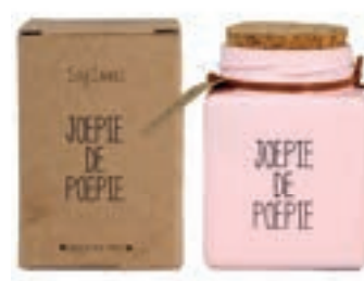
SKU: GL.SQ.PI Scent: Green Tea Time Size: L.7 x B.7 x H.9 cm Quantity: 4