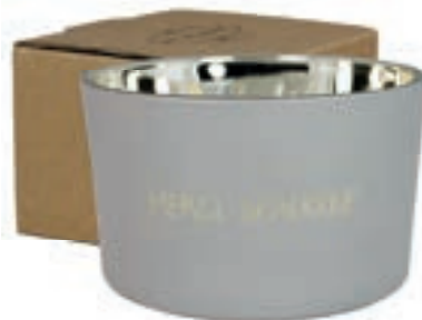
SKU: GL.MTC.XL.LGRY Scent: Amber's Secret Size: D.13 x H.8 cm Quantity: 4