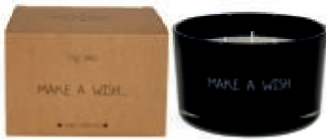
SKU: GL.XL.BL Scent: Warm Cashmere Size: D.13 x H.8 cm Quantity: 3