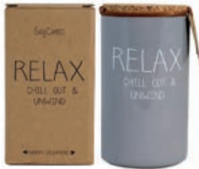
SKU: GL.RND.SD Scent: Amber's Secret Size: D.7 x H.12 cm Quantity: 4