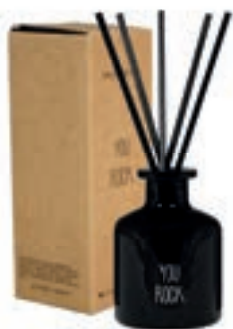
SKU: RD.XS.BL.CC.ROCK Scent: Cashmere Comfort Content: 50 ml Quantity: 6