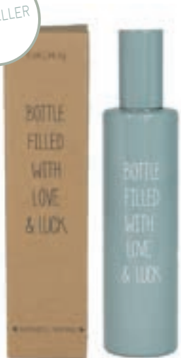
SKU: RS.GRN.BB Scent: Botanical Bamboo Content 100 ml Quantity: 4