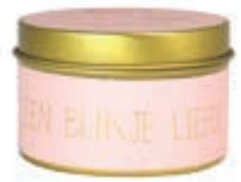
SKU: C2.2.128 Scent: Warm Cashmere Size: D.6 x H.4 cm Quantity: 12