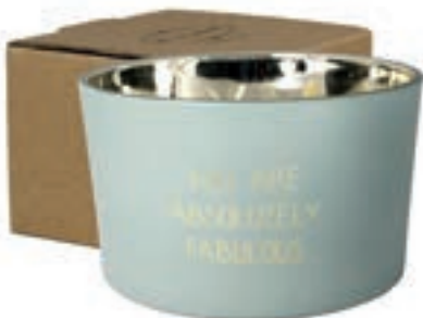
SKU: GL.MTC.XL.GRN Scent: Minty Bamboo Size: D.13 x H.8 cm Quantity: 4