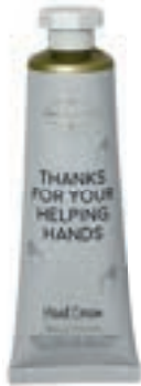
SKU: HC.009.03 Scent: Hibiscus Paradise Content: 50 ml Quantity: 8