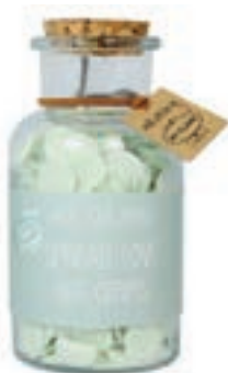
SKU: SO.GRN.03 Scent: Minty Bamboo Content: 50 gr. Quantity: 8