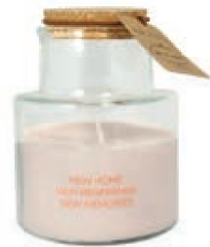
SKU: OUT.008.05 Scent: Bella Citronella Size: D.10 x H.12 cm Quantity: 4