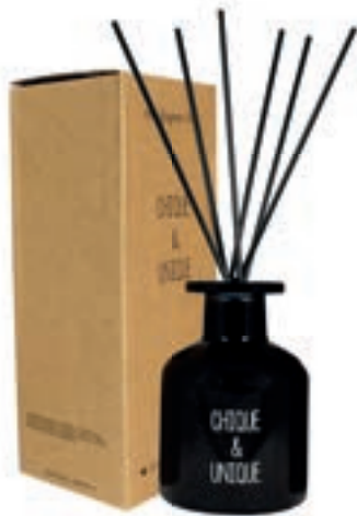
SKU: RD.BL.CC.CHIQUE Scent: Cashmere Comfort Content: 100 ml Quantity: 4