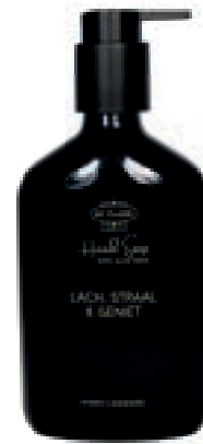
SKU: SO.GB350.BLK Scent: Warm Cashmere Content: 350 ml Quantity: 6