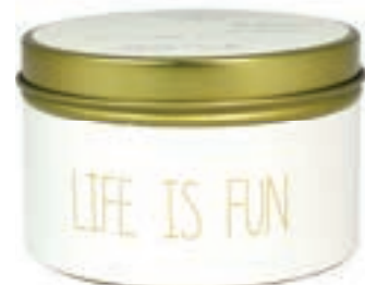
SKU: TIN.M.SND.FUN Scent: Fig's Delight Size: D.8 x H.5 cm Quantity: 4