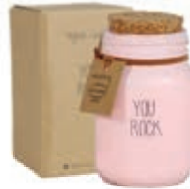
SKU: GL.MOCK.PI Scent: Green Tea Time Size: D.5 x H.8 cm Quantity: 8