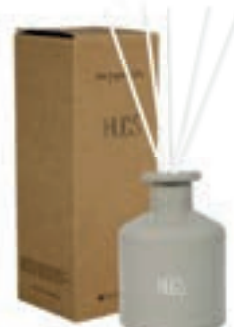
SKU: RD.XS.SND.FD.HUGS Scent: Fig Deluxe Content: 50 ml Quantity: 6