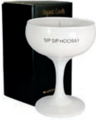
SKU: GL.WI.007.06 Scent: Fresh Cotton Size: D.8 x H.11 cm Quantity: 4