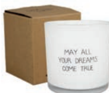
SKU: GL.1010.WH Scent: Fresh Cotton Size: D.10 x H.10 cm Quantity: 4