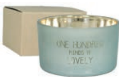
SKU: GL.MTC.GRN Scent: Minty Bamboo Size: D.9 x H.5 cm Quantity: 4