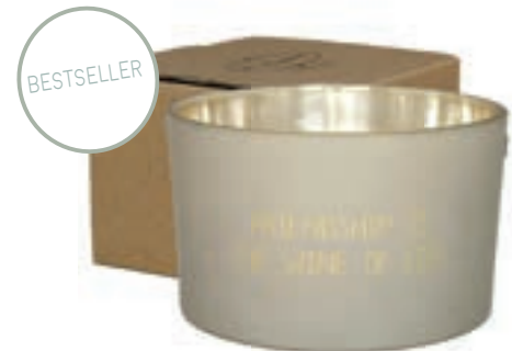
SKU: GL.MTC.XL.SND Scent: Fig's Delight Size: D.13 x H.8 cm Quantity: 4