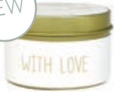
SKU: TIN.XS.WH-1 Scent: Fresh Cotton Size: D.6 x H.4 cm Quantity: 12