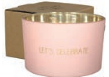
SKU: GL.MTC.XL.PI Scent: Green Tea Time Size: D.13 x H.8 cm Quantity: 4