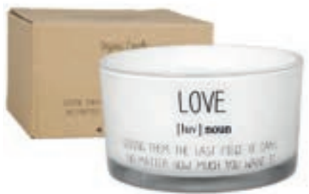
SKU: GL.WW.WH Scent: Fresh Cotton Size: D.9 x H.5 cm Quantity: 4