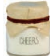
SKU: miniT.5.cheers.grn Scent: Minty Bamboo Size: D.4.5 x H.5 cm Quantity: 12