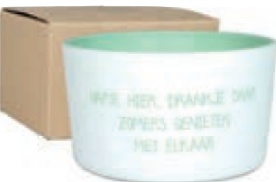
SKU: OUT.L.004.05 Scent: Bella Citronella Size: D.11 x H.6 cm Quantity: 4