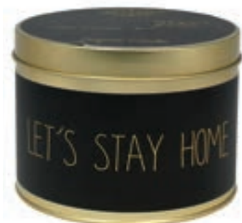
SKU: TIN.XL.BL.HOME Scent: Warm Cashmere Size: D.12 x H.8 cm Quantity: 3