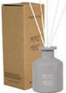
SKU: RD.XS.LG. FB.MERCY Scent: Flower Bomb Content: 50 ml Quantity: 6