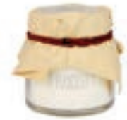
SKU: C2.2.140 Scent: Amber's Secret Size: B.4.5 x H.5 cm Quantity: 12