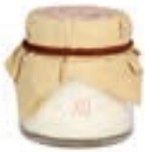
SKU: C2.2.130 Scent: Green Tea Time Size: B.4.5 x H.5 cm Quantity: 12