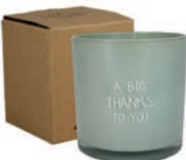
SKU: GL.1010.GRN Scent: Minty Bamboo Size: D.10 x H.10 cm Quantity: 4