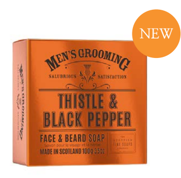
A01828FACE & BEARD SOAP100g

Leave skin feeling invigorated and visibly fresh with our Facial Wash, infused with purifying milk thistle extract and our signature Thistle & Black Pepper fragrance.