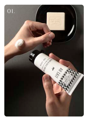
01. Au Lait Hand & Nail Cream