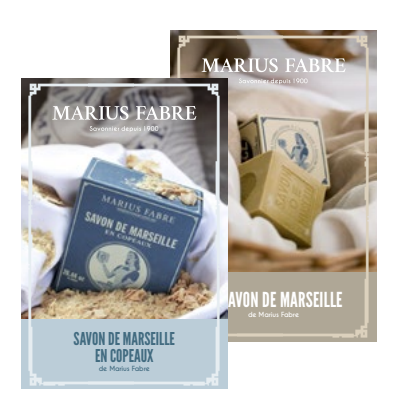
Nature Flyer x 4 - A6 Format Ref : NPLVA6FR - French Flyer Ref : NPLVA6DE - German Flyer Ref : NPLVA6GB - English Flyer Ref : NPLVA6IT- Italian Flyer