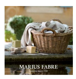
Marius Fabre leaflet 12 pages Ref : DEPMFFR - French leaflet Ref : DEPMFDE - German leaflet Ref : DEPMFGB - English leaflet Ref : DEPMFIT - Italian leaflet