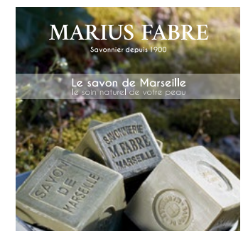
Pharmacy leaflet 20 pages Ref : MFPHARMFR - French leaflet Ref : MFPHARMGB - English leaflet