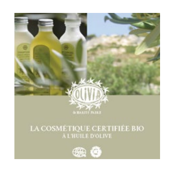
Olivia leaflet 12 pages Ref : OLDEPFR - French leaflet Ref : OLDEPDE - German leaflet Ref : OLDEPEN - English leaflet Ref : OLDEPIT - Italian leaflet