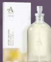
Room Spray 100ml