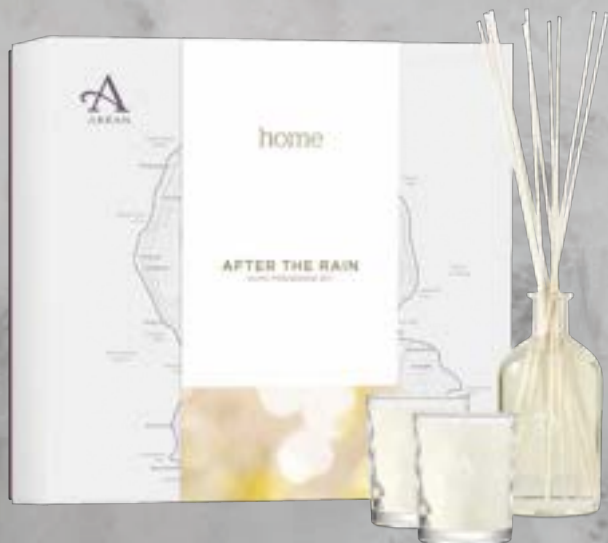
Home Fragrance Set After the Rain 1 x 100ml, 2 x 8cl

Each sets contains two scented 8cl candles plus a 100ml reed diffuser. Available in our two most popular HOME fragrances; After the Rain and Bergamot & Geranium.