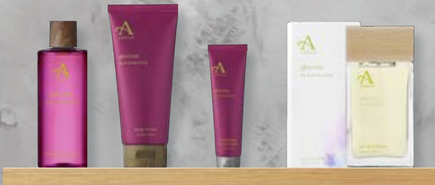
Bath & Shower Gel 300ml