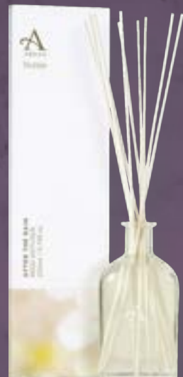
Reed Diffuser 200ml