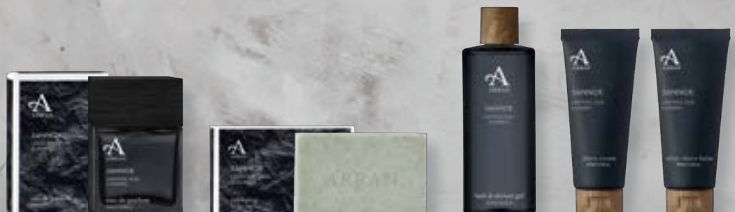
Eau De Parfum 50ml

A rich sensual leather fragrance fused with amber and precious oud, harmonised with pink pepper and saffron.