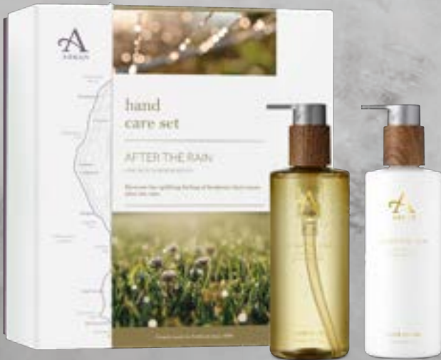
Hand Care Duo Hand Wash and Hand Cream 2x 300ml

Available in; After the Rain, Kildonan, Glenashdale, Glen Rosa and Glen Iorsa.