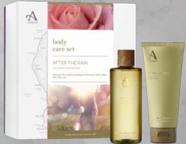
Body Care Duo Bath & Shower Gel and Body Lotion 300ml + 200ml

Available in; After the Rain, Kildonan, Glenashdale, Glen Rosa and Glen Iorsa.