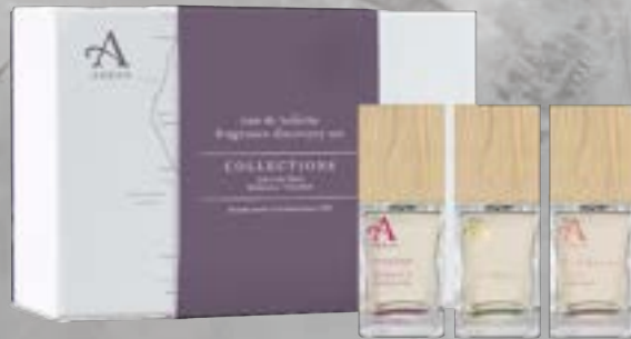
Eau de Toilette Discovery Set 3x 15ml

A vibrant fragrance with contrasting citrus accents of bergamot, mandarin and lime around a warm heart of clover, honeysuckle and rose.