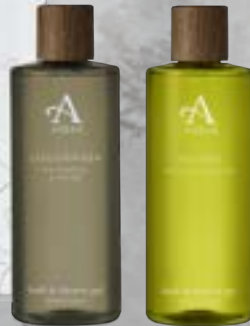
Bath & Shower Gel Duo Machrie/Lochranza Mix 2x 300ml