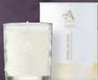
Scented Candle 8cl