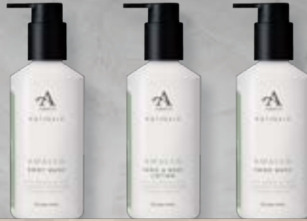
Body Wash 250ml