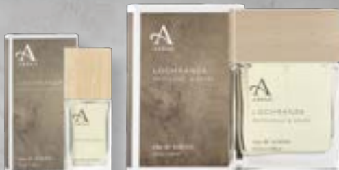
Eau De Toilette 15ml

A warm fragrance with a woody base of patchouli and vetiver, enhanced by the freshness of lemon and grapefruit. Earthy and enigmatic.