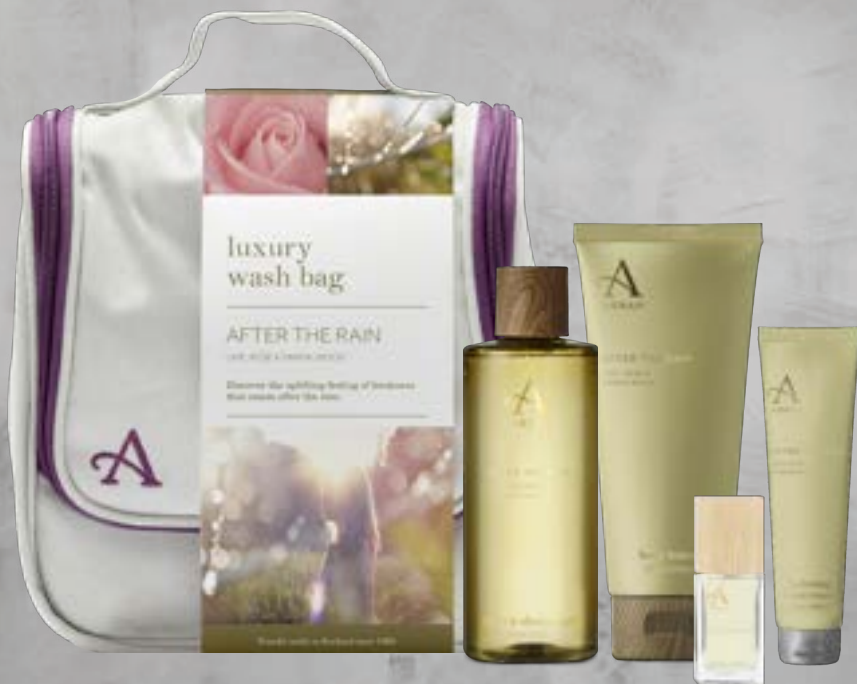
After the Rain Female Wash Bag Bath & Shower Gel , Body Lotion, Hydrating Hand Cream and Eau de Parfum 300ml, 200ml, 40ml + 15ml

Made from durable cotton canvas with a water-resistant inner, this expertly crafted Wash Bag contains a full-sized Bath & Shower Gel, Body Lotion, Hydrating Hand Cream and Eau De Parfum in our most-loved fragrance, After the Rain.