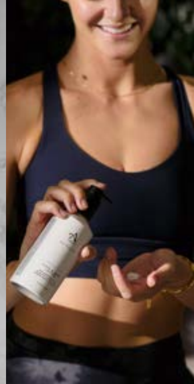
Hand Wash 250ml