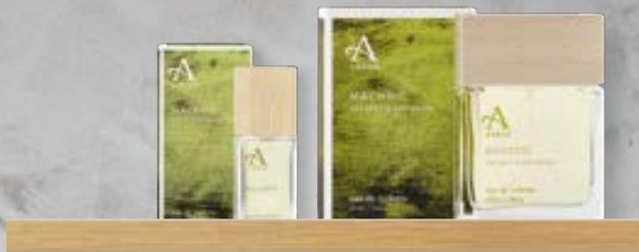
Eau De Toilette 15ml

Clean and crisp; Machrie is a balance of sea salt and clary sage stirred with the woody earthiness of rockrose.