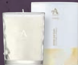
Scented Candle 35cl

Inspired by our travels, ARRAN Home fragrances are created using oils from around the world, all infused with the essence of our island home.