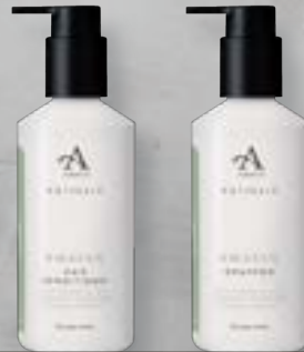
Hair Conditioner 250ml