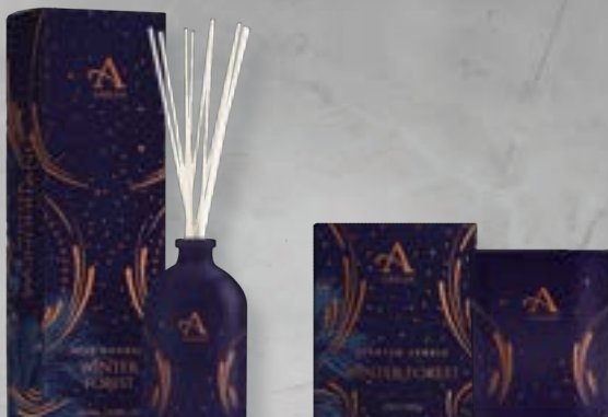
Winter Forest Reed Diffuser 100ml

The sweet scent of winter berries softened with the warmth of a cosy, open fire. Inspired by the Scottish festive tradition of burning rowan branches to clear bad feelings.