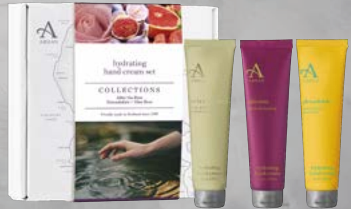
Hydrating Hand Cream Trio 3x 40ml

A warm embrace of honeyed-fruit, crushed green leaf and the softness of coconut.