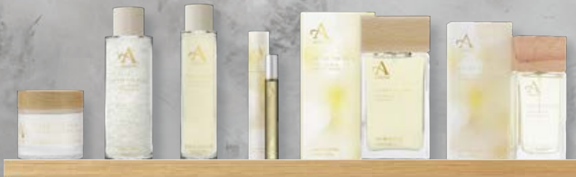
Shea Butter Cream 100ml