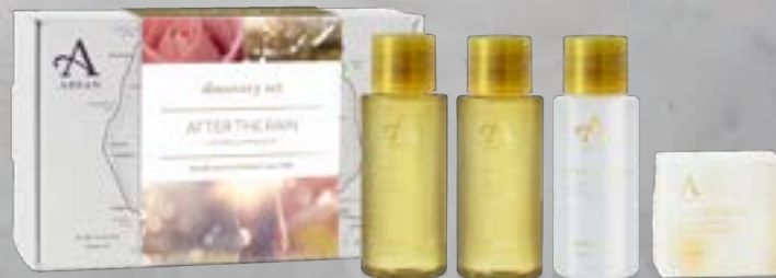
Discovery Set After the Rain

Mens Mixed Fragrance Set 4 x 30ml LOCHRANZA | MACHRIE