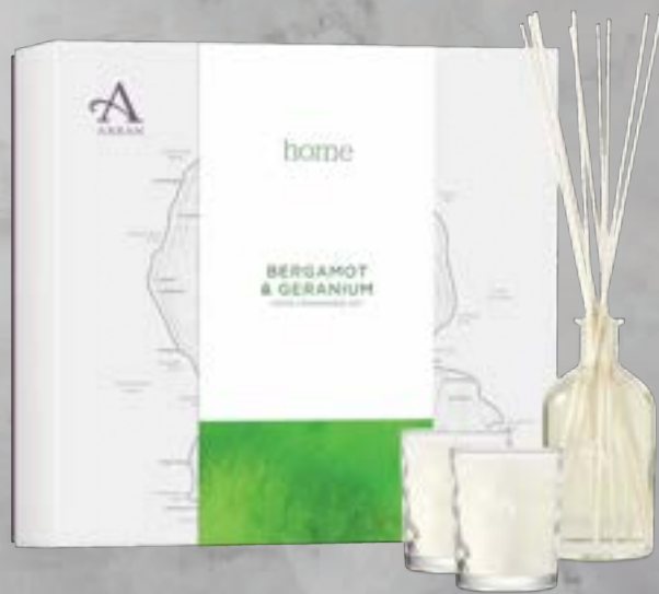
Home Fragrance Set Bergamot & Geranium 1 x 100ml, 2 x 8cl