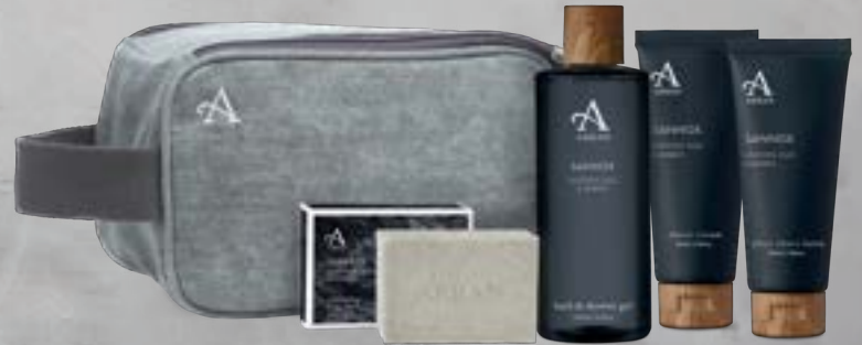
Mens Wash Bag Sannox