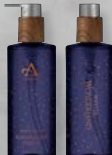
Rowanberry Embers Hand Wash 300ml