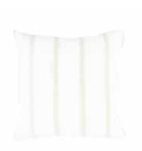
ANGUS STRIPE CUSHION 40 x 40cm Flax