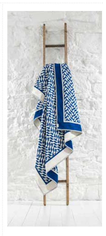
TIDAL RECYCLED COTTON THROW 160 x 190cm Cobalt TH268-191