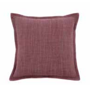
GRANULAR SMALL OXFORD EDGE CUSHION 40 x 40cm