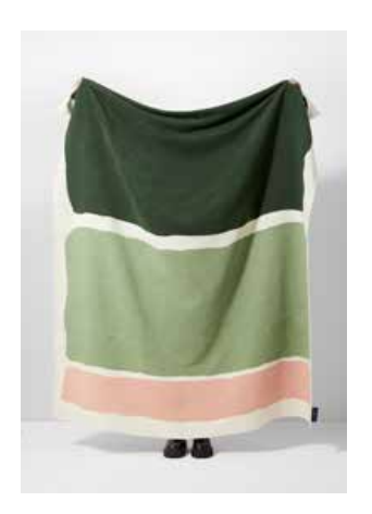
MILTON RECYCLED COTTON THROW