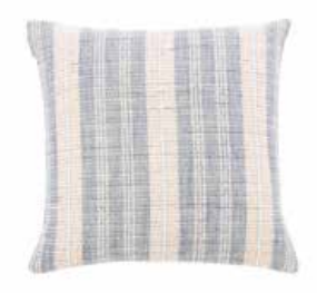
OPAL STRIPE PLAIN CUSHION 40 x 40cm Bluestone/Powder