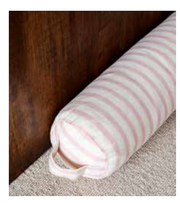
TICKING STRIPE 02 DRAUGHT EXCLUDER 15 x 15 x 92cm Pink