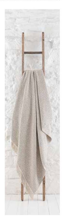
BOUCLÉ RECYCLED COTTON THROW 140 x 140cm