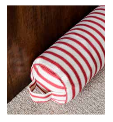
TICKING STRIPE 02 DRAUGHT EXCLUDER 15 x 15 x 92cm Peony DS045-048