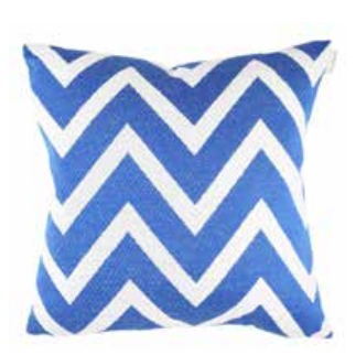
CHEVRON CUSHION 50 x 50cm Cobalt