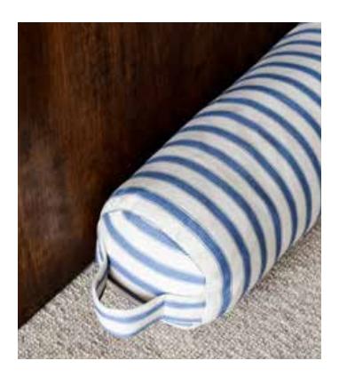
TICKING STRIPE 02 DRAUGHT EXCLUDER 15 x 15 x 92cm AirforceDE045-001

Say goodbye to cold draughts and expensive heating bills! Beautiful and practical, our draught excluders help make sure as much heat stays in your home as possible. All our draught excluders are made in the UK and woven using our signature Ticking striped fabrics.