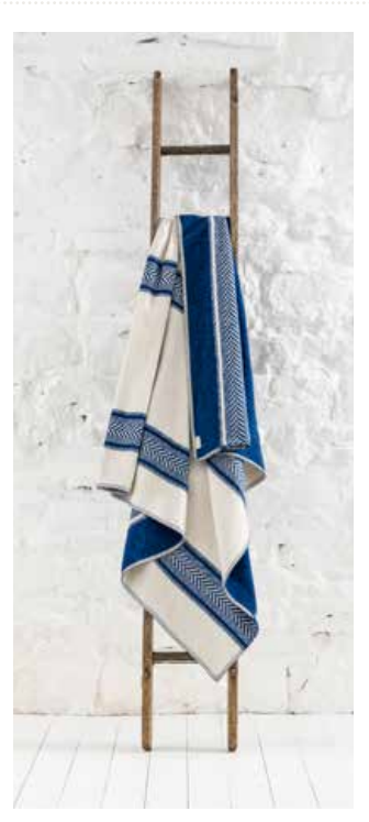
SEASTRIPE RECYCLED COTTON THROW 160 x 190cm Cobalt TH267-191