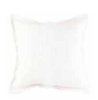
SALCOMBE STRIPE OXFORD EDGE CUSHION 50 x 50cm