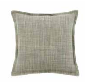
GRANULAR SMALL OXFORD EDGE CUSHION 40 x 40cm