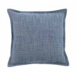
GRANULAR SMALL OXFORD EDGE CUSHION 40 x 40cm

We've developed this collection with calm and sanctuary in mind. Taking inspiration from geological forms and mineral colours, Contour brings a natural softness into the home, but with durability and a timeless, classic style you would expect from Ian Mankin.