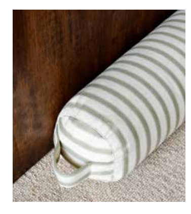
TICKING STRIPE 02 DRAUGHT EXCLUDER 15 x 15 x 92cm Sage