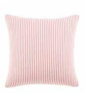
TICKING STRIPE 01 PIPED CUSHION 40 x 40cm