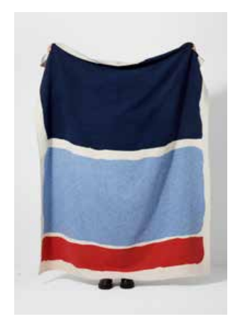
MILTON RECYCLED COTTON THROW