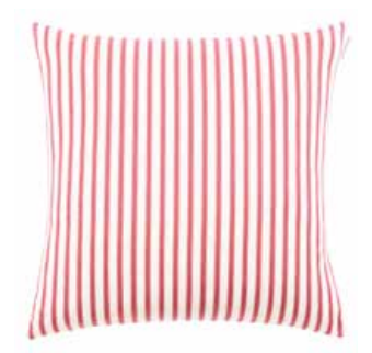
TICKING STRIPE 02 CUSHION 50 x 50cm