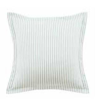
TICKING STRIPE 01 OXFORD EDGE CUSHION 40 x 40cm Seagreen