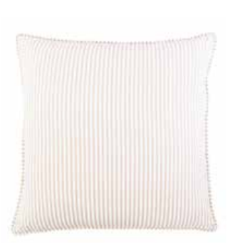
TICKING STRIPE 01 PIPED CUSHION 50 x 50cm Powder