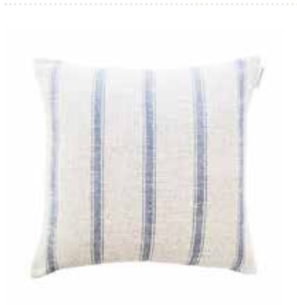
FORFAR & NEWBURY CUSHION 40 x 40cm Bluestone

Traditional styling in contemporary, soothing colours. These chunky textured fabrics are liveable and will endure changing trends with their classic styling.