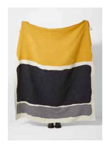
MILTON RECYCLED COTTON THROW