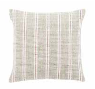
BLOODSTONE STRIPE PLAIN CUSHION 40 x 40cm