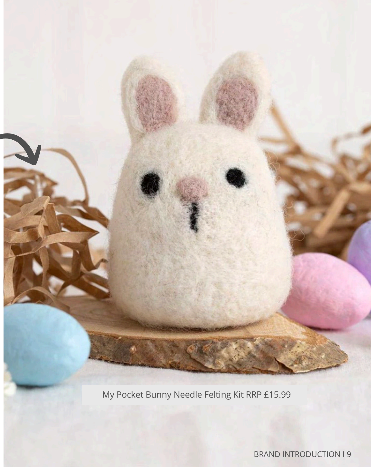
My Pocket Bunny Needle Felting Kit RRP £15.99