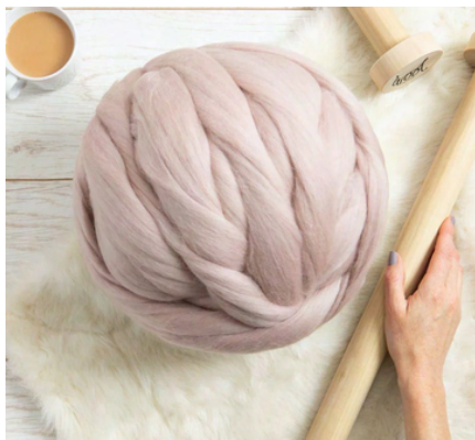
Cheeky Chunky 100% Merino 100g Balls RRP £8.99