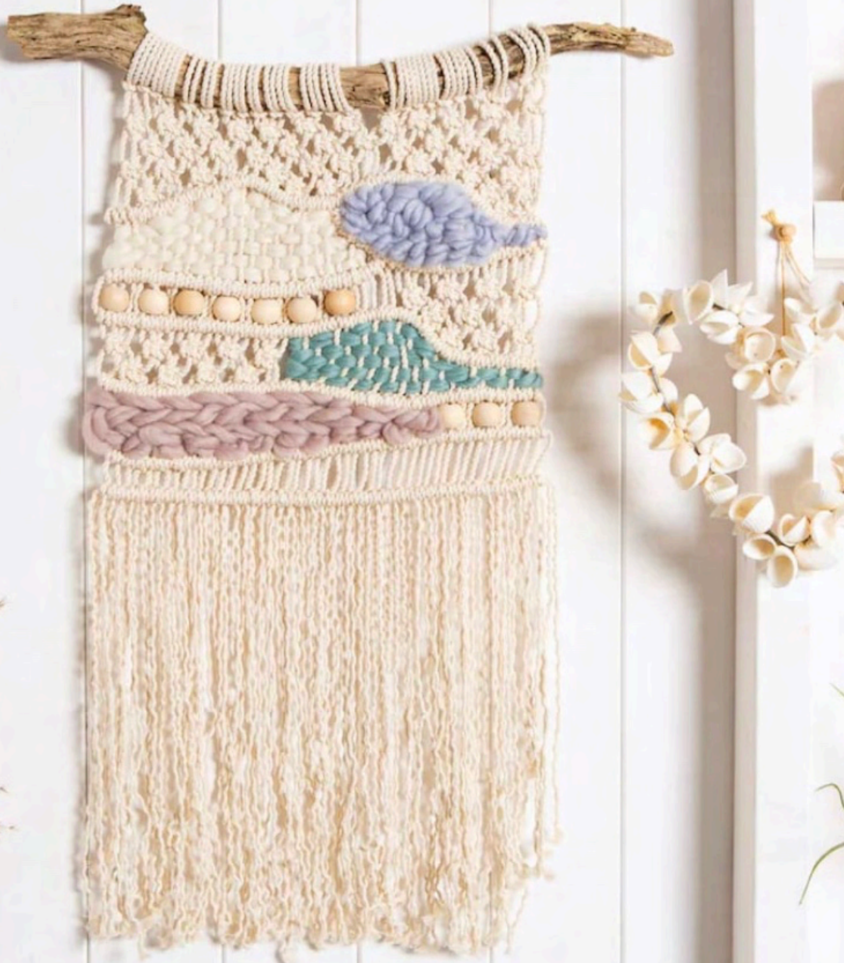
Macrame Weave Craft Kit RRP £39.99

Macrame is a method of crafting a textile or various decorations that use several knots to form a simple or detailed shape, and our kits show you just how! Our kits allow you to create unique designs by hand.