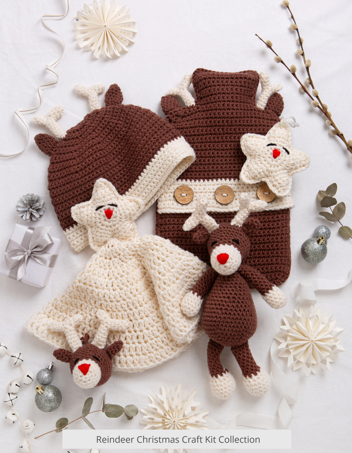
Reindeer Christmas Craft Kit Collection

From reindeer to gonks, we have a huge selection of Christmas Craft Kits that, once made, will be brought out year after year and be full of happy Christmas memories