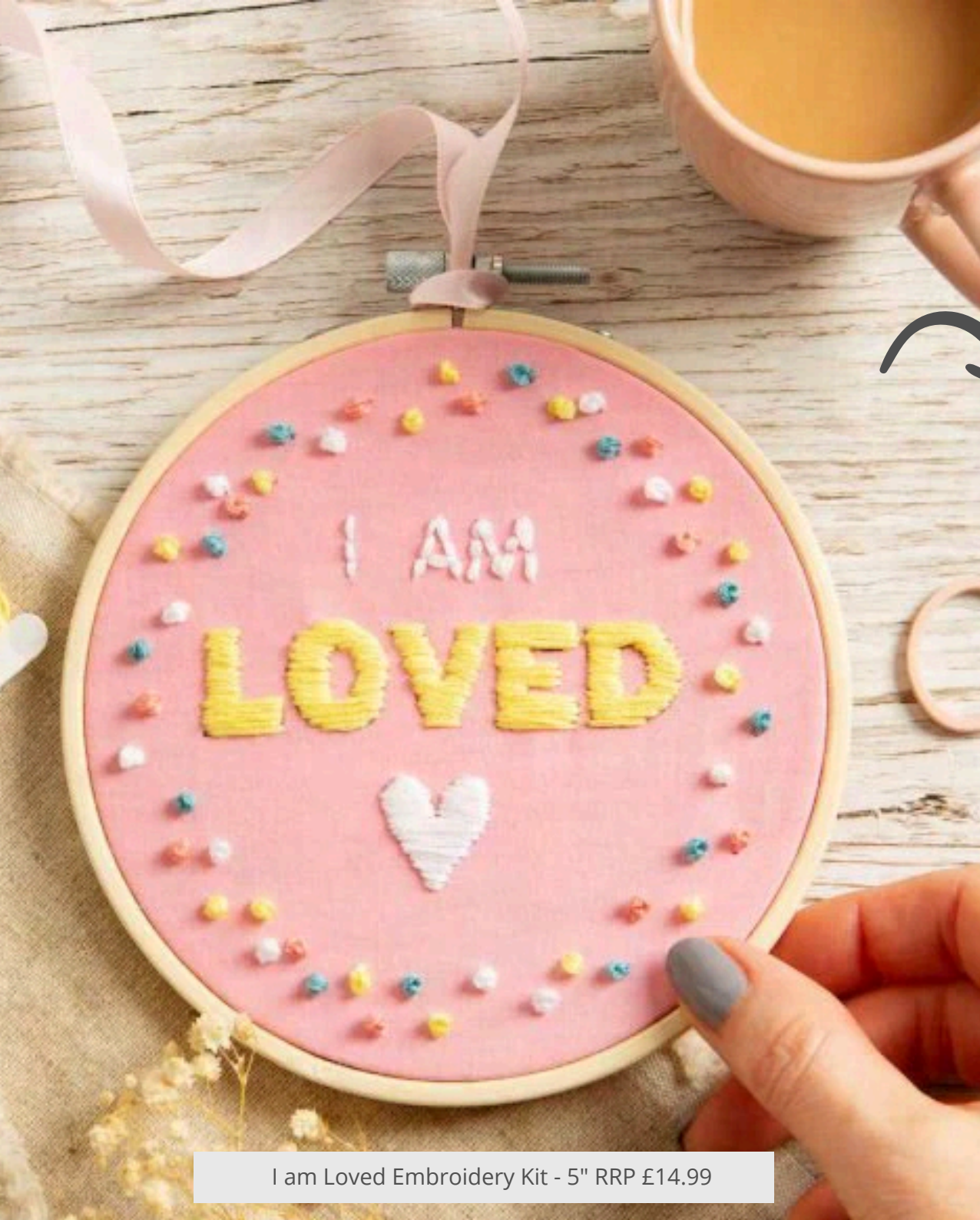
I am Loved Embroidery Kit - 5" RRP £14.99

Create delicate and beautiful designs with our unique embroidery kits. These embroidery kits are perfect for someone just starting out and wanting to learn the basics of embroidery.