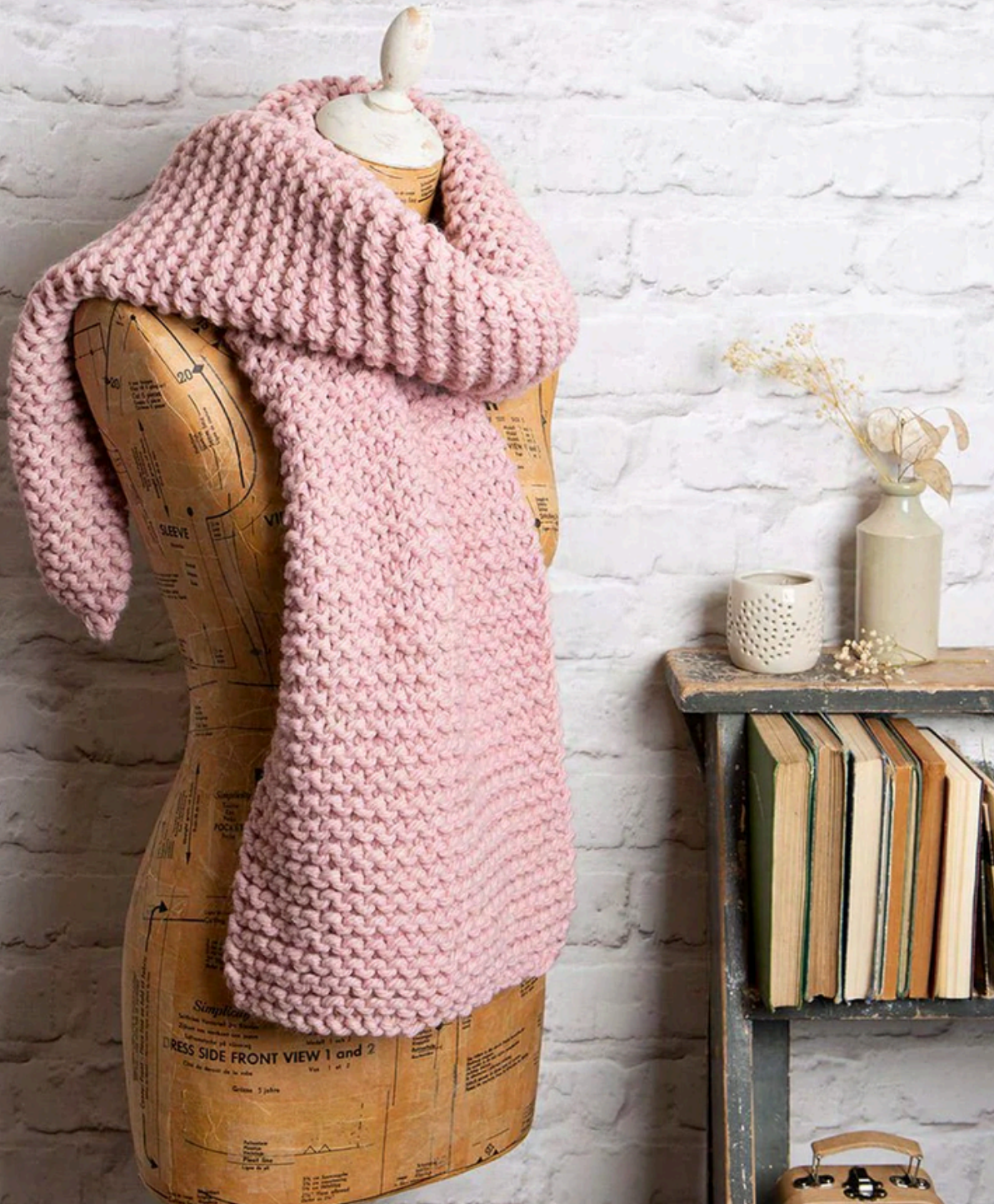
Garter Scarf Knitting Kit RRP £24.99

Unwind with one of our beginner-friendly knit kits. This is the perfect way to start your knitting experience. Aimed at giving knitters a stress-free experience in learning to knit.