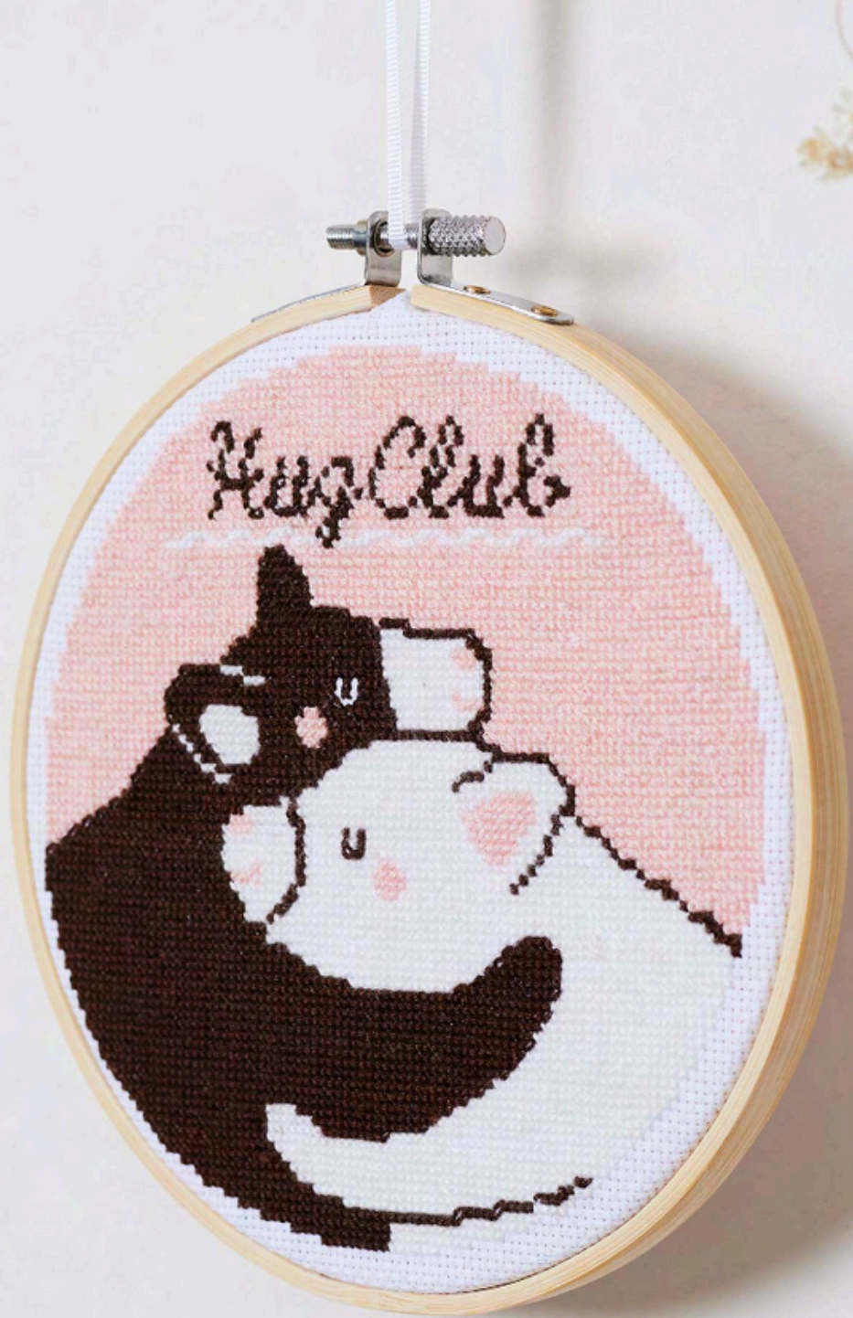
Hug Club Cross Stitch Kit RRP £17.95

Create delicate and beautiful designs with our unique cross stitch kits. These cross stitch kits are perfect for someone just starting out and wanting to learn the basics of cross stitch..