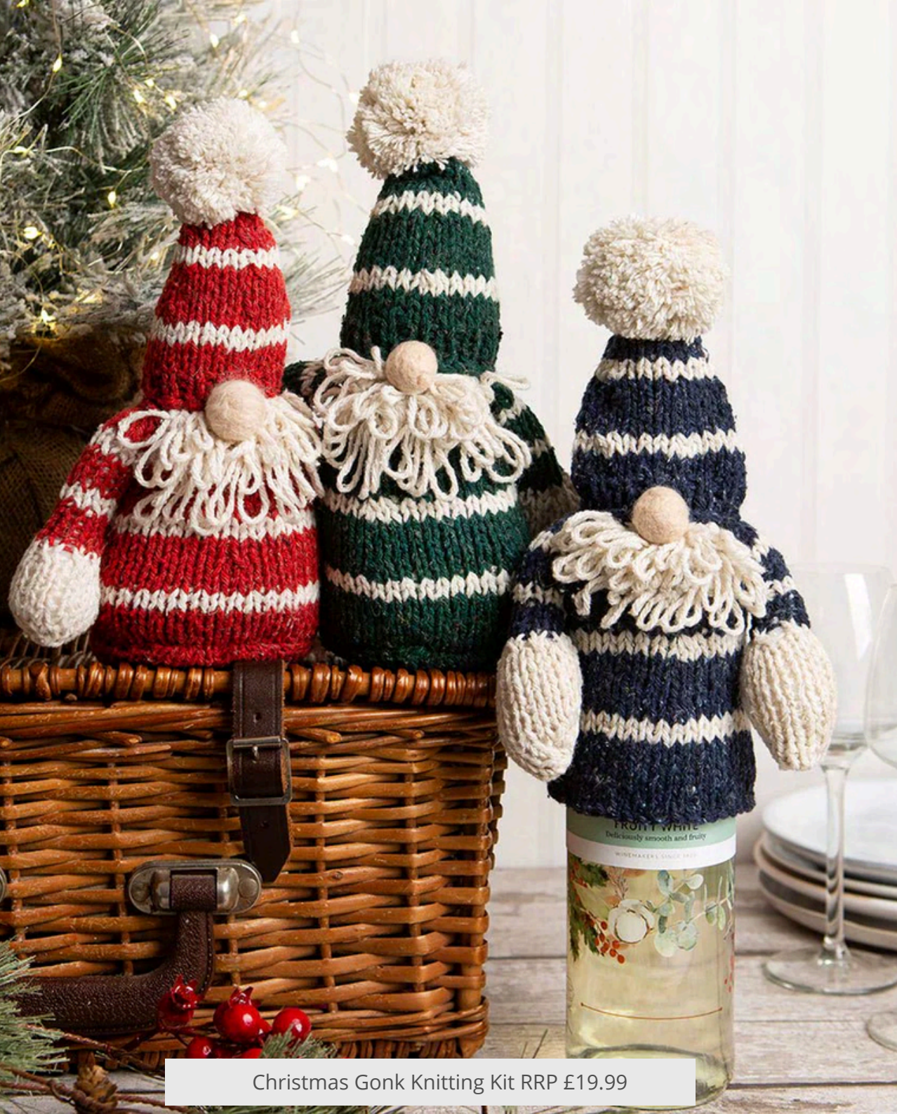
Christmas Gong Knitting Kit RRP £19.99

Are you feeling in the festive spirit? What could be better than handcrafting your decorations and feeling accomplished during the joyful period? These are perfect gifts to make a kick start in knitting or treating an advanced knitting lover.