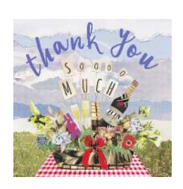
Thank You So Much 150mm x 150mm LC 19