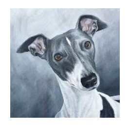
Benji 150mm x 150mm VT 32