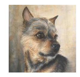
Blue 150mm x 150mm VT 35

All cards are blank inside and are individually cello wrapped with an envelope.