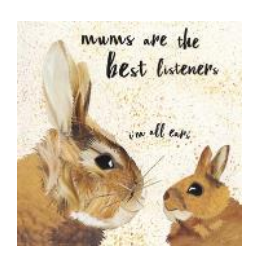
I'm All Ears 150mm x 150mm LC 15