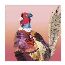
Pheasant 150mm x 150mm LC 04