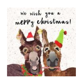
Merry Christmas Donkeys 150mm x 150mm LC 38