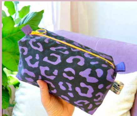
BOXY COSMETIC BAG