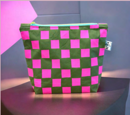
LARGE COSMETIC BAG