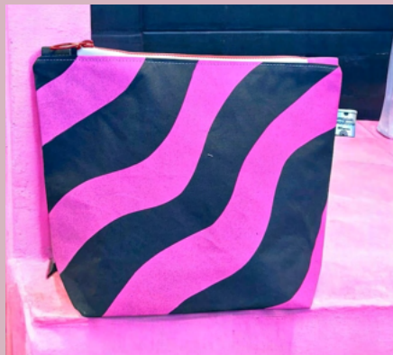
LARGE COSMETIC BAG