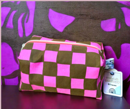
BOXY COSMETIC BAG