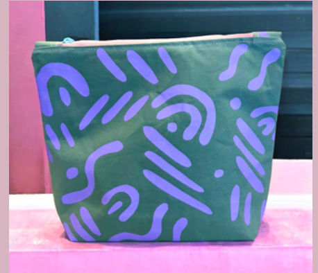
LARGE COSMETIC BAG