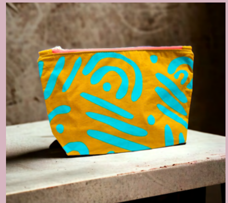
SMALL COSMETIC BAG