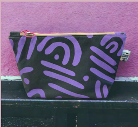
SMALL COSMETIC BAG