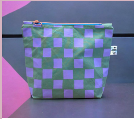
LARGE COSMETIC BAG