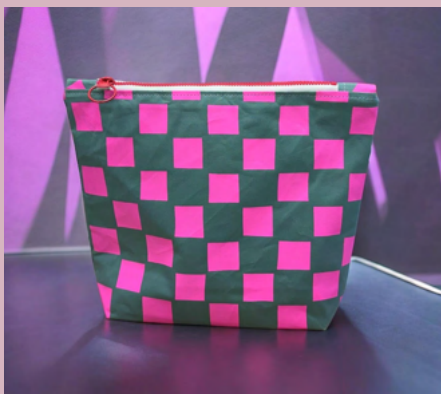
LARGE COSMETIC BAG