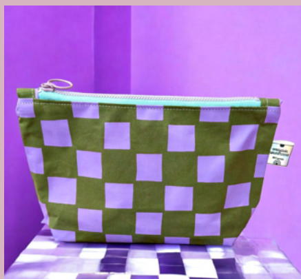
SMALL COSMETIC BAG