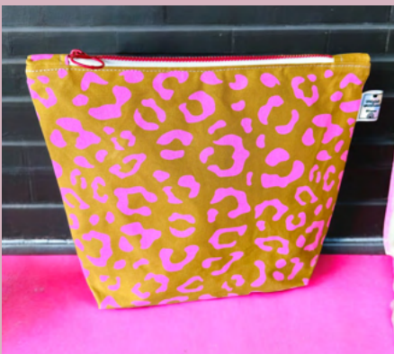
LARGE COSMETIC BAG