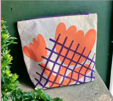
LARGE COSMETIC BAG