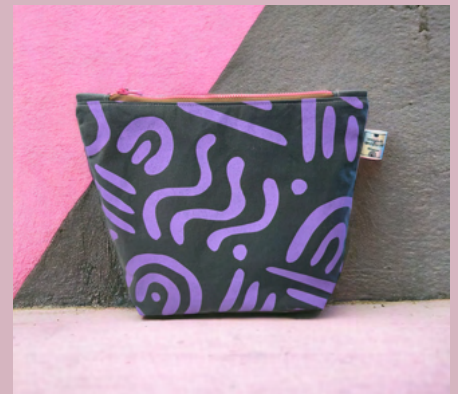
LARGE COSMETIC BAG