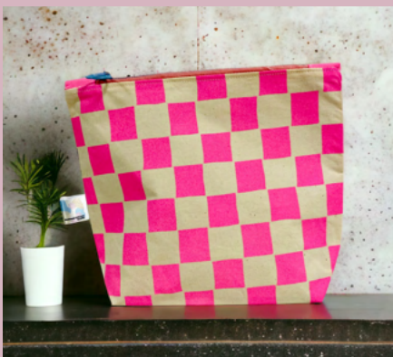
LARGE COSMETIC BAG