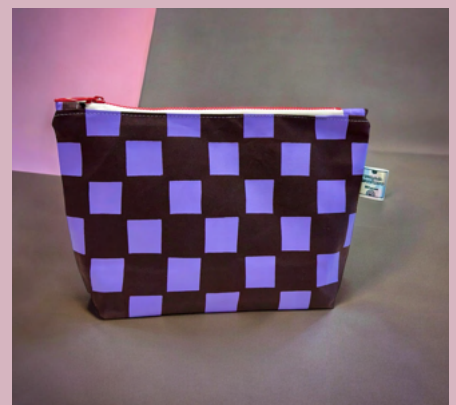
SMALL COSMETIC BAG