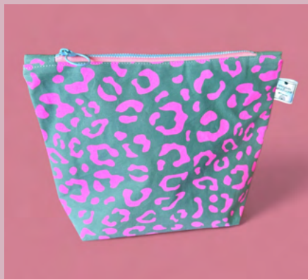
LARGE COSMETIC BAG