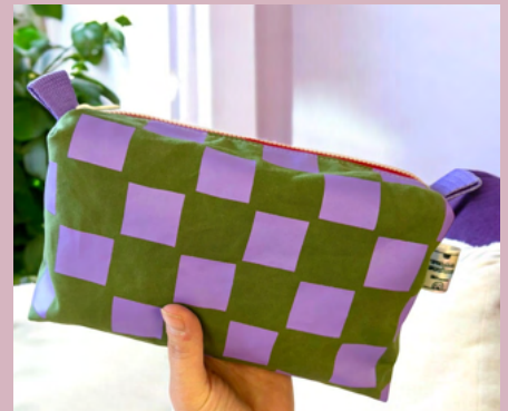
BOXY COSMETIC BAG