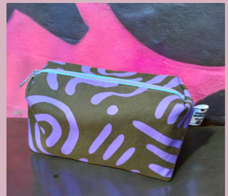
BOXY COSMETIC BAG