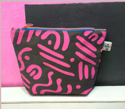
LARGE COSMETIC BAG