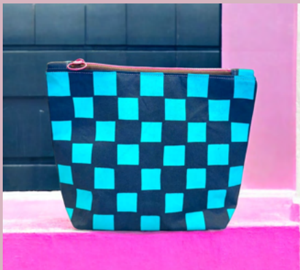
LARGE COSMETIC BAG