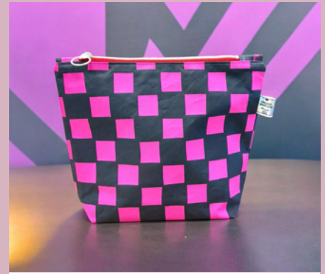
LARGE COSMETIC BAG