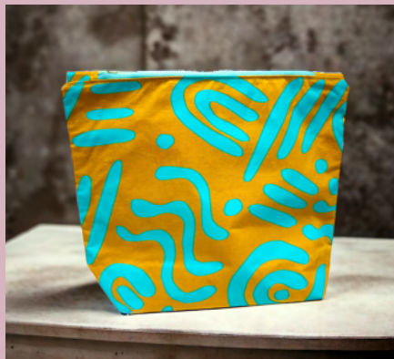
LARGE COSMETIC BAG