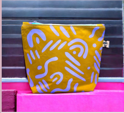
LARGE COSMETIC BAG