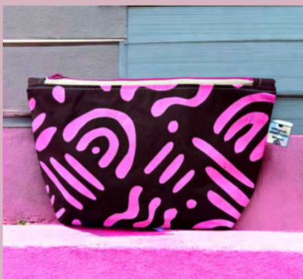
SMALL COSMETIC BAG