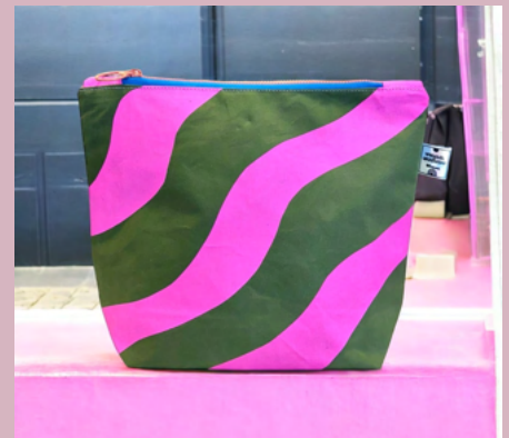
LARGE COSMETIC BAG