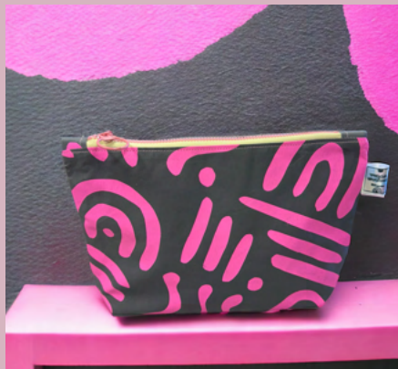
SMALL COSMETIC BAG