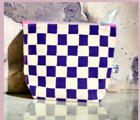
LARGE COSMETIC BAG