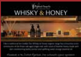
HSC/12/POS (Whisky & Honey)