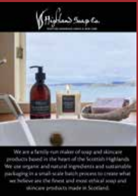
HSC/14/POS (Wild Scottish Raspberry fragrance)