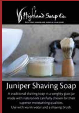
HSC/POS (Shaving kit)