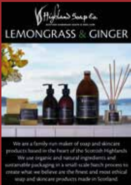
HSC/06/POS (Lemongrass & Ginger fragrance)