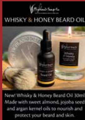
HSC/B012/POS (Beard oil)