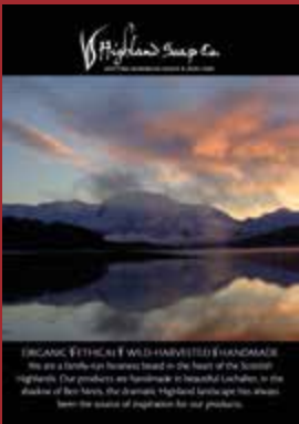
HSC/POS (Highland Scene)