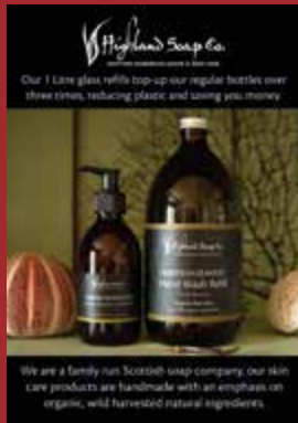
HSC/03/1L/POS (1L glass refill bottle beside small bottle)