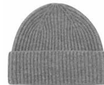
CAHAT01-G GREY MELANGE