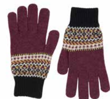
GLOVE104 OXBLOOD MIX