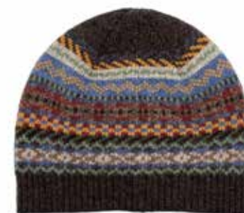
HAT-713 PEAT MIX

Made from 100% Lambswool. This Premium Collection is crafted in Scotland using the finest fibres. The luxurious yarn creates a durable accessory which is naturally soft and warm.