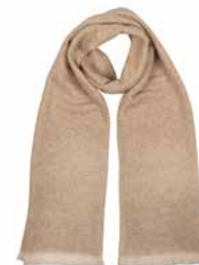
CIG65 PLAIN PEBBLE