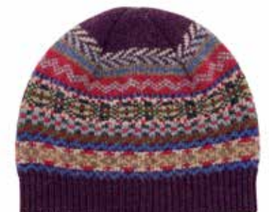
HAT-715 OXBLOOD MIX