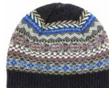
HAT-714 BLUE MIX