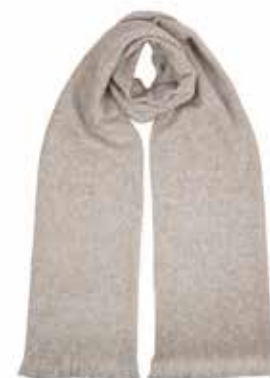
CIG64 PLAIN SILVER

Made from 100% Merino Wool. This Premium Collection is crafted in Mongolia using the finest Merino. The luxurious yarn creates the softest lightweight accessories which are naturally breathable and sustainable. Measures 48 x 200cm