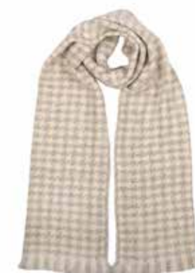
CIG68 SILVER DOGTOOTH