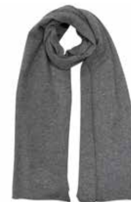
CASCAR02-G GREY MELANGE