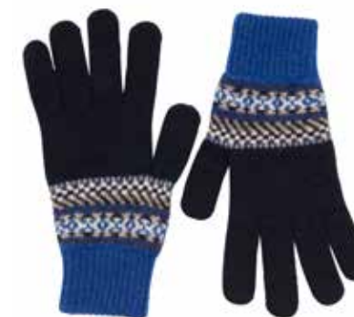
GLOVE103 BLUE MIX