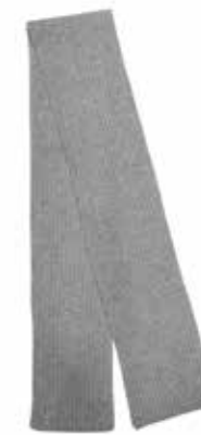
CASCAR01-G GREY MELANGE