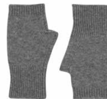
CAHAND01-G GREY MELANGE