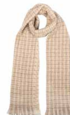
CIG67 OATMEAL CHECK