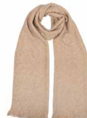
CIG66 PLAIN OATMEAL