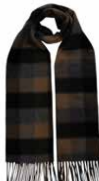
CASCAR09 Charcoal 100% Cashmere