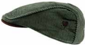
HAT-800 Olive Green 100% Cotton