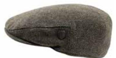
HAT-724 Brown Herringbone 100% Wool