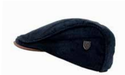
HAT-799 Black 100% Cotton