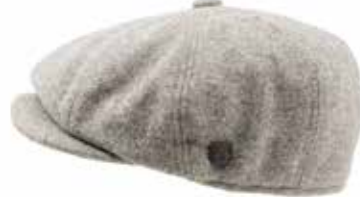
HAT-729 Silver 60% Wool / 40% Polyester