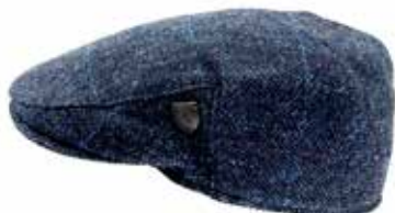
HAT-798 Blue Box Check 50% Wool/ 50% Polyester