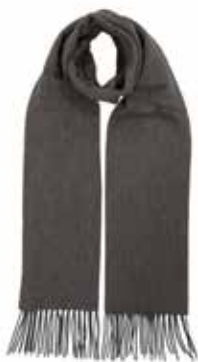
CASCAR05 Silver 100% Cashmere