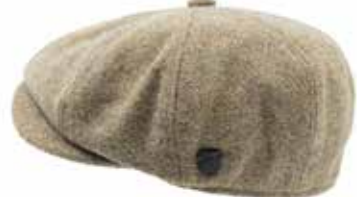
HAT-730 Olive 60% Wool / 40% Polyester