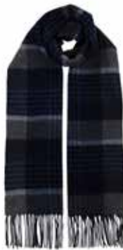
CASCAR07 Blue 100% Cashmere