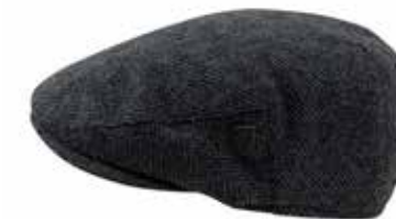
HAT-723 Grey Herringbone 100% Wool