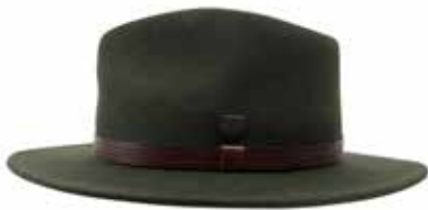
HAT-734 Green 100% Wool