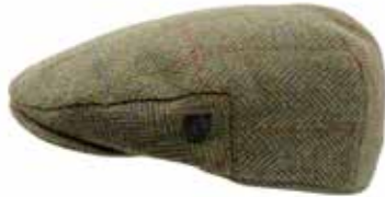
HAT-732 Kiwi Box Check 60% Wool/ 40% Polyester