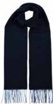
CASCAR06 Blue 100% Cashmere