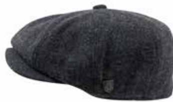
HAT-728 Charcoal 60% Wool / 40% Polyester