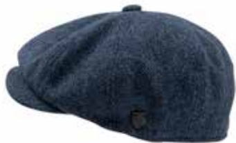
HAT-725 Blue Herringbone 100% Wool