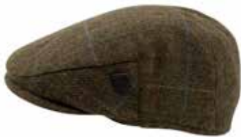
HAT-731 Brown Box Check 100% Wool