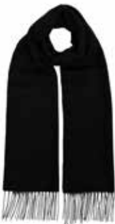
CASCAR04 Charcoal 100% Cashmere