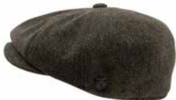
HAT-727 Brown Herringbone 100% Wool