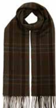
CASCAR08 Olive 100% Cashmere