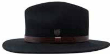
HAT-733 Black 100% Wool