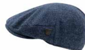
HAT-722 Blue Herringbone 100% Wool