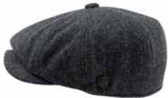
HAT-726 Grey Herringbone 100% Wool