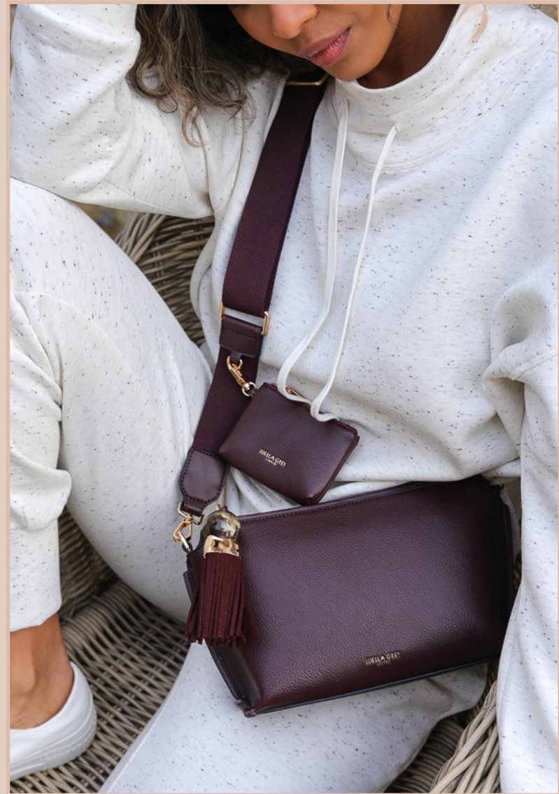
FRANKIE Weekend Crossbody Cherry