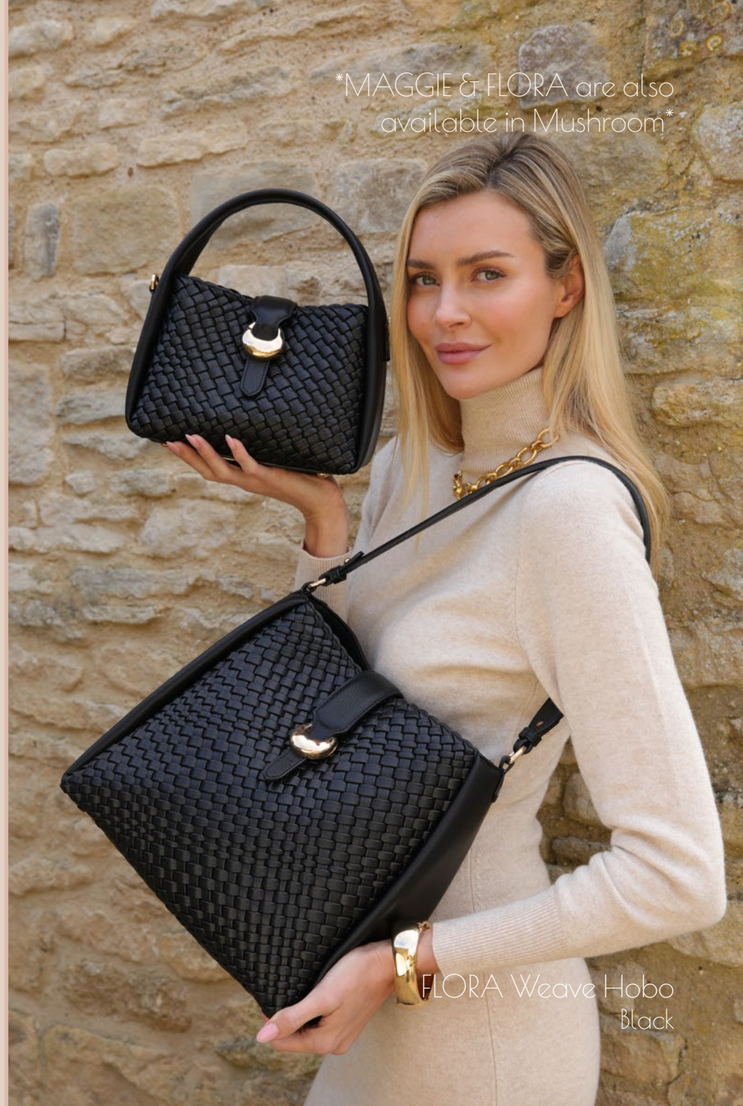
FLORA Weave Hobo Black

*MAGGIE & FLORA are also available in Mushroom*