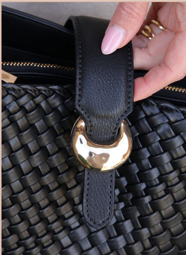
The CANNON STREET Clasp Molten Metal

*MAGGIE & FLORA are also available in Mushroom*