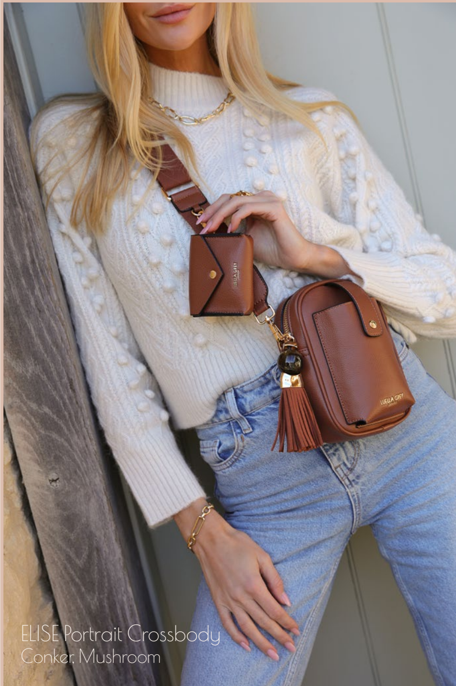
ELISE Portrait Crossbody Conker, Mushroom