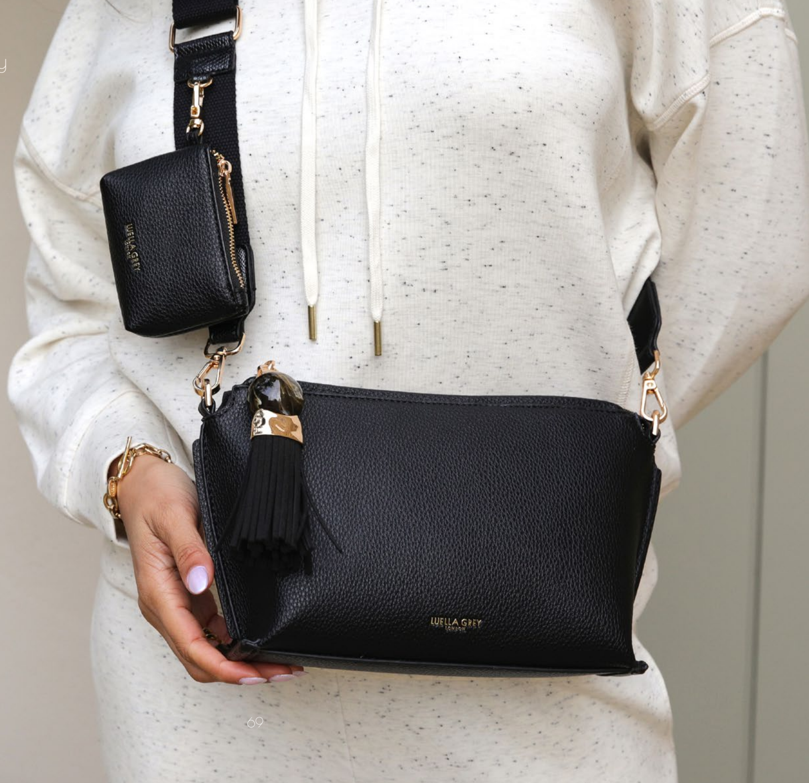
FRANKIE Weekend Crossbody Black