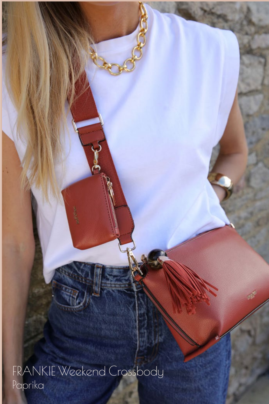
FRANKIE Weekend Crossbody Paprika