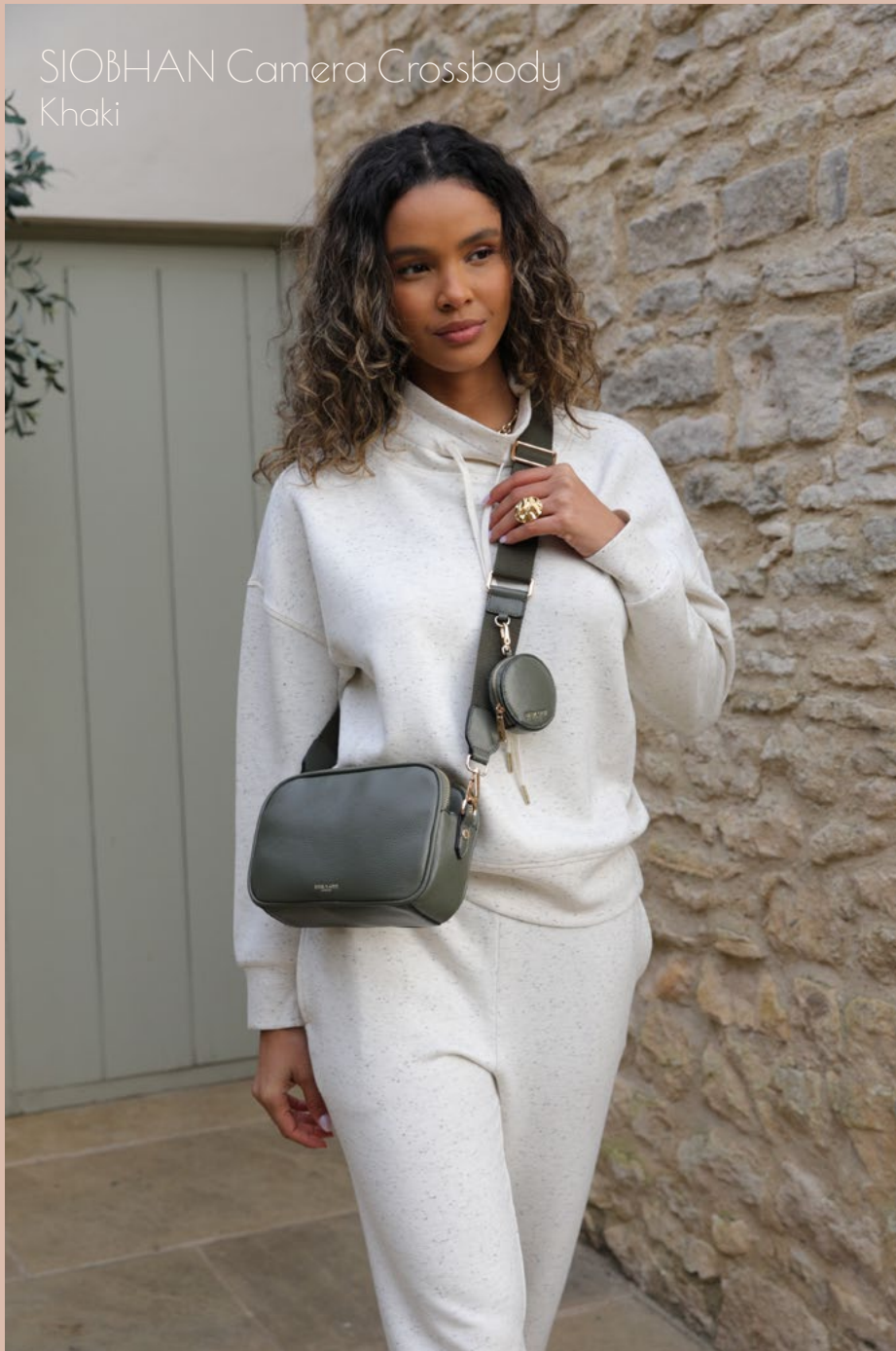
SIOBHAN Camera Crossbody Khaki