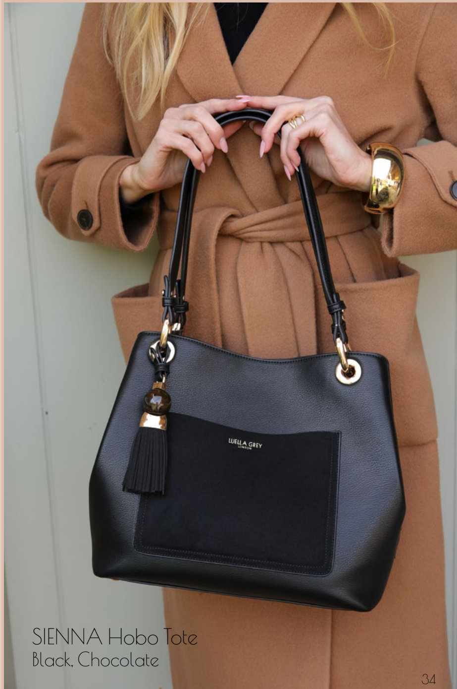
SIENNA Hobo Tote Black, Chocolate