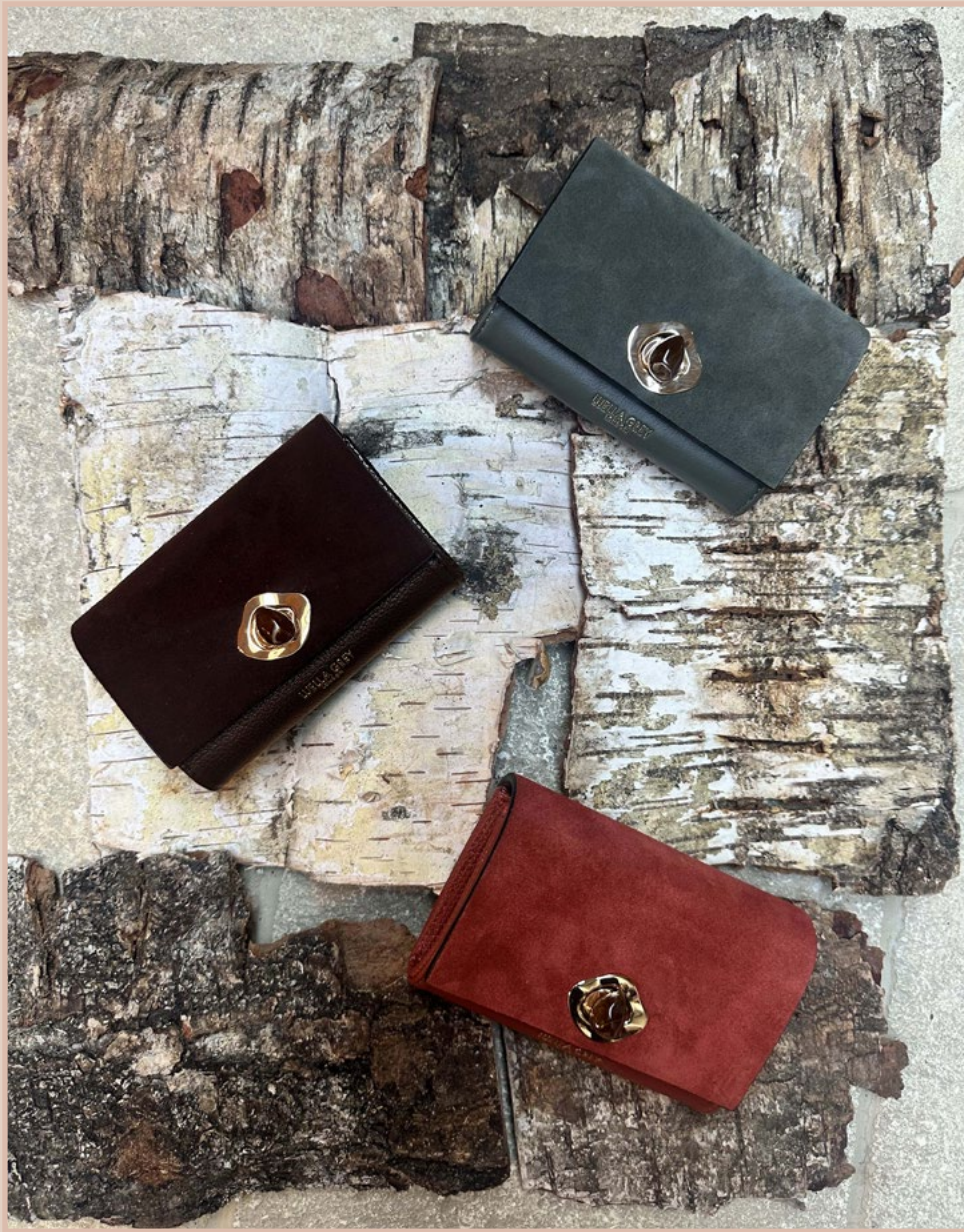
JENNY Purse Khaki, Chocolate, Paprika