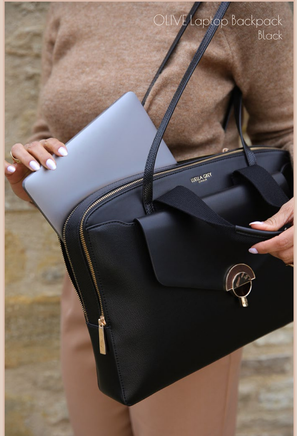
OLIVE Laptop Backpack Black