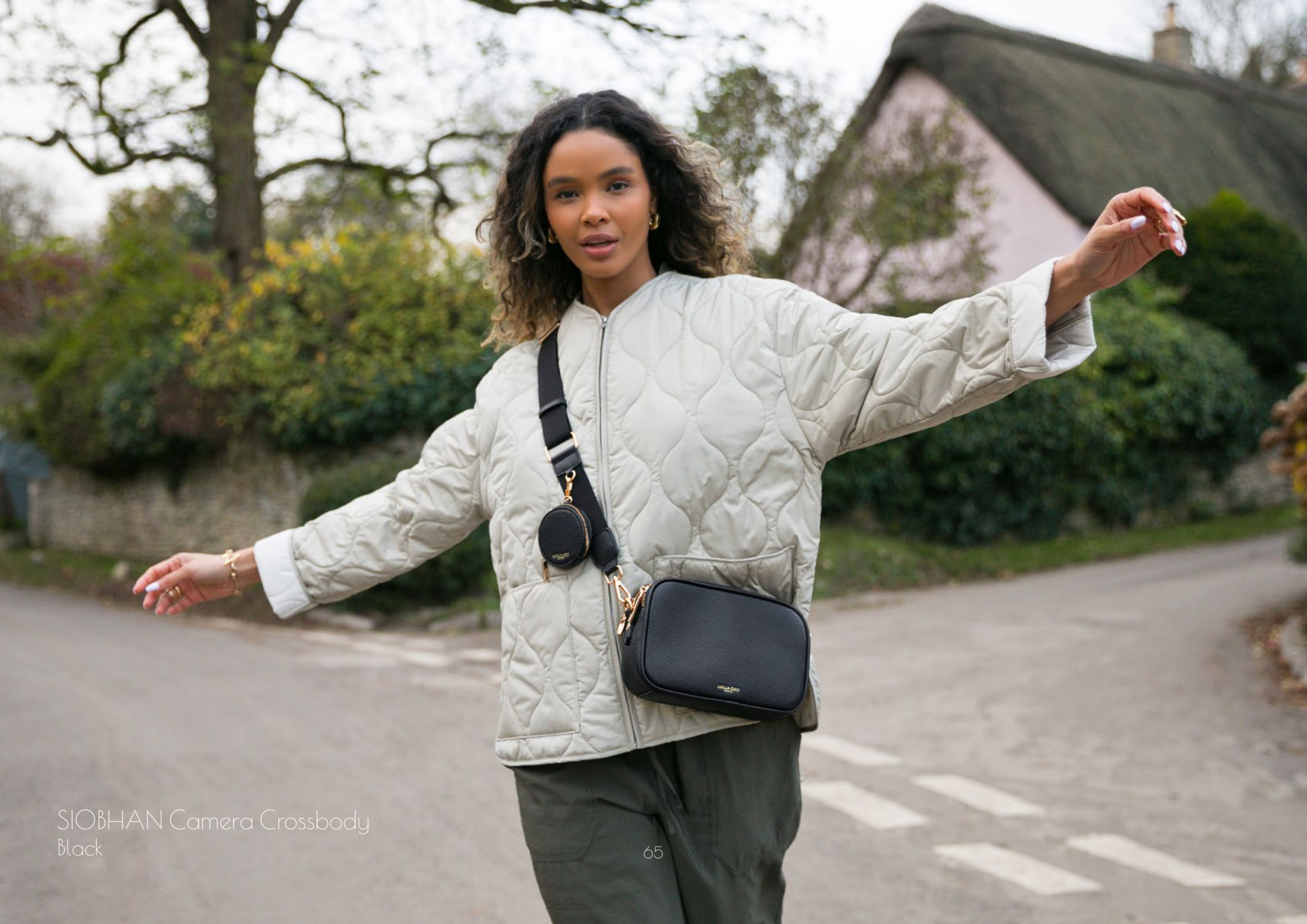
SIOBHAN Camera Crossbody Black