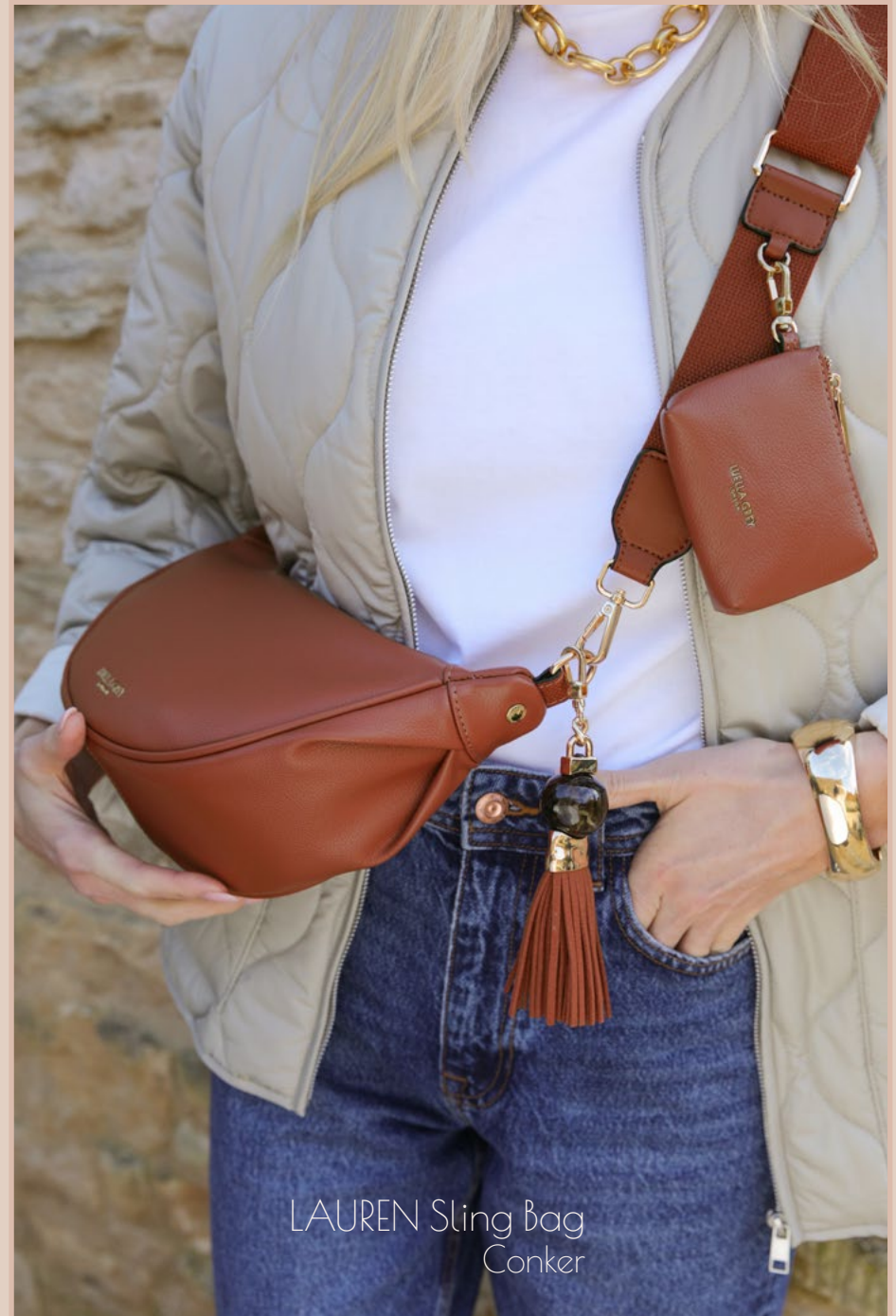
LAUREN Sling Bag Conker