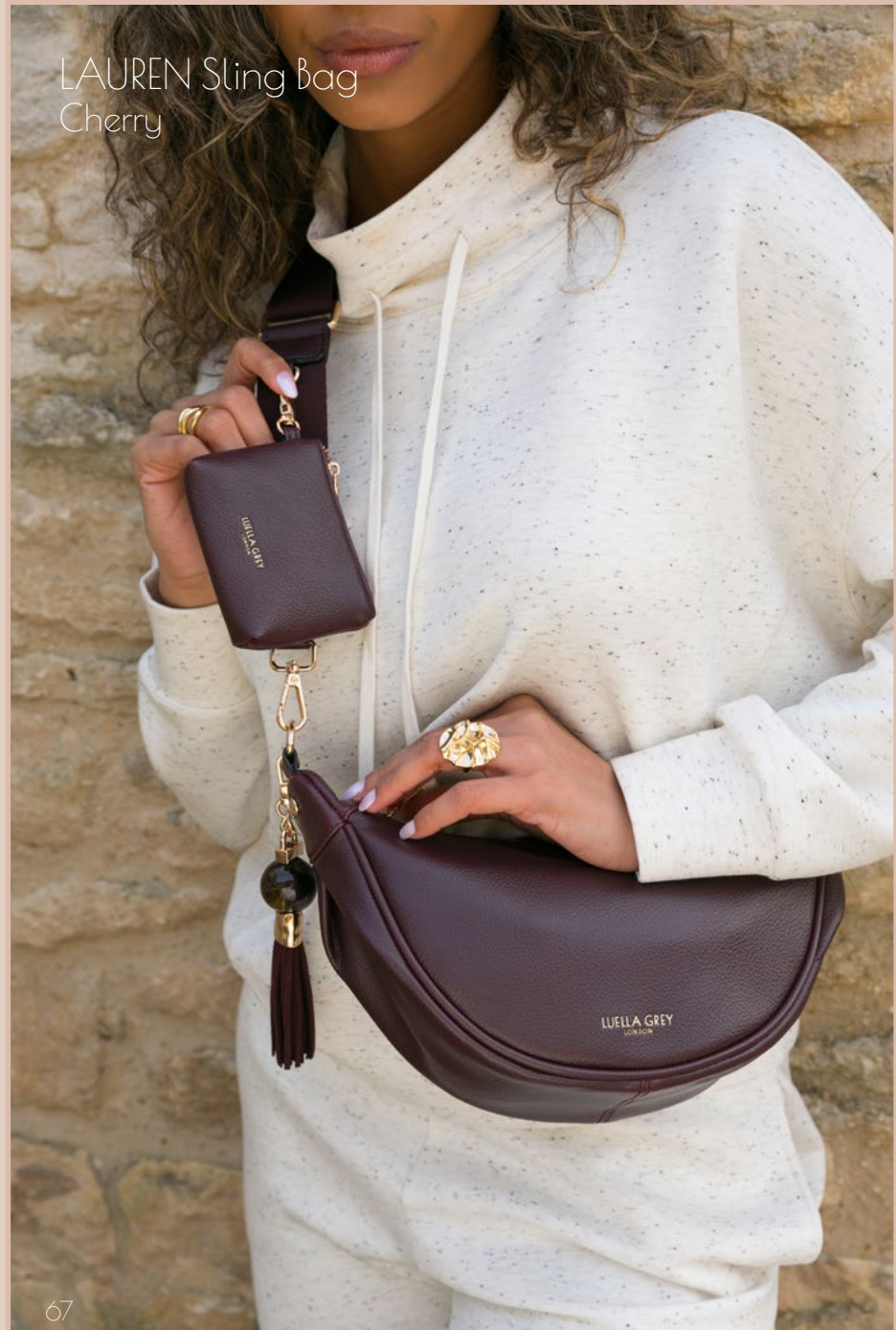
LAUREN Sling Bag Cherry