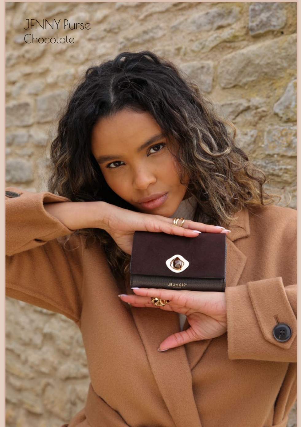
JENNY Purse Chocolate