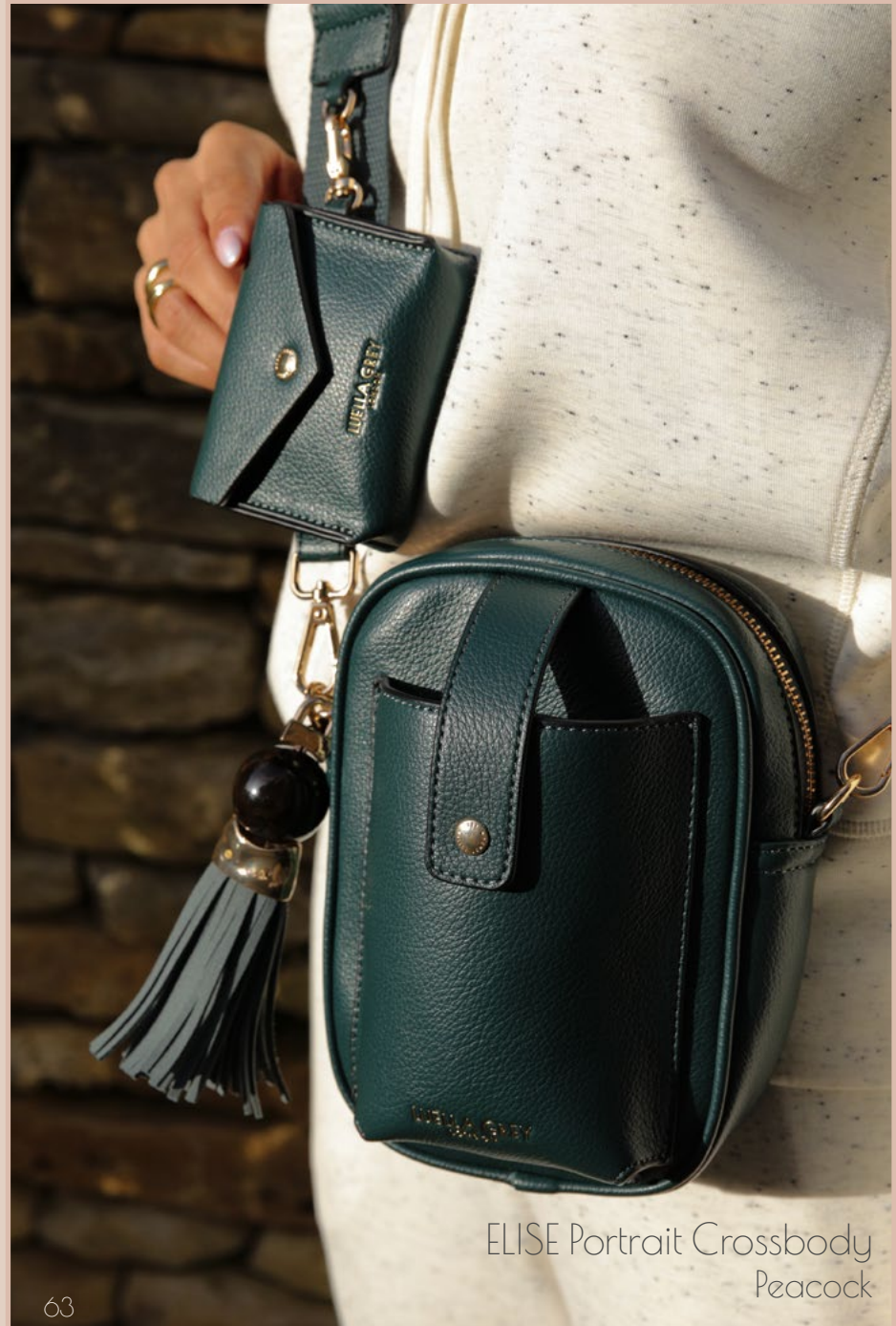
ELISE Portrait Crossbody Peacock