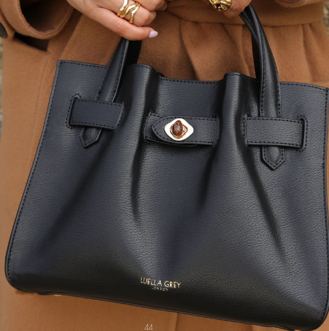
BONNIE Tote Black