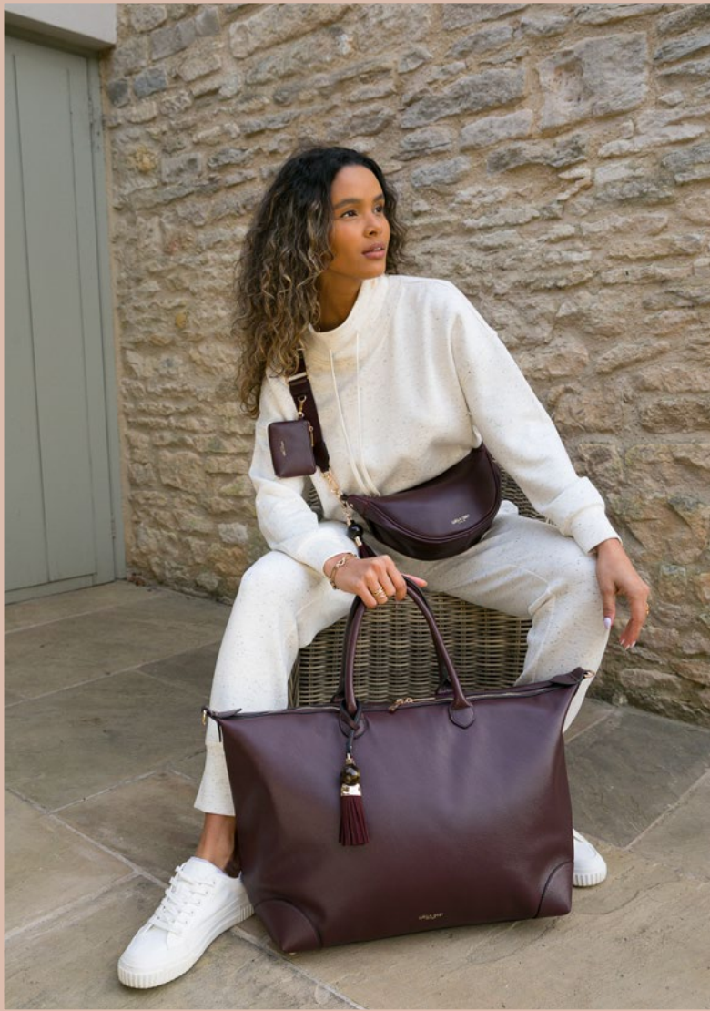
LANA Travel Weekender Cherry