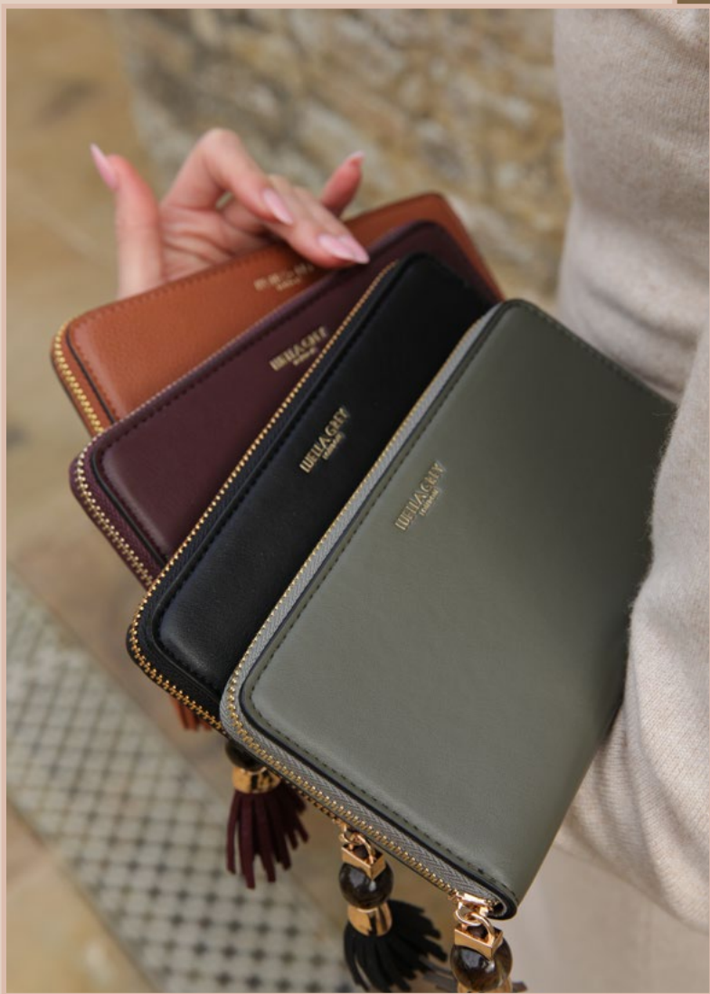
MURTLE Large Tassel Purse Khaki, Black, Cherry, Conker