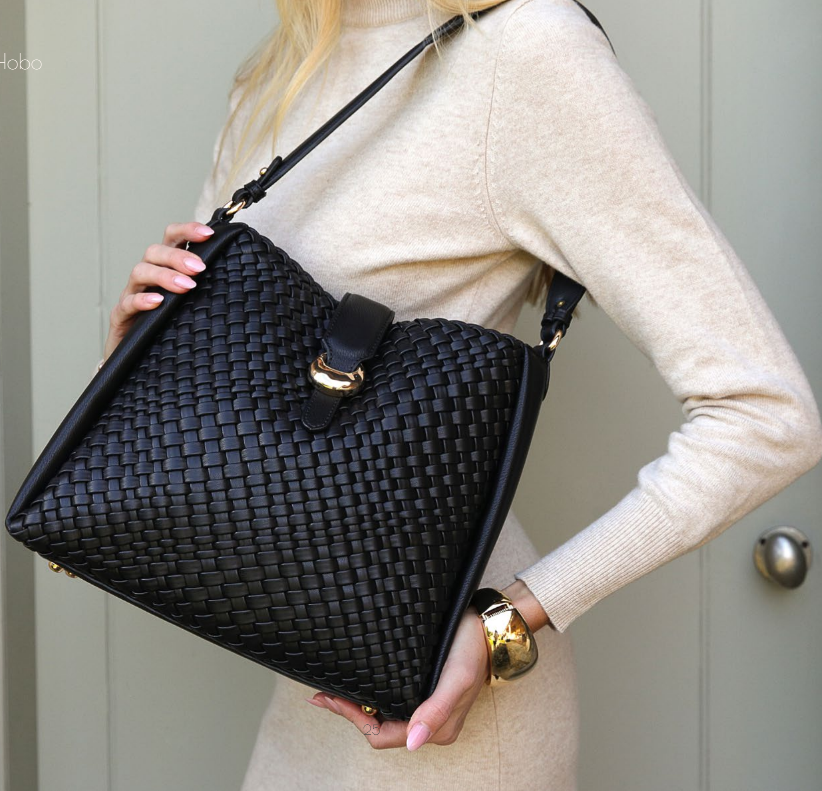
FLORA Weave Hobo Black