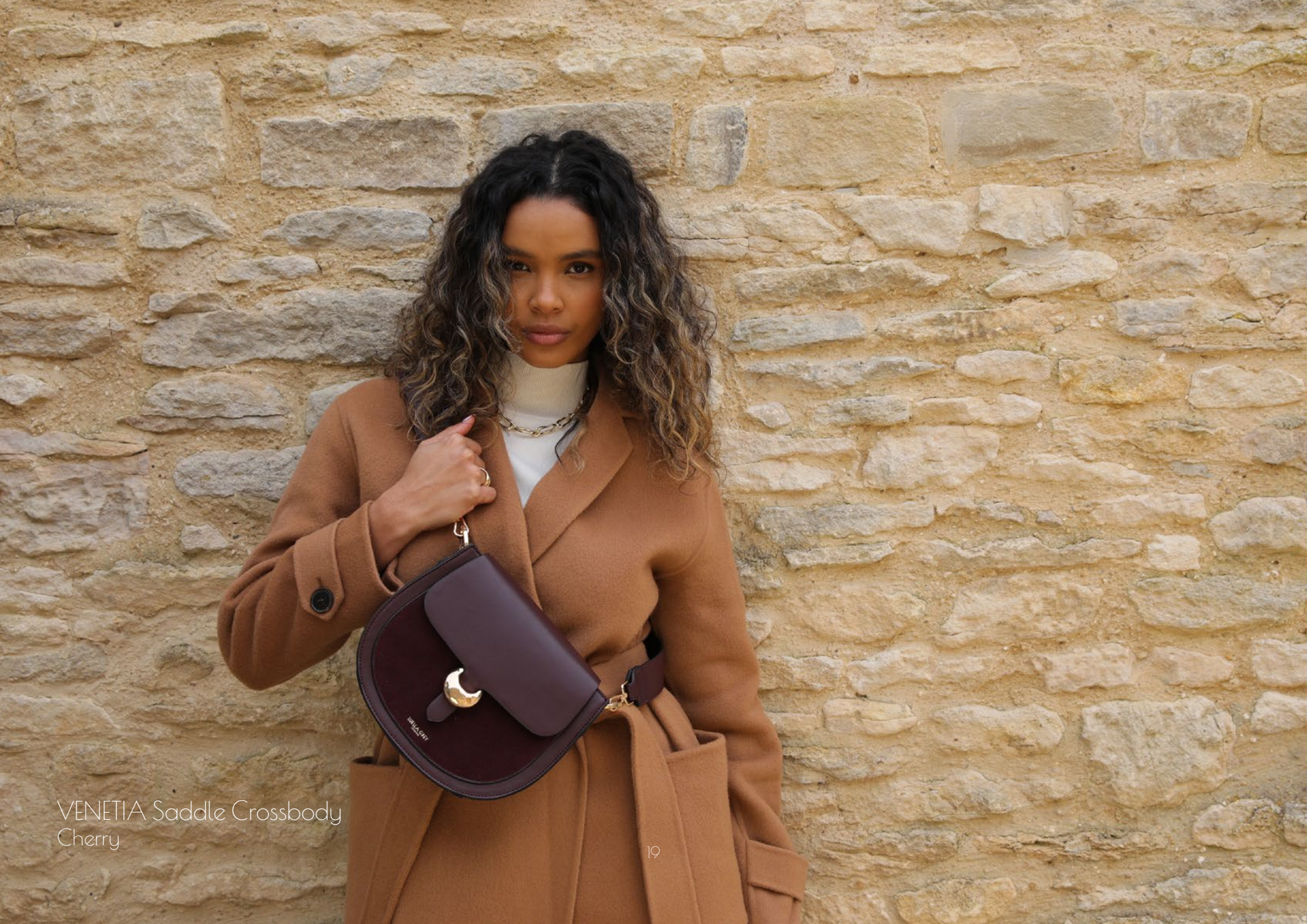
VENETIA Saddle Crossbody Cherry