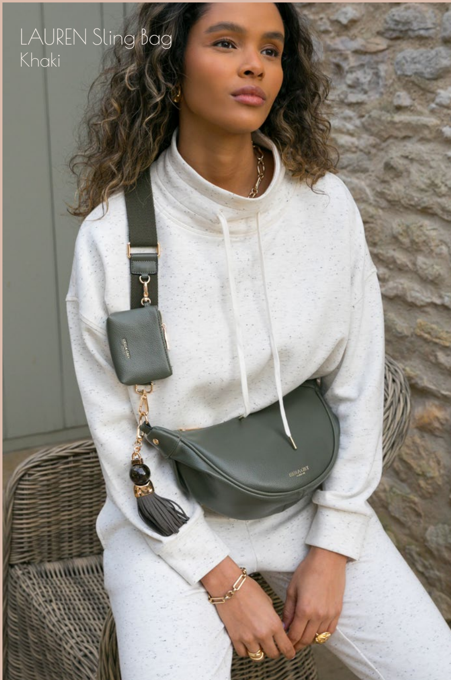
LAUREN Sling Bag Khaki