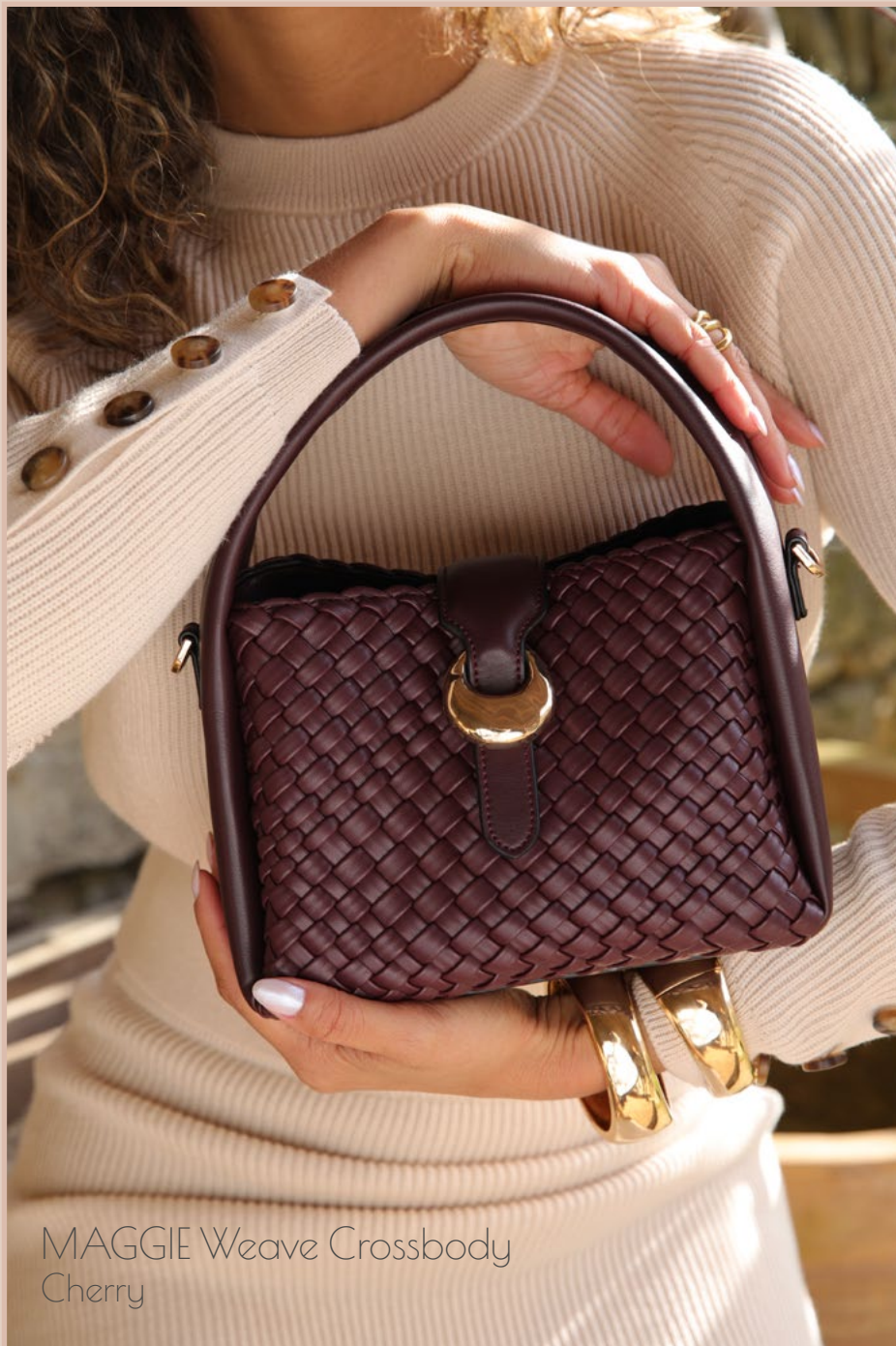
MAGGIE Weave Crossbody Cherry