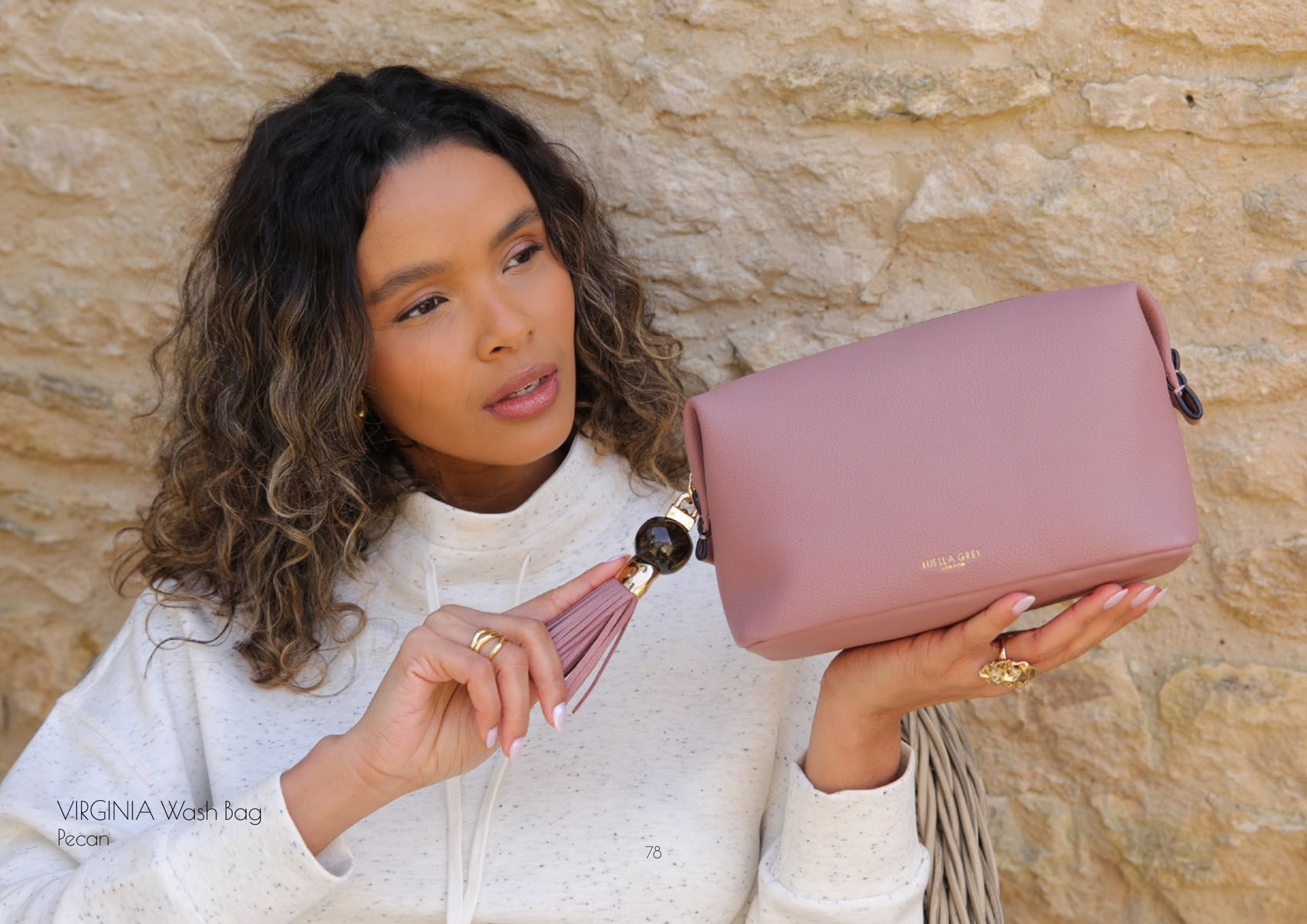
VIRGINIA Wash Bag Pecan