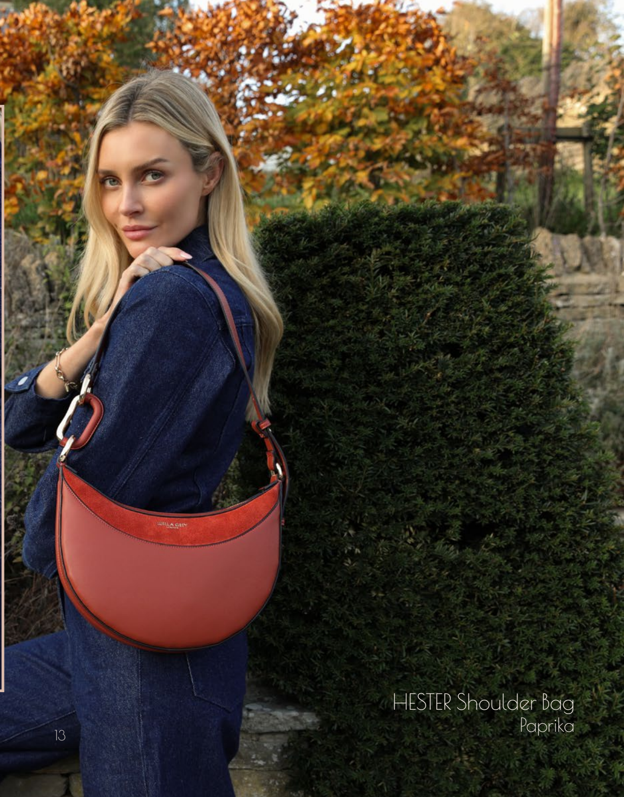
HESTER Shoulder Bag Paprika