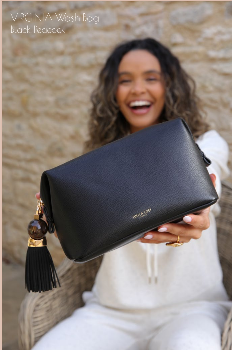
VIRGINIA Wash Bag Black, Peacock