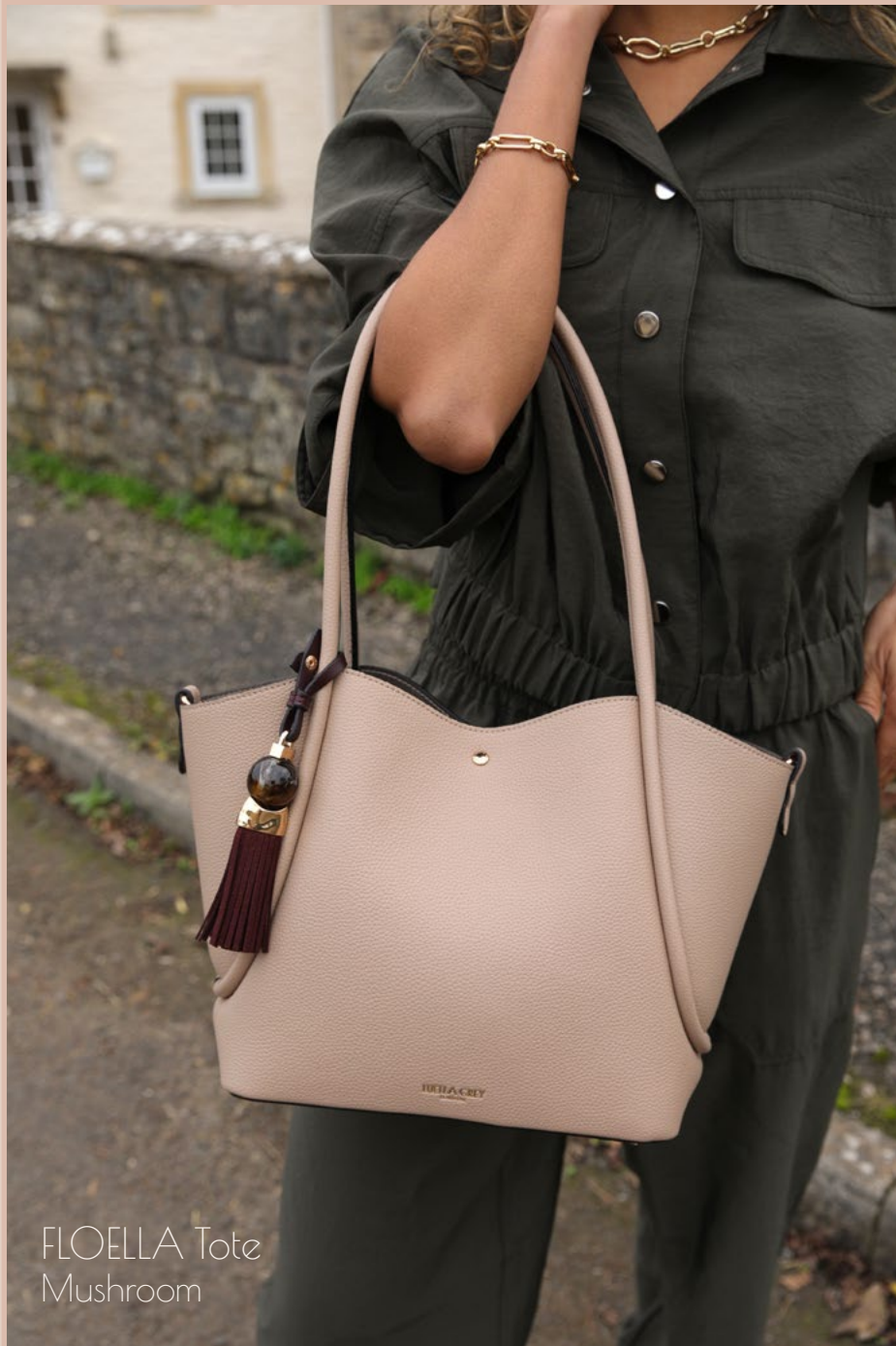
FLOELLA Tote Mushroom