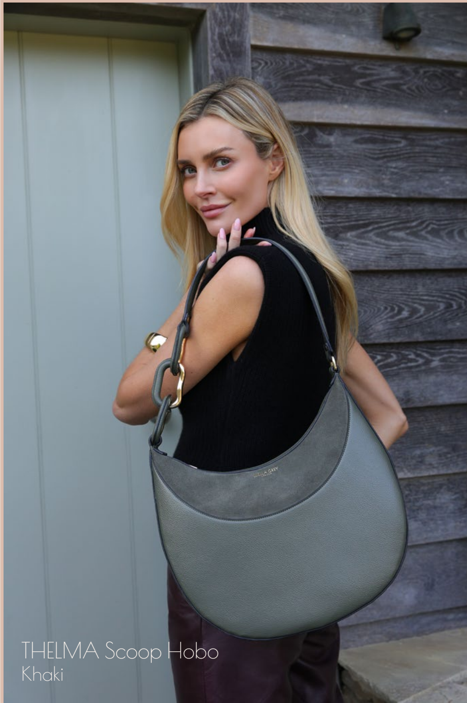
THELMA Scoop Hobo Khaki