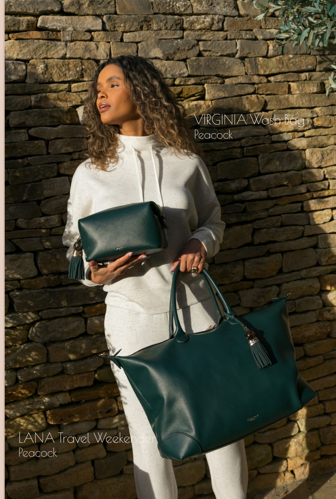
VIRGINIA Wash Bag Peacock