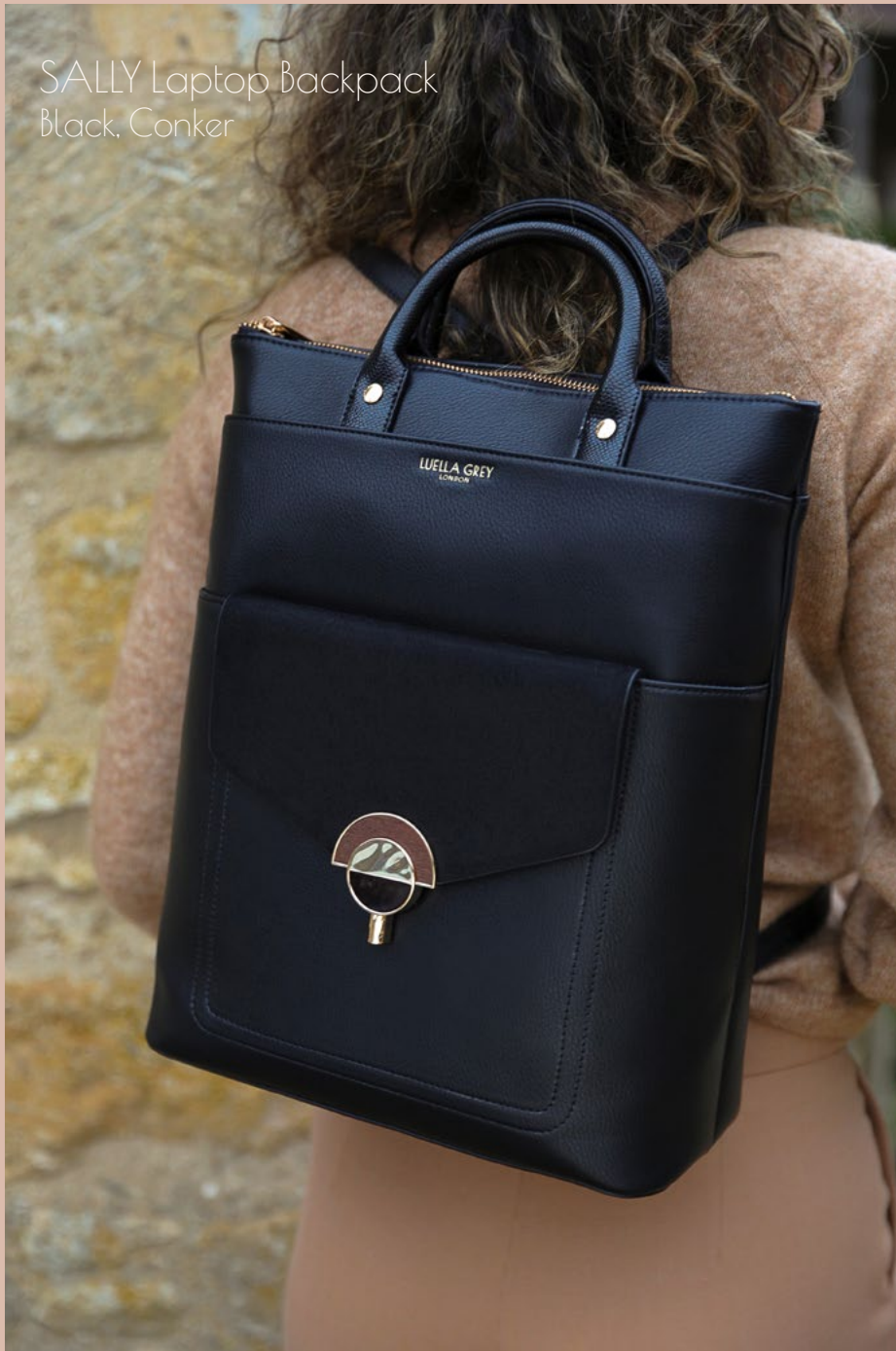
SALLY Laptop Backpack Black, Conker