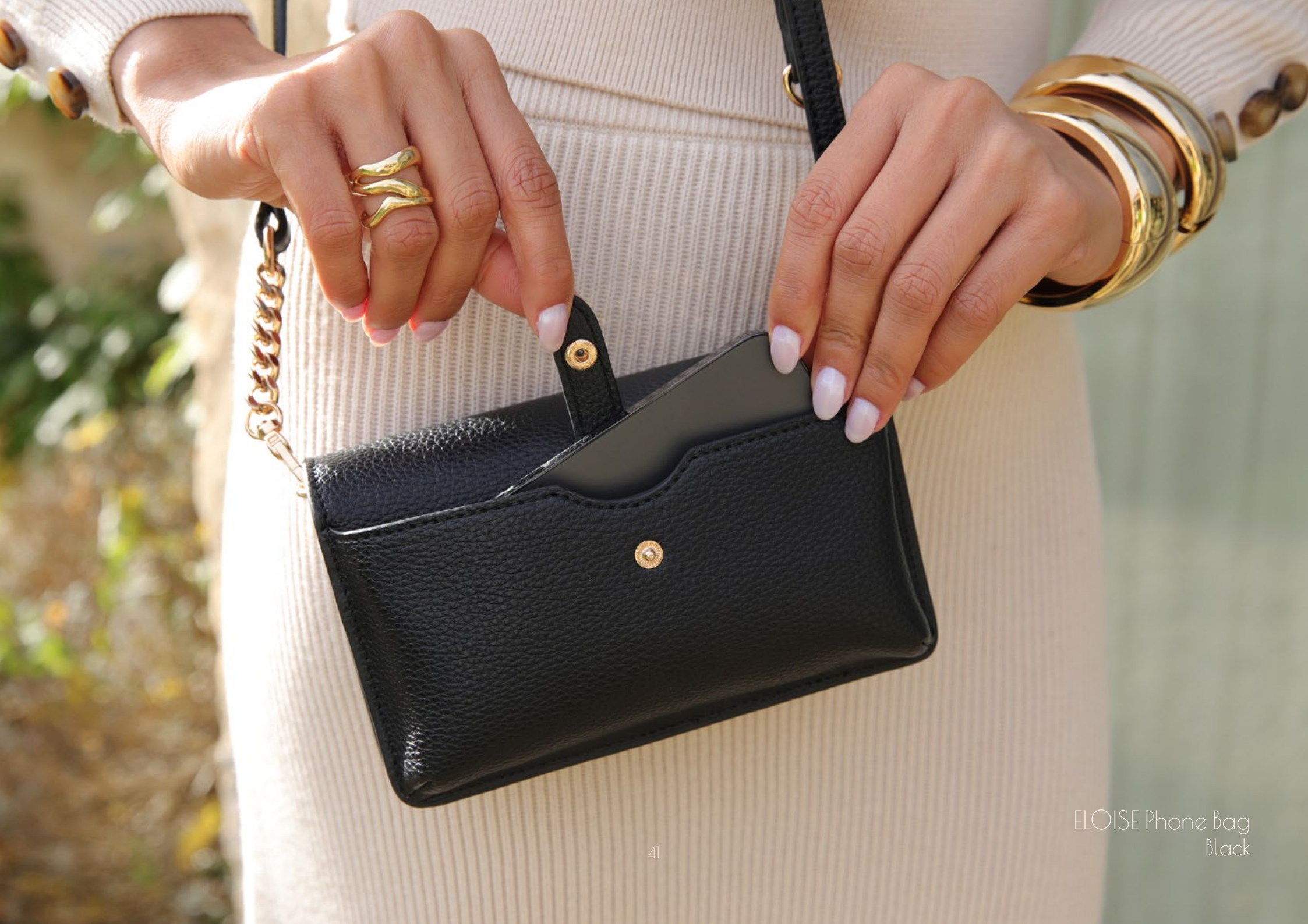
ELOISE Phone Bag Black