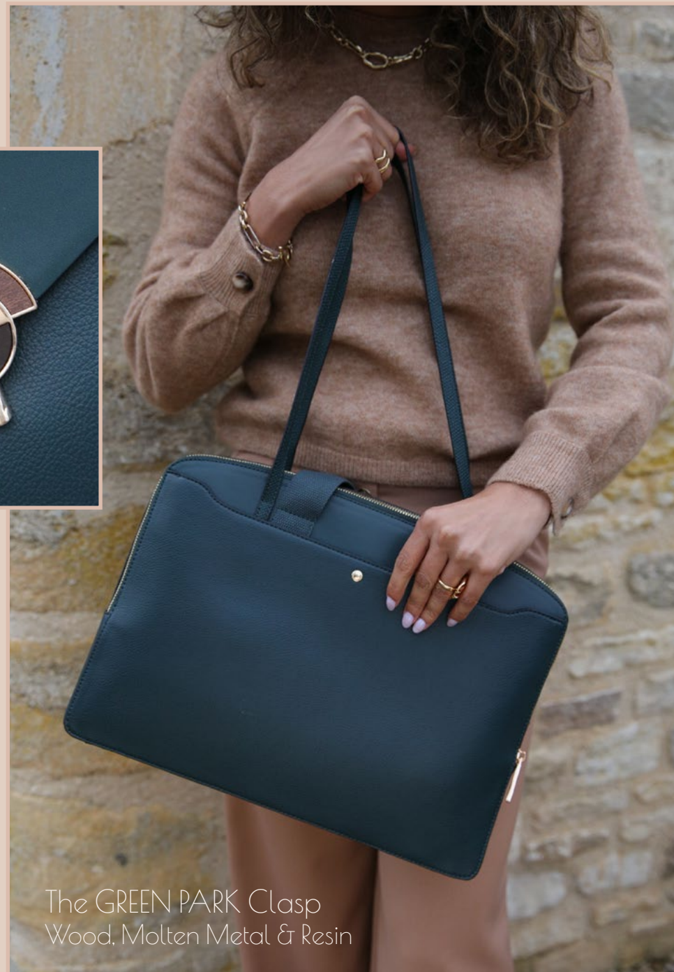
The GREEN PARK Clasp Wood, Molten Metal & Resin