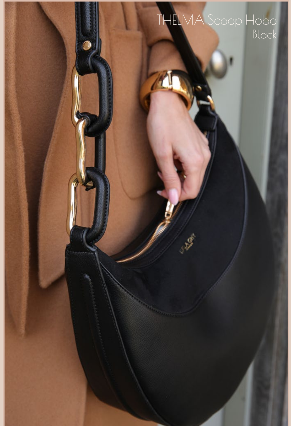
THELMA Scoop Hobo Black