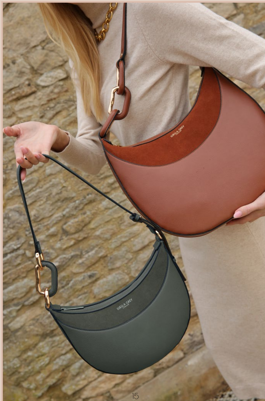
THELMA Scoop Hobo Conker