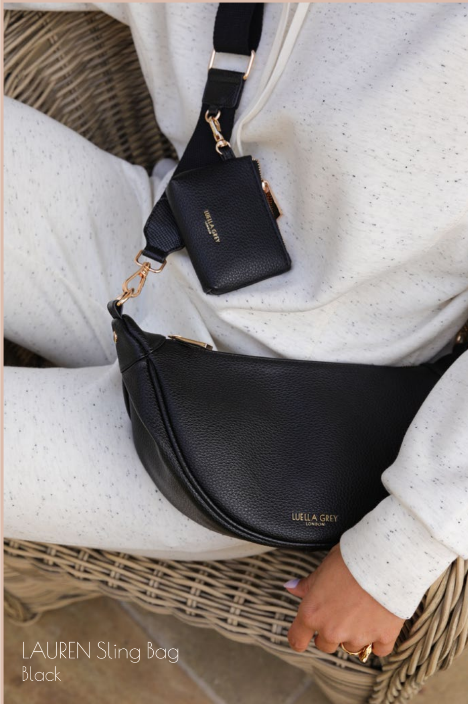
LAUREN Sling Bag Black