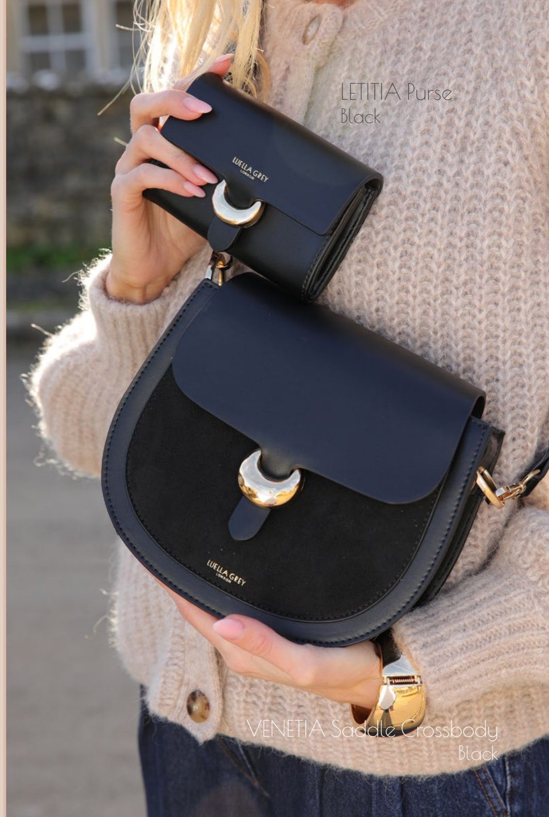
VENETIA Saddle Crossbody Black