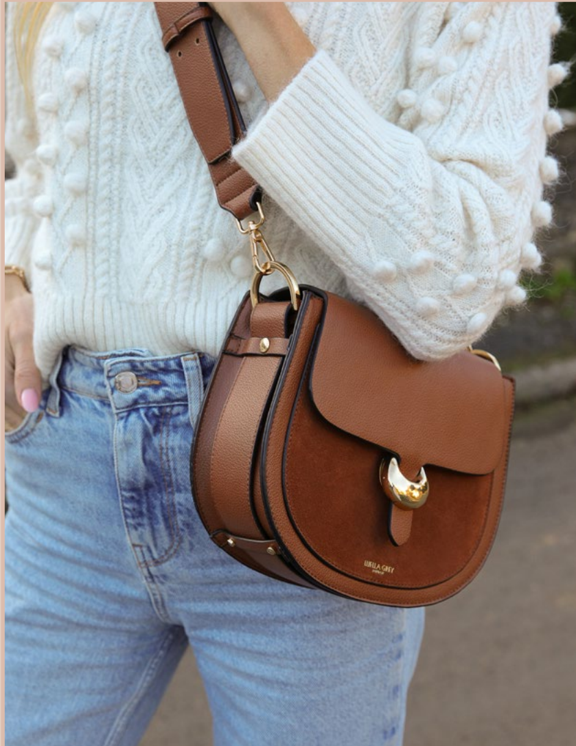
VENETIA Saddle Crossbody Conker