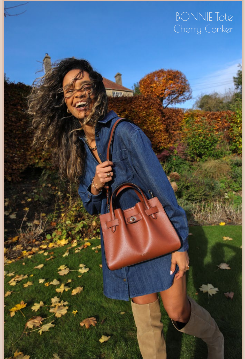
BONNIE Tote Cherry, Conker