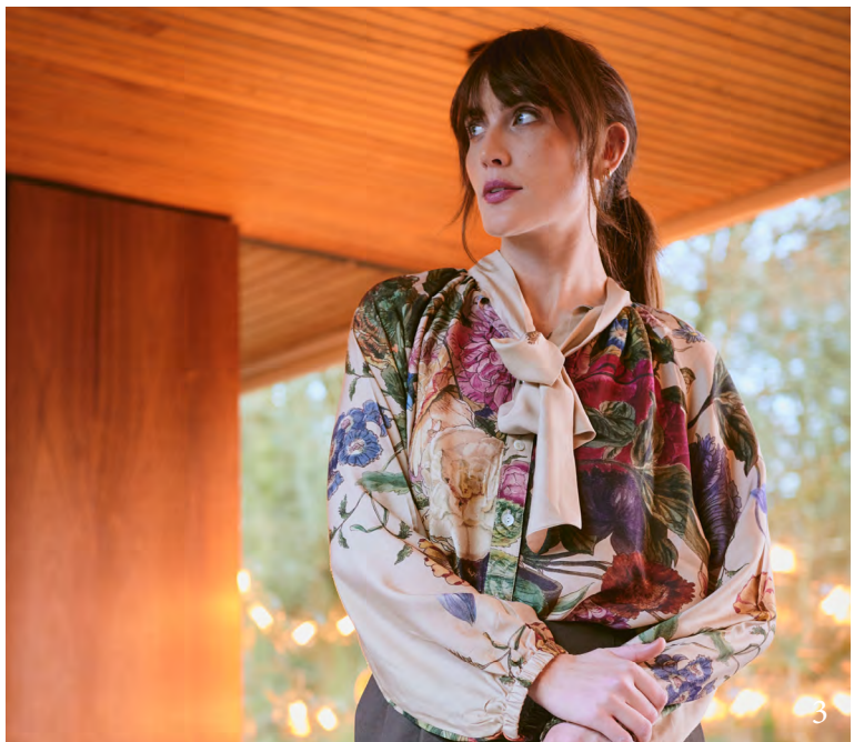
1. Primula Berry Kimono | 2. Primula Black Skirt | 3. Primula Stone Pussy Bow Blouse