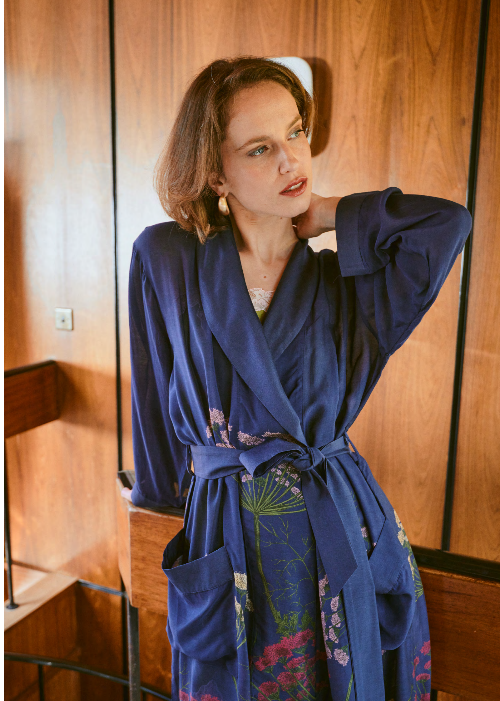
1. Parsely Seed Wool Kimono | 2. Parsley Seed Velvet Jacket | 3. Parsley Seed Oversized Shirt