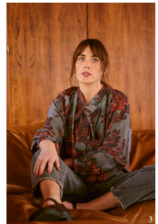
1. Pagoda Pewter Velvet Jacket | 2. Pagoda Forest Wool Scarf | 3. Pagoda Pewter Pussy Bow Blouse