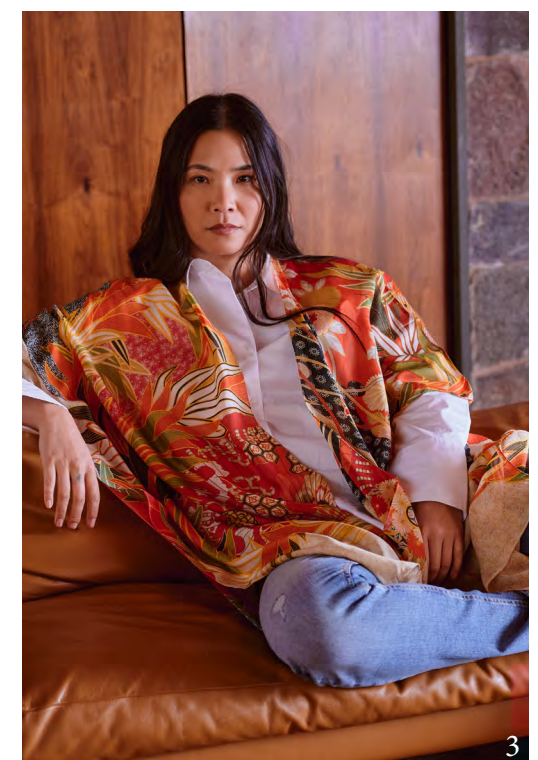
1. Fans Grande Kimono | 2. Fans Pussy Bow Blouse | 3. Fans Crepe Grande