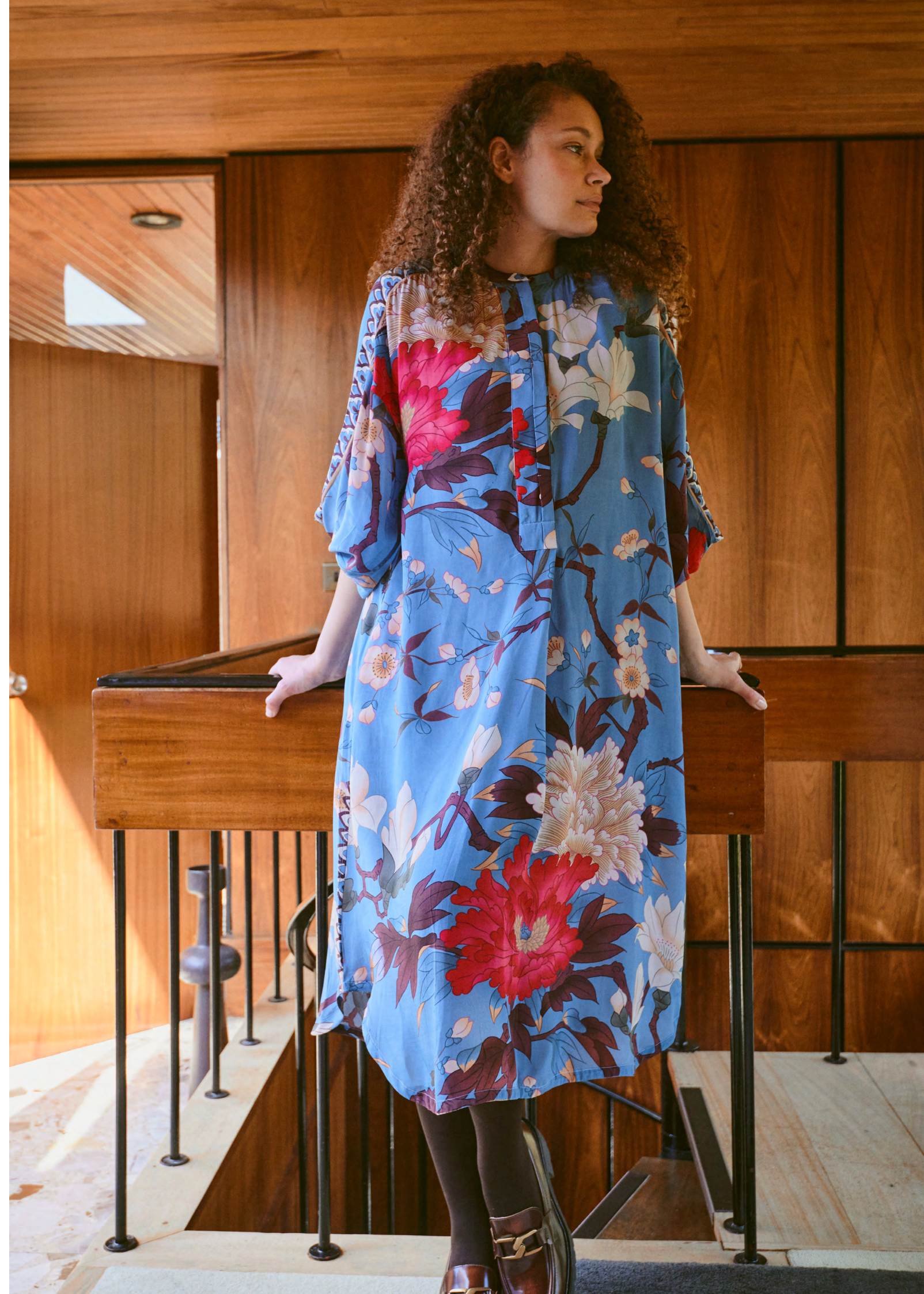
1. Magnolia Plates Scarf | 2. Magnolia Plates Pussy Bow Blouse and Skirt | 3. Giant Magnolia Darcy Dress