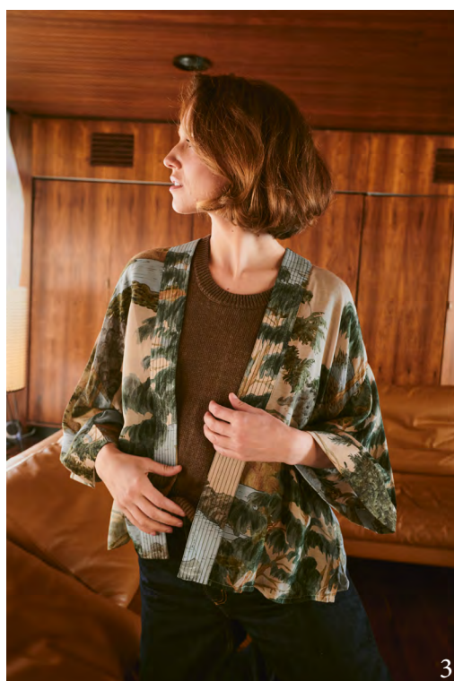
1. Rivers & Trees Pussy Bow Blouse | Palazzo Pants | 2. Rivers & Trees Midi Dress | 3. Rivers & Trees Kimono