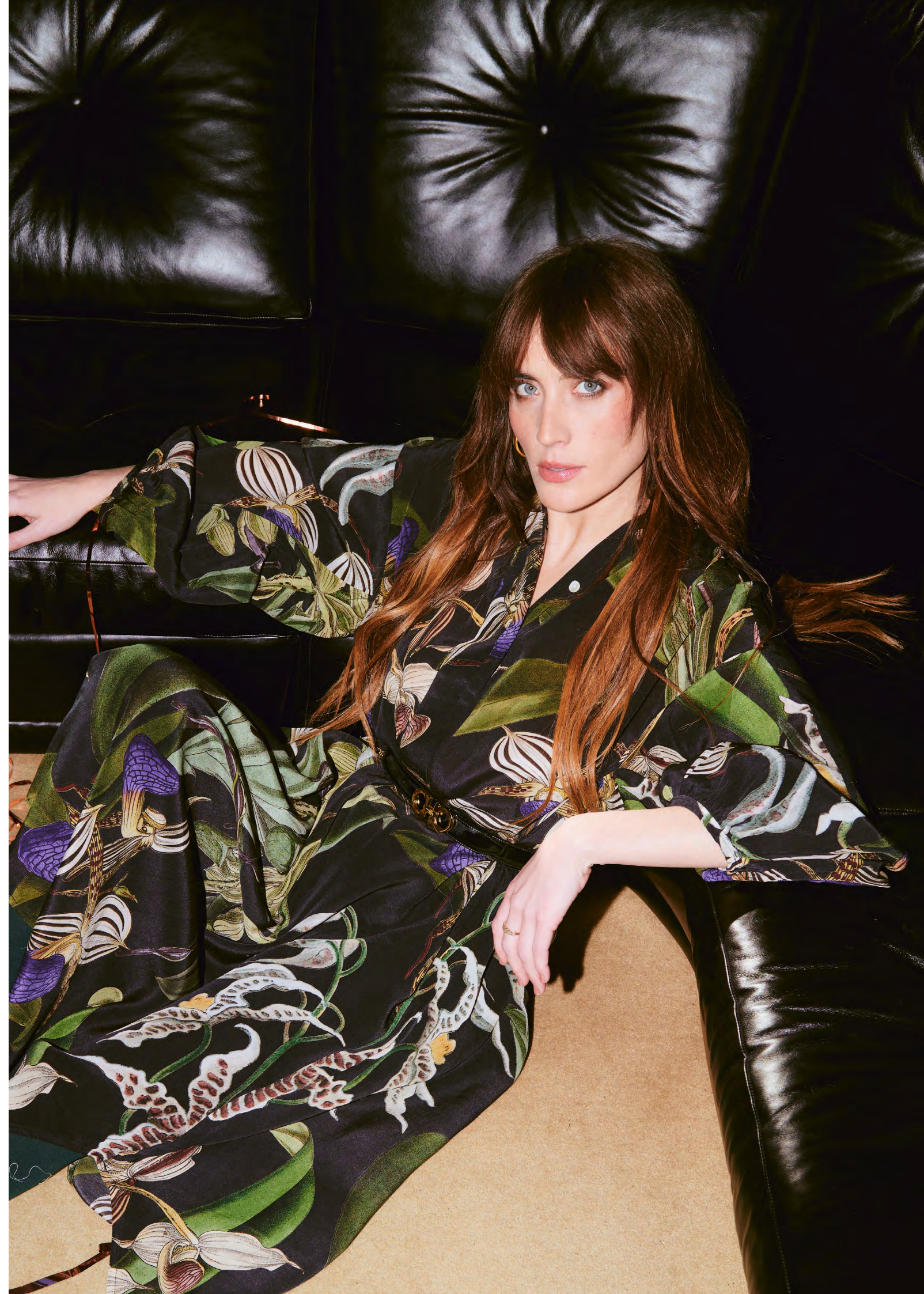
1. Orchid Black Wool Throwover | 2. Orchid Black Kimono | 3. Orchid Black Oversized Shirt