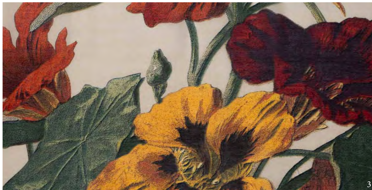
1. Nasturtium Scarf | 2. Nasturtium Kimono | 3. Nasturtium Print

A giant print of hazy leaves and flowers. Autumnal colours, rust, ochre, cinnamon and fawn.