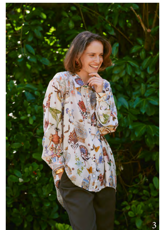
1. Cornucopia Throwover | 2. Cornucopia Pussy Bow Blouse | 3. Cornucopia Oversized Shirt