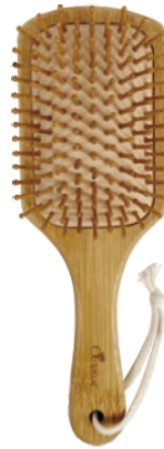
M1029 Bamboo Hair Brush