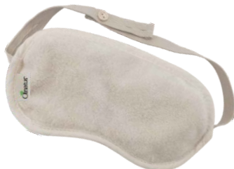
M1011 Bamboo Eyemask