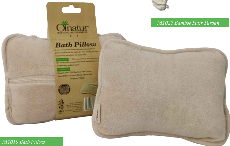
M1019 Bath Pillow

Olnatur is an innovative, high value, low cost, quality product range.