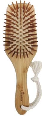
M1030 Premium Bamboo Hair Brush