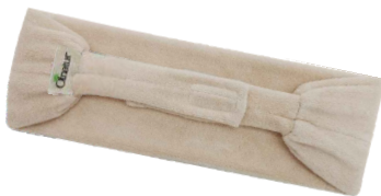
M1012 Bamboo & Cotton Headband