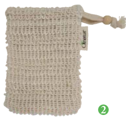
M1001 Exfoliating Hemp & Cotton Soap Bag