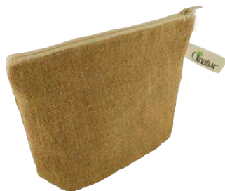
M1020 Hemp Toiletries Bag