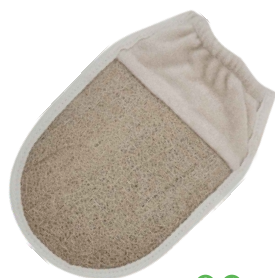
M1005 Double Sided Loofah & Bamboo Mitt