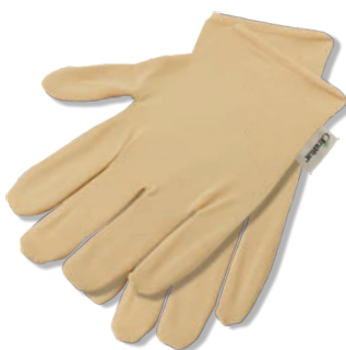
M1013 Bamboo Moisturising Gloves