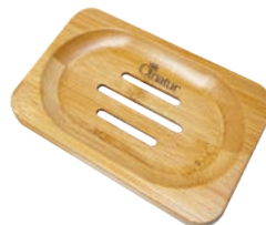
M1025 Bamboo Soap Dish