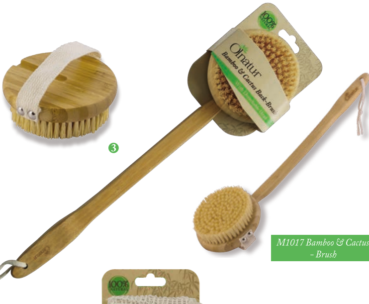
M1017 Bamboo & Cactus Back - Brush