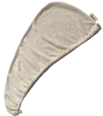
M1027 Bamboo Hair Turban