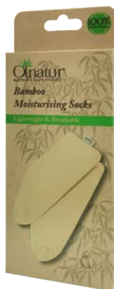
M1014 Bamboo Moisturising Socks

Olnatur is an innovative, high value, low cost, quality product range.