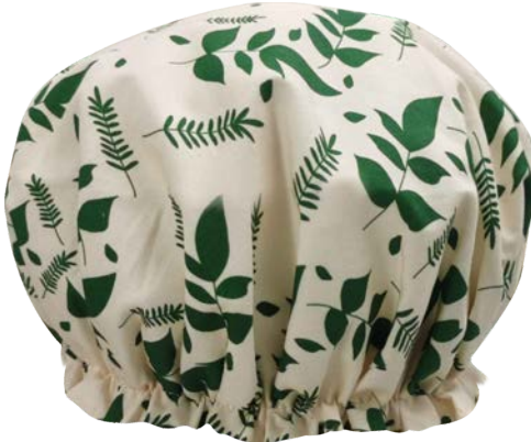
M1018 Bamboo & Cotton Shower Cap With Pouch