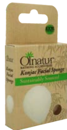
M1023 Konjac Bath Sponge