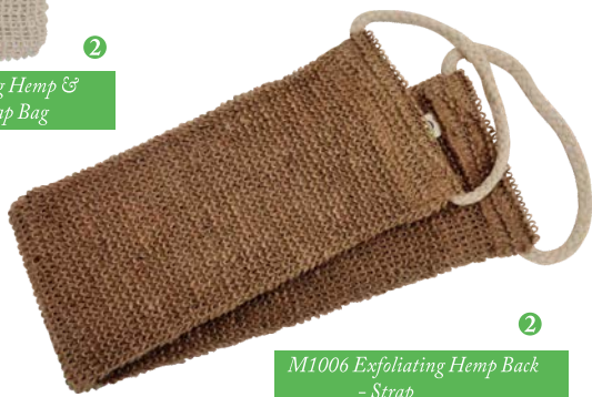
M1006 Exfoliating Hemp Back - Strap

Olnatur is an innovative, high value, low cost, quality product range.