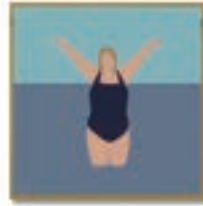
I LOVE THE WATER