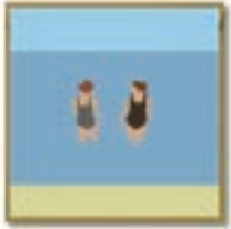
CHATS IN THE SEA