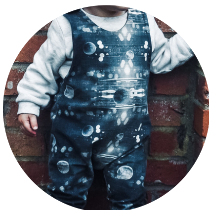
MOONS (Available from March 22)