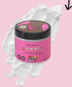
watermelon body butter