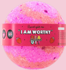
strawberry bath bomb