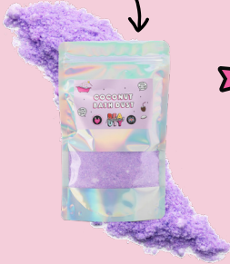
coconut bath dust