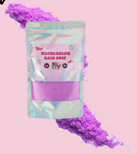
watermelon bath dust