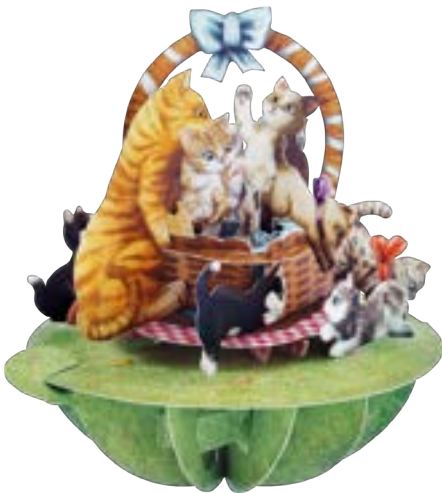
PS053 kittens in a basket