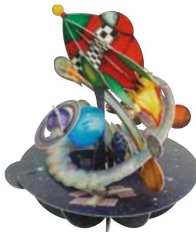
PS035 out in space