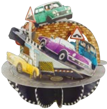
PS043 retro cars