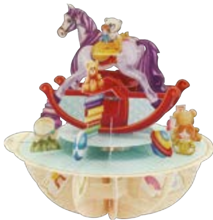
PS052 rocking horse