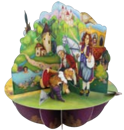
puss in boots