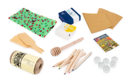
Each Cracker contains a Kraft Hat, Satisfying Snap, Amusing Joke/Motto & one of the following Gifts:

Beeswax Wrap, Mini Soap Bar, Seed Markers, Wooden Honey Drizzler, Bee Saving Seeds, Garden Twine, Colouring Pencils & Marbles.