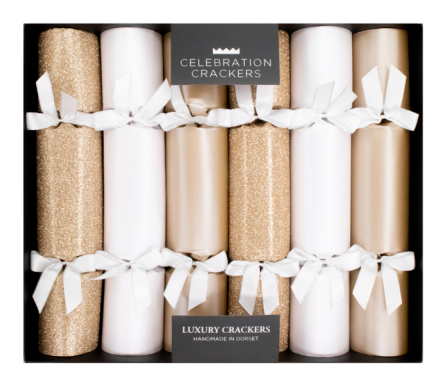
CCL2212 Charming Champagne