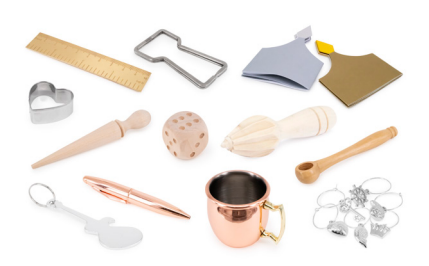
Each Cracker contains a Hat, Satisfying Snap, Amusing Joke/ Motto & one of the following Gifts:

Gold Plated Ruler, Silver Bottle Opener, Heart Cookie Cutter, Wooden Garden Dibber, Wooden Dice, Wooden Juicer, Wooden Salt Scoop, Guitar Bottle Opener, Rose Gold Pen, Rose Gold Tankard & Wine Charms.