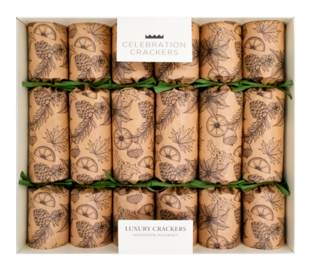
CCI 2201 Christmas Poinsettia

We've handpicked the finest materials to make this festive tradition the best it can be. These crackers will wow quests and add a dash of luxury to any dinner table.