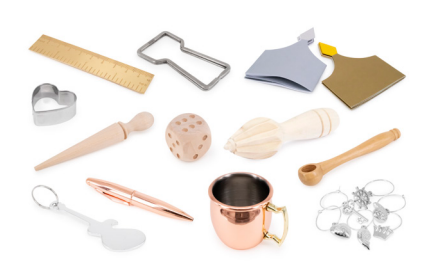
Each Cracker contains a Hat, Satisfying Snap, Amusing Joke/ Motto & one of the following Gifts:

Gold Plated Ruler, Silver Bottle Opener, Heart Cookie Cutter, Wooden Garden Dibber, Wooden Dice, Wooden Juicer, Wooden Salt Scoop, Guitar Bottle Opener, Rose Gold Pen, Rose Gold Tankard & Wine Charms.