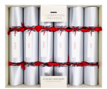
CCL2211 Silver Delight