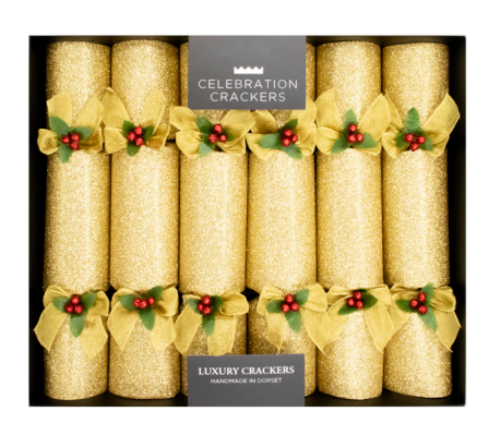
CCL2209 Sparkling Gold