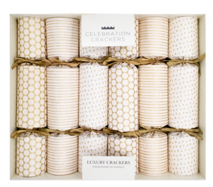
CCI 2202 Cream Spots