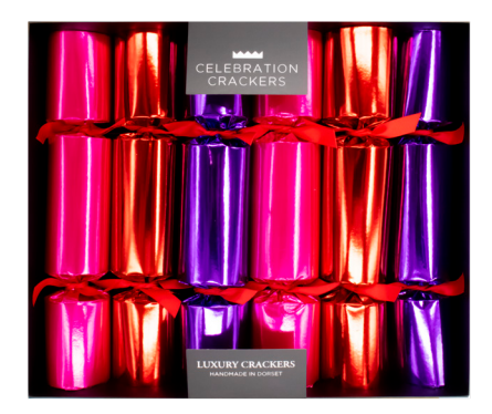
CCL2206 Colourful Treats