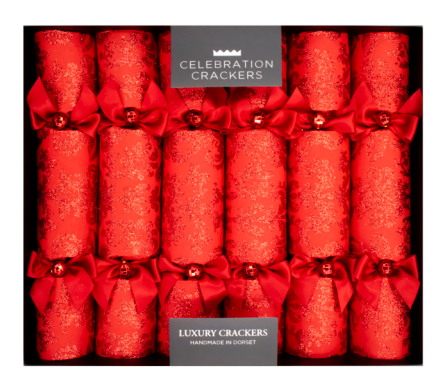
CCL2203 Sparkling Damask

We've handpicked the finest materials to make this festive tradition the best it can be. These crackers will wow guests and add a dash of luxury to any dinner table.