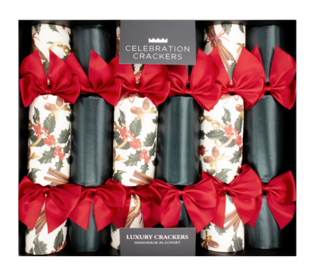
CCL2204 Christmas Holly