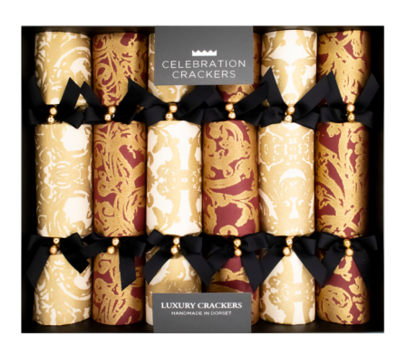
CCL2213 Delicate Damask