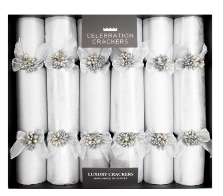
CCL2205 Sparkling Silver