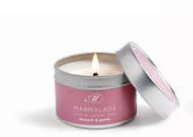
Small tin candle 20hrs