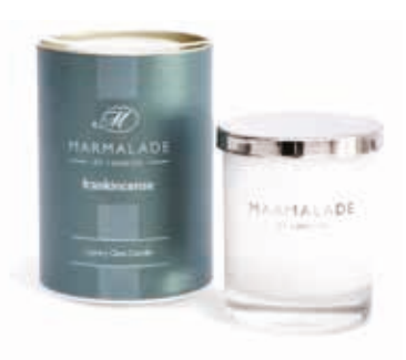
Glass candle 50hrs