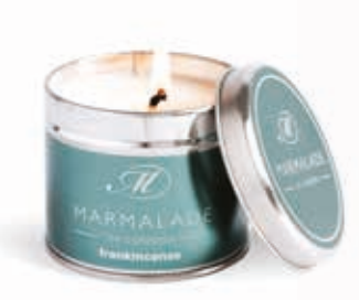
Medium tin candle 40hrs