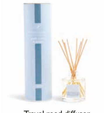
Travel reed diffuser 50ml