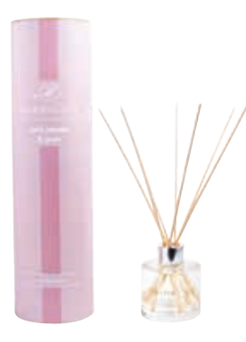
Large reed diffuser I00ml