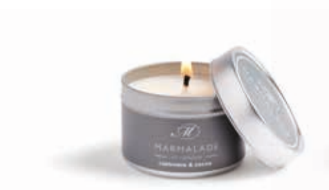
Small tin candle 20hrs