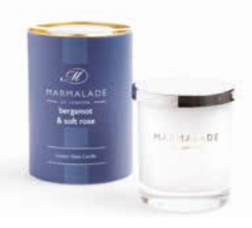
Glass candle 50hrs