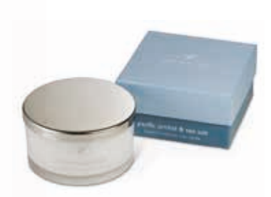
3 wick candle 60hrs