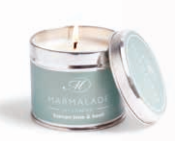
Medium tin candle