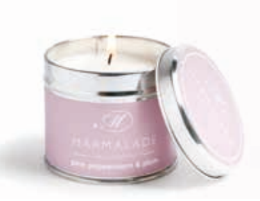
Medium tin candle 40hrs