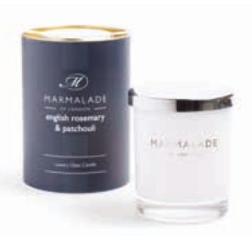
Glass candle 50hrs