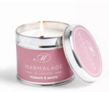
Medium tin candle 40hrs