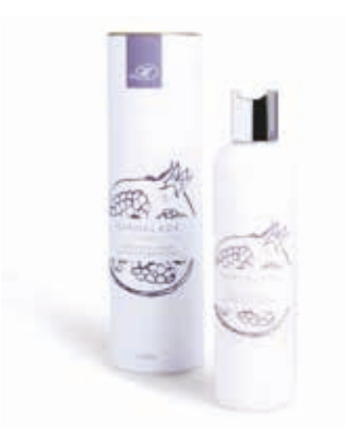
Hand and body lotion 250ml