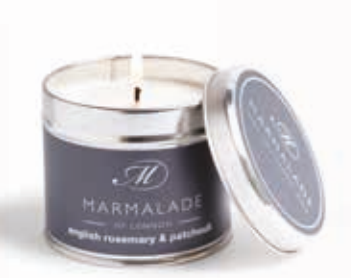
Medium tin candle