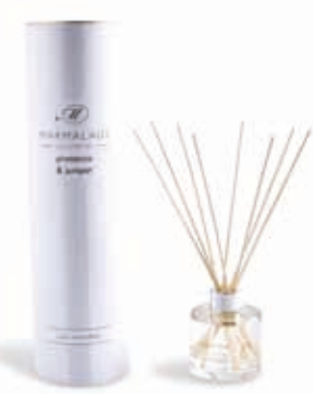
Large reed diffuser