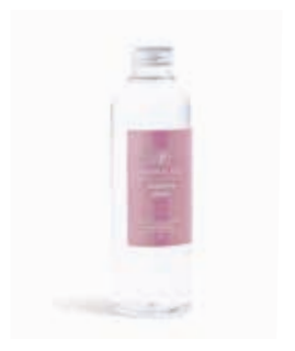
Diffuser refill 200ml