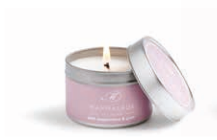
Small tin candle 20hrs