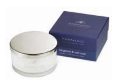
3 wick candle 60hrs