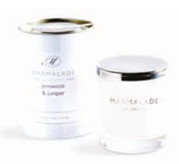
Glass candle 50hrs