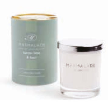
Glass candle 50hrs