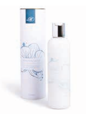
Hand and body lotion 250ml