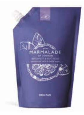
Liquid soap refill 500ml