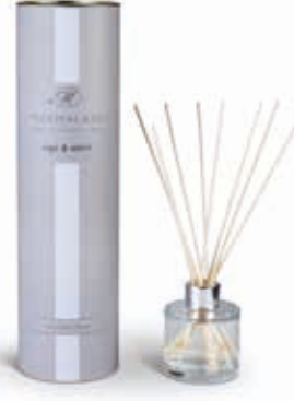
Large reed diffuser