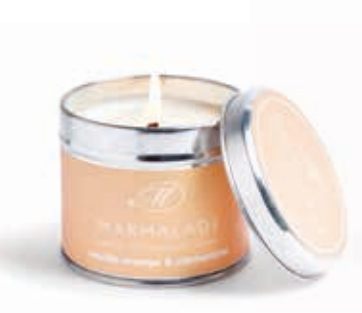
Medium tin candle