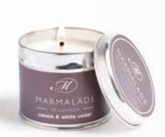
Medium tin candle