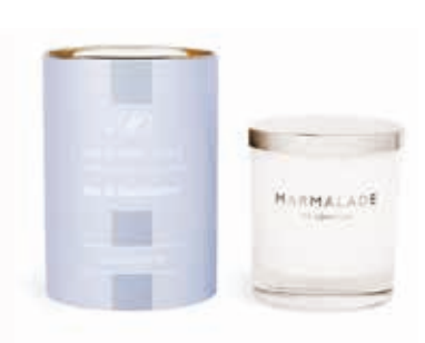
Glass candle 50hrs