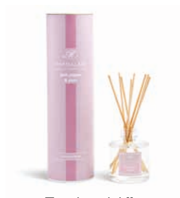
Travel reed diffuser 50ml