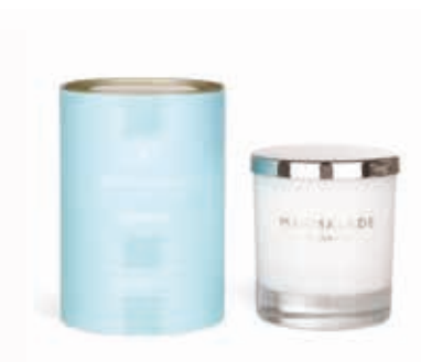
Glass candle 50hrs