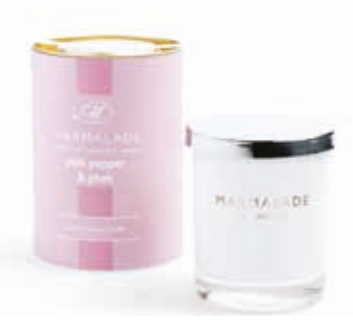
Glass candle 50hrs