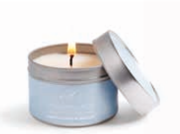
Small tin candle 20hrs