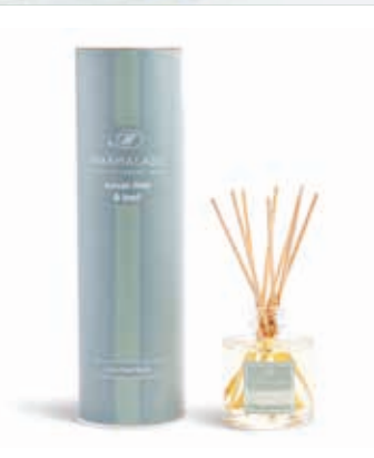
Travel reed diffuser 50ml