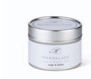
Small tin candle 20hrs