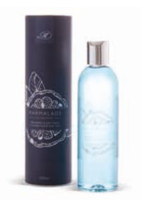
Hand and body wash 250ml