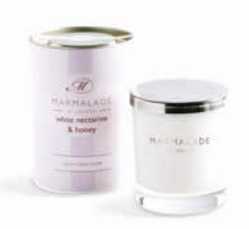
Glass candle 50hrs