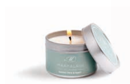
Small tin candle 20hrs

Top notes of mandarin, lime, grapefruit, lemon, spearmint on a base of basil, patchouli, amber, musk and moss.