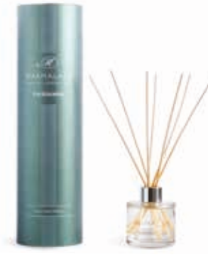
Large reed diffuser