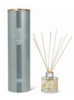
Large reed diffuser