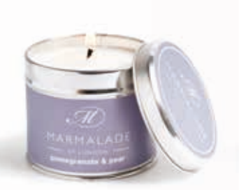
Medium tin candle