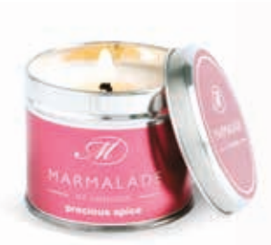
Medium tin candle 40hrs