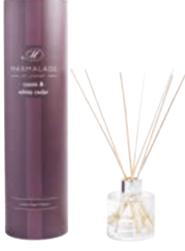
Large reed diffuser