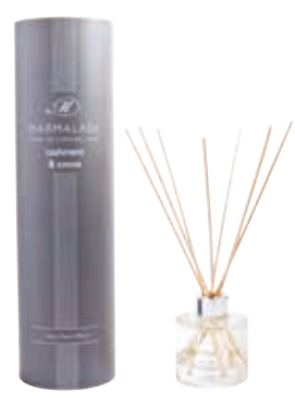
Large reed diffuser