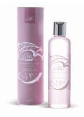
Hand and body wash 250ml