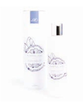
Hand and body lotion 250ml