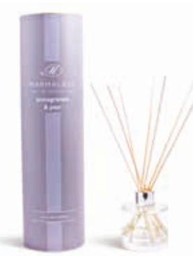
Large reed diffuser