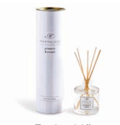
Travel reed diffuser 50ml