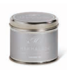
Medium tin candle 40hrs