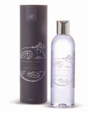
Hand and body wash 250ml