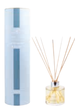
Large reed diffuser