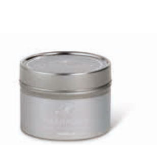
Small tin candle 20hrs

Top notes of snow capped fir, pine needles and crisp eucalyptus. Middle notes of leather and smoky woods. Base notes of musk.