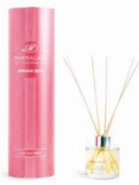
Large reed diffuser