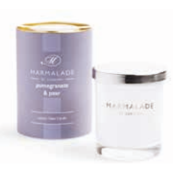
Glass candle 50hrs