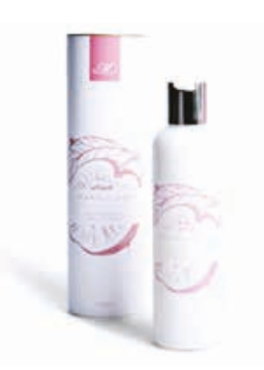
Hand and body lotion 250ml