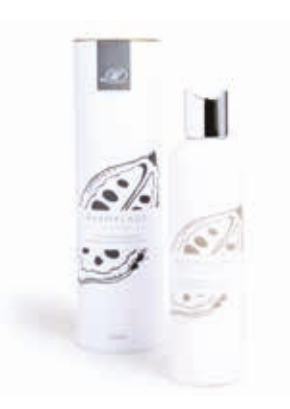
Hand and body lotion 250ml