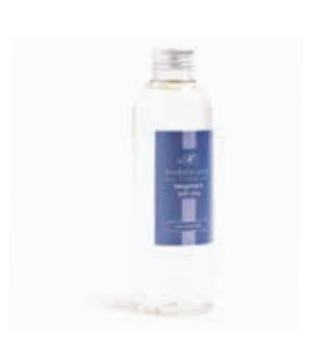
Diffuser refill 200ml