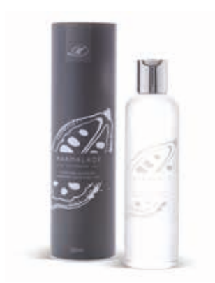
Hand and body wash 250ml