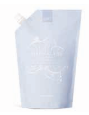
Liquid soap refill 500ml