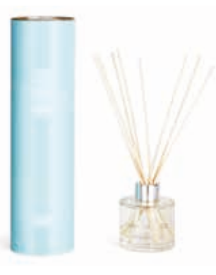
Large reed diffuser