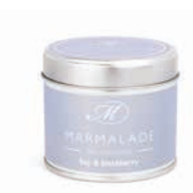
Medium tin candle 40hrs