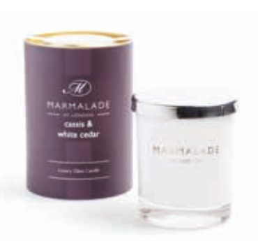
Glass candle 50hrs