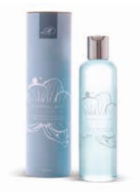
Hand and body wash 250ml