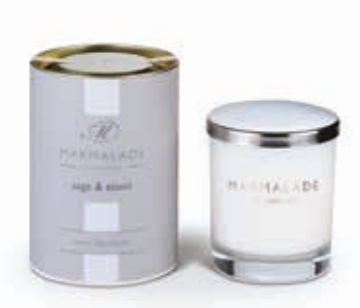
Glass candle 50hrs