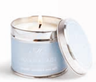
Medium tin candle