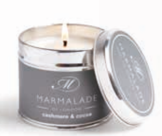
Medium tin candle 40hrs