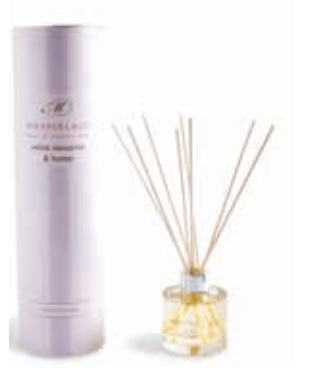
Large reed diffuser 100ml