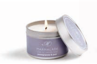
Small tin candle 20hrs