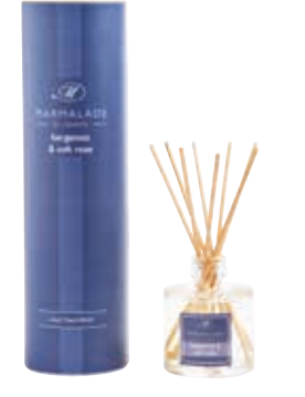
Travel reed diffuser 50ml