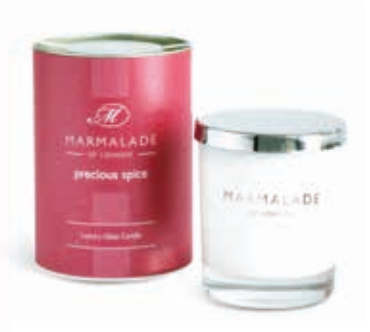
Glass candle 50hrs