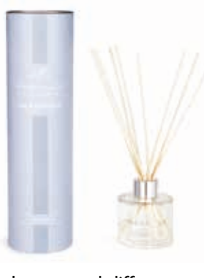
Large reed diffuser I00ml