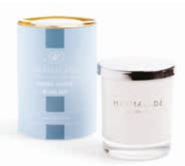
Glass candle 50hrs