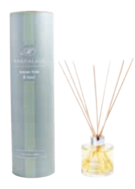
Large reed diffuser