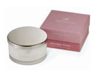
3 wick candle 60hrs