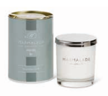
Glass candle 50hrs