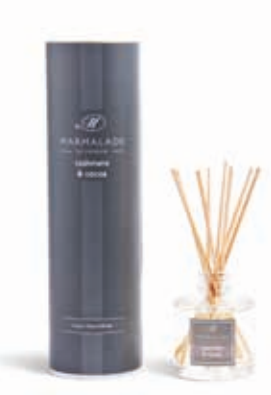
Travel reed diffuser 50ml