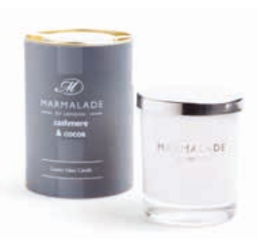
Glass candle 50hrs