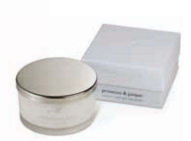
3 wick candle 60hrs