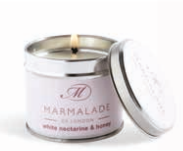
Medium tin candle