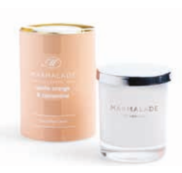
Glass candle 50hrs