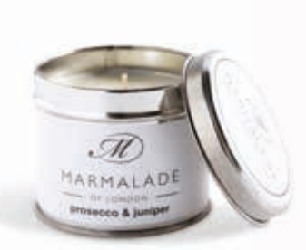
Medium tin candle 40hrs