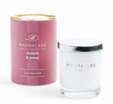
Glass candle 50hrs