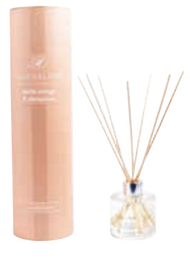
Large reed diffuser