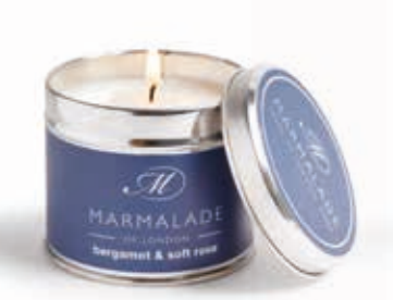
Medium tin candle