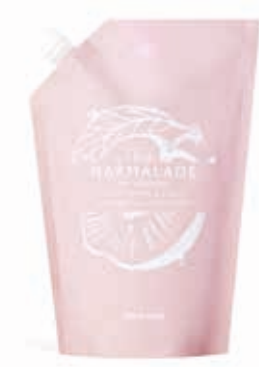
Liquid soap refill 500ml