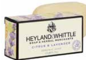
397 Citrus & Lavender