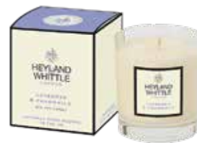
451 Lavender & Chamomile