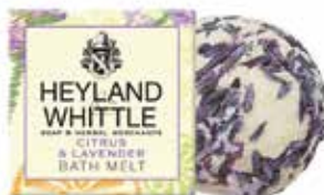
243 Citrus & Lavender