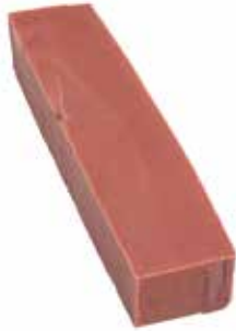
963 Vintage Rose