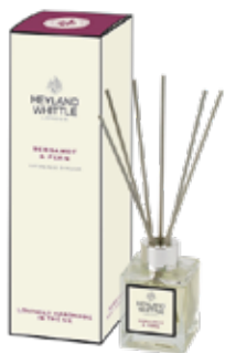
405 Bergamot & Fern

Boxed in Responsibly Sourced FSC® Certified Card