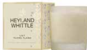
288 Lily Ylang Ylang