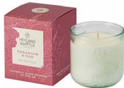
1132 Geranium & Oud