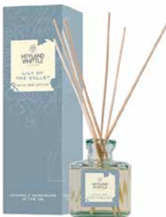
2001 Lily of the Valley