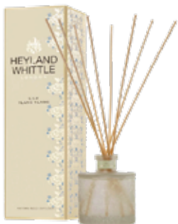
317 Lily Ylang Ylang