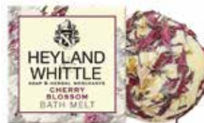
122 Cherry Blossom