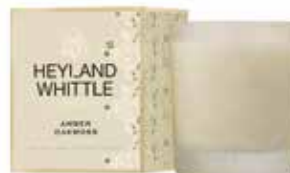
692 Amber Oakmoss