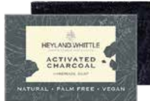
9129 Activated Charcoal