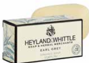
569 Earl Grey