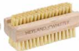
570 Branded Wooden Nail Brush