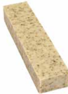
967 Herbal Mint