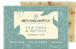
9127 Tea Tree & Nettle