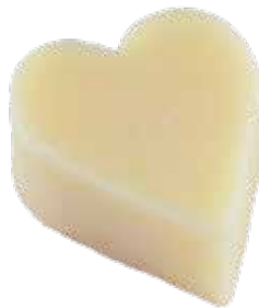
091 Patchouli & Goat's Milk