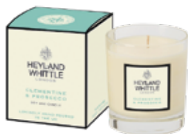
443 Clementine & Prosecco