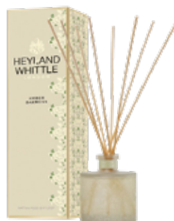
691 Amber Oakmoss