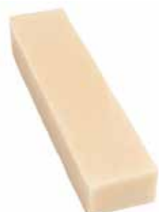
514 Hydrating Shampoo