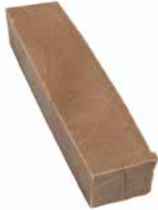
968 Hemp & Walnut