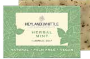
9122 Herbal Mint