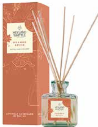
2002 Orange Spice