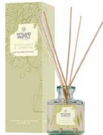
2000 Bergamot & Jasmine