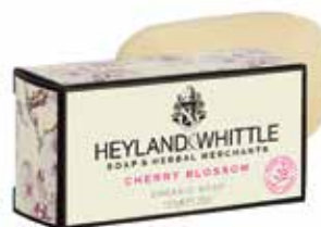
539 Cherry Blossom