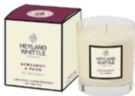
442 Bergamot & Fern

Boxed in Responsibly Sourced FSC® Certified Card