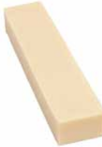
516 Fragrance Free Olive