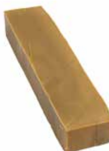
962 Spirulina Seaweed