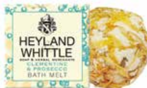
232 Clementine & Prosecco