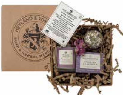
398 English Lavender Collection

Boxed in Eco-friendly PEFC (promoting sustainable forest management) fully recyclable card, packing fully recyclable and biodegradable.