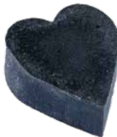
095 Activated Charcoal