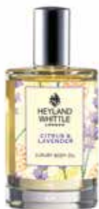
321 Citrus & Lavender