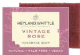
374 Vintage Rose

Boxed in Responsibly Sourced FSC® Certified Card