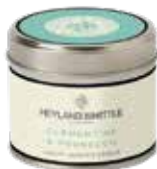
467 Clementine & Prosecco