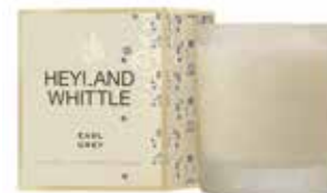
349 Earl Grey