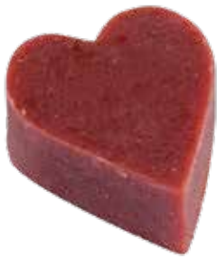
086 Vintage Rose