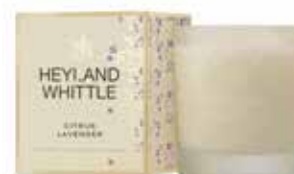
287 Citrus Lavender