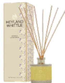
316 Citrus Lavender