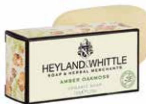
561 Amber Oakmoss