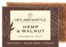
375 Hemp & Walnut