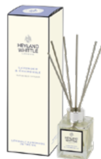
413 Lavender & Chamomile