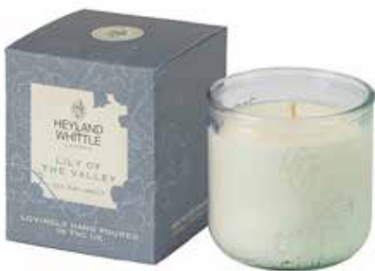
2003 Lily of the Valley