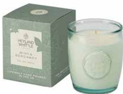
1134 Mint & Bergamot

100% recycled glass, boxed in responsibly sourced FSC® Certified Card