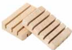
503 Soap Saver