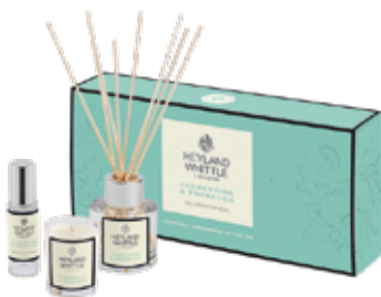
1108 Clementine & Prosecco

Boxed in Responsibly Sourced FSC® Certified Card