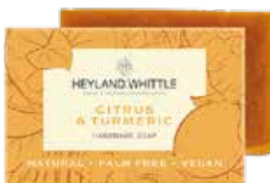
9128 Citrus & Turmeric