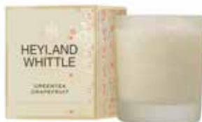
285 Greentea Grapefruit