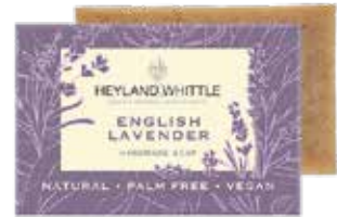
9123 English Lavender