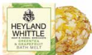
233 Greentea & Grapefruit