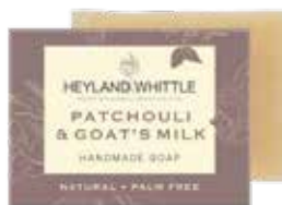
384 Patchouli & Goat's Milk