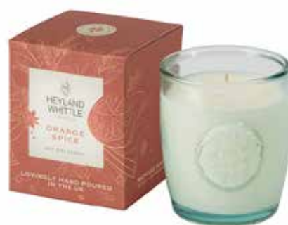
2004 Orange Spice