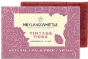
9120 Vintage Rose

Boxed in Responsibly Sourced FSC® Certified Card