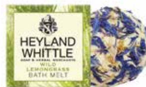
202 Wild Lemongrass