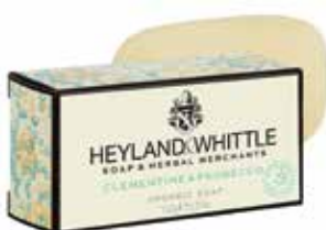
568 Clementine & Prosecco