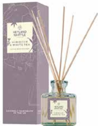
1148 Hibiscus & White Tea