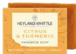
386 Citrus & Turmeric