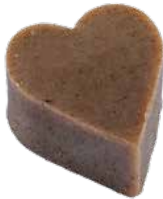
087 Hemp & Walnut