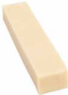
964 Patchouli & Goat's Milk