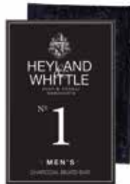
784 No.1 Charcoal Beard Bar