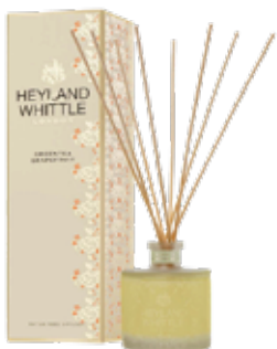
314 Greentea Grapefruit