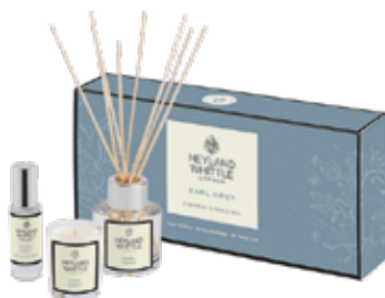
1107 Earl Grey