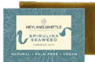
9126 Spirulina Seaweed