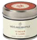
469 Ginger & Lime