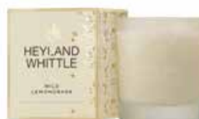
266 Wild Lemongrass