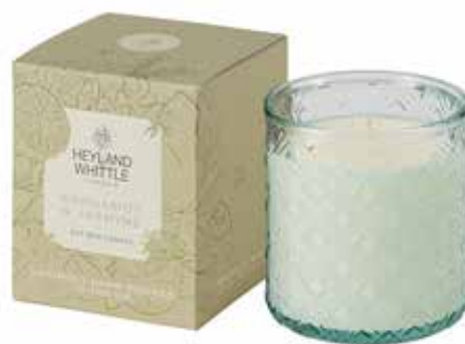
2005 Bergamot & Jasmine