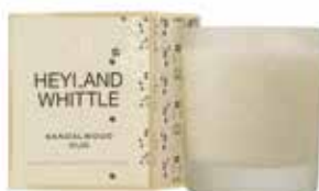
267 Sandalwood Oud