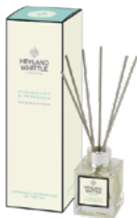
406 Clementine & Prosecco