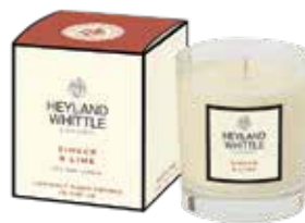
444 Ginger & Lime