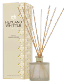
262 Wild Lemongrass