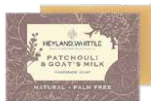
9125 Patchouli & Goat's Milk