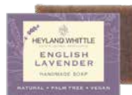
376 English Lavender