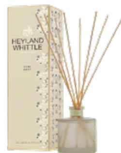
338 Earl Grey