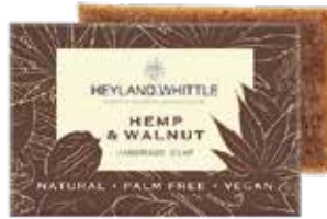
9121 Hemp & Walnut