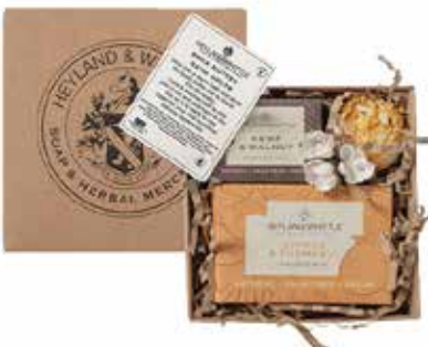
866 Robust Citrus