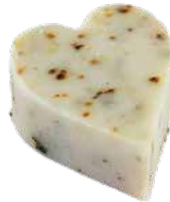
093 Tea Tree & Nettle