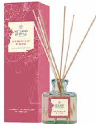
1149 Geranium & Oud