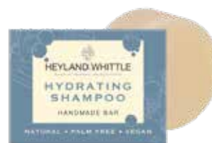
320 Hydrating Shampoo (35g)