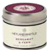
466 Bergamot & Fern