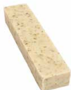
960 Tea Tree & Nettle