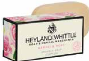
396 Neroli & Rose