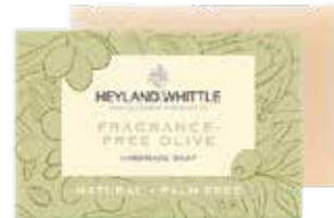
9135 Fragrance Free Olive