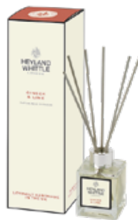
407 Ginger & Lime