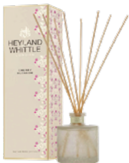
261 Cherry Blossom