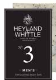
786 No.3 Exfoliating Bar