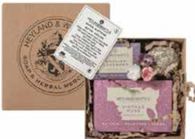
864 Indulgent Rose