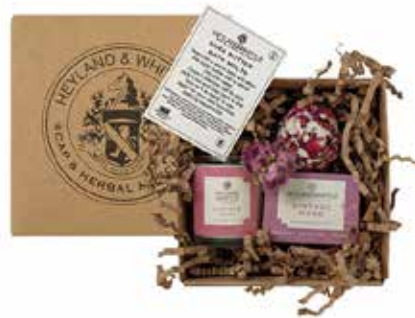
399 Vintage Rose Collection