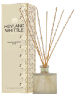
263 Sandalwood Oud