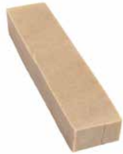
966 English Lavender