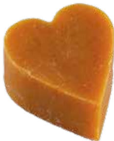
094 Citrus & Turmeric