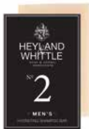
785 No.2 Shampoo Bar