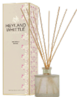
315 Neroli Rose