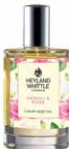
322 Neroli & Rose