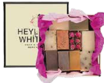
002 Selection of 10 Small Soaps