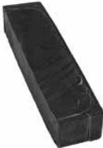
511 Activated Charcoal