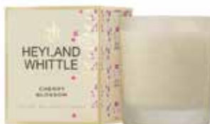
259 Cherry Blossom