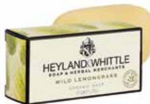
389 Wild Lemongrass