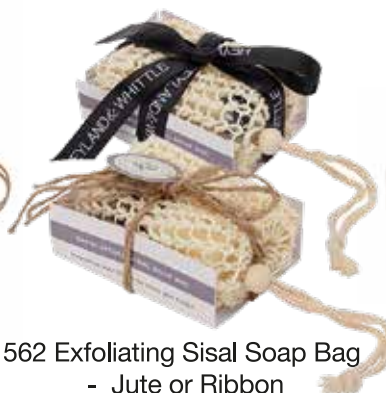
562 Exfoliating Sisal Soap Bag - Jute or Ribbon