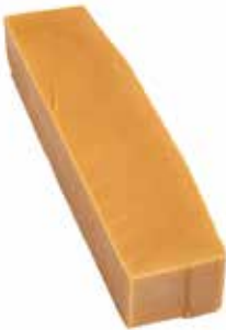
969 Citrus & Turmeric