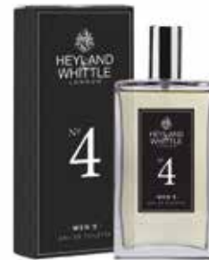
805 No. 4 Men's Eau de Toilette