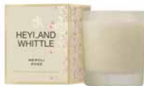
286 Neroli Rose