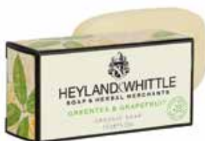
381 Greentea & Grapefruit