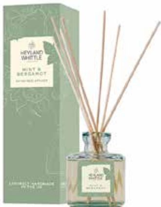
1140 Mint & Bergamot

100% recycled glass, boxed in responsibly sourced FSC® Certified Card