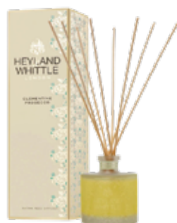
319 Clementine Prosecco