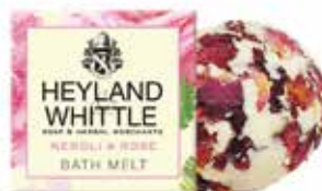
208 Neroli & Rose