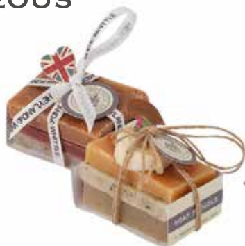
050 Soap Bundle - Jute or Ribbon