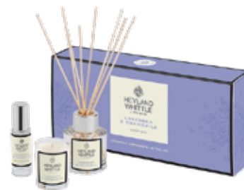
705 Lavender & Chamomile