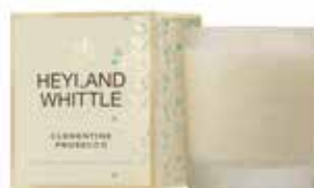
290 Clementine Prosecco