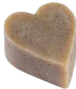
089 English Lavender