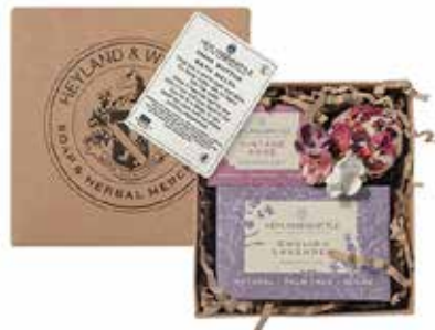
865 Relaxing Lavender