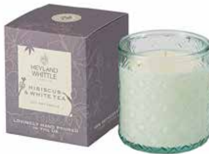
1133 Hibiscus & White Tea