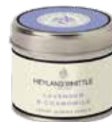
501 Lavender & Chamomile