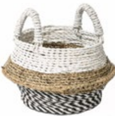
BSK06 WHITE TOP SEAGRASS BASKET W: 32 H: 33 D: 32