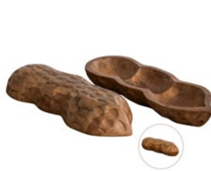
COLL60-N PEANUT BOWL - PACK OF 2 W: 40 H: 12 D: 15