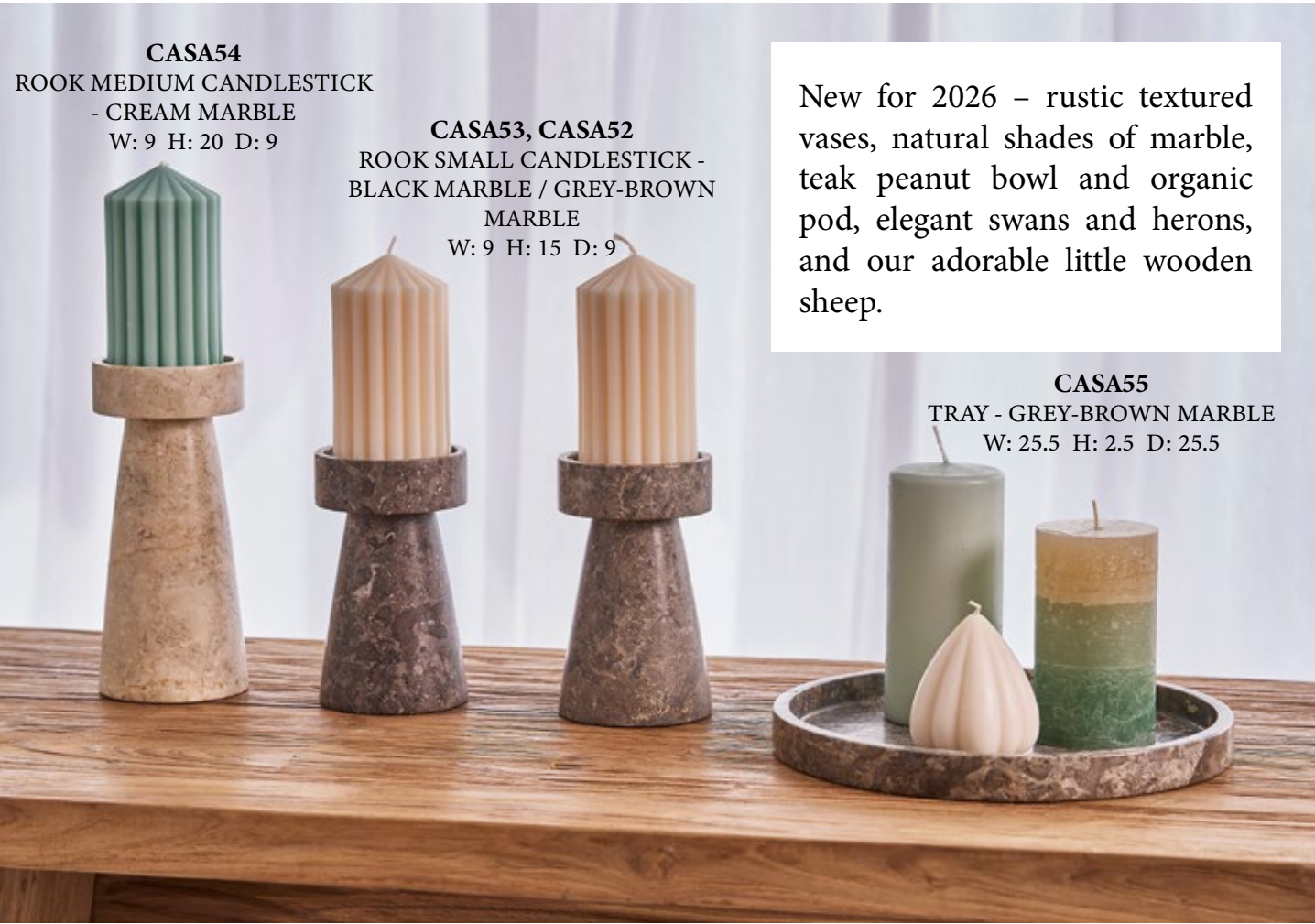
CASA54 ROOK MEDIUM CANDLESTICK - CREAM MARBLE W: 9 H: 20 D: 9 CASA53, CASA52 ROOK SMALL CANDLESTICK - BLACK MARBLE / GREY-BROWN MARBLE W: 9 H: 15 D: 9

New for 2026 – rustic textured vases, natural shades of marble, teak peanut bowl and organic pod, elegant swans and herons, and our adorable little wooden sheep.