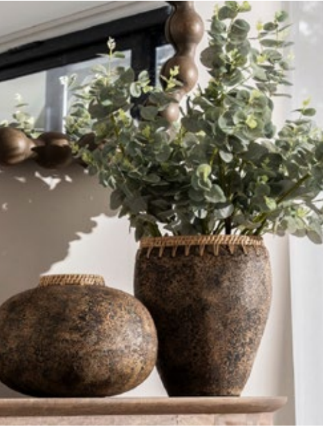
KILN40, KILN41 DESTY POT, PRITA POT W: 30/25 H: 20/30 D: 30/20