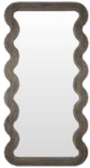
ENG177XL WIGGLE MIRROR - XL - GREYWASH W: 90 H: 180 D: 5