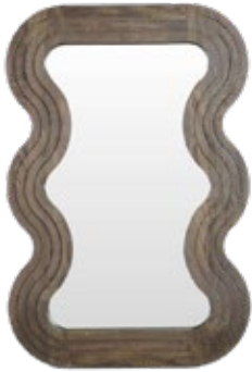
ENG177-GW WIGGLE MIRROR - GREYWASH W: 60 H: 90 D: 5