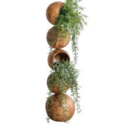
COLL58-N POD TOWER W: 24 H: 100 D: 24