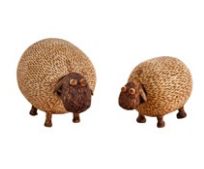
COLL57 PAIR OF SHEEP W: 13/10 H: 8/7 D: 8/6