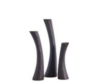
CASA56-S TUSK SMALL CANDLESTICK SET W: 12/10/9 H: 50/40/30 D: 12/10/9