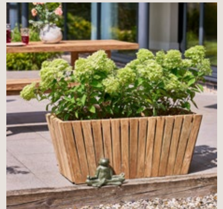
GRC94-AG - Frog - antique green

Our team are available to help with any queries or take your order Monday-Friday, 8am-4.30pm