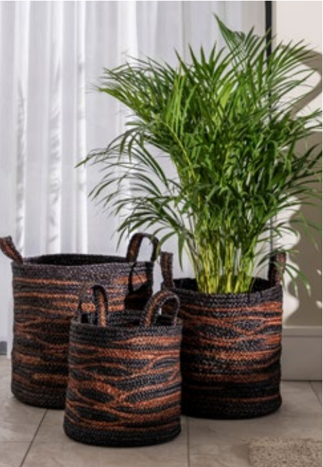
BSK19 SET OF 3 TIGER BASKETS W: 40/34/32 H: 41/36/29 D: 40/34/32