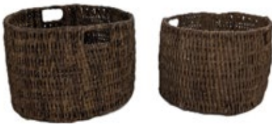
BSK16 SET OF 2 ROBUSTA BASKETS W: 45/50 H: 32/28 D: 45/40