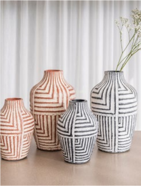
KILN42-SB, SR, MB, MR HAMPTON POT - SML/MED RED/BLUE W: 15/19 H: 22/32 D: 15/19