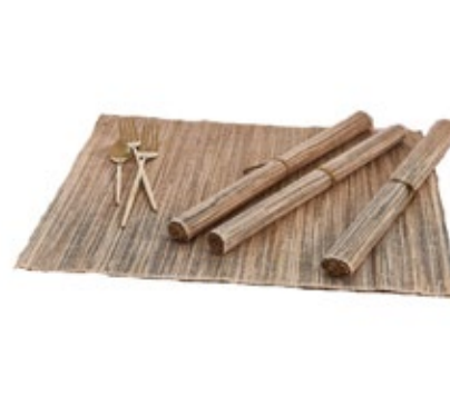
GREE67 SEAGRASS PLACEMAT W: 45 H: 35 D: 0.2