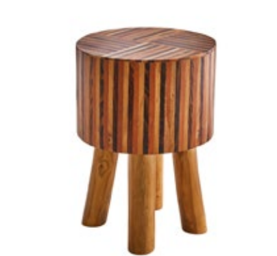
CASA57 SIMBA STOOL W: 30 H: 30 D: 45