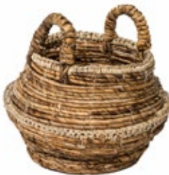
BSK05 BANANA RAFFIA BASKET W: 32 H: 33 D: 32