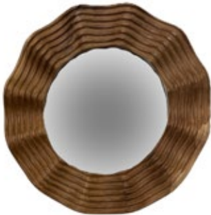
LAW183 WAVY MIRROR W: 50 H: 50 D: 5