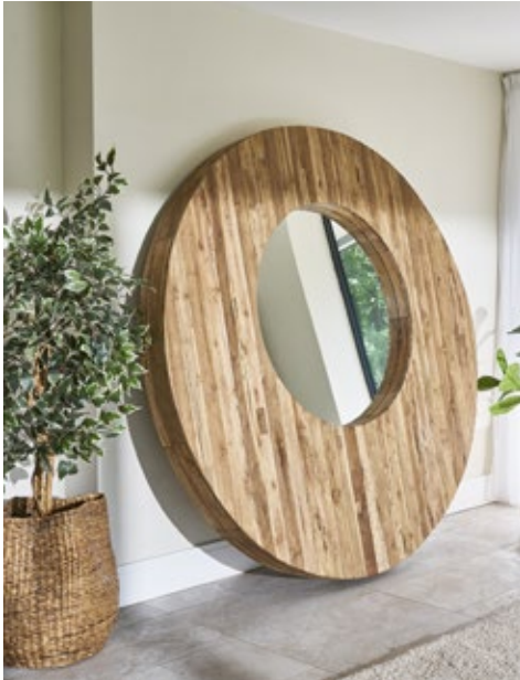
LAW181 RUSTIC MAMMOTH MIRROR W: 200 H: 200 D: 15