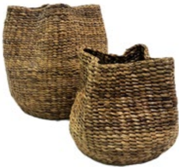
BSK15 SET OF 2 ORGANIC BASKETS W: 42/54 H: 43/53 D: 42/54