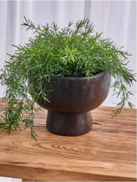
COLL61-B SANTI BOWL - BLACK W: 25 H: 20 D: 25