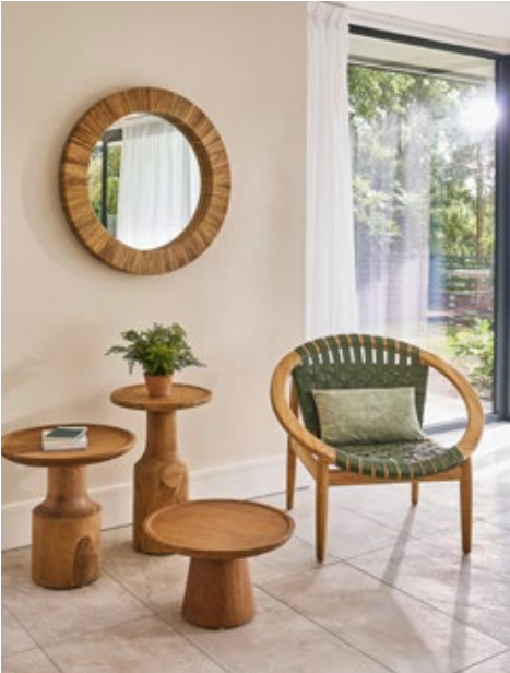
CASA59 ROUND SEAGRASS MIRROR W: 80 H: 80 D: 6