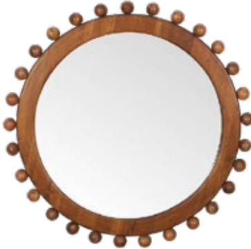
ENG178 ARUBA BOBBLE MIRROR W: 80 H: 80 D: 5