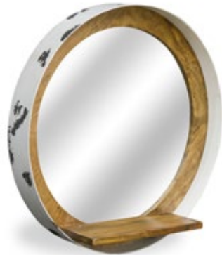
ENG081 RECYCLED DRUM MIRROR SHELF W: 56 H: 56 D: 8