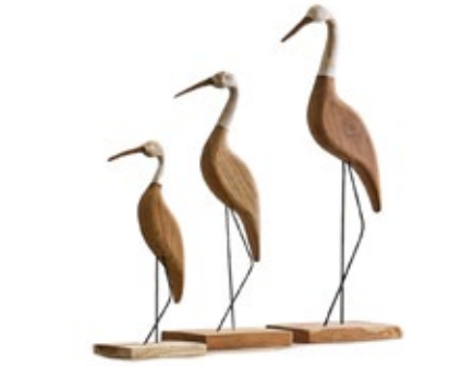
COLL55 SET OF 3 HERONS W: 25/22/18 H: 70/55/40 D: 15/15/12