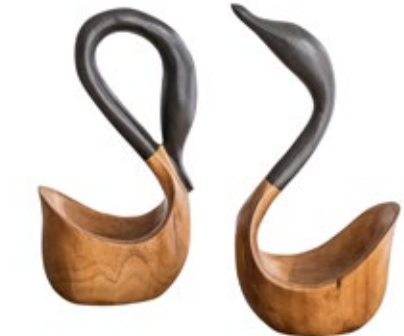
COLL59 SET OF 2 SWANS W: 20 H: 36 D: 13