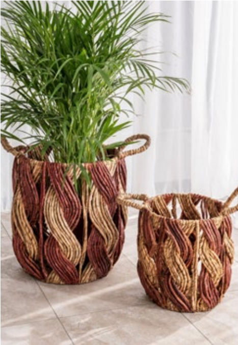
BSK18-T SET OF 2 DOUBLE WAVE BASKETS W: 45/35 H: 46/34 D: 45/35