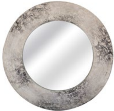
KILN01-L VELODROME MIRROR - LAVA W: 81 H: 81 D: 10