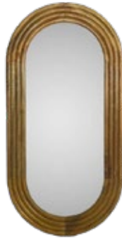
ENG170 ARUBA OVAL MIRROR W: 120 H: 5 D: 60