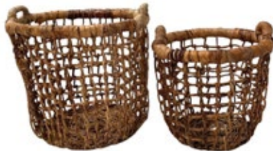
BSK10 SET OF 2 CROFTER BASKETS W: 49/39 H: 46/40 D: 49/39