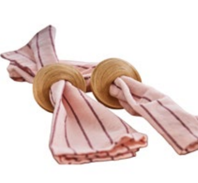
GREE66 SATURN NAPKIN RING W: 7 H: 3 D: 7