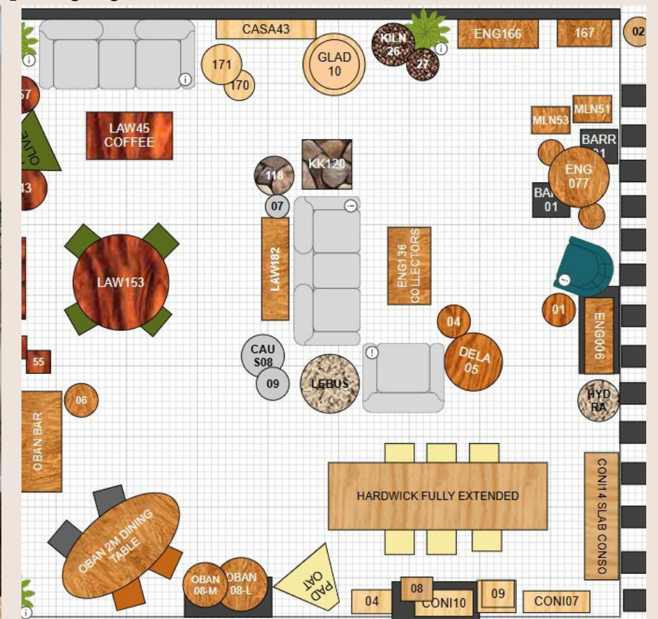
Floorplan for Hunters Ayr