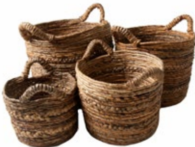
BSK11 SET OF 4 BANANA BASKETS W: 25/30/35/40 H: 20/25/30/35 D: 25/30/35/40