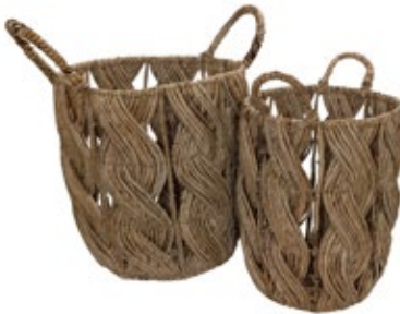
BSK18 SET OF 2 DOUBLE WAVE BASKETS W: 45/35 H: 46/34 D: 45/35