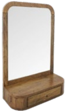
MLN63 MANGO LOUNGE MIRROR SHELF W: 55 H: 85 D: 22