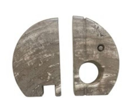
CASA50 ELEPHANT BOOK ENDS W: 21 H: 17 D: 6