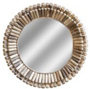
KK104 IONA ROUND MIRROR W: 60 H: 60 D: 7