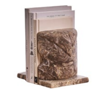
CASA58 SET OF OWL BOOK ENDS W: 13.5 H: 15 D: 6.5 each