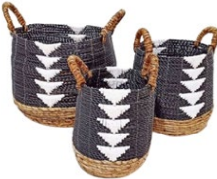
BSK12 SET OF 3 ARROW BASKETS W: 25/35/40 H: 28/34/40 D: 25/35/40