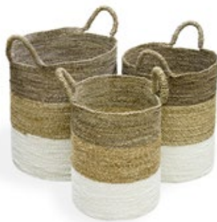
BSK04 SET OF 3 GREY TOP BASKETS W: 39 H: 57 D: 39