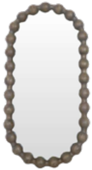
CARO11-GW OVAL MIRROR - GREYWASH W: 60 H: 120 D: 5