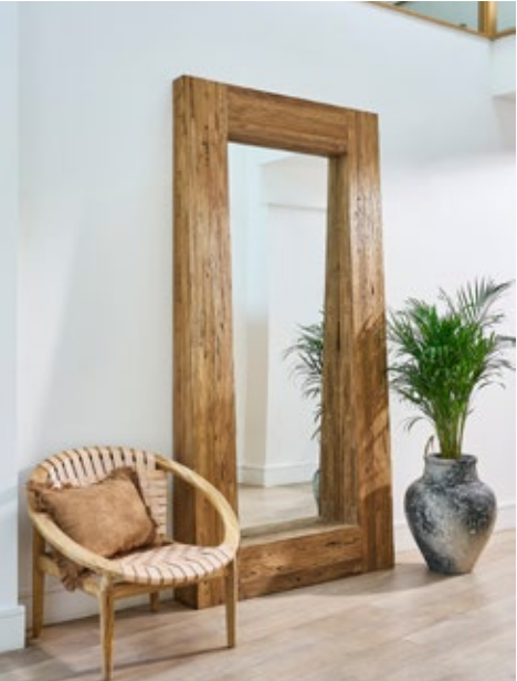
LAW188 RUSTIC MONUMENTAL MIRROR W: 130 H: 250 D: 9/20