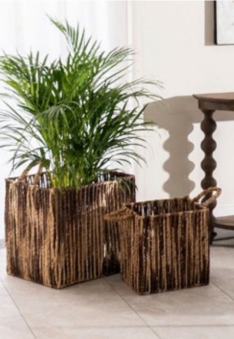
BSK20 SET OF 2 ZEBRA BASKET W: 41/31 H: 45/36 D: 41/31