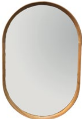
LAW191 GRACE OVAL MIRROR W: 60 H: 90 D: 6