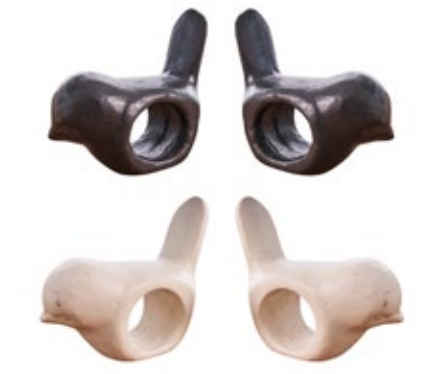
GREE65-B, GREE65-W BIRD NAPKIN RING - BLACK/WHITE W: 10 H: 7 D: 4