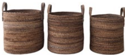
BSK21 SET OF 3 NATURAL BASKETS W: 46/42/38 H: 45/41/37 D: 46/42/38