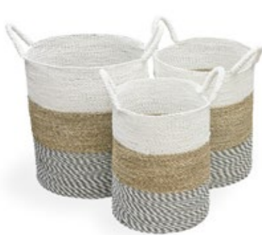
BSK03 SET OF 3 WHITE TOP BASKETS W: 39 H: 57 D: 39