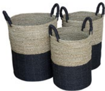
BSK07 SET OF 3 CHARCOAL BASKETS W: 39 H: 57 D: 39