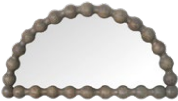
CARO12-GW HALF MOON MIRROR - GREYWASH W: 76 H: 76 D: 5