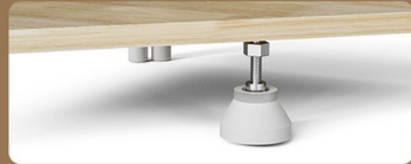
Pied de support renforcé