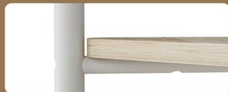
Patins de protection anti-basculement