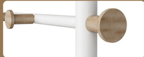
Crochets arrondis et lisses