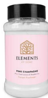
PINK CHAMPAGNE EFCF12 Fizz, Fresh Lemons & Raspberries