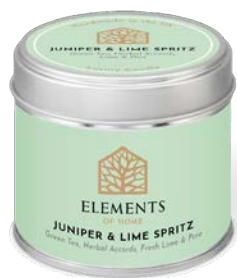
JUNIPER & LIME SPRITZ EFSTC18 Green Tea, Herbal Accords, Lime & Pine