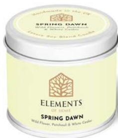
SPRING DAWN EFSTC07 Wild Flowers, Patchouli & White Cedar