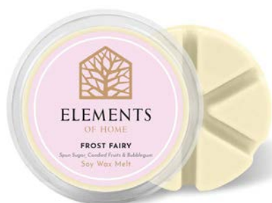
FROST FAIRY EFWX06 Spun Sugar, Candied Fruits & Bubblegum