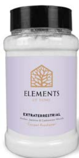
EXTRATERRESTRIAL EFCF01 Amber, Jasmine & Cashmeran Woods

Carpet sprinkles eliminate lingering odours that get trapped in carpets leaving your room smelling fresh and clean. Simply sprinkle on, leave for a few hours, then vacuum off. Contains 500g.