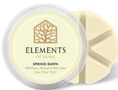
SPRING DAWN EFWX07 Wild Flowers, Patchouli & White Cedar