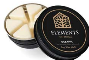
OCEANIC 50G EFPW04