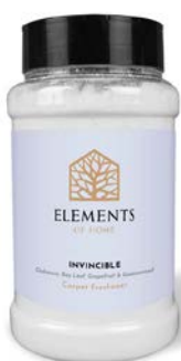
INVINCIBLE EFCF16 Oakmoss, Bay Leaf & Guaiacwood