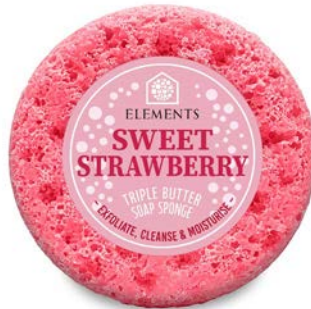
SWEET STRAWBERRY EFSP17 Sweet Ripe Strawberries