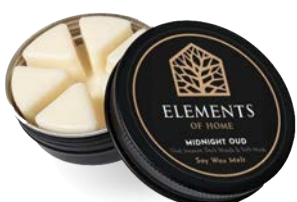
MIDNIGHT OUD 50G EFPW08