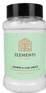
JUNIPER & LIME SPRITZ EFSTC18 Green Tea, Herbal Accords, Lime & Pine