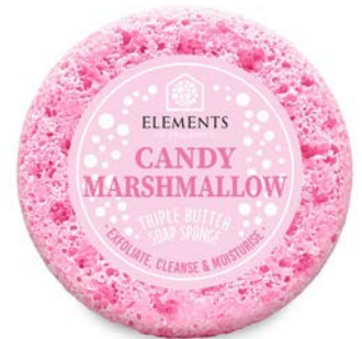
CANDY MARSHMALLOW EFSP76 Vanilla, Marshmallow & Powdered Sugar