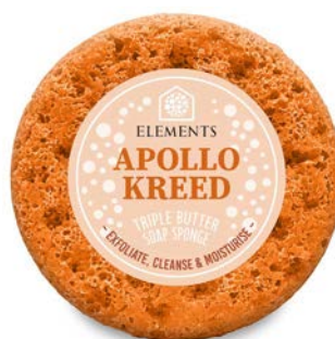
APOLLO EFSP01 Apple, Blackcurrant, Birch & Bergamot