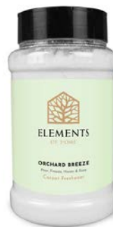
ORCHARD BREEZE EFCF03 Pear, Freesia, Honey & Rose