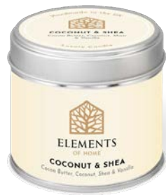
COCONUT & SHEA EFSTC25 Cocoa Butter, Coconut, Shea & Vanilla