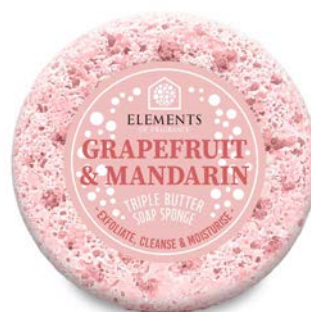
GRAPEFRUIT EFSP71 Juicy Grapefruit & Refreshing Citrus