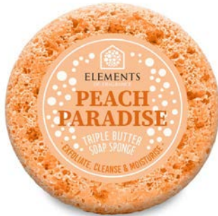
PEACH PARADISE EFSP74 Juicy Peach & Tropical Fruits