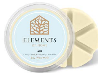
AIR EFWX08 Citrus, Ozone, Eucalyptus, Lily & Pine