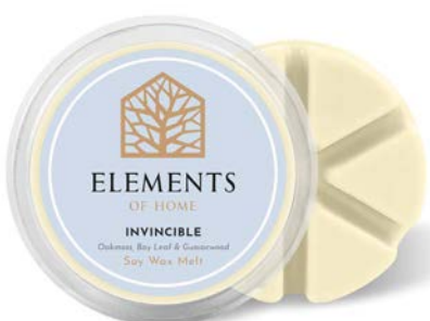
INVINCIBLE EFWX16 Oakmoss, Bay Leaf & Guaiacwood