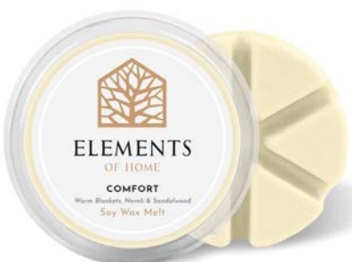
COMFORT EFWX09 Warm Blankets, Neroli & Sandalwood