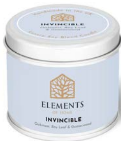
INVINCIBLE EFSTC16 Oakmoss, Bay Leaf & Guaiacwood