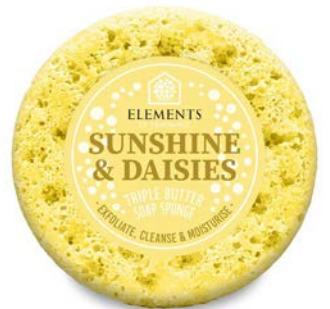
SUNSHINE & DAISIES EFSP68 Violet Leaves, Velvet Rose, Parma Violets & Freesia