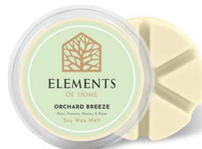
ORCHARD BREEZE EFWX03 Pear, Freesia, Honey & Rose