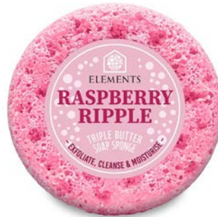
RASPBERRY RIPPLE EFSP13 Fizz, Fresh Raspberries & Lemon.