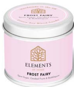
FROST FAIRY EFSTC06 Spun Sugar, Candied Fruits & Bubblegum