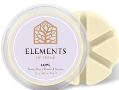
LOVE EFWX10 Peach, Cherry Blossom & Jasmine