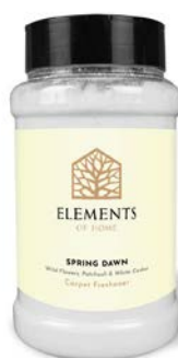
SPRING DAWN EFCF07 Wild Flowers, Patchouli & White Cedar