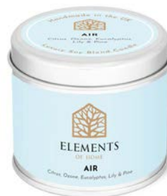
AIR EFSTC08 Citrus, Ozone, Eucalyptus, Lily & Pine