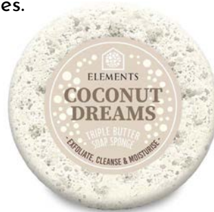
COCONUT DREAMS EFSP07 Smooth & Creamy Coconut