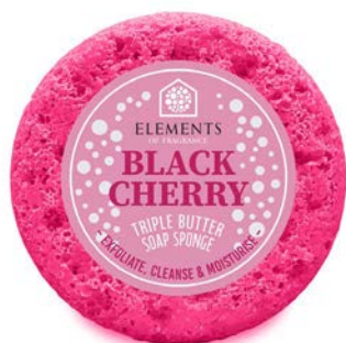
BLACK CHERRY EFSP80 Sweet Cherries, Berries & Vanilla