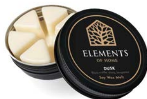
DUSK 50G EFPW03