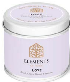
LOVE EFSTC10 Peach, Cherry Blossom & Jasmine