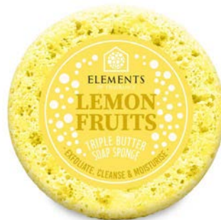
LEMON FRUITS EFSP75 Fresh Lemon & Citrus Fruits