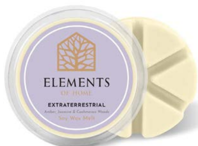
EXTRATERRESTRIAL EFWX01 Amber, Jasmine & Cashmeran Woods

Made with 100% natural soy wax in 12 of our most popular scents, our fast-melting 50g wax melts come in an easy-to-use 6-segment pot. Handmade with love in the UK.