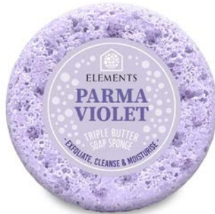
PARMA VIOLET EFSP12 Violet Leaves, Velvet Rose, Parma Violets & Freesia