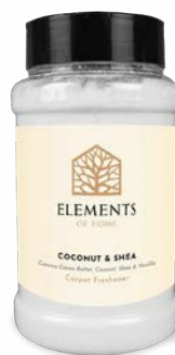
COCONUT & SHEA EFSTC25 Cocoa Butter, Coconut, Shea & Vanilla