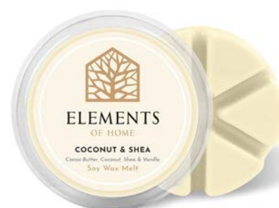
COCONUT & SHEA EFWX25 Cocoa Butter, Coconut, Shea & Vanilla