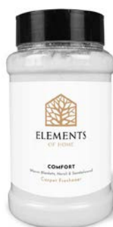
COMFORT EFCF09 Warm Blankets, Neroli & Sandalwood