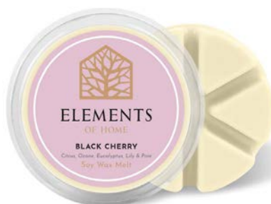
BLACK CHERRY EFWX02 Sweet Cherries, Rum & Vanilla