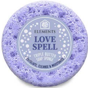
LOVE SPELL EFSP11 Peach, Cherry Blossom & White Jasmine