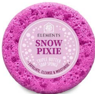
SNOW PIXIE EFSP15 Spun Sugar, & Tutti-Frutti Bubblegum