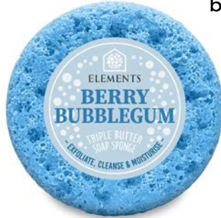
BERRY BUBBLEGUM EFSP06 Fruit Gum, Berries, Peach, Pineapple & Citrus