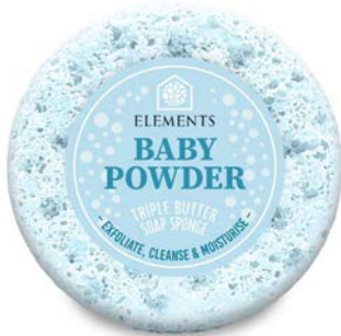
BABY POWDER EFSP02 Sweet Cherries, Rum & Vanilla

Ideal for exfoliating, moisturising, massaging and cleansing all at once. Our 200g triple butter soap sponges are loaded with mango, shea & cocoa butters and are bursting with fragrance & bubbles.