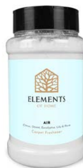
AIR EFCF08 Citrus, Ozone, Eucalyptus, Lily & Pine