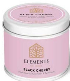
BLACK CHERRY EFSTC02 Sweet Cherries, Rum & Vanilla