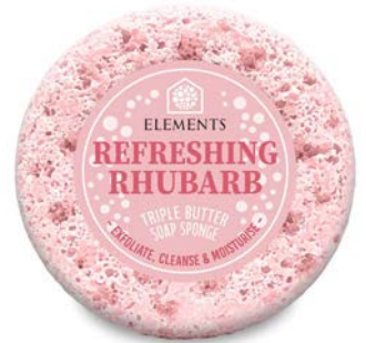
REFRESHING RHUBARB EFSP14 Rhubarb, Pear, Apple, Toffee & Lemon.