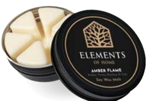
AMBER FLAME 50G EFPW07

Jasmine, Tropical Fruits, Citrus & Vanilla