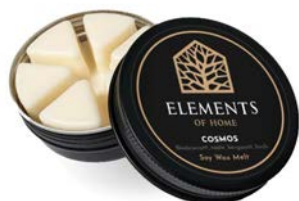
COSMOS 50G EFPW01

Made with 100% natural soy, our fast-melting wax melts come in a giftable black metal tin.