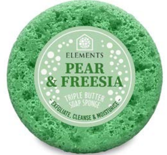
PEAR & FREESIA EFSP10 Quince, Honey, Freesia, Wild Rose & Rhubarb