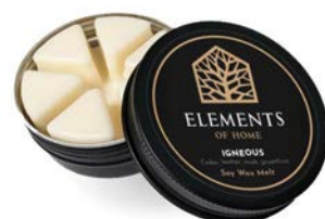
IGNEOUS 50G EFPW05