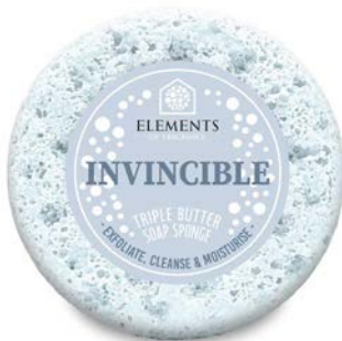
INVINCIBLE EFSP70 Oakmoss, Bay Leaf & Guaiacwood