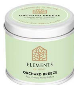
ORCHARD BREEZE EFSTC03 Pear, Freesia, Honey & Rose