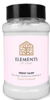
FROST FAIRY EFCF06 Spun Sugar, Candied Fruits & Bubblegum