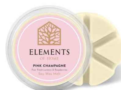
PINK CHAMPAGNE EFWX12 Fizz, Fresh Lemons & Raspberries