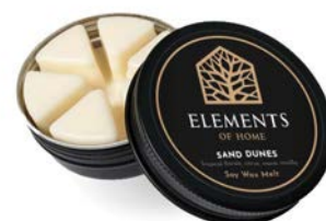
SAND DUNES 50G EFPW06

Jasmine, Tropical Fruits, Citrus & Vanilla