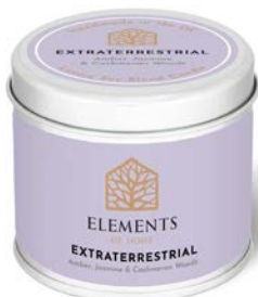
EXTRATERRESTRIAL EFSTC01 Amber, Jasmine & Cashmeran Woods

Our colour collection features twelve delightful pastel shades in our most familiar and popular scents, expertly blended, with something for everyone. This 180g candle is made with a soy blend wax & high quality fragrance oil. Up to 35hrs burn time.