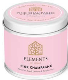
PINK CHAMPAGNE EFSTC12 Fizz, Fresh Lemons & Raspberries