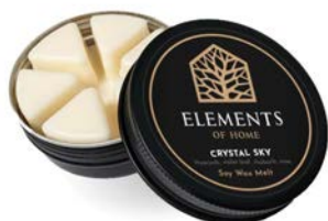
CRYSTAL SKY 50G EFPW02