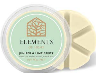
JUNIPER & LIME SPRITZ EFWX18 Green Tea, Herbal Accords, Lime & Pine