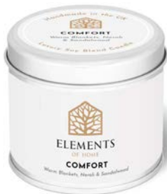
COMFORT EFSTC09 Warm Blankets, Neroli & Sandalwood