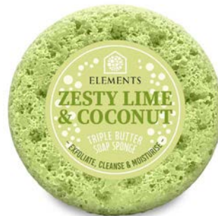
ZESTY LIME & COCONUT EFPO012 Lime, Coconut, Lemon, Orange & Apple