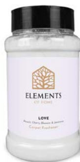
LOVE EFCF10 Peach, Cherry Blossom & Jasmine