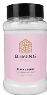
BLACK CHERRY EFCF02 Sweet Cherries, Rum & Vanilla