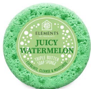
JUICY WATERMELON EFSP77 Refreshing Watermelon, Cucumber, Kiwi & Lime