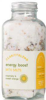
Bath Salts 335g Epsom and Himalayan salts, dried flowers