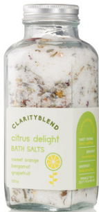
Bath Salts 335g Epsom and Himalayan salts, dried flowers