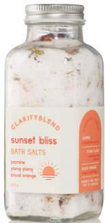
Bath Salts 335g Epsom and Himalayan salts, dried flowers

UPLIFTINGLY FLORAL SENSUAL AWAKENS THE SENSES