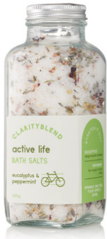
Bath Salts 335g Epsom and Himalayan salts, dried flowers