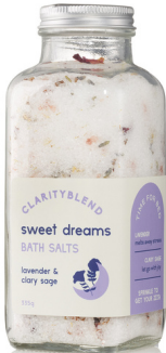
Bath Salts 335g Epsom and Himalayan salts, dried flowers