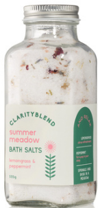
Bath Salts 335g Epsom and Himalayan salts, dried flowers