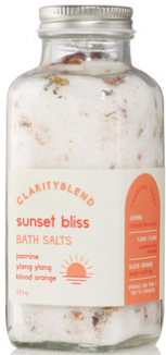
Bath Salts 335g Epsom and Himalayan salts, dried flowers