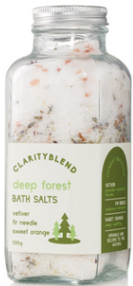
Bath Salts 335g Epsom and Himalayan salts, dried flowers