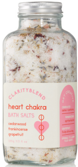
Bath Salts 335g Epsom and Himalayan salts, dried flowers