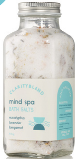
Bath Salts 335g Epsom and Himalayan salts, dried flowers