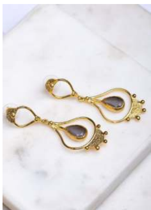
OTMPEE16 £15 Mauve purple eccentric eye earrings