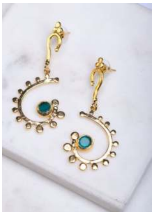
OTJGGS11 £15 Jade green groovy swirl earrings