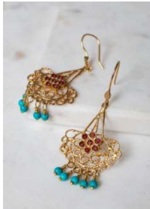
KABURD10 £24 Turquoise and coral moon tassel earrings