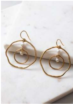
AZPE7 £15 Hammered gold with mother of pearl