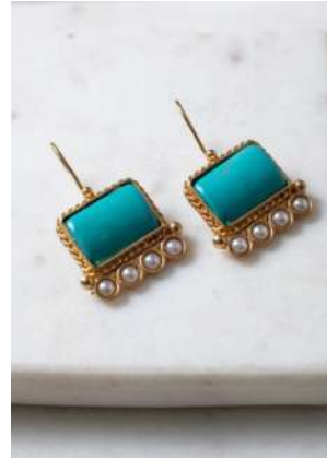
AZBU2 £15 Turquoise and pearl rectangle earrings