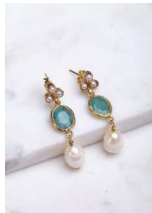
MUGPE14 £22 Emerald and Pearl earrings