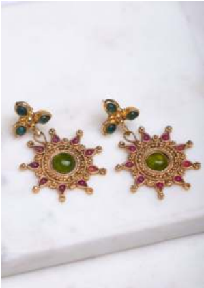
MUPGSTIO £18 Pink and green starburst earrings