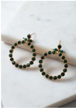
KAGN5 £22 Emerald hoop earrings