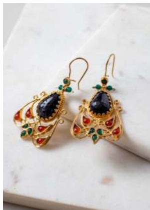
KABKOR2 £16 Onyx and carnelian beetle earrings