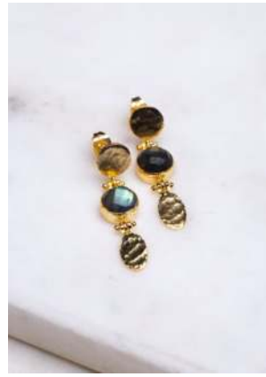
SELTD5 £18 Labradorite and gold triple drop earrings