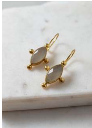
TOBK2 £21 Moonstone tear earrings