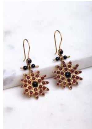
MUOCSOL3 £18 Onyx and Coral solstice earrings