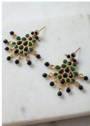
KAGN6 £22 Black Onyx and Emerald star earrings