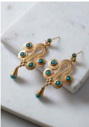
AZBU4 £22 Turquoise Ottoman earrings