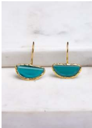
OTJGM1 £7.50 Jade green half moon earrings