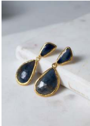
GABU2 £20 Blue sapphire double drop earrings