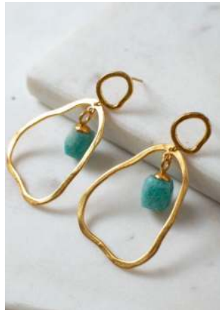
AZBU8 £15 Blue beaded pear earrings