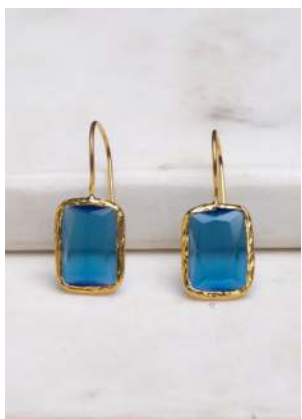
OTMBSR10 £7.50 Mid blue rectangle earrings