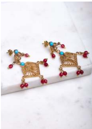
MUTctt6 £16 Turquoise and Coral triple tier earrings