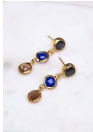
OTMBPTD20 £13 Mauve, blue, pink triple earrings