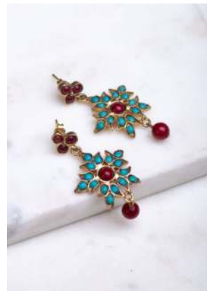
MUTCFL5 £22 Turquoise and Coral flower earrings