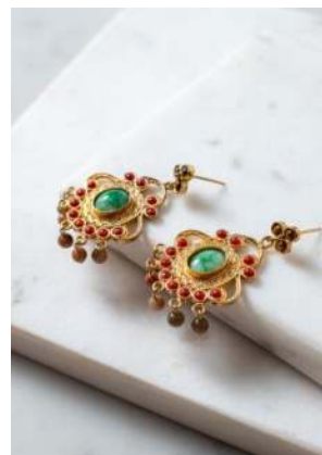
KABR8 £16 Emerald and tigers eye beaded earrings