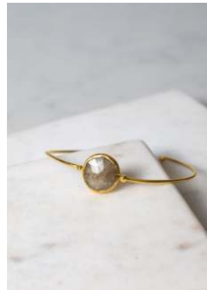
GAGY7 £14 Grey single stone sapphire bangle