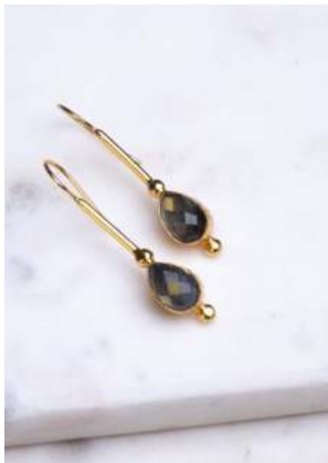
SELD10 £19 Labradorite drop earrings