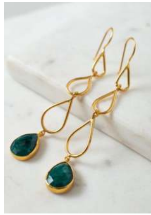
HEGN9 £24 Emerald diamond tier earrings