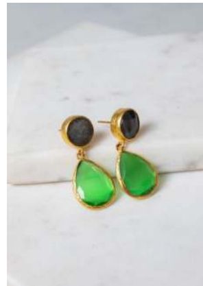
TOGYGN3 £16 Labradorite and tigers eye drop earrings