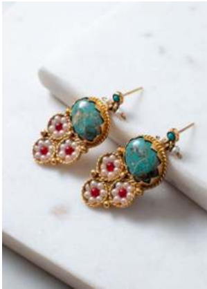
AZBUPE1 £24 Turquoise and mother of pearl statement earrings