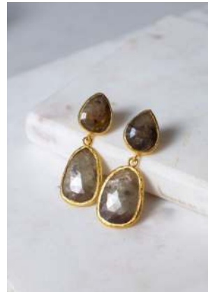
GAGY3 £20 Grey sapphire double drop earrings