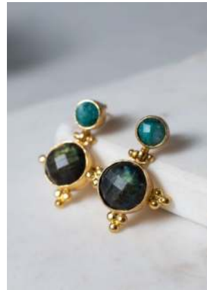
TOBK2 £21 Emerald and labradorite cross earrings