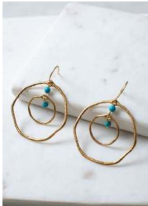
AZBU6 £15 Turquoise double pivot earrings