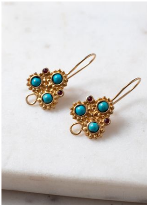
AZBU12 £14 Small triple turquoise earrings