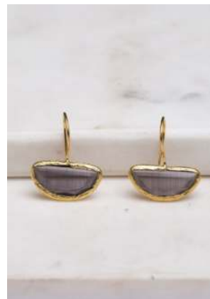
OTMPM4 £7.50 Mauve purple half moon earrings