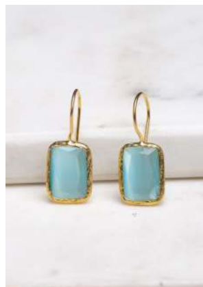
OTSBSR9 £7.50 Sky blue rectangle earrings