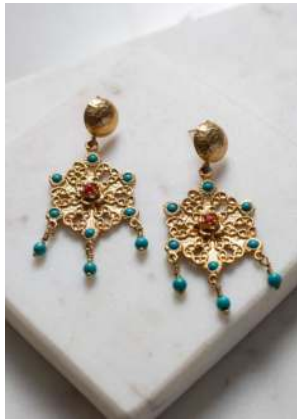
KABU3 £24 Turquoise and coral solstice earrings