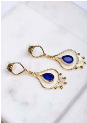
OTRBEE15 £15 Royal blue eccentric eye earrings