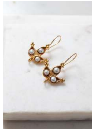
AZPE11 £14 Small mother of pearl triple earrings