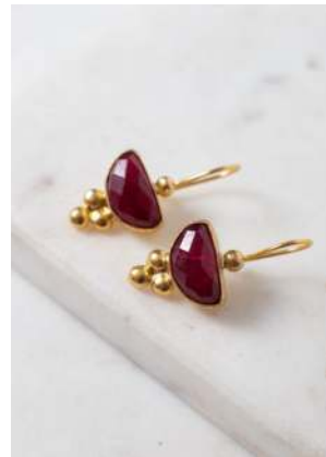
TORD10 £21 Garnet half moon earrings