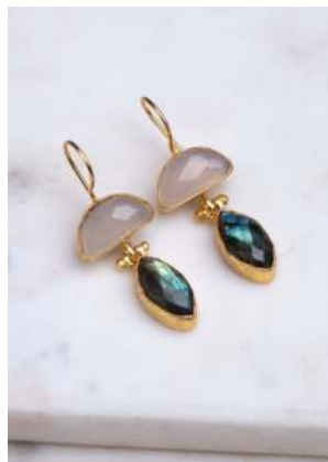
SEMLDE11 £21 Moonstone and Labradorite drop earrings