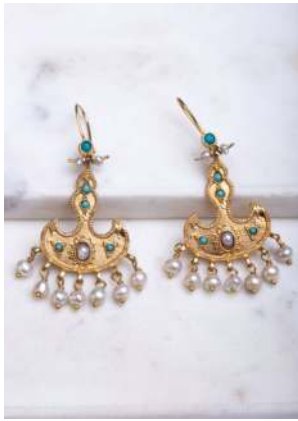
MUTPCH7 £16 Turquoise and Pearl chance earrings