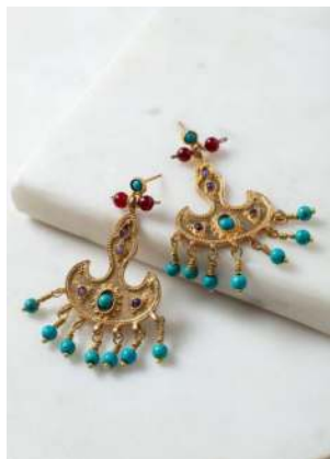
KABU15 £16 Turquoise and coral chance beaded earrings.