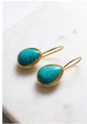
AZBU9 £10 Simple turquoise earrings