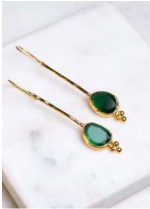
TOGY9 £16 Emerald stem earrings