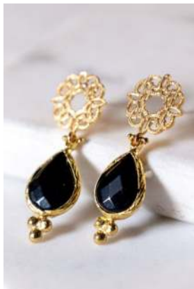
TOBK2 £16 Black onyx wreath earrings