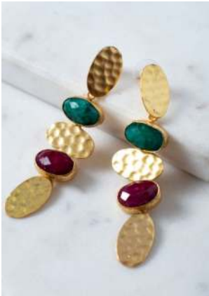
HEGNRD11 £24 Emerald and garnet tier earrings