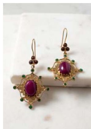
KAPU11 £16 Malachite and Agate charm earrings