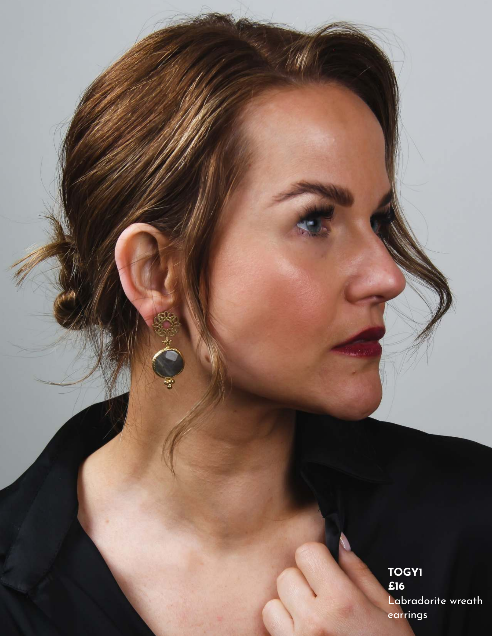
TOGYI £16 Labradorite wreath earrings