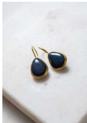
HEBU18 £10 Simple lapis earrings