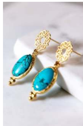
AZBU1 £16 Turquoise wreath earrings