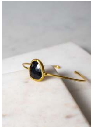
GABU9 £14 Blue single stone sapphire bangle