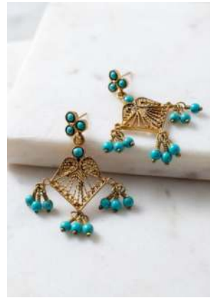
KABU16 £16 Turquoise triple tier earrings