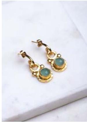
SEAMCE1 £18 Aqua Marine gold ring earrings