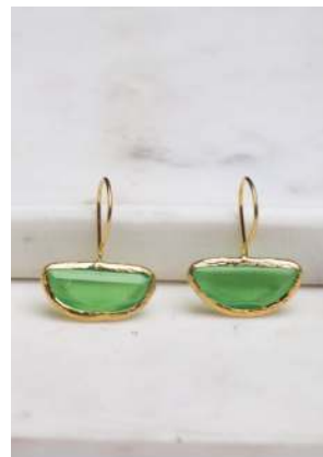
OTLGM3 £7.50 Lime green half moon earrings