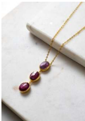
GARD17 £17 Ruby triple stone neckalce