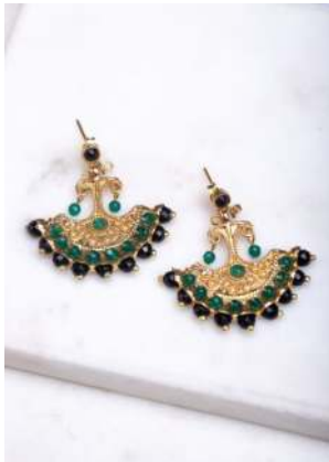
MUEM4 £16 Emerald moon earrings