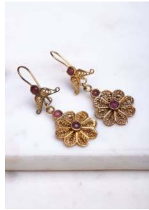
MUPE13 £18 Pink flower earrings