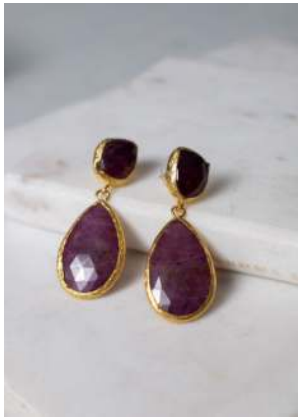
GARE1 £20 Red sapphire double drop earrings