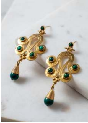
HEGN12 £22 Emerald Ottoman earrings