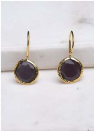
OTMPSB6 £7.50 Mauve purple button earrings