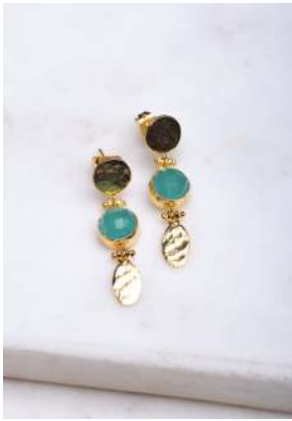
SEAMTD4 £18 Aqua Marine and gold triple drop earrings