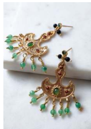
KAGN14 £16 Jade chance beaded earrings