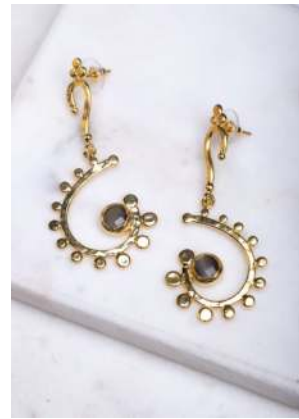
OTMPGS12 £15 Mauve Purple groovy swirl earrings