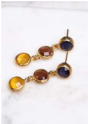
OTMBRYTD22 £13 Mauve, brown, yellow triple earrings