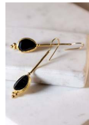
TOBK8 £16 Onyx Black stem earrings