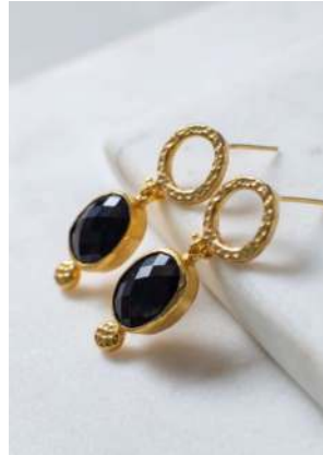
TOBK7 £16 Onyx ring drop earrings