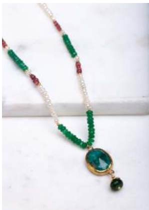
MUGPNK13 £38 Emerald and Pearl necklace