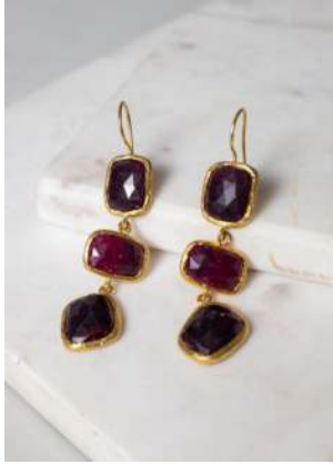
GARD6 £24 Red sapphire triple drop earrings