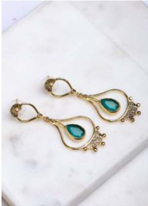
OTJGEE14 £15 Jade green eccentric eye earrings