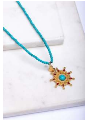
MUTPNK11 £25 Turquoise and coral starburst necklace