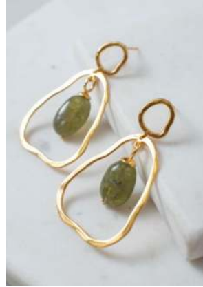
HEGN2 £15 Jade beaded pear earrings