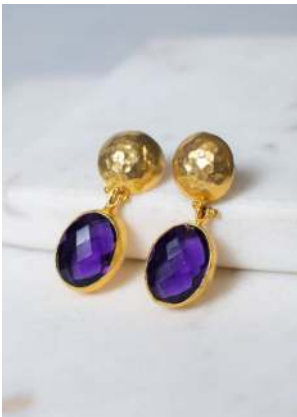
TOPU5 £16 Amethyst drop earrings