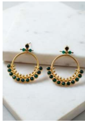
KAGN4 £22 Black Onyx and Emerald half hoop earrings