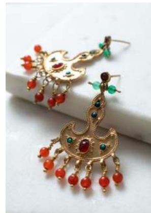
KAOR13 £16 Carnelian chance beaded earrings