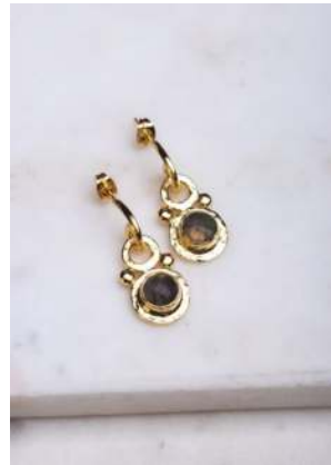
SELCE3 £18 Labradorite gold circle earrings