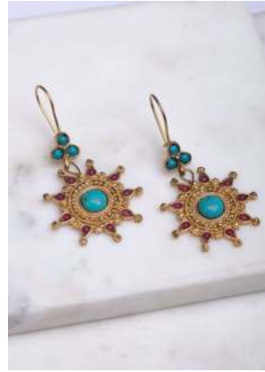
MUTCSTR2 £18 Turquoise and coral starburst earrings