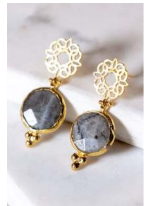
TOGY1 £16 Labradorite wreath earrings