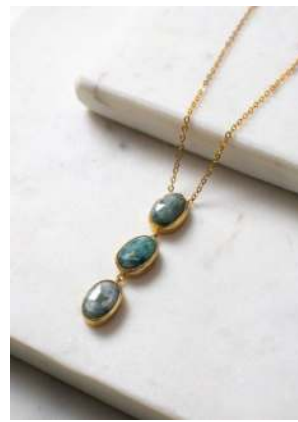
GAGN21 £17 Emerald triple stone necklace