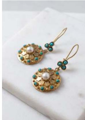
AZBU14 £24 Turquoise and mother of pearl ornate earrings