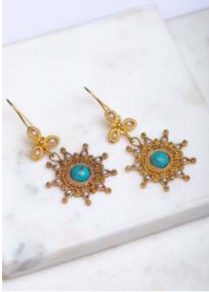
MUTPSTRI £18 Turquoise and Pearl starburst earrings