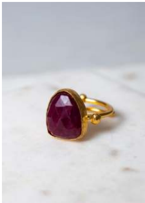
GARD15 £12 Red sapphire ring