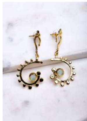
OTSBGS13 £15 Sky blue groovy swirl earrings