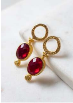
TORD4 £16 Garnet ring drop earrings