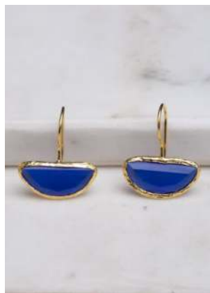
OTRBM2 £7.50 Royal blue half moon earrings