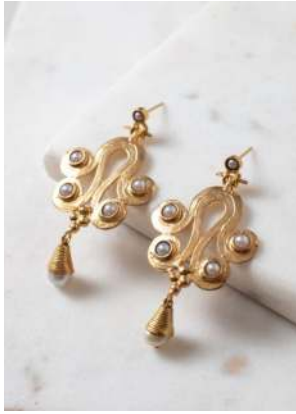
AZPE3 £22 Pearl ottoman earrings